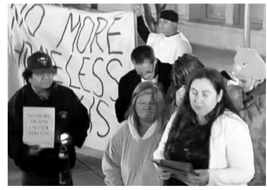
Sacramento Homeless Union memorial for all who died unhoused in 2023.