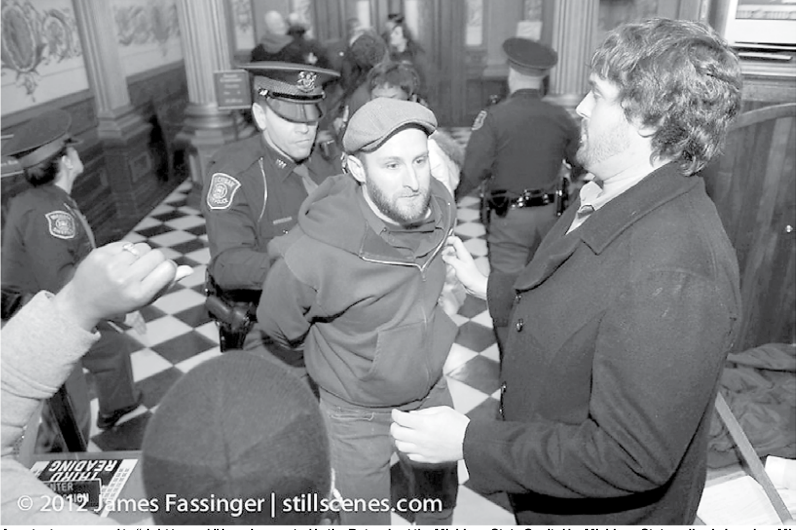
A protestor opposed to "right to work" laws is arrested in the Rotunda at the Michigan State Capitol by Michigan State police in Lansing, MI.