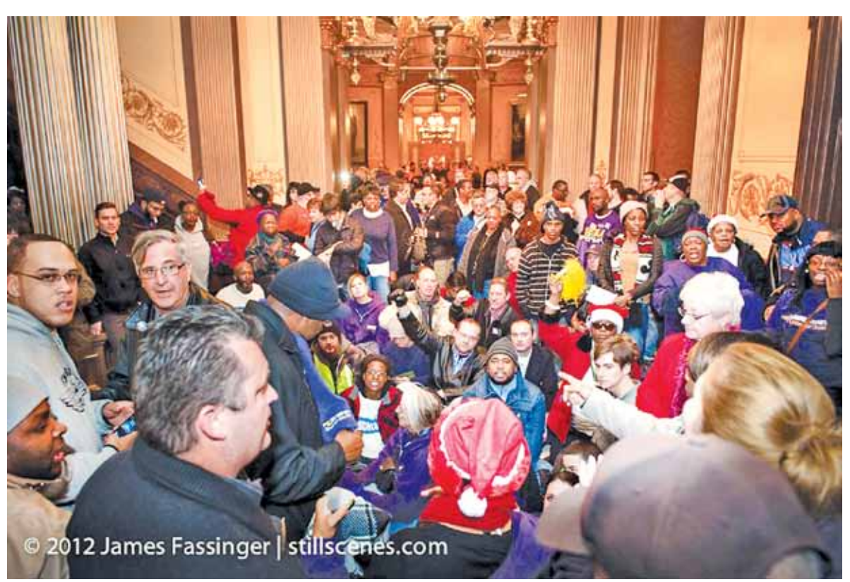
Protest against anti-union right-to-work legislation in MIchigan.