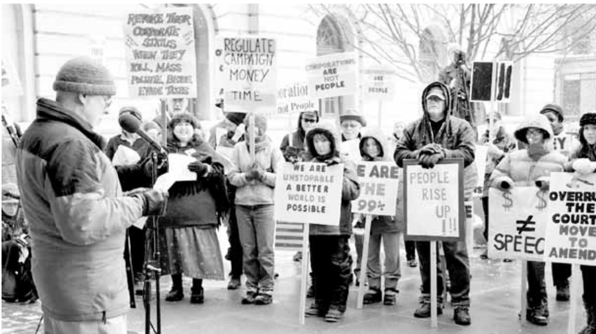
Move to Amend the Constitution protest in Spokane, WA.

Our mechanism is to create local affiliates across the country that will work on resolutions first at the local, then moving up to the county, state, and federal level. We'll be engaging in political work that will ultimately require that people run for political office on this analytical