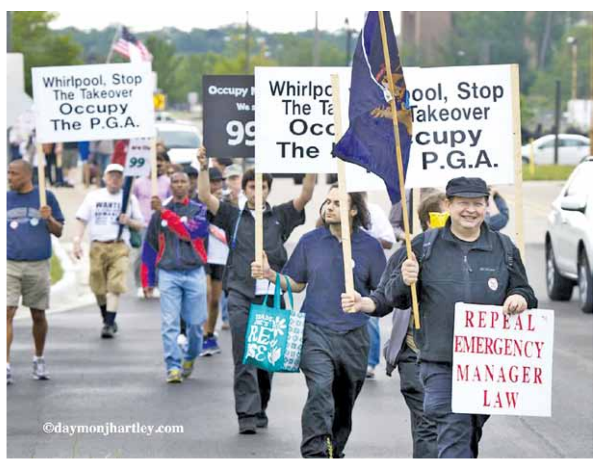
Protest against the Professional Golfers' Association (PGA) and Whirlpool Corporation's takeover of prime lakefront property in Benton Harbor, MI.

Benton Harbor should return to the power of democratic selfrule, just as free people the world over experience government. Benton Harbor has had enough of a government imposed grossly incompetent dictator.