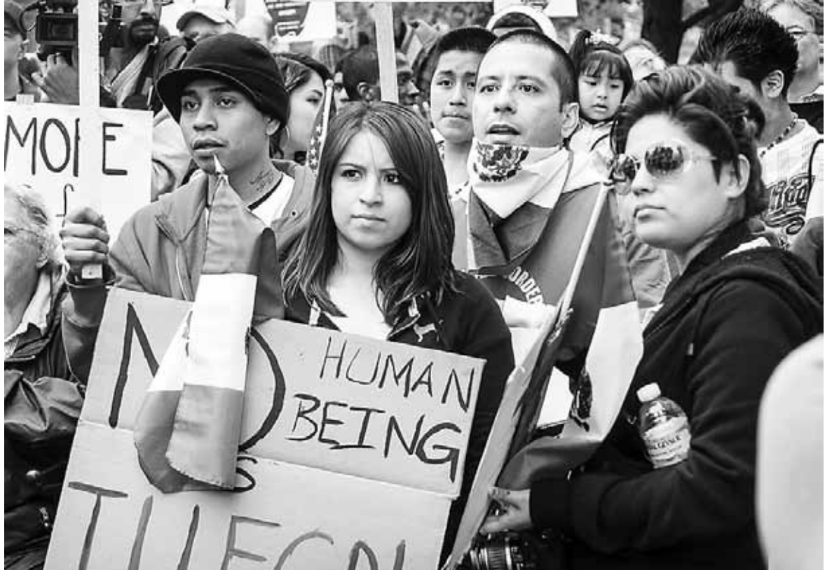
Young people and educators join 2012 May Day rally in Chicago.

The Tribuno del Pueblo couldn't agree more.