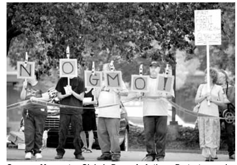
Occupy Monsanto Global Day of Action. Protesters raise awareness about lab-created genetically modified organisms.