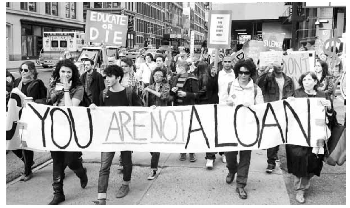
People protest in Chicago aginst the growing personal debt owed to the corporations.

Now it becomes clear why we are constantly barraged with the idea that we should reduce taxes for "Big Government" - i.e.,