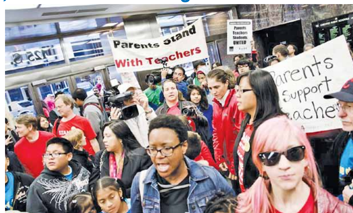
Parents and students supporting Chicago Teachers Union strike.

KL : Teachers have been blamed for EVERYTHING that ails this system. But parents know the truth. 79% of parents ACROSS the country, including Chicago trust their teachers. But blaming.