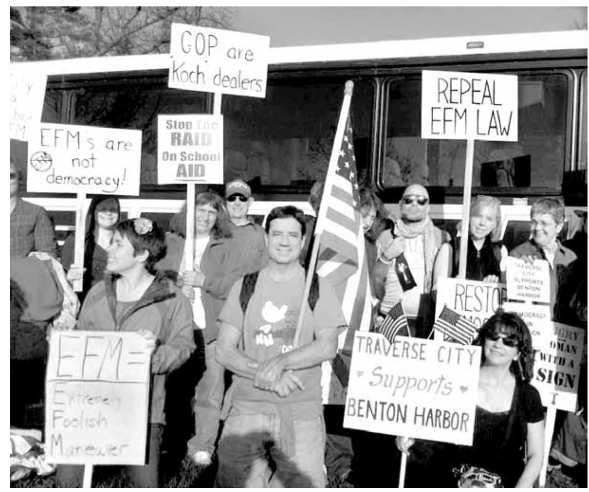
The photos on this page show what the fight for Democracy looks like in Michigan! Traverse City activists organized a grassroots campaign to overturn the dictator law. They stand in support of Benton Harbor, one of the first cities to experience the wrath of an Emergency Manager.