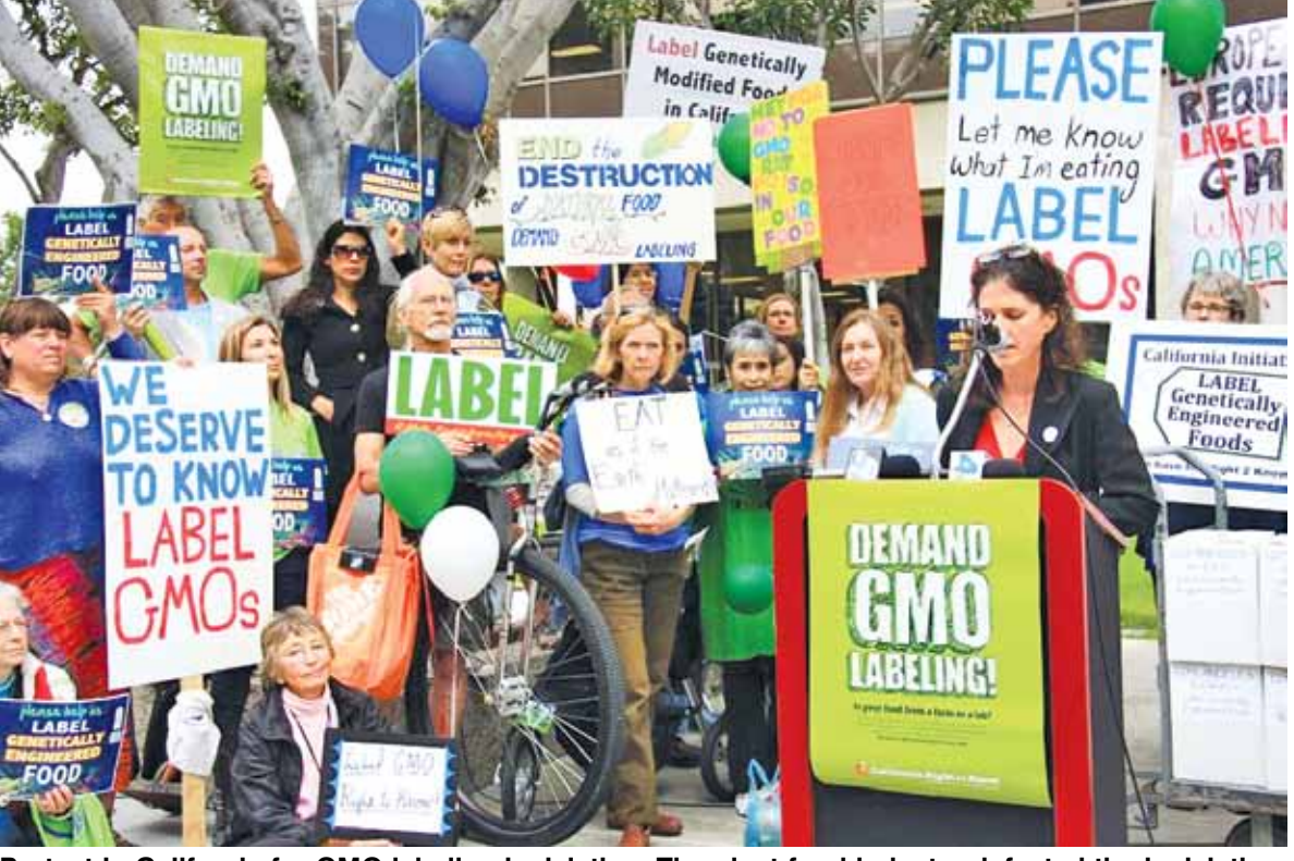
Protest in California for GMO labeling legislation. The giant food industry defeated the legislation.

They were able to do this because, in a number of rulings culminating in the 2010 decision known as "Citizens United," the