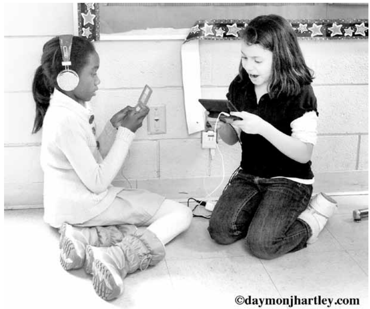
Hand-held devices enhance learning in Michigan classrooms.