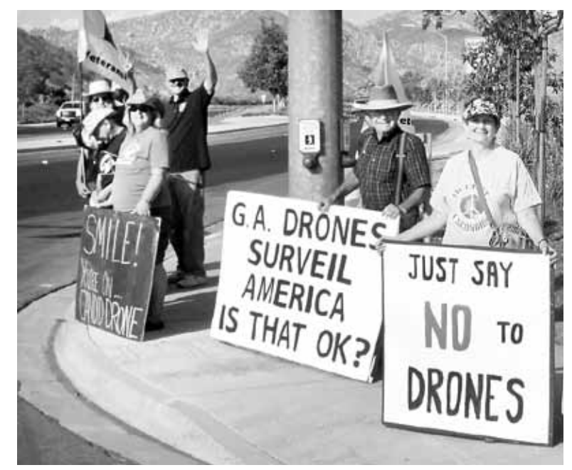
Veterans For Peace protest at General Atomics plant in Poway California, where Predator drones are manufactured.

We can all participate in making this happen by calling our representatives in Congress and demanding legislation that protects American liberties and the lives of so many innocents overseas. Join the movement by coming to San Diego April 4-7, where we kick off the No Drone Month of April, a now international effort to curtail and control the use of drone technology.