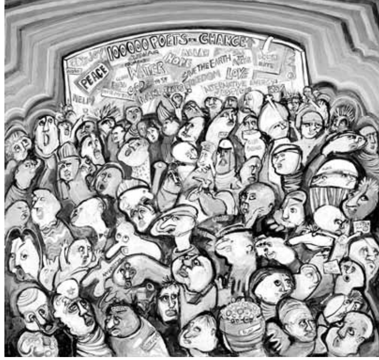
100 Thousand Poets for Change poster.

In India, as people rise up against their country's rape culture, the poets of Mumbai held a 100 Thousand Poets for Change