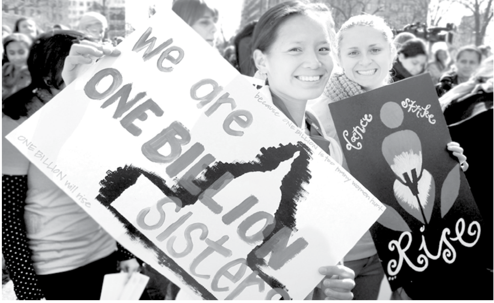
Valentines Day ONE BILLION RISING Dance Party Rally in Washington DC.