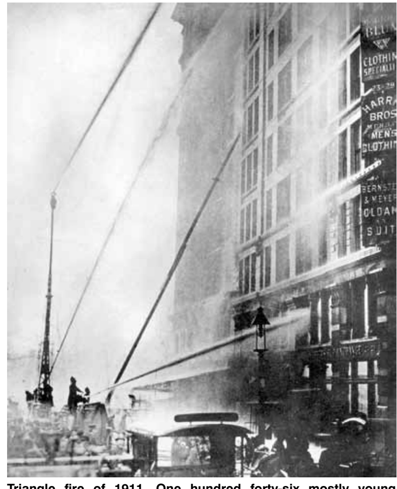
Triangle fire of 1911. One hundred forty-six mostly young immigrant women workers perished in the New York fire.

ion designers, students, and members of the public to submit design proposals for what is hoped will be a "destination" piece of public art that can inspire visitors to contemplate a future when America will again become a more equitable society. The Coalition is seeking entries that abstractly or representationally honor workers, labor unionists, health and safety advocates, immigrants and women, reminding viewers that activism moves society forward, and that people are more important than profits. New York University, owner of the Brown (Asch) Building, has agreed to install the selected design on the exterior of the actual building in which the fire occurred. A jury of distinguished professionals will review all submissions in a two-phase process. The winning artistic rendering will memorialize the event and its victims, and educate as well as speak to what citizens can accomplish when they band together in common cause. See www. rememberthetrianglefire.org for more information about the Triangle fire and the memorial design open competition.