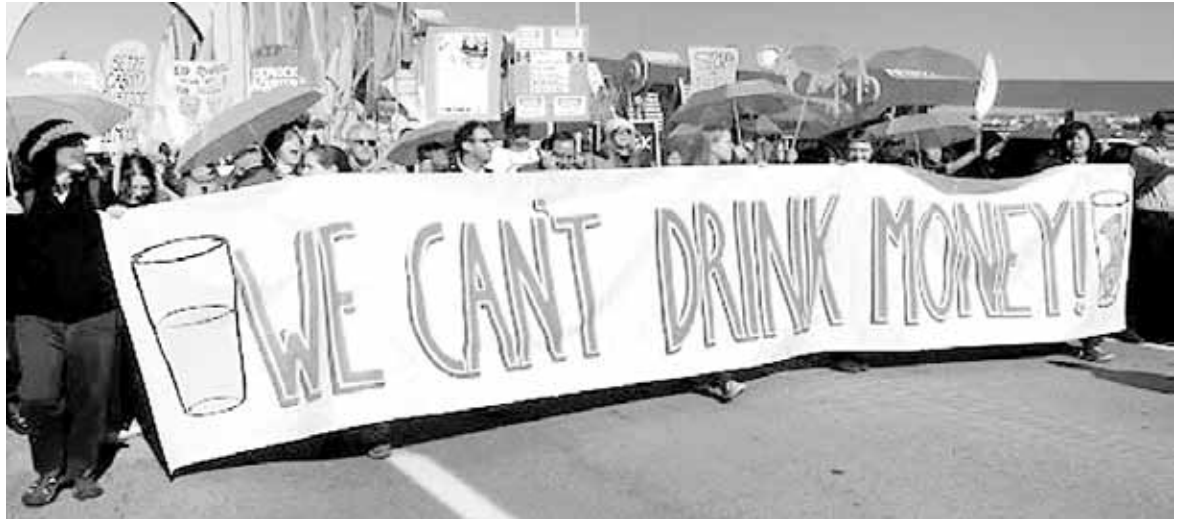
There are claims that there have been more than 1,000 cases of groundwater contamination in the US because of fracking.

Contact Tabitha Tripp at saveourwater@dontfractureillinois.net