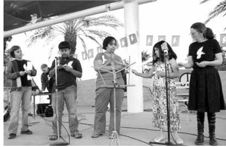
School children ring a bell for each name they read of those killed at Newtown, CT and in the Coachella Valley in 2012.

Finally, with candles aglow, all the people sang togeth-