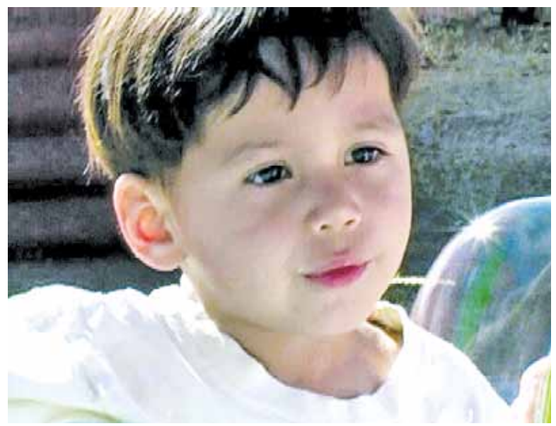
A homeless child in a preschool program.