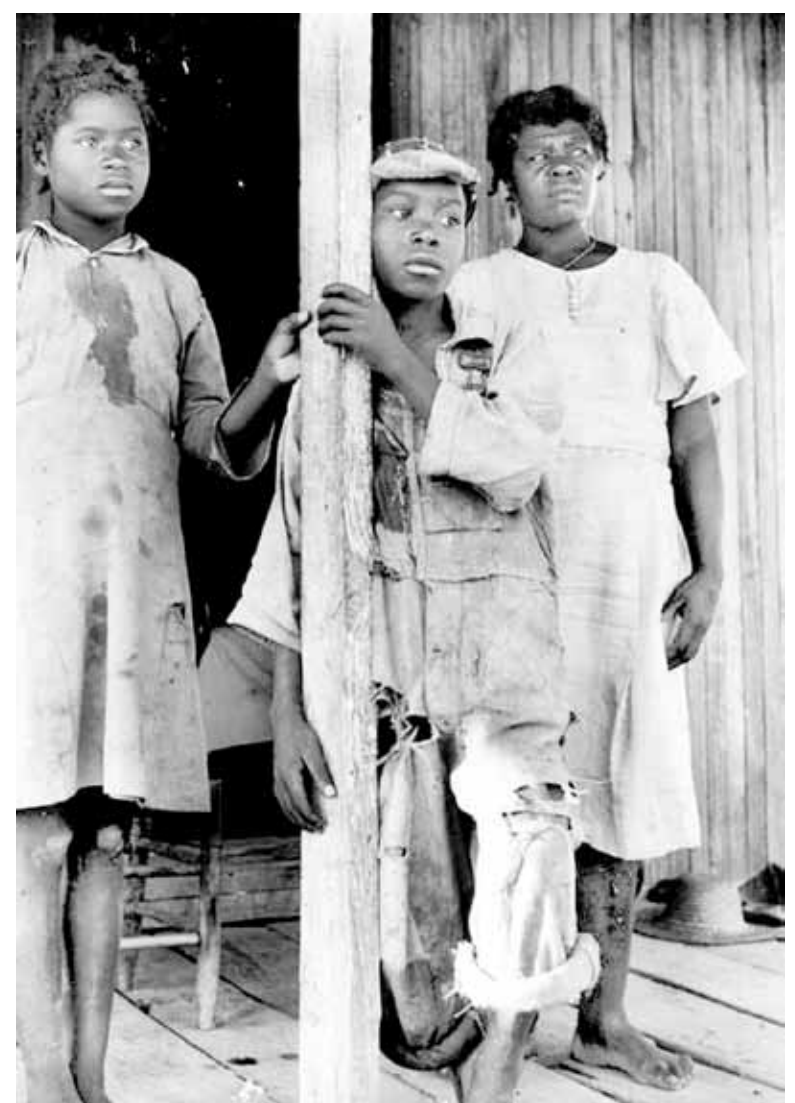
Part of a Black tenant family on a farm in the South, May 1941.