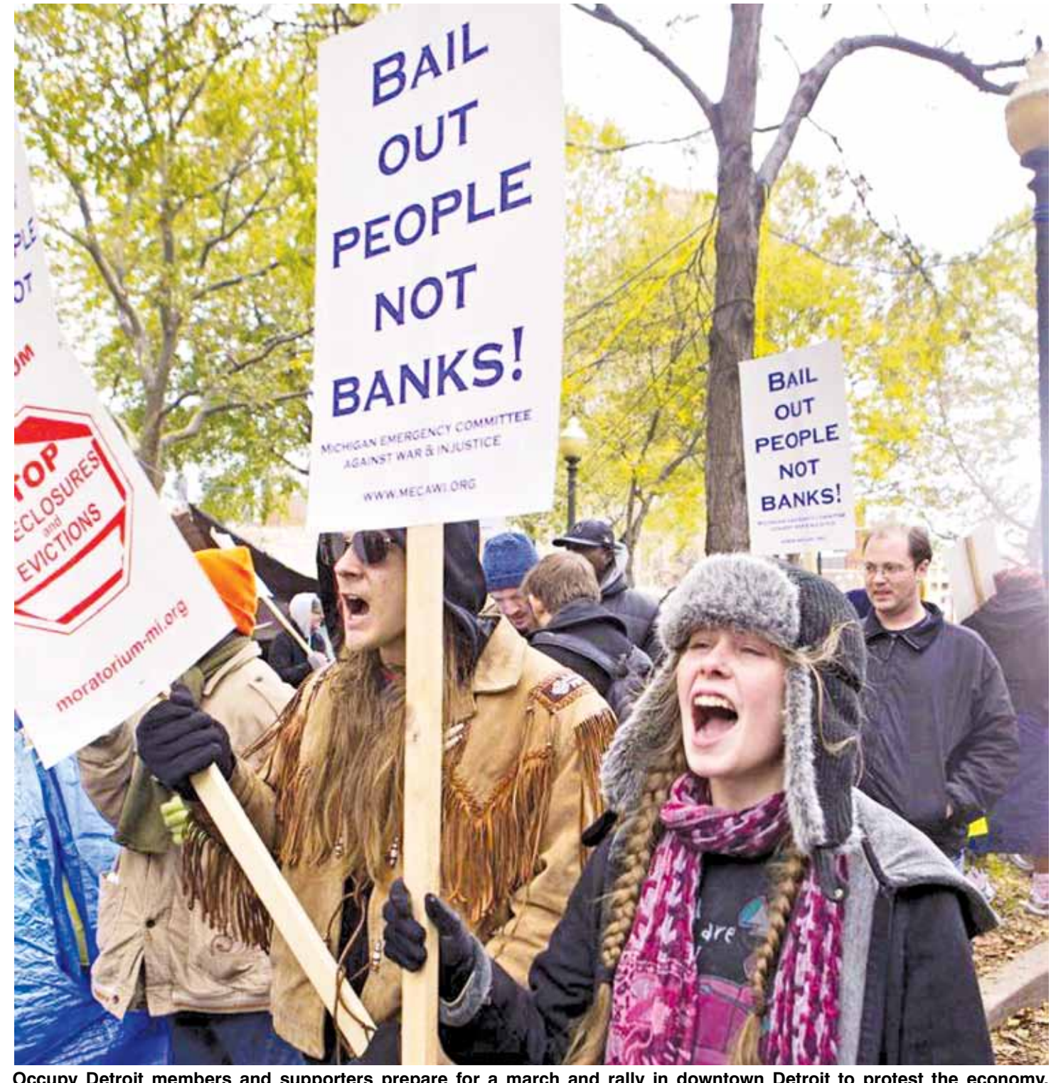
Occupy Detroit members and supporters prepare for a march and rally in downtown Detroit to protest the economy, unemployment and dictatorial Emergency Manager laws in the state of Michigan.