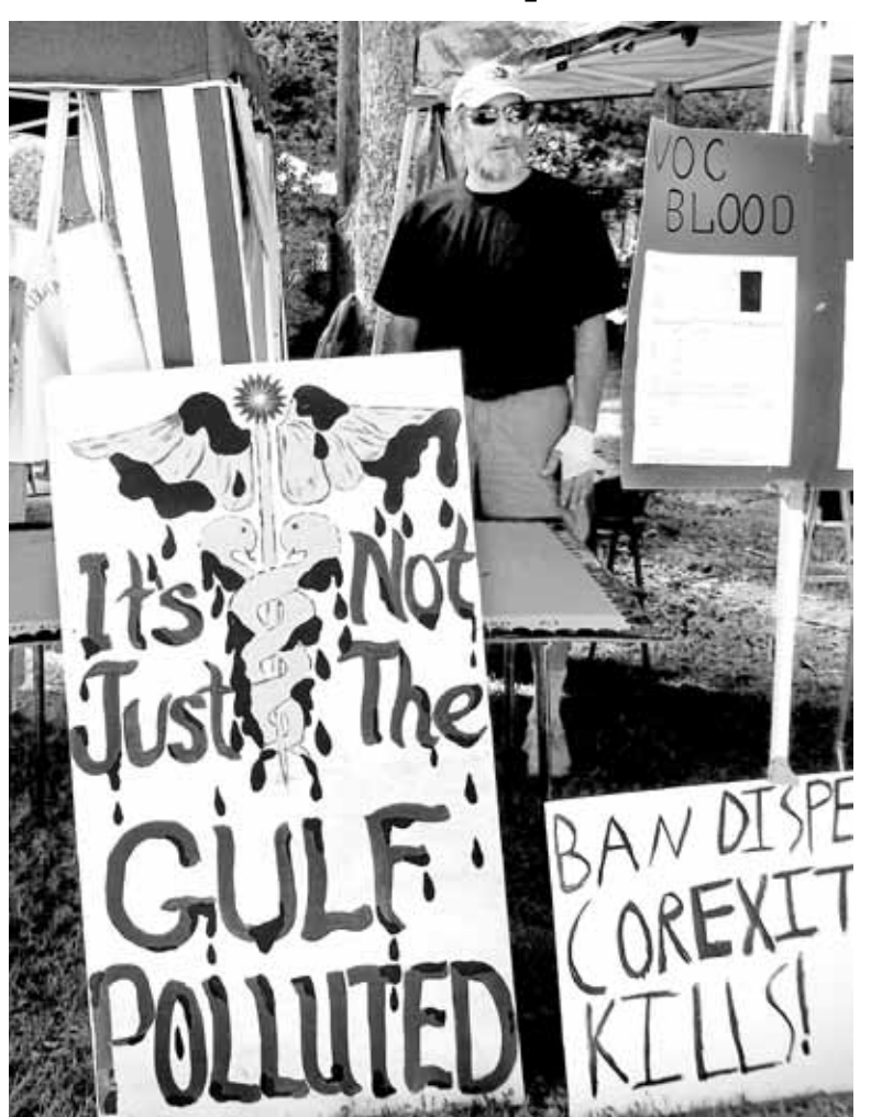
Alabama Coast United Earth Day Mobile Bay Festival.