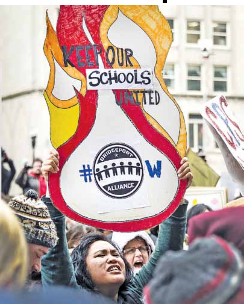
Thousands of parents, students, teachers, public school employees and community members rally against proposed closing of 54 public schools in Chicago.