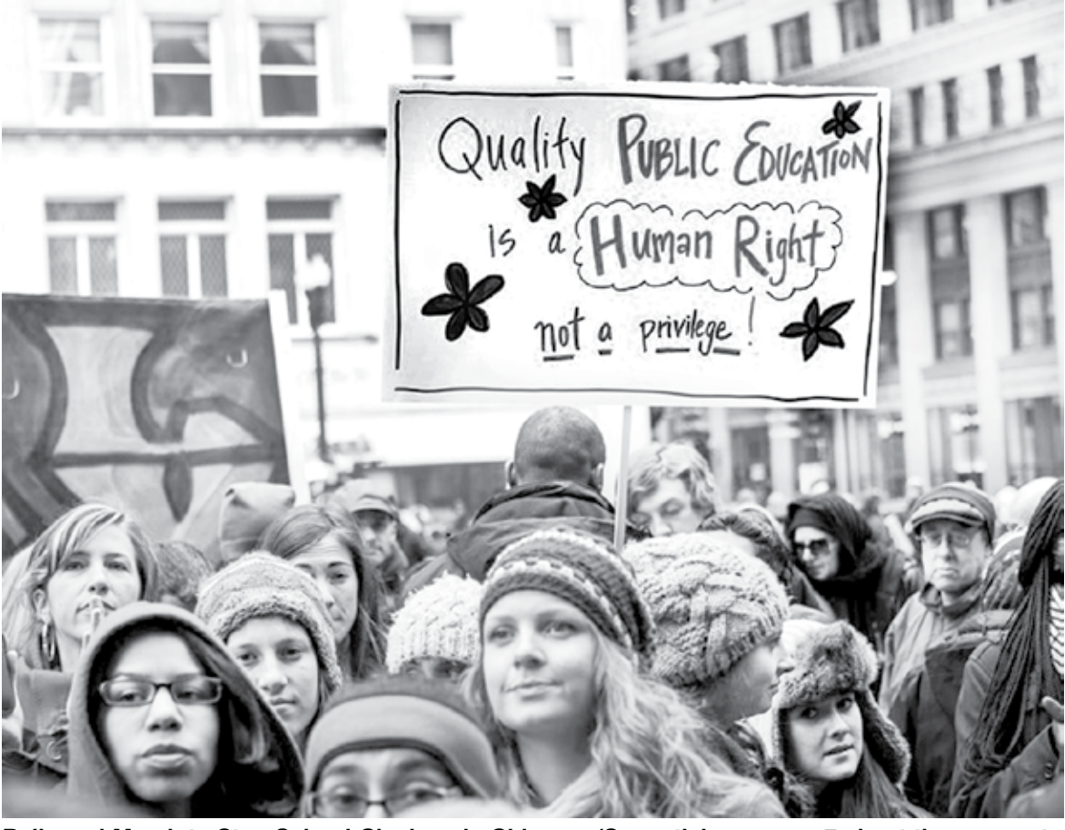
Rally and March to Stop School Closings in Chicago. (See article on page 7 about the corporate takeover of education.)

The resistance of the people to such banditry must be crushed by the corporations. So we see the privatization of our schools and parks matched by the privatization of a police force to protect them and privatization of prisons