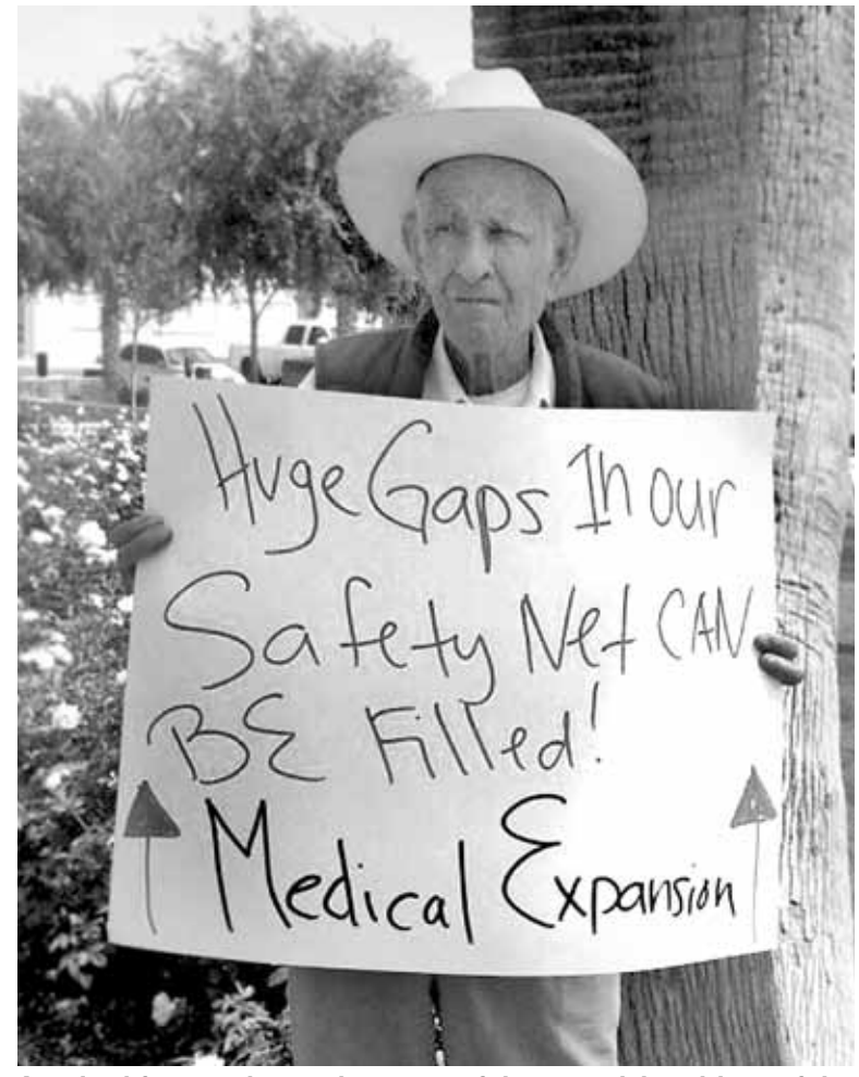
A retired farmworker and veteran of the organizing drives of the 1970's carries on the struggle for economic and social justice in America.

At the April 11 Coachella Press Conference, Clinicas de Salud de Pueblo, El Sol Promotores, Lideres Campesinos, Pueblo Unido, United Domestic Workers, and Coachella Senior Center and others called for the State of California to start now with the medical expansion included in the Affordable Care Act.