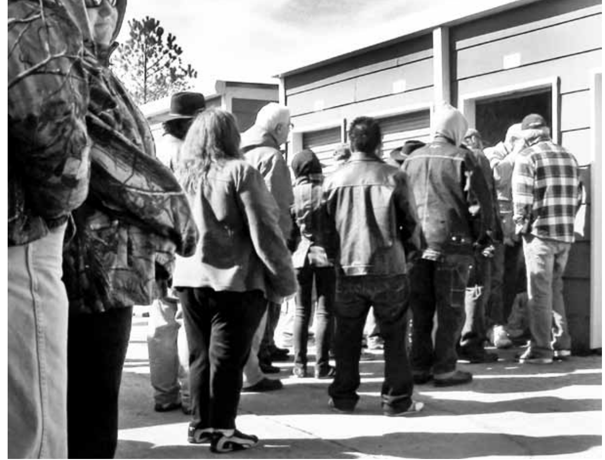
Participants at an auction stand in line to see the storage unit being auctioned.

Lupe shared her agonizing story of falling behind on the storage rent because their motel