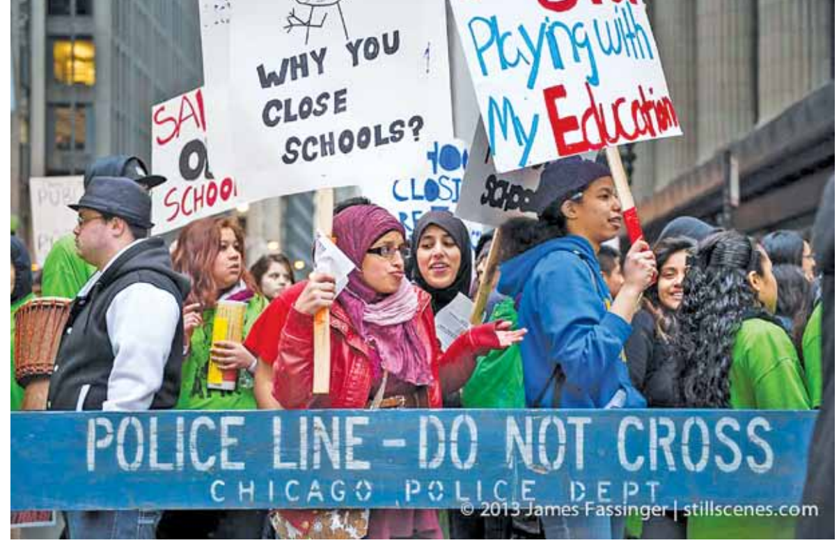
Chicago students against school closing and the misuse of standardized testing.

Meanwhile, mainstream media finally noticed what Substance News had reported in June, 2009. One of the largest charter