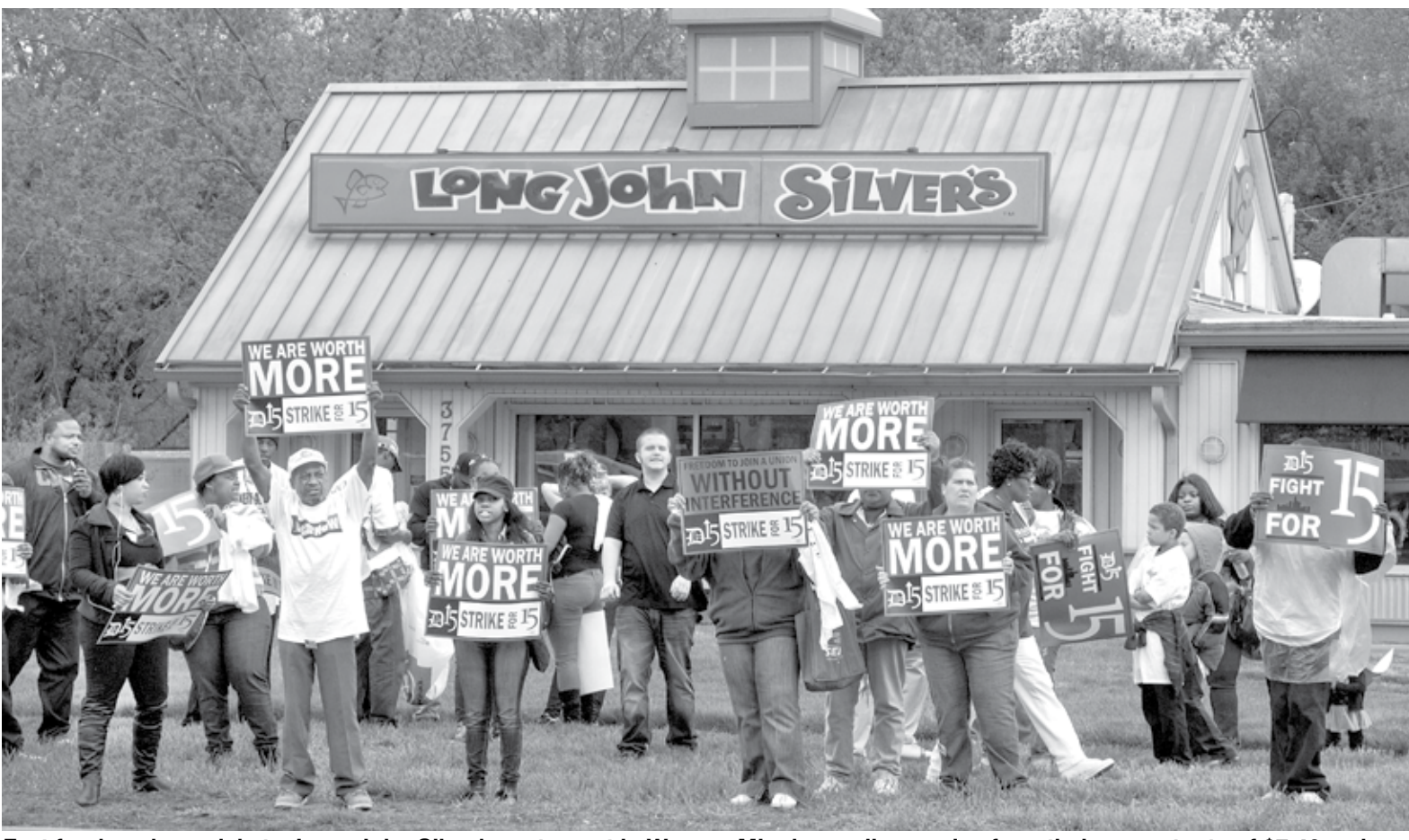
Fast food workers picket a Long John Silver's restaurant in Warren, MI., demanding a raise from their current rate of $7.40 an hour. It was part of a one-day strike against Detroit-area fast food restaurants which calls for a $15 wage and the right to form a union without management interference.

working conditions are not the result of evil bosses, but are the outcomes of an economy that institutionalizes greed: the basic unbendable law of capitalism is the maximization of profits above all else. To cut costs and increase profits, corporations introduce advanced technologies into workplaces in every sector of the economy, including fast food and retail. Since workers cannot compete with the productivity of the newest technologies, which operate at a fraction of the cost of human labor, wages are driven down and people are pushed out of the workforce permanently. The capitalist system has no need for these people. Workers' rights and human rights will continue to be destroyed until the system