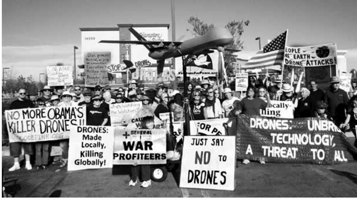
Veterans for Peace in San Diego, CA protest the use of drones nationally and internationally.

We are continuing to build a network of supportive educators to incorporate the program into their courses to maximize student participation and ensure its developmental longevity. In the fall, we hope to cover issues such as the post-9/11 assault on civil rights, U.S. imperialism, and the systematic dismantling of public education by corporate interest groups. For up-to-date information on the program please visit: facebook.com/Social.Justice.Fair.