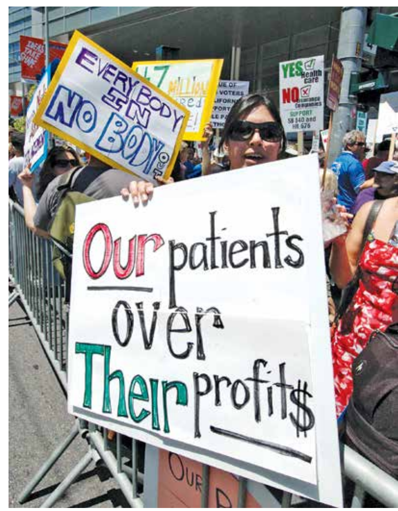
Protest in San Francisco. The people need to demand that the government provide quality healthcare for all.

The siege in Michigan continues, so learn from our lessons. Life, limb, civility and the common good is at stake. Unless we take control of the direction the country is headed, we are doomed. Our standard of living is dwindling, the cost of living is going up, and the chances of living are going down. The only way out is to organize. The industrial cities will fall first, because we are the closest to the fires of societal destruction, but we will hold out—waiting for the rest of the nation to take heed and come to our rescue. Time is of the essence.