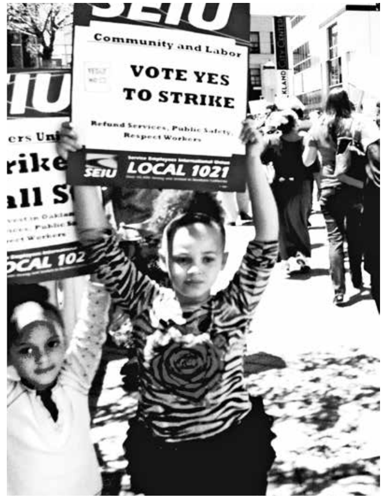
Oakland workers rally in support of SEIU Local 1021.

We live in a world of abundance. The distribution of basic needs like food, water, shelter, housing, democracy could be met with a different system of collective ownership. Technology, in the hands of the capitalists, can never be used in balance with the sustainability of the planet or the humanity that inhabits it. Siloism and individuality have been used to divide movements, keeping the people from creative and collective solutions that can address many of our issues on more holistic basis. This moment represents a significant point in time, to present class-based solutions to the struggles before us.