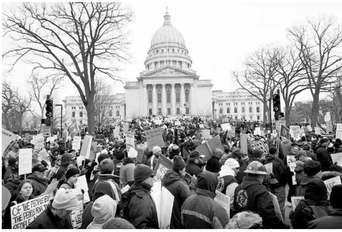
Uprising in Madison, WI in 2011 denouncing the attacks on public service unions.

PT: What is the relationship between economic and political