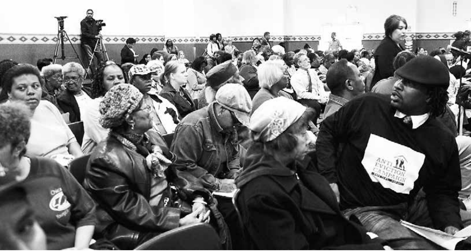
Town hall meeting in Chicago in 2011 at Charles Hayes Family Support Center to challenge unfair CHA mandatory drug testing of residents. Drug testing is an attempt to criminalize residents and throw them out of public housing.

A teenage member of a public housing family in mixed income was accused of smoking pot. The police were called, investigated, and left, saying there was no evidence. That family had to fight tooth and nail to stop their eviction. Around the same time. a man in a condo unit in the same building dropped dead of an overdose from hard drugs and