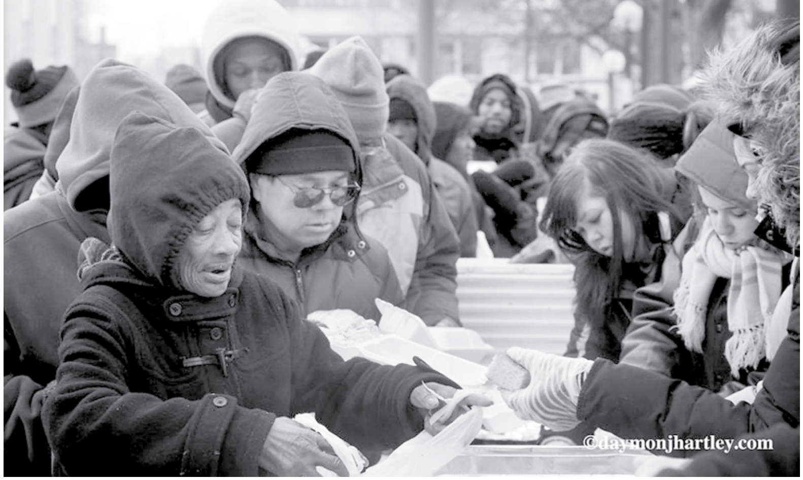
Volunteers feed the hungry at Cass Park in Detroit.