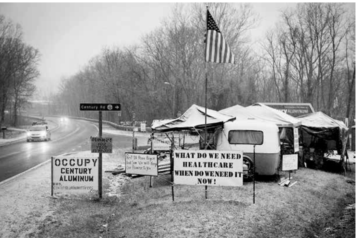
For 75 days, the Occupy Century Aluminum retirees braved the winter cold and snow, camping out at the entrance to the Century Aluminum facility in Ravenswood, W. Va., staying until Century agreed to return their healthcare benefits.

plant's reopening slips further away while Century continues to hold out on returning the health care it promised to give back. Now one year on, Occupy Century Retirees are tired of waiting.