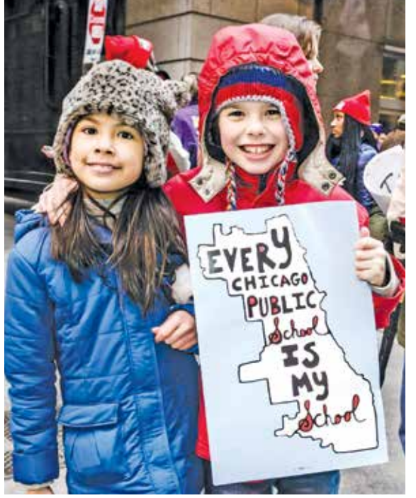
Protest against the closure of almost 50 public schools in Chicago.

D.C., the National Council on Teacher Quality was founded in 2000 to provide an alternative national voice to existing teacher organizations and to build the