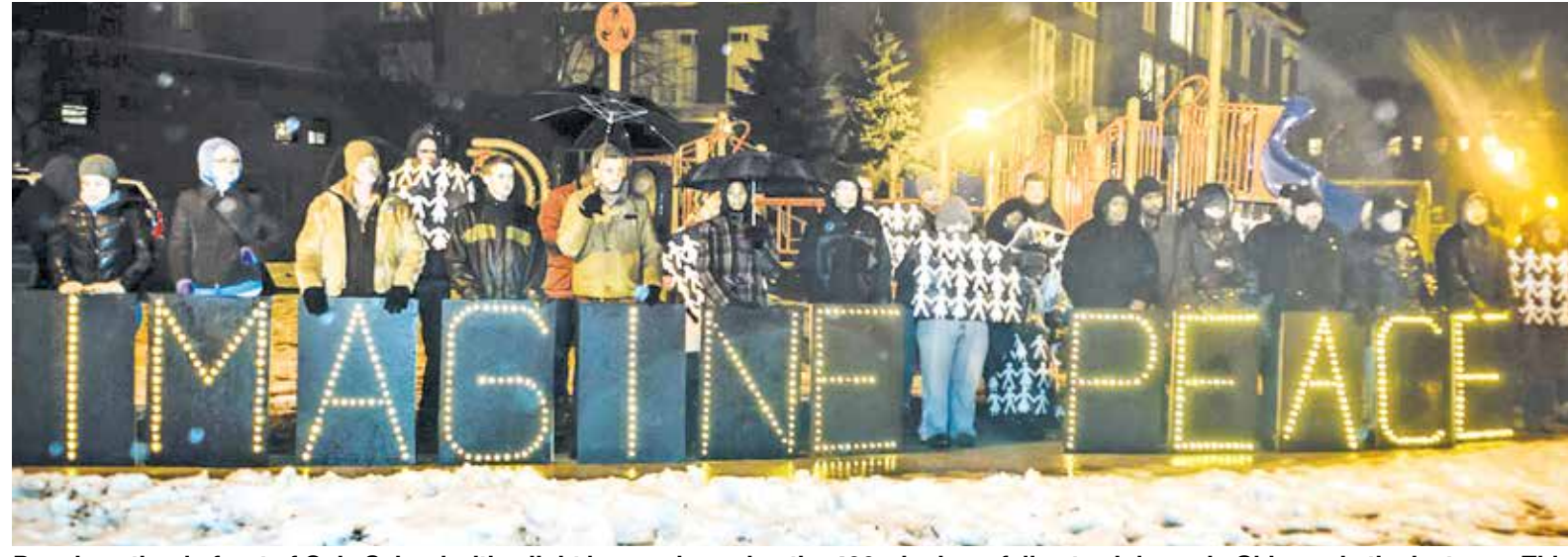
People gather in front of Gale School with a light banner honoring the 400 who have fallen to violence in Chicago in the last year. This is a major concern for parents, students and teachers at Gale school.

Yet this school is not given the classroom resources to deal with all this variation, especially the question of students for whom English is not their first language. Combine this with the fact that this school sits in the midst of