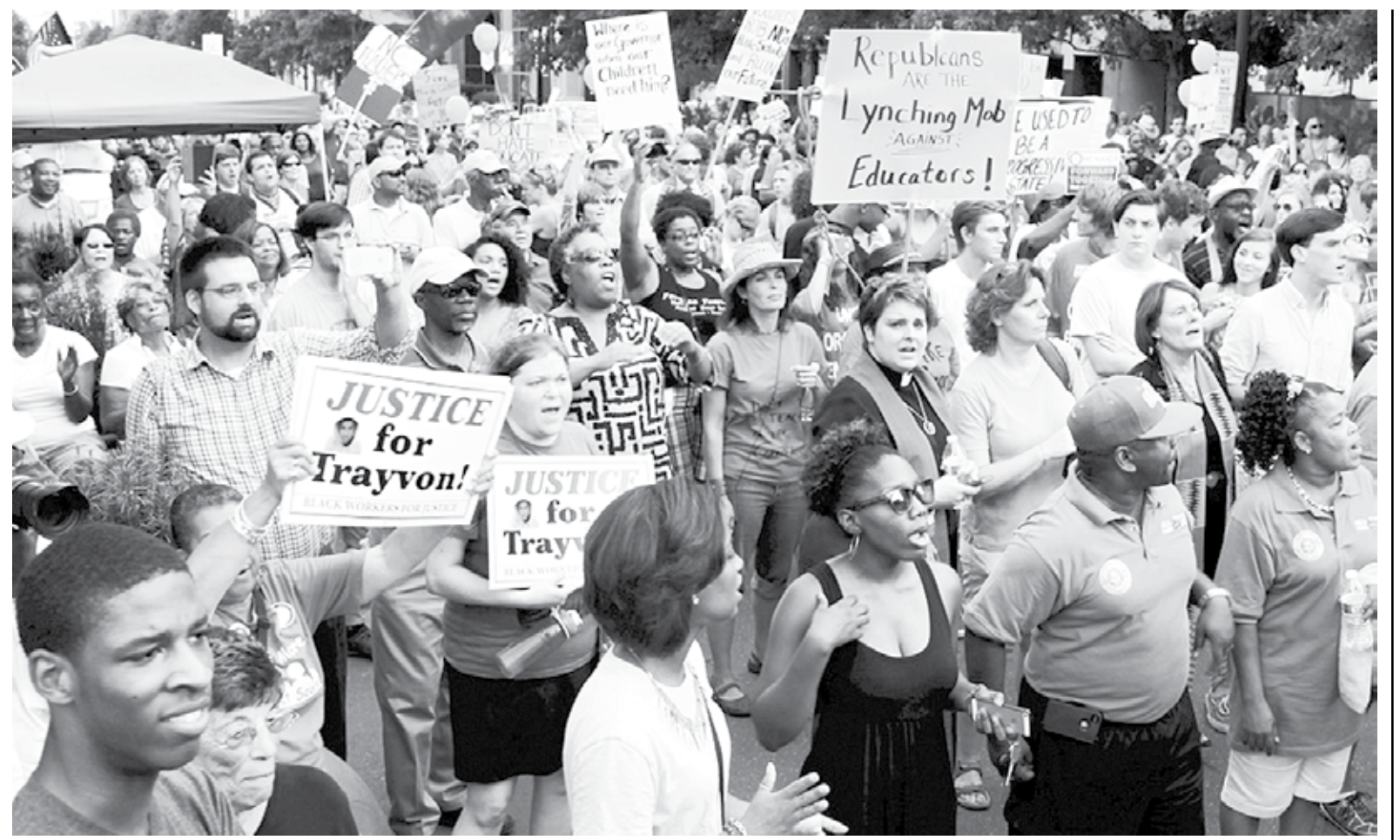
In North Carolina, people of all colors and nationalities are standing up at Moral Mondays protests to resist what they see as a moral atrocity by the wealthy. Over 900 protesters were arrested in last year's protests. They are demanding a government that operates in the interests of the people.