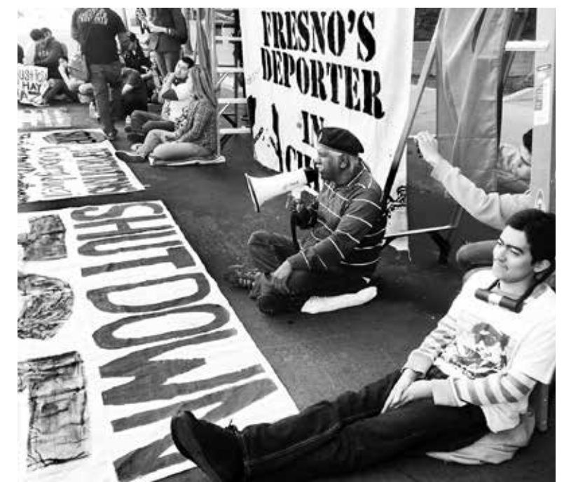
Protest in front of Fresno County Jail.