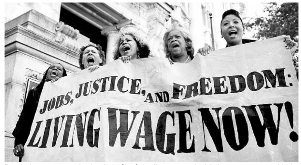
People demonstrate on the day that a City Council vote was scheduled to attempt to override the mayor's veto of the Large Retailer Accountability Act. PHOTO/RICK REINHARD 2013

We have heard no complaints from Wal-Mart, the DC Chamber of Commerce's and the other corporate giants about this new DC minimum wage legislation. Apparently, it's an expense they can easily absorb without affecting profits. It's another story for small businesses whose profit margins are much thinner and are likely to be disproportionately affected by the