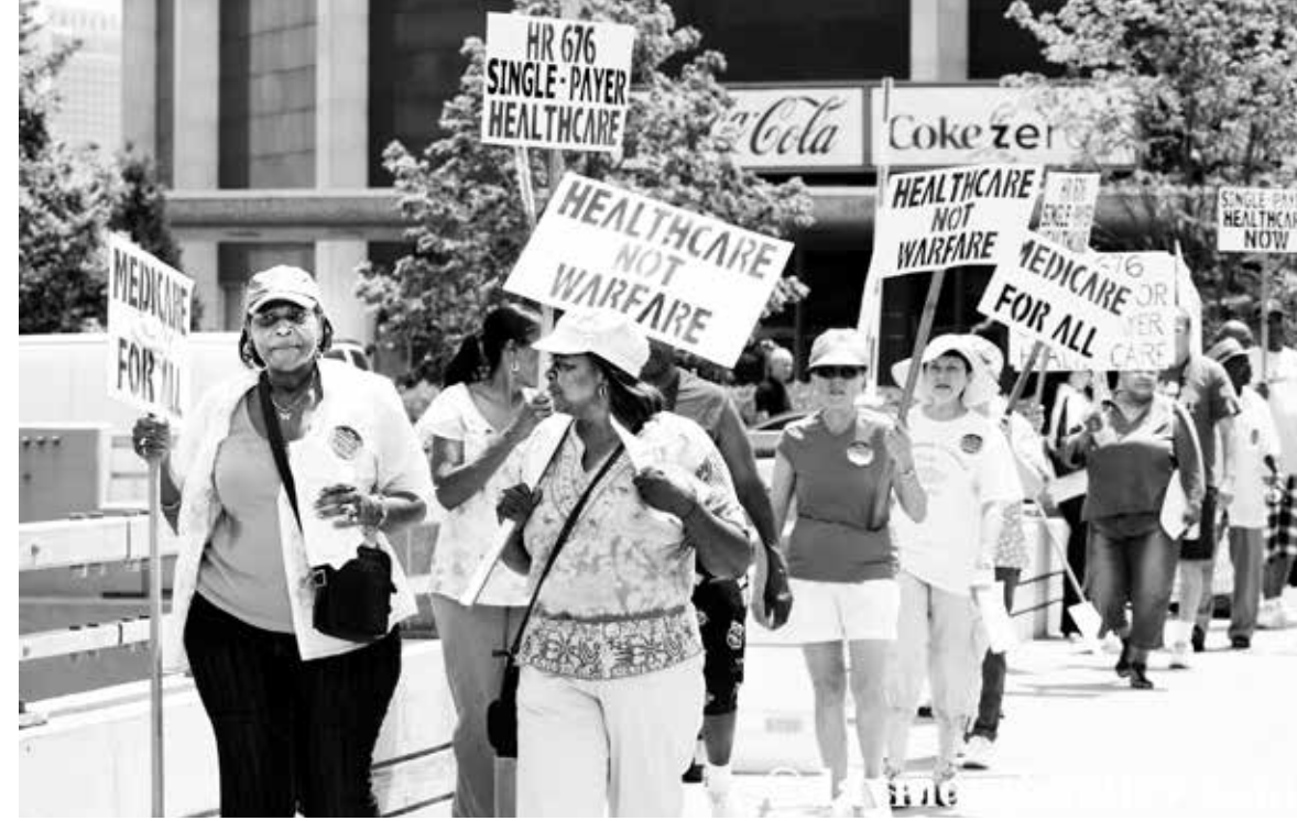
Healthcare protest for Medicare for All in Detroit, Michigan.

1. "Place the present Medicaid problem on a national basis with national standards, like Medicare, instead of having it optional for the states." And, 2. "Every person shall receive free and complete medical care from the day he is born until the day he dies." From the 1968, Mississippi Freedom Democratic Party (MEDP)