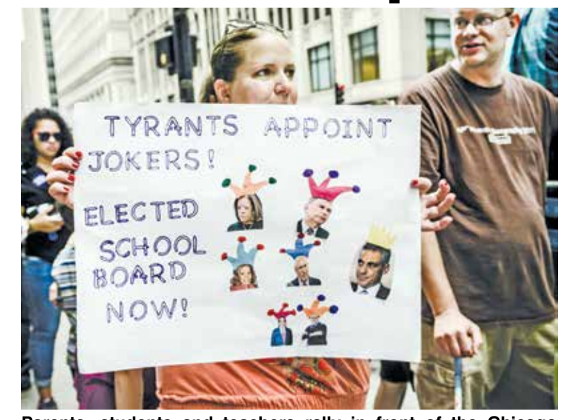
Parents, students and teachers rally in front of the Chicago Board of Education as part of the city wide student boycott. They are holding the politicians accountable by demanding an elected school board.