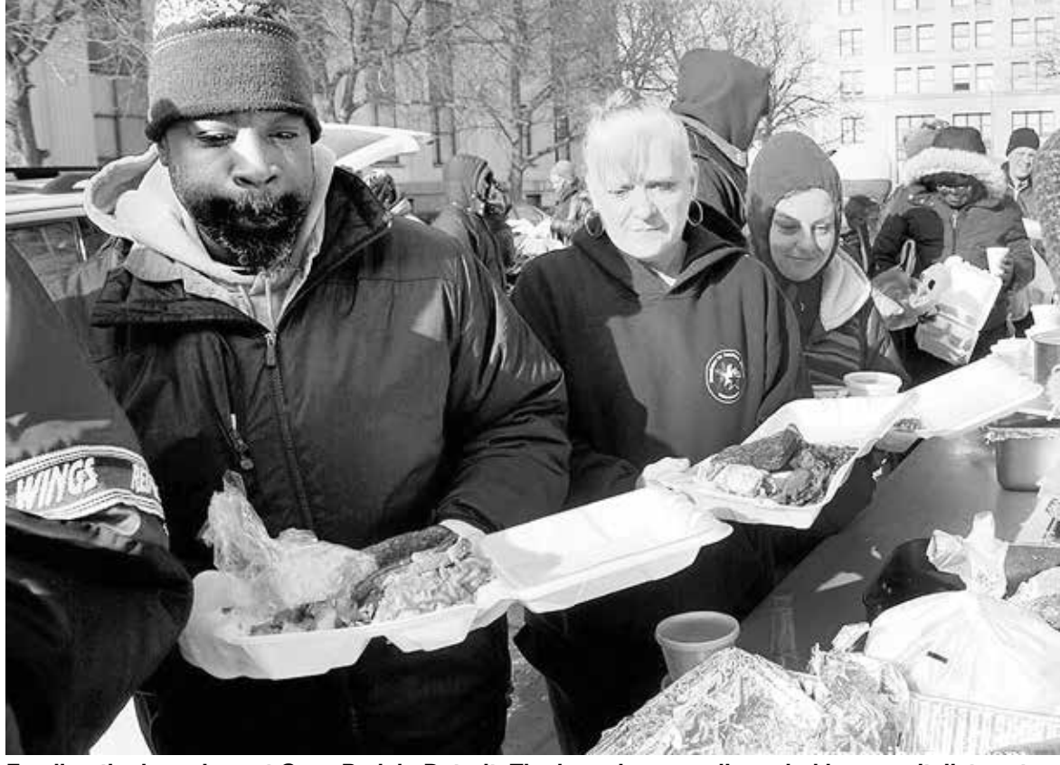
Feeding the homeless at Cass Park in Detroit. The homeless are discarded by a capitalist system that no longer needs their labor. It doesn't have to be this way.

I will not be on the sidelines. I know how great this country is and what it can do with all the technology that we have. I am going to fight for education,