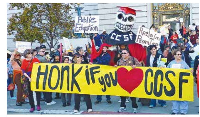
The community, faculty and students of San Francisco City College protesting to save their school.

The community, faculty and students have not sat by passively to watch the school be destroyed. They have exposed numerous conflicts of interest on the part of the ACCJC and