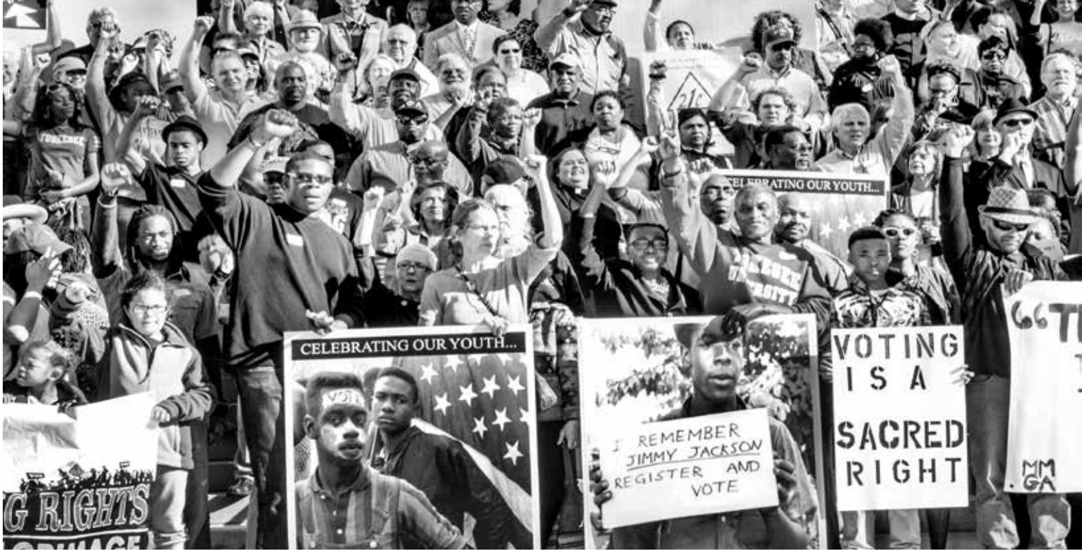
Moral Monday rally at Georgia Capitol.

One of the bills that Moral Monday GA wants Governor Nathan Deal to veto is HB 990 and to Expand Medicaid Now! It's a matter of life and death-10 people die everyday in Georgia