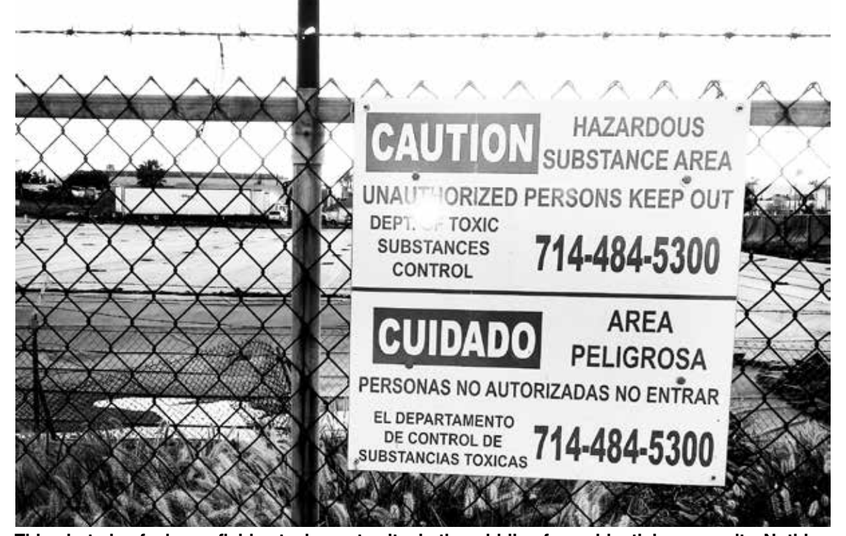
This photo is of a brownfield, a toxic waste site, in the middle of a residential community. Nothing has grown here for at least 40 years.