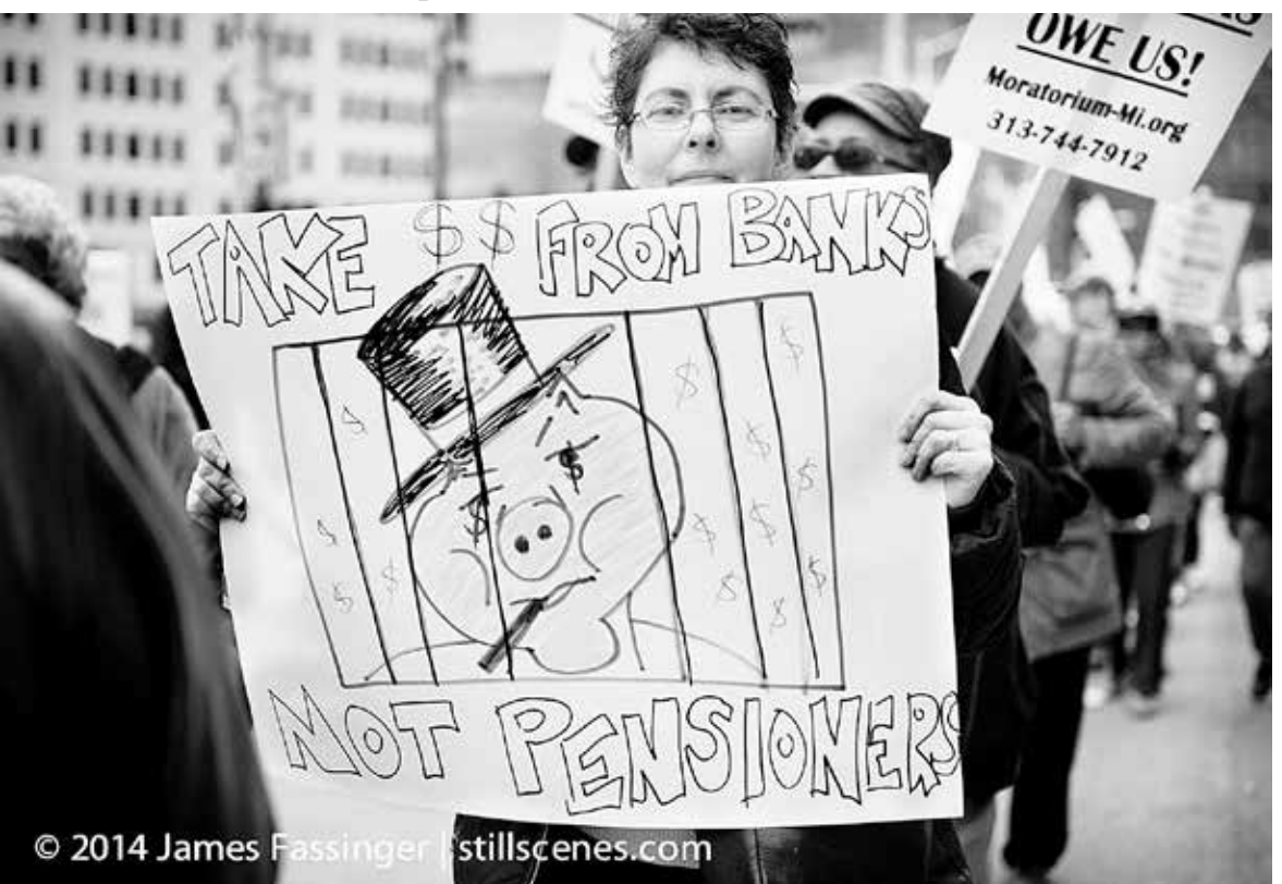
Protest against pension cuts for city workers.

In the long run, merely speaking out against the bankruptcy will not solve Detroit's issues with corporate dictatorship and plunder. The call has gone