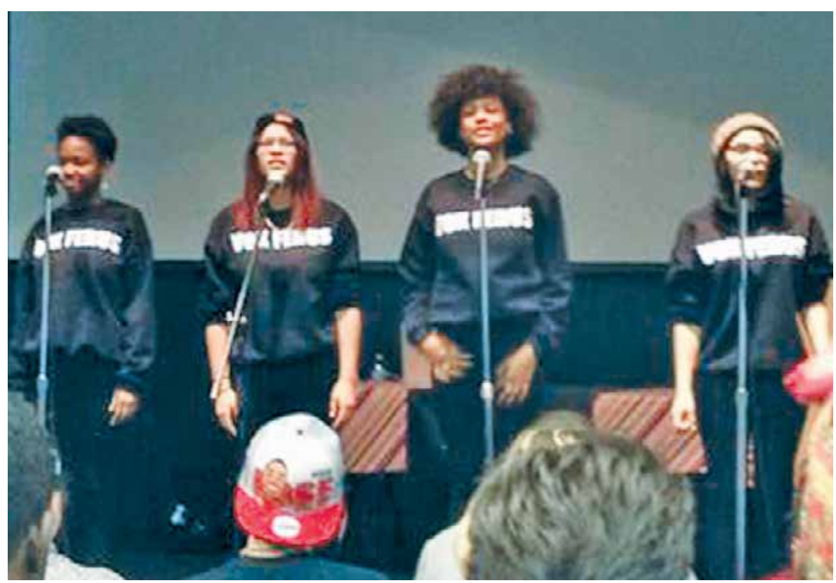
Team Vox Ferus performing their group piece at Louder Than A Bomb 2014, the world's biggest youth festival held in Chicago every year.

"At LTAB you get educated about things that are outside of your sphere of witnessing... you just get to learn and hear about