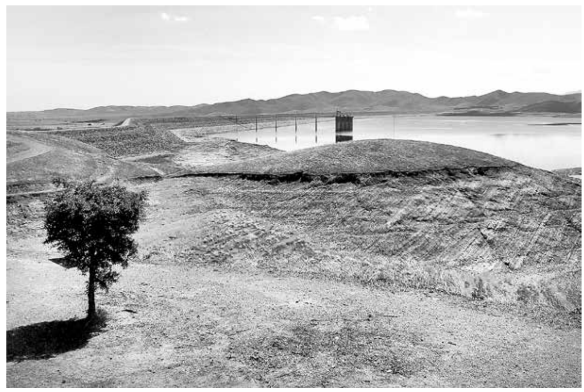
The massive San Luis Reservoir in California, a major water source for Silicon Valley, is only 17 percent full.

All of the proposed "solutions" to the water crisis, whether Democrat or bipartisan happen to benefit the Westlands Water district, which is 49% controlled by Beverly Hills billionaire Stuart Resnick, who has