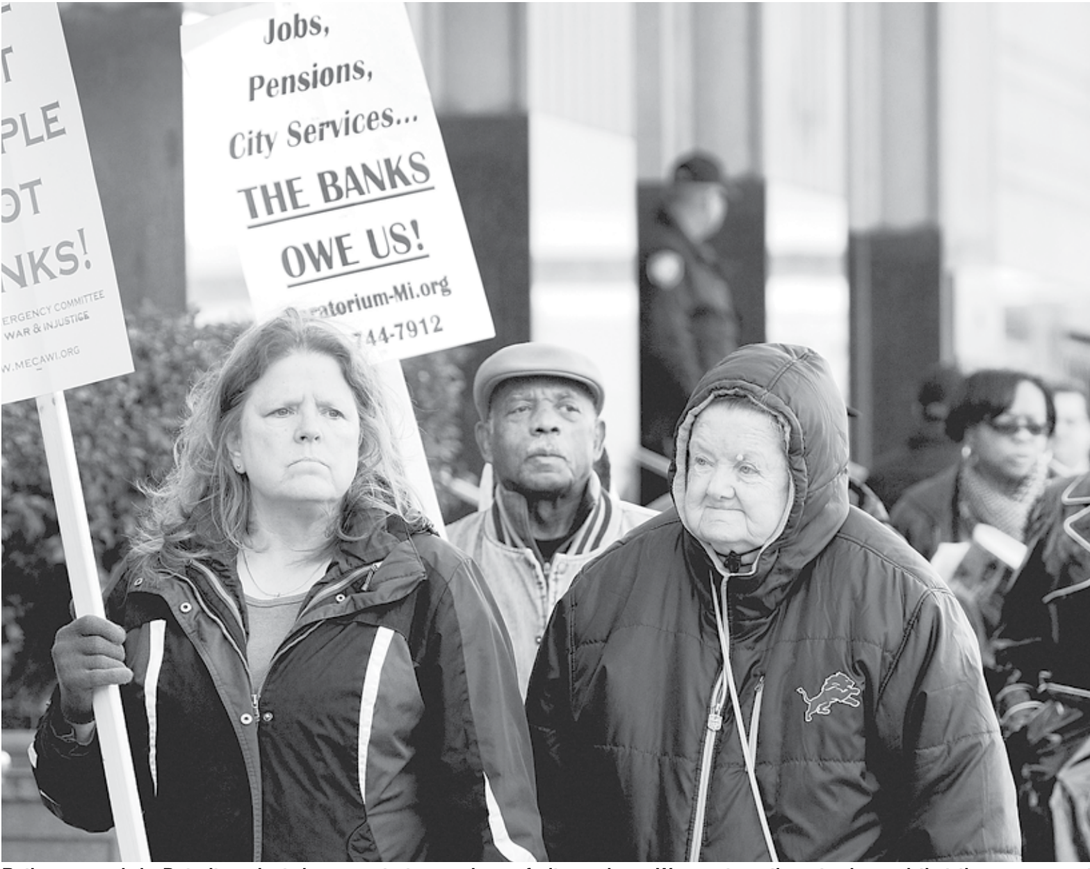
Retirees march in Detroit against deeper cuts to pensions of city workers. We must continue to demand that the government guarantee the necessities of life to every one of us.

Today, the reforms have been stripped away, and there is no going back to the old days. No more reforms are possible, because the electronic revolution has transformed the economy. Robots and computers are taking the place of human labor, eliminating one job after the other. Millions are now permanently