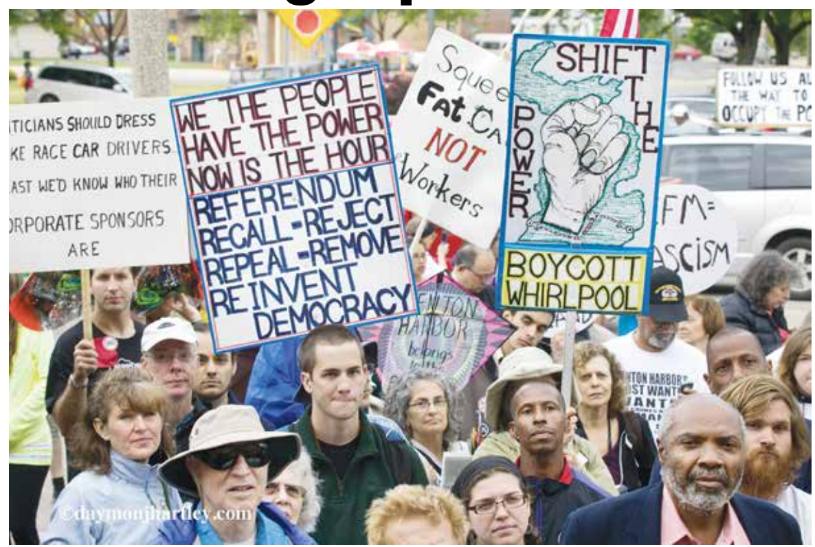
One of many protests in Benton Harbor for democracy and against the corporate takeover of the city.

way of petition. To intimidate, rien County Sheriff Paul Baiharass, accuse, or use Gestapo tactics to infringe on a citizen's civil rights is a federal crime.