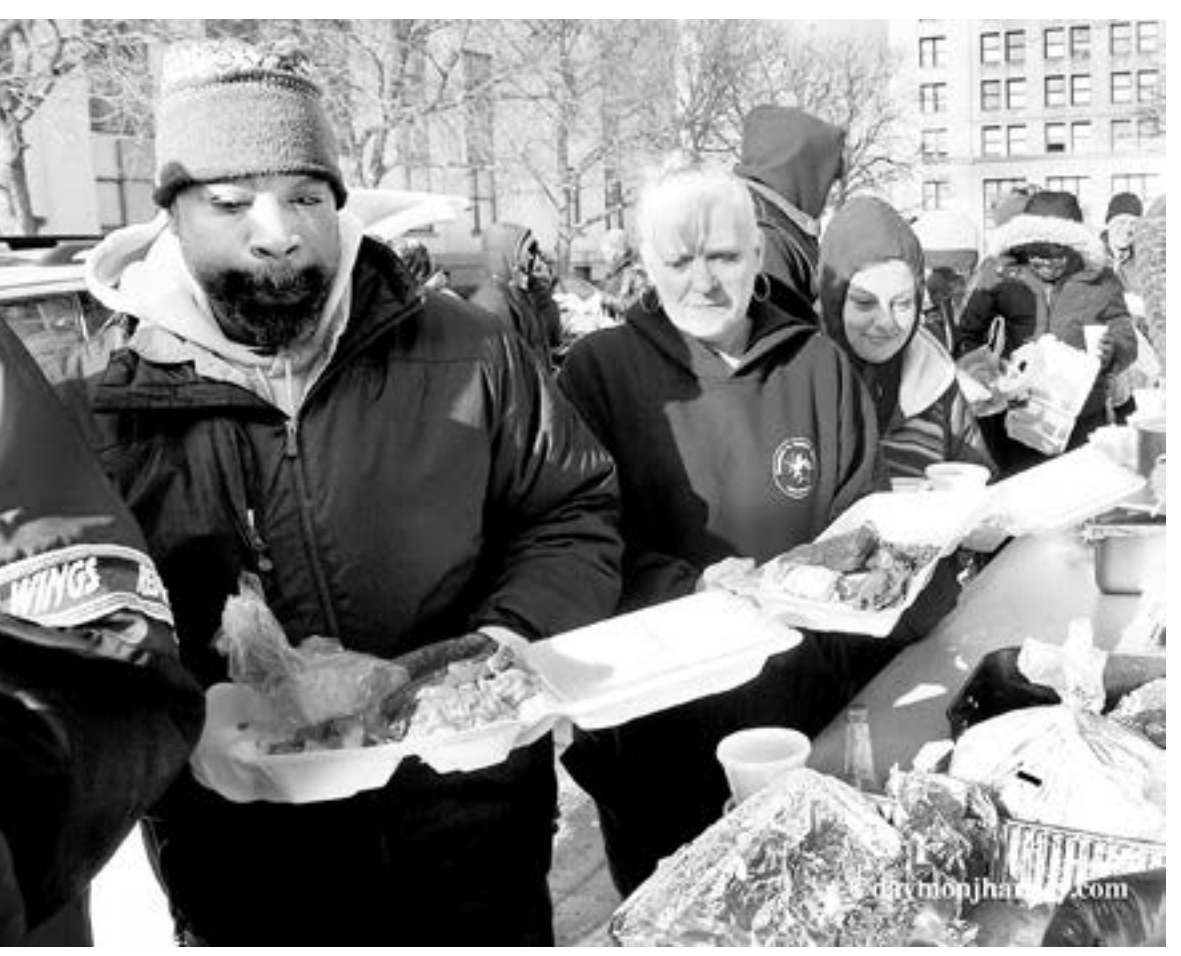
Feeding the hungry in Detroit, due to the massive plant closings and retooling. A new study says millions of Americans are living on less that $2 a day (Luke Shaefer and Kathryn Edin).

What we lack is the independent political movement to make the transition to the future that the microprocessor requires. Will that future benefit all human beings or will it be another class system that will benefit the few?