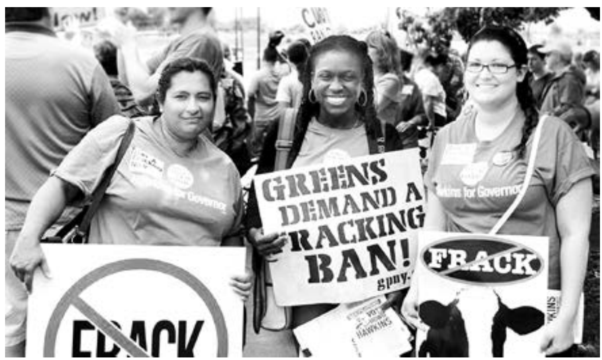
Supporters of the Howie Hawkin for NY governor campaign protest fracking.