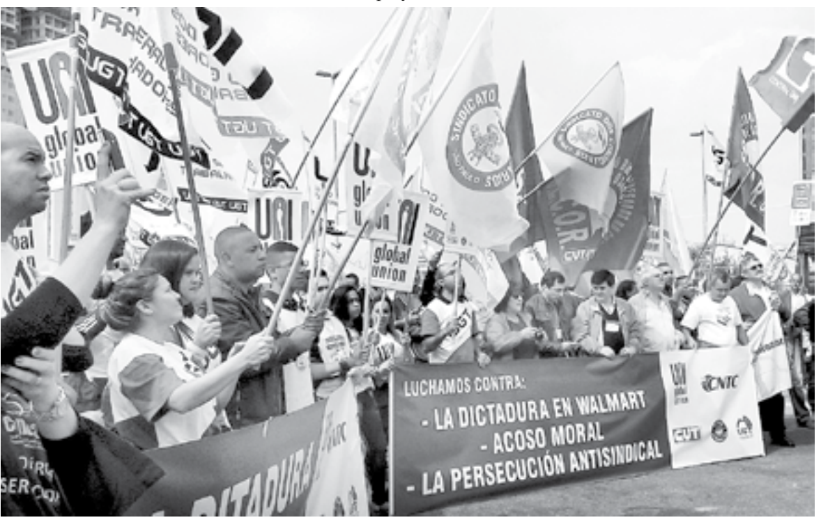
Workers rally against Wal Mart in Sao Paolo Brazil.

They agreed it was a wonderful experience, and an inspiration to continue their struggle. They will be attending a conference during September at the headquarters of the United Farmworkers Union in Keene. Ca. where they can share what they learned in Brazil.