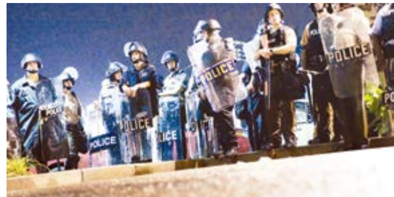
Police in Ferguson confront protesters.

TR: Three of the poorest zip codes in the state are here. They have the worst schools, the highest poverty and public assistance rate. People vote for the same people and get the same result, whether Democrat or Republican. People say if we come