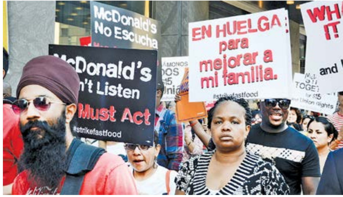
Fast food and other low wage workers rally in New York for $15 an hour wage. Strikes took place in dozens of cities with 400 arrests nationwide.

The situation of the fast food workers-the low wages, the just-in-time scheduling, the threat of being replaced by robots—is a harbinger of the future for all workers. Labor-replacing technology is eliminating jobs and driving down wages worldwide. The fast food workers are part of a global section of the working