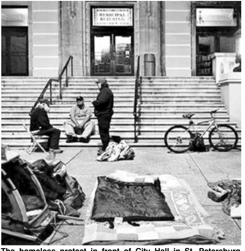
The homeless protest in front of City Hall in St. Petersburg

-Roque Dalton (El Salvador) Translated from Spanish by Jack Hirschman