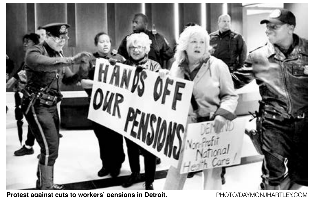
Protest against cuts to workers' pensions in Detroit.

Politicians of both parties still hide the crisis they've created in Social Security. They generate ongoing confusion. Re-