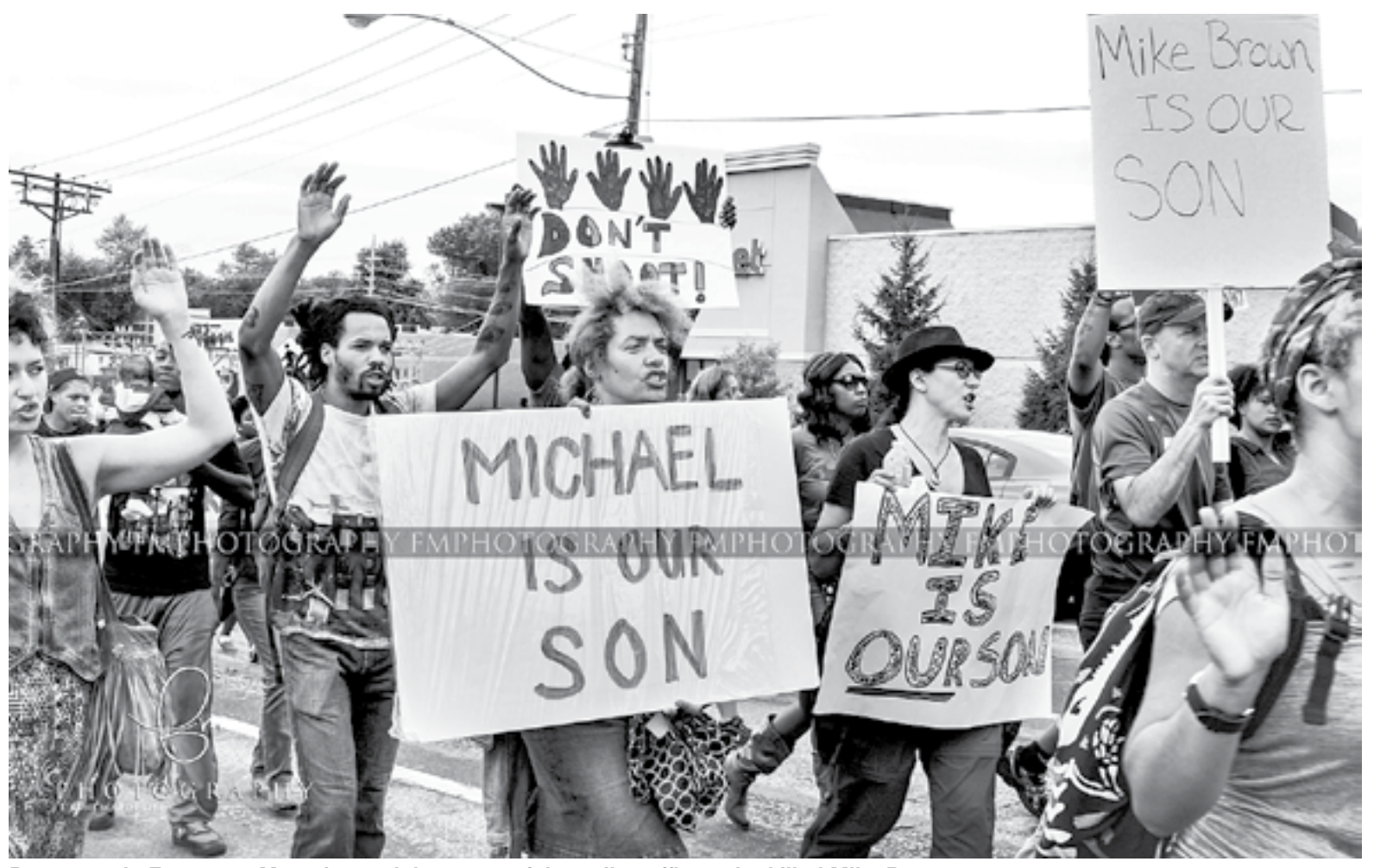
Protesters in Ferguson, Mo., demand the arrest of the police officer who killed Mike Brown.