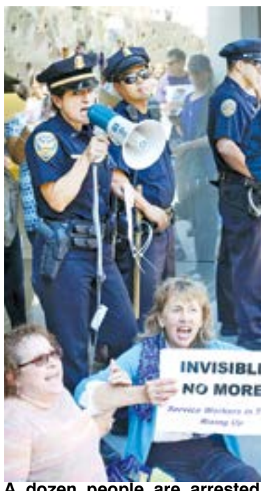
A dozen people are arrested at the labor protest at a San Francisco Apple Store.