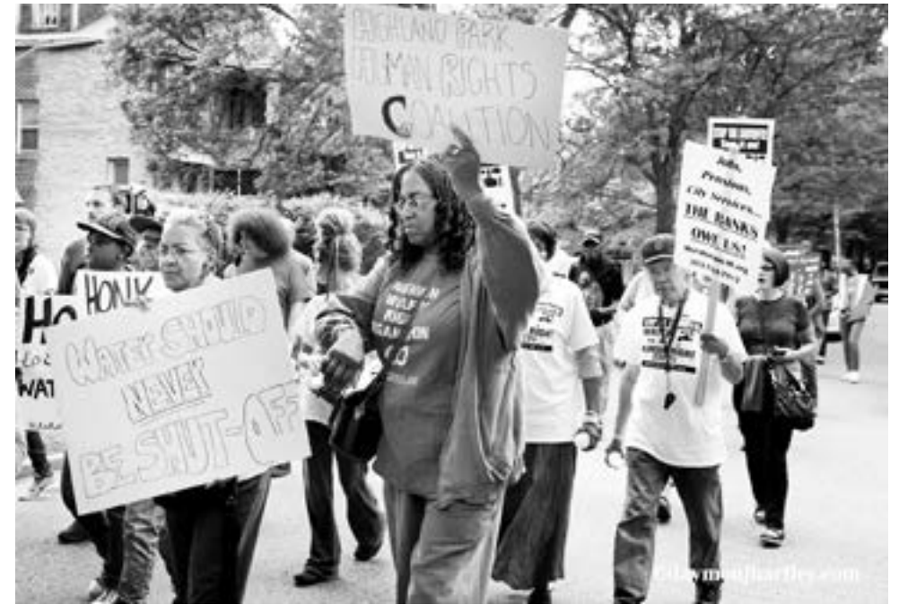
Protest against water shut offs to thousands of low-income Detroit, MI residents. The march ended up in Highland Park, MI, which is also suffering from skyrocketing water prices and shut offs. People throughout the US and world are morally outraged at the denial of running water to families simply because they cannot afford to pay.