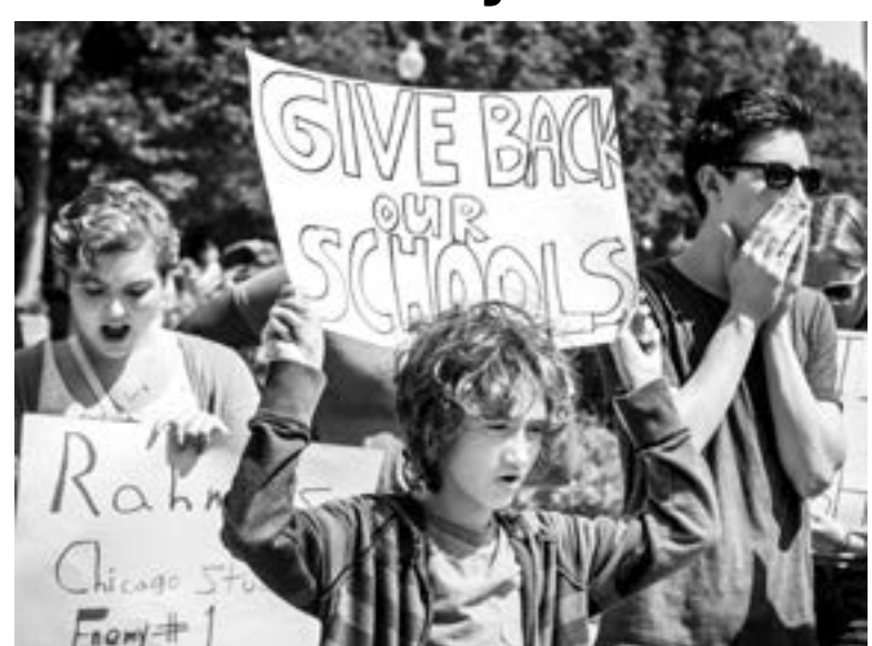
Chicago students march for an elected school board in August, 2014.