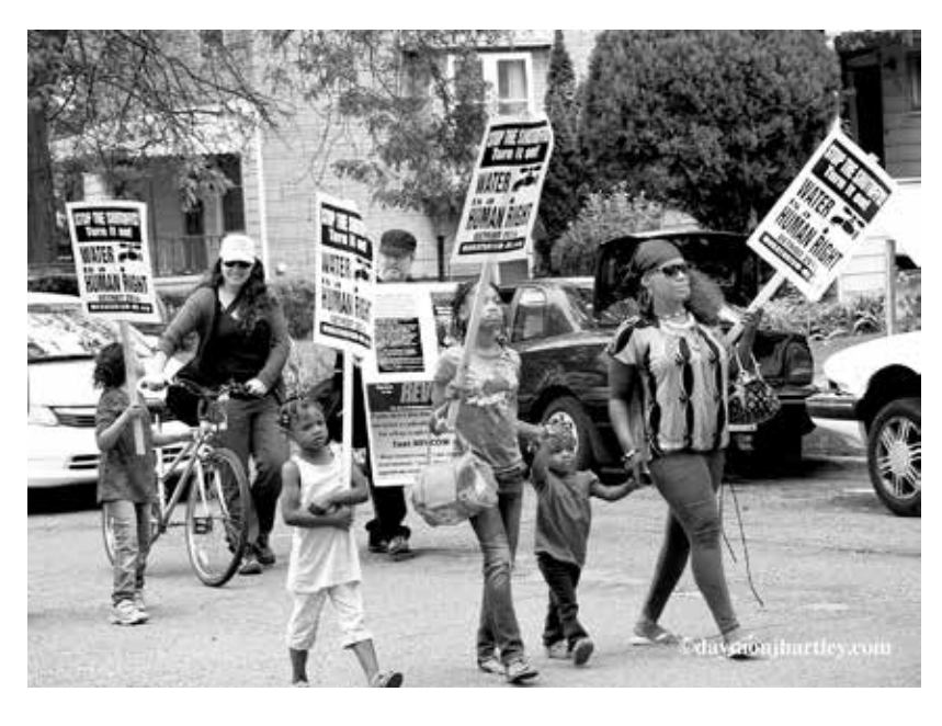
Protest against water shut-offs in Detroit.

As a field general in the army of social justice for vulnerable, low income populations, it falls to me and mine to keep this battle in the face of all humanity. We will take every opportunity to convince those in power that their salvation lies in distancing themselves from the 'dark" side in favor of protecting, serving, and advancing the quality of life for all.