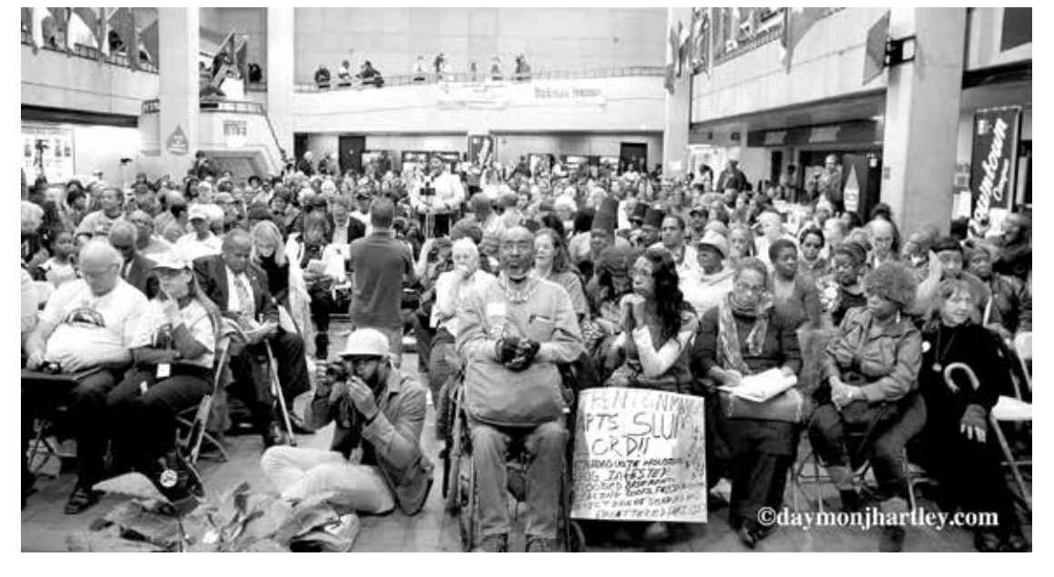
Audience listens to United Nations representatives who came to Detroit to investigate the city's immoral water shut-offs. Some 300,000 water shutoffs have occurred over a period of years. They recommended immediate restoration of all residential water.