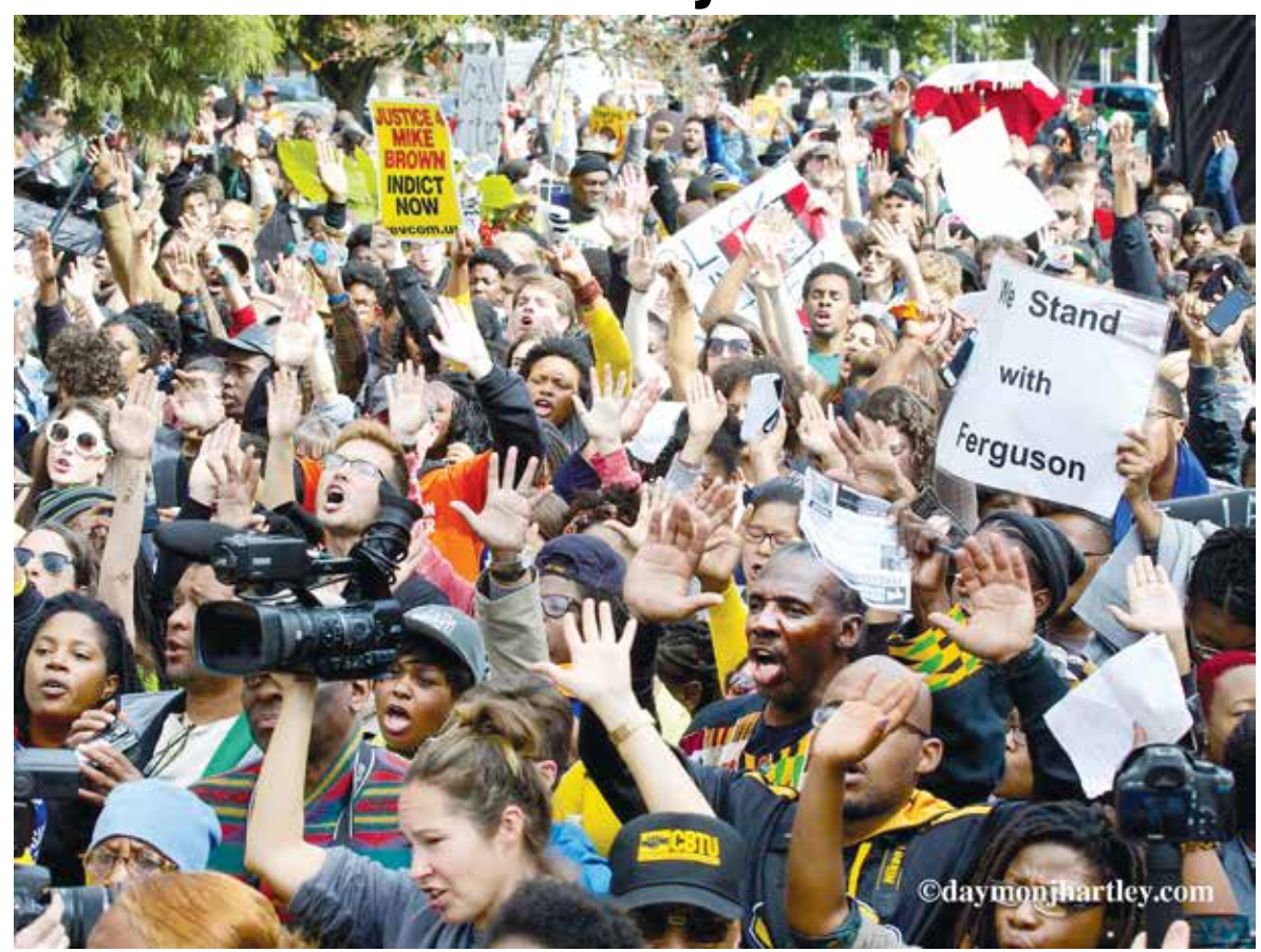
Thousands from around the country came to Ferguson, MO to protest the police killing of Michael