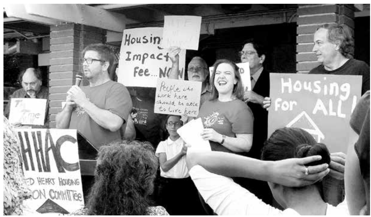
Rally for Affordable Housing in San Jose.

One solution that has been proposed for San Jose is a Housing Impact Fee on developers to raise funds for affordable housing. The Sacred Heart Housing Action Committee and the Affordable Housing Network mobilized hundreds for rallies and hearings on the housing crisis