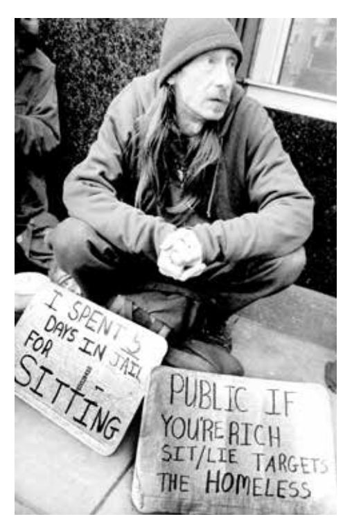
The Sit-Lie law makes sitting or lying down between the hours of 7am and 11pm illegal in San Francisco.

community members that con- is no change without the people never be divided and we will