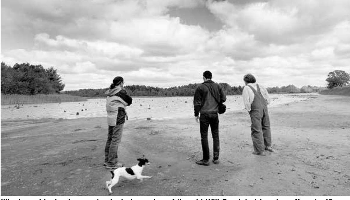
Illinois residents view contaminated remains of the old Will Scarlet strip mine off route 45 near Stonefort, IL in Williamson county.