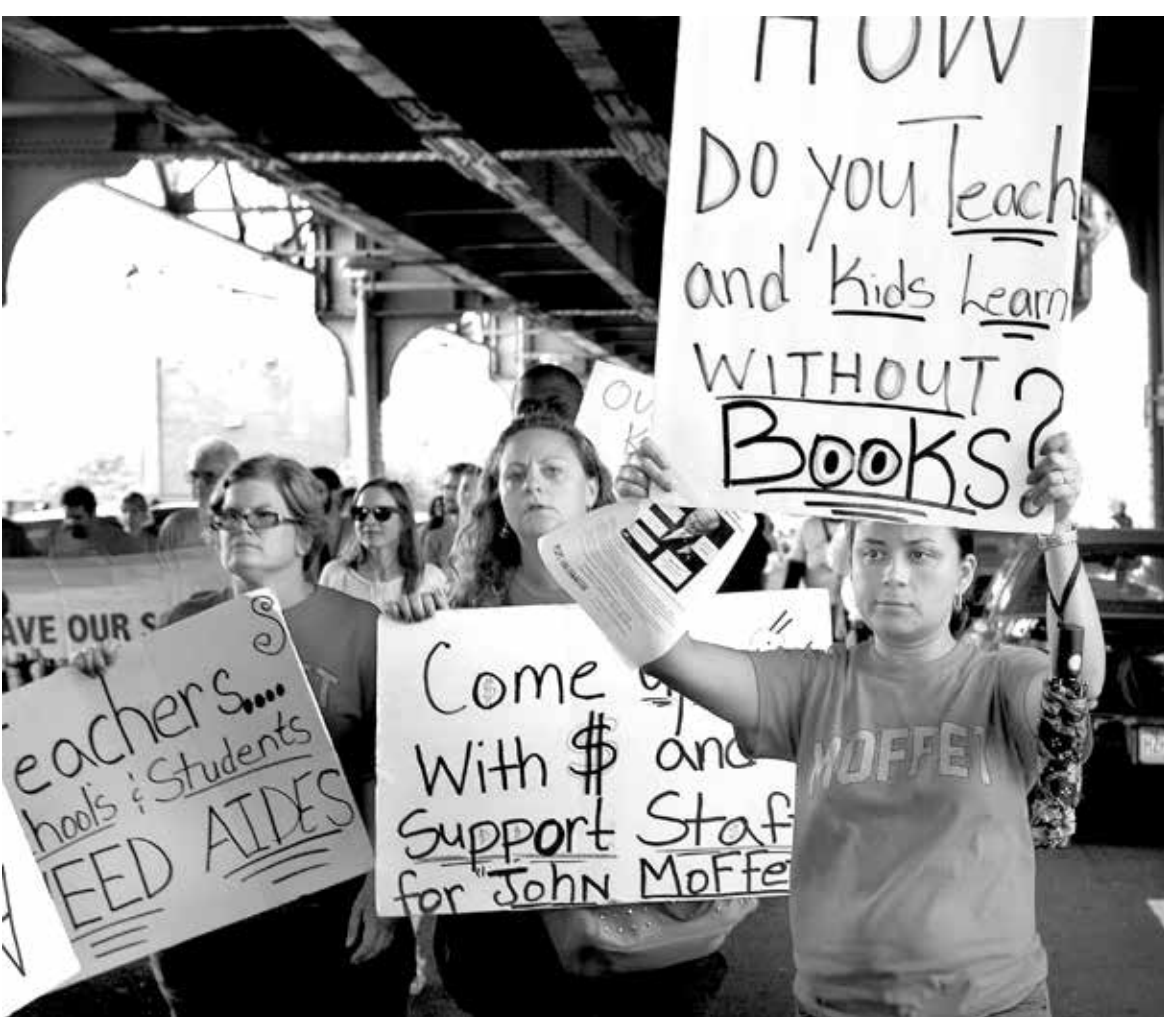
Moffet Elementary teachers join a rally in Kensington, PA to fight for full school funding. Over 27,000 teachers have been laid off state-wide. Now they want to cut teachers' health benefits.

They continue to cut back but we will continue to fight back! Our schools will be saved no matter how long we have to fight against this broken system! We are very proud of the students, teachers, parents, and