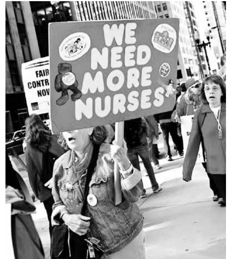
Protest in Chicago to stop the cuts to public education and healthcare in the schools.

Indeed, for the sake of humankind there can be no lasting solution to Ebola or any other