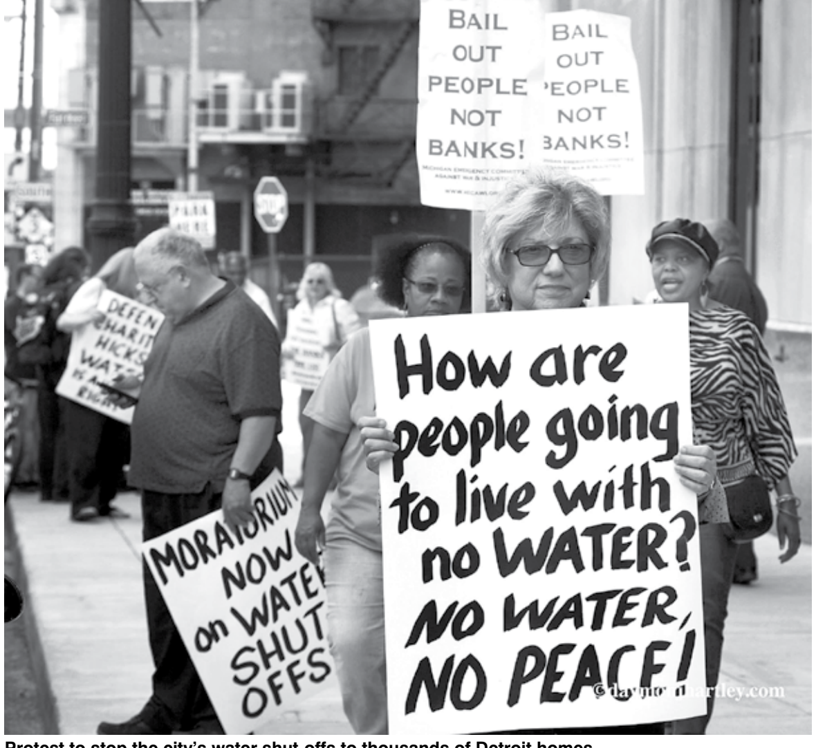
Protest to stop the city's water shut-offs to thousands of Detroit homes.

Battle lines are drawn all over the country in what people are calling 'water wars.' Fracking, polluting, drought, for sale signs on lakes, rivers, aquifiers, and public water filtration systems the forms are many, but the content is 'class war' with privatized water at once both the prize and the weapon used.