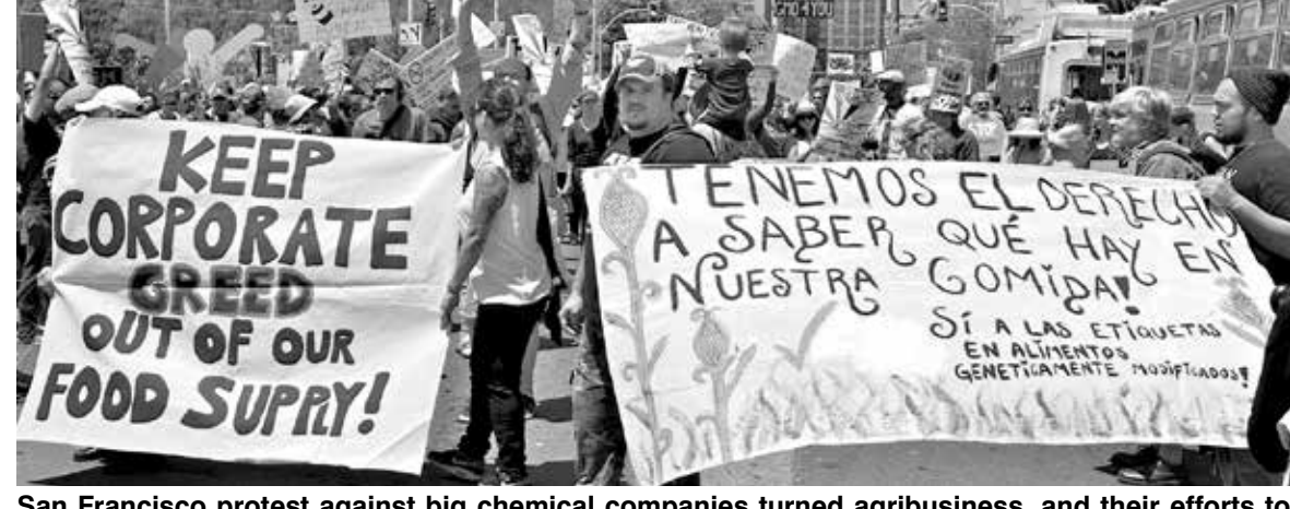
San Francisco protest against big chemical companies turned agribusiness, and their efforts to monopolize seed (food and commodity) production through the control and sale of GMO's.

When Stockton, California went bankrupt in 2012, pensions were ruled untouchable. But last month the judge ruled that cities can use bankruptcy to wipe out pension responsibilities. This was legal prece-