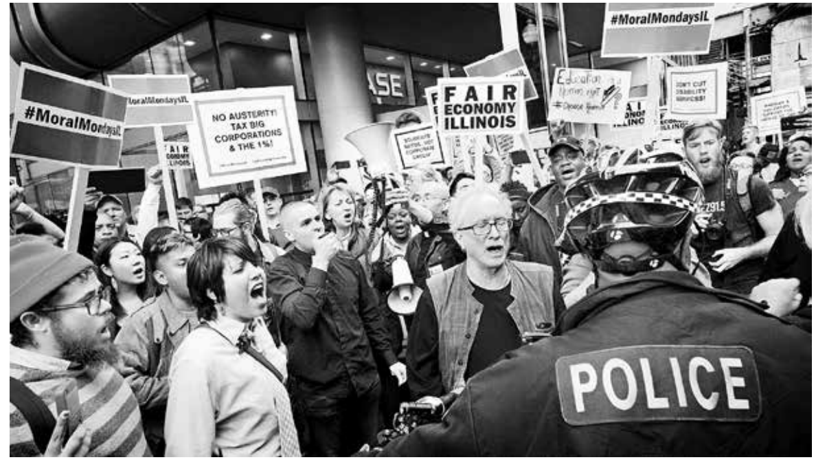
Chicago protest for mental healthcare. (Top) Moral Monday protest of governor's austerity budget at the Chicago Board of Trade. Protesters demanded a tax on the rich to generate state revenue. (Bottom)

As long as it is denied that healthcare is a human right, budget impasses such as this one, and the human suffering that follows, will continue.