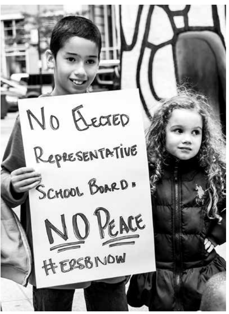
Protest in Chicago demanding an elected representative school board.