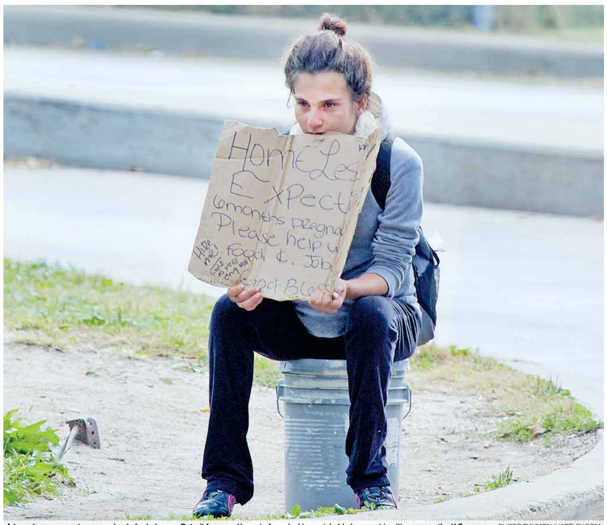
A homeless pregnant woman pleads for help on a Detroit freeway. Her act of survival is punishable by arrest in cities across the U.S.