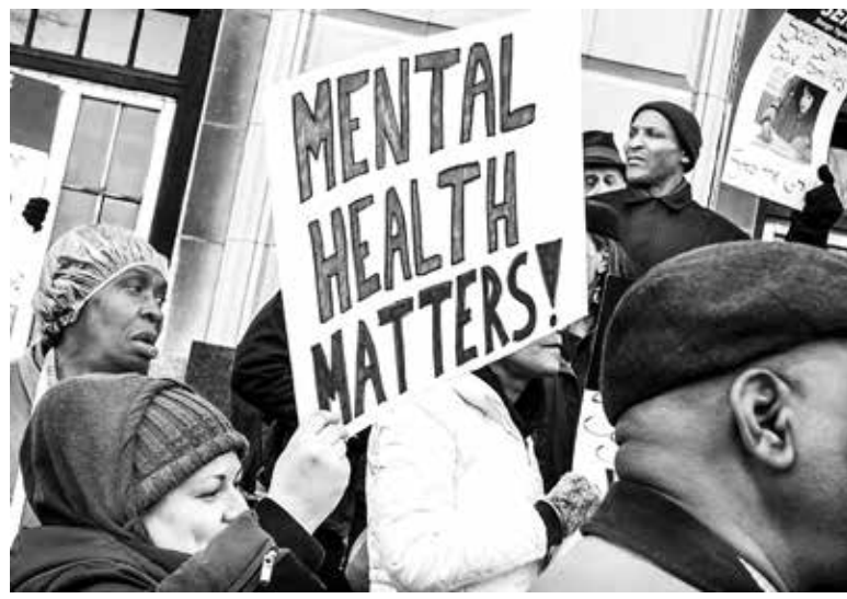
Chicago protest for mental healthcare.