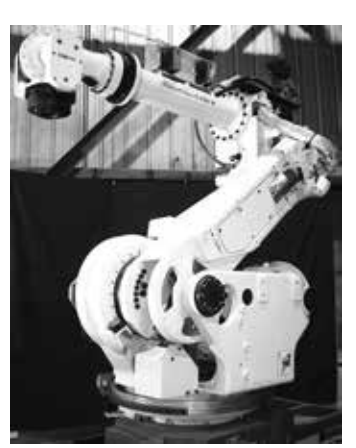
A packaging robot.

"If machines produce everything we need, the outcome will depend on how things are distributed. Everyone can enjoy a life of luxurious leisure if the machine-produced wealth is shared, or most people can end up miserably poor if the machine-owners successfully lobby against wealth redistribution. So far, the trend seems to be toward the sec-