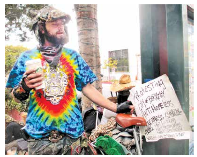
Homeless youth protest the constant police harassment in downtown Berkeley, CA.