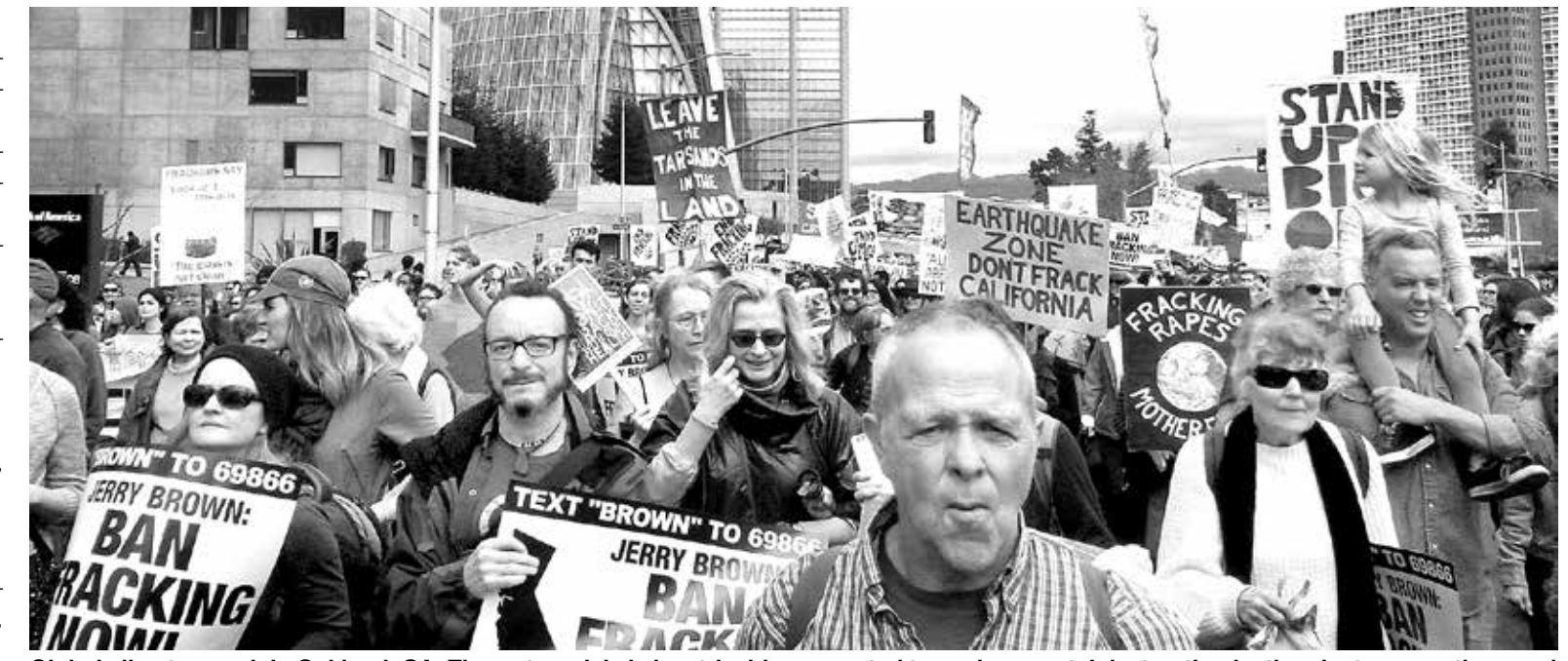
Global climate march in Oakland, CA. The water crisis is inextricably connected to environmental destruction by the giant corporations and their drive for profit.

ing the chemical waste from fracking into salty or unfit sources of water underground. However, it appears that this has been happening even with clean drinking water. In 1982, the oil companies were given the authority to regulate themselves in monitoring 42,000 injection wells that dump toxic waste fluids into groundwater. This of course didn't happen (Tom Hayden, www.sfchronicle.com/opinion/ article/Dogging-DOGGR-s-misdeeds-in-Kern-6220757.php).