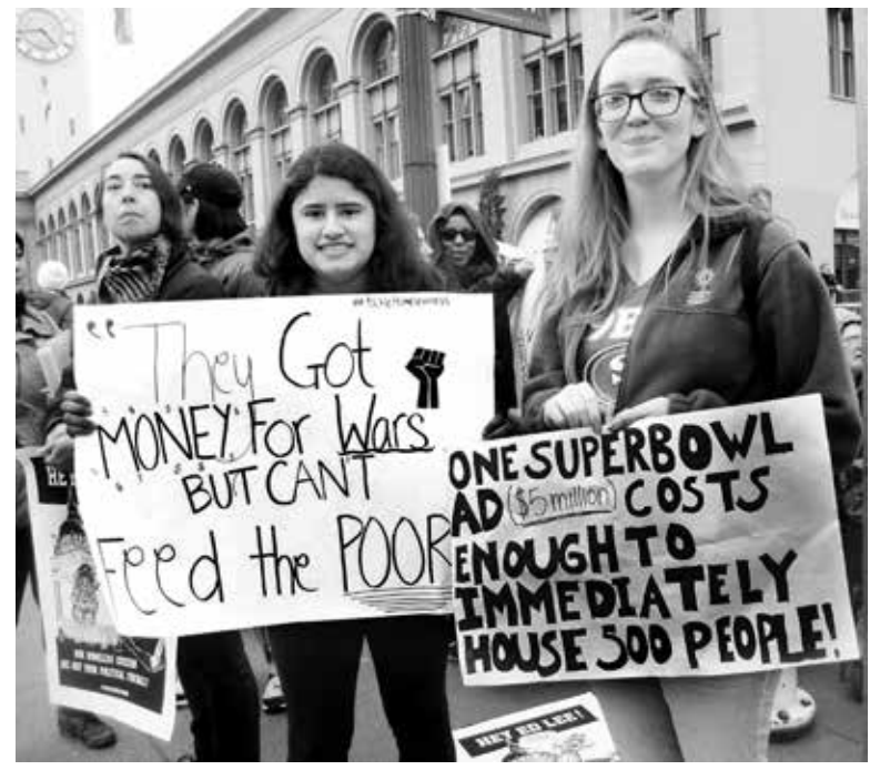
Protesters against the corporate takeover of San Francisco by the NFL during the privatized Super Bowl party and the harassment and sweeps of homeless people.

We can't let people be treated in this inhumane way. We are in a city with incredible wealth and we have one of the largest homeless populations in the nation. The way we treat our most vulnerable communities shows who we are as a city. We have politicians who are hateful towards the homeless. It's just disgusting the way people are treated in this city. I know people who are still out on the streets living, and protesting, comrades here and in the East Bay, and they deserve better. Thank you all for being