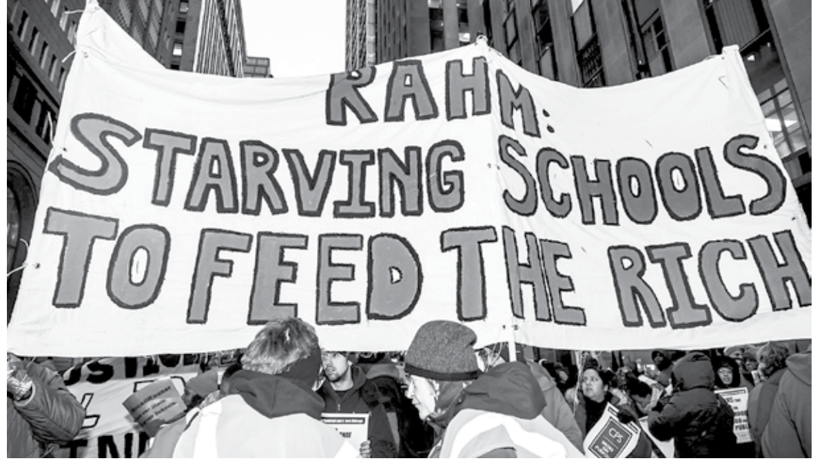
Thousands of teachers, parents, students and allied organizations flooded downtown Chicago in protest of the firing of 1,000 teachers and salary cuts.

est, most unpopular point in his administration. His cover-up of the murder of Laquan McDonald by Chicago police outraged Chicagoans. Almost daily demonstrations call for his resignation. A recent poll showed the public views the Chicago Teachers Union three times more favorably than it does Emanuel. The teachers may never have a more favorable time to fight for their survival and that of public education. However, the threats to