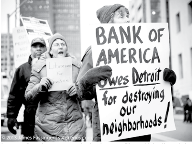
In 2014, Detroiters protest the bankruptcy filing which allowed the city's unelected Emergency Manager greater powers to attack the current and retired public workers.

tion are important to a section of society that is losing any hope of education as an end to poverty. The battle is transcending the fight for individual schools. The combatants are forced to engage the political apparatus to achieve their contract goals. This is the beginning of seeing the goal as fully funded public education for all, guaranteed nationally by a government with abundant resources to accomplish this.