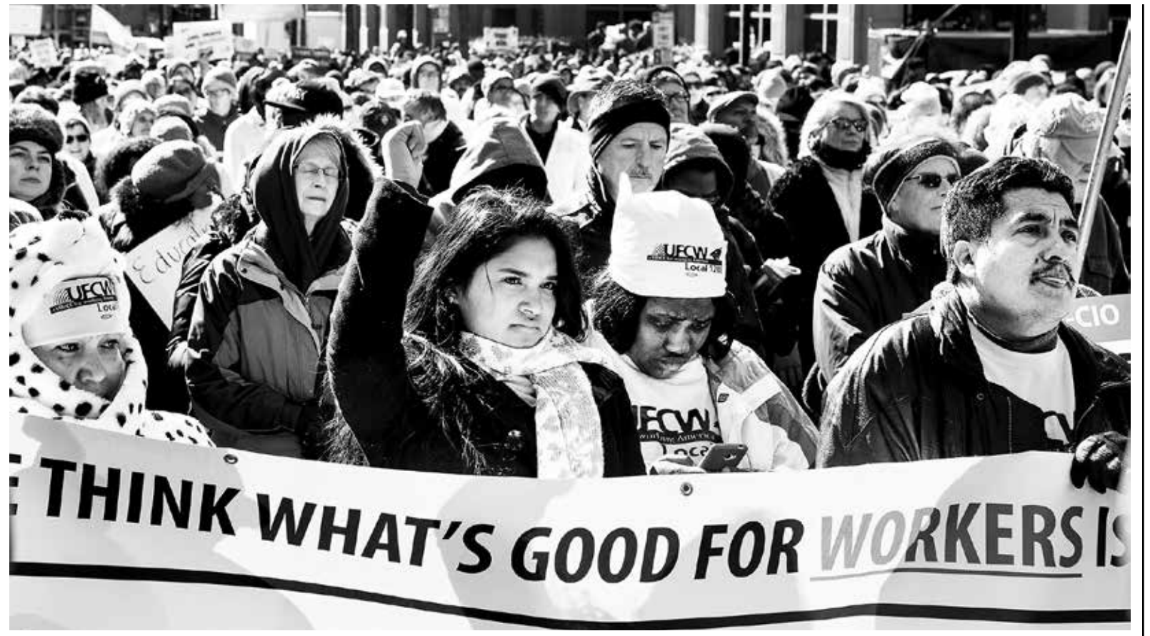
This march in Raleigh, North Carolina, represents all those hurt by the regressive policies of the state's legislature and its attempts to hinder