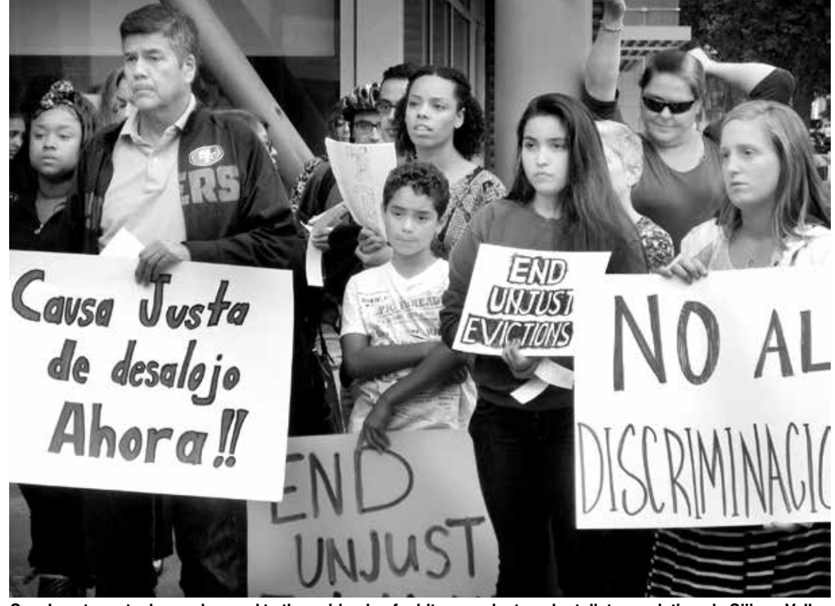
San Jose tenants demand an end to the epidemic of arbitrary, unjust, and retaliatory evictions in Silicon Valley.