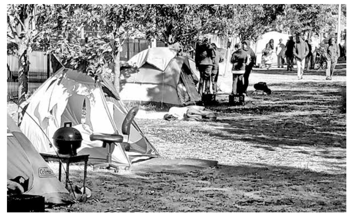
This homeless encampment was destroyed in the Uptown neighborhood of Chicago. It was on public land, in front of a shuttered public school.

The homeless are challenging private property. They are pointing the way toward a new