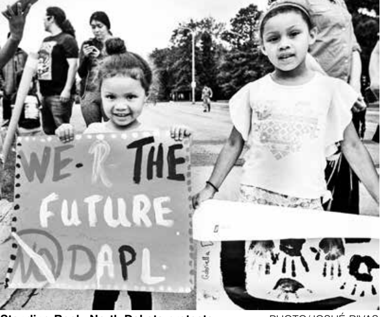
Standing Rock, North Dakota protests.

beyond that, and say, I'm not worried about myself any more, I'm worried about what's going to happen in a hundred years, and what I do today, can that make a difference for those children and