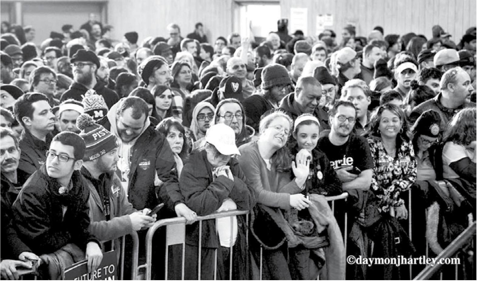
The American people are utilizing the elections to put forth their demands for a government that represents the people.

of our public resources like water and public schools to private corporations.