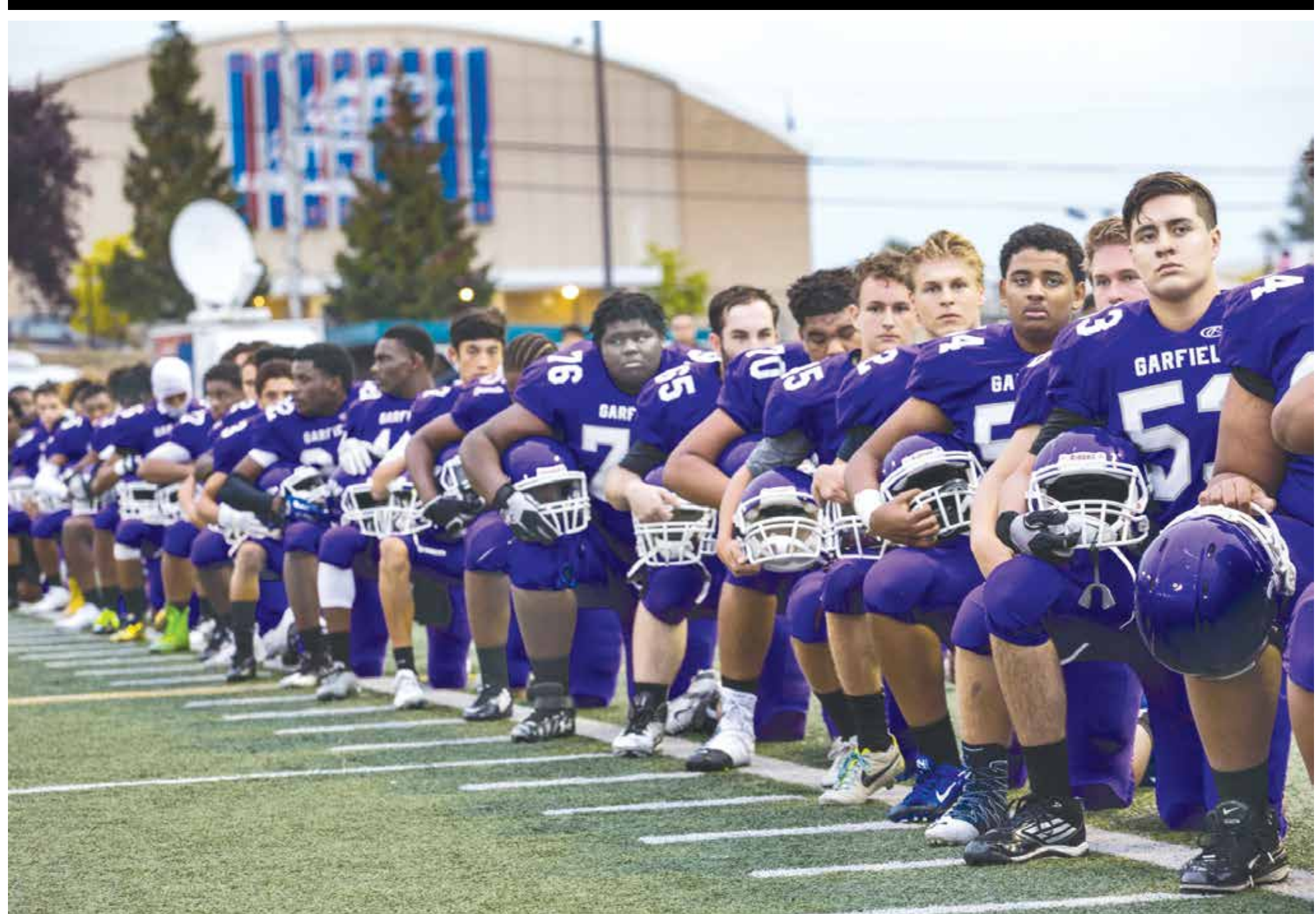
The Garfield Bulldogs, a Seattle high school football team, unites for justice and against killings by the police, joining athletes across the country who are kneeling in protest. (See Page 10.)