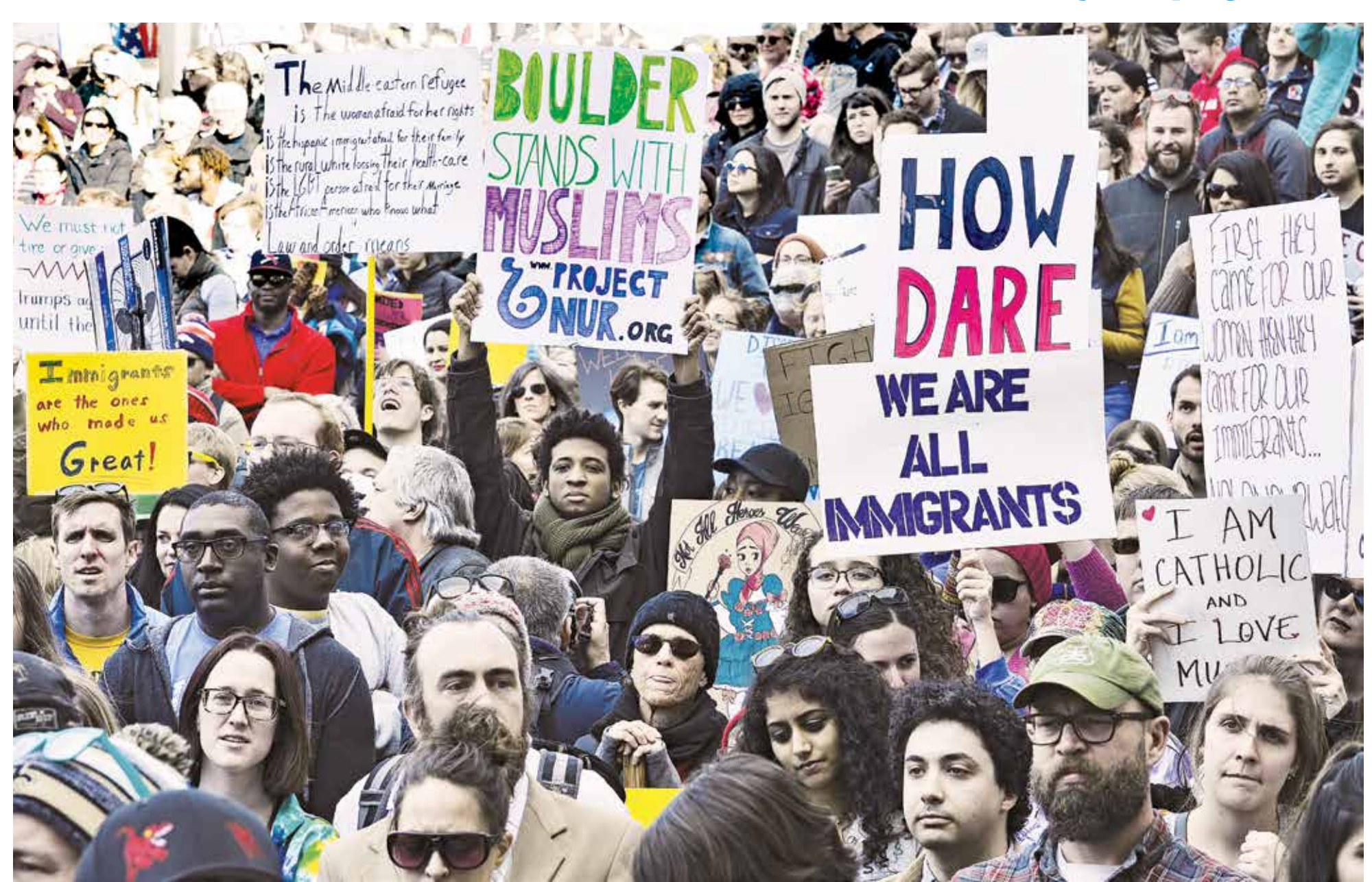
Colorado protesters express their moral outrage at President Trump's executive order attacking refugees and his attack on immigrants. This is one of many protests taking place across the country.

International Women's Day, March 8 – See page 5