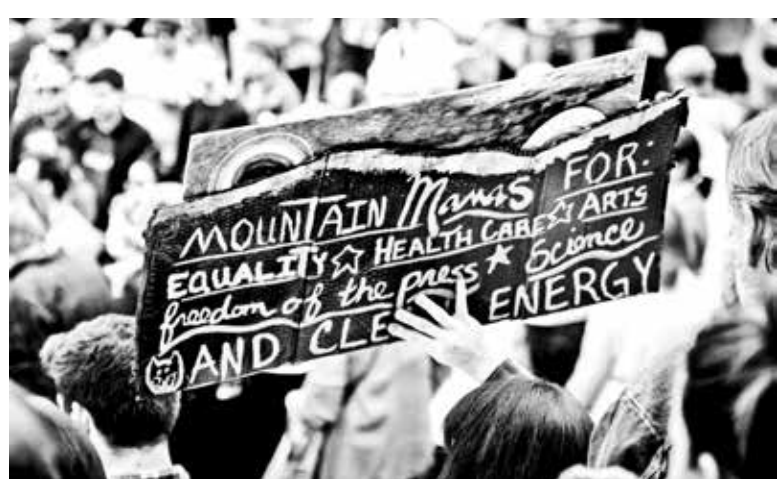
Women's march in Charleston, West Virginia in January.

Right after we left, the community got together and was able to get hooked into another municipality. Then it was discov-