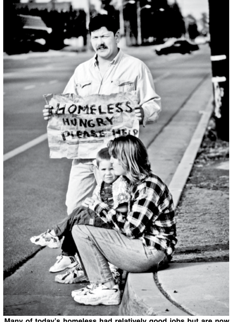
Many of today's homeless had relatively good jobs but are now discarded by companies who produce more profitably with robots and computers. The corporate class cares nothing for those who they can no longer exploit. They are not fit to rule society. Only a cooperative society organized around the needs of the people can save humanity.

Call or email us to find out if there is a People's Tribune discussion group in your area. (800) 691-6888 info@peoplestribune.org