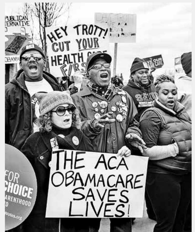
Protest at Congressman Dave Trott's (Republican) office in Troy, MI. People were demanding a town hall meeting so they could voice their opposition to repealing Obamacare. Instead, Trott took a trip to India.