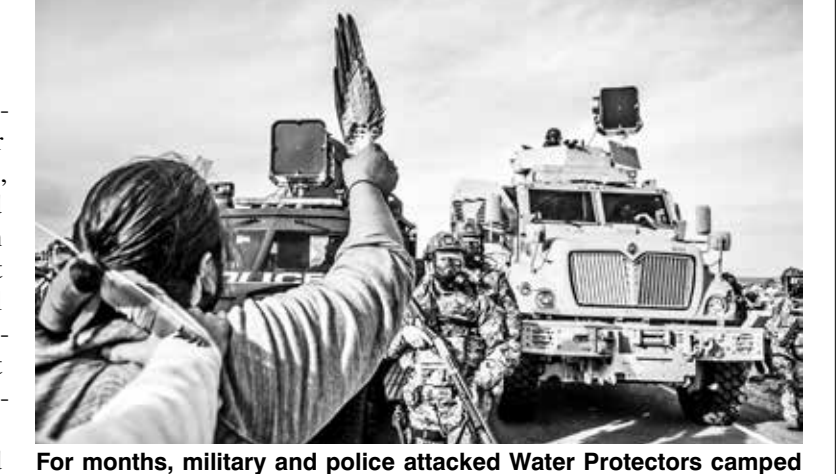
For months, military and police attacked Water Protectors camped to stop the construction of the Dakota Access Pipeline. Tens of thousands of people came to Standing Rock to lend their support. Although the largest camp has now been removed, the struggle continues against the corporations that destroy our water and land.

after their return from the camps have discovered Rozol<sup>®</sup> and other chemicals in their blood stream and in hair samples and have reported this to the UN.