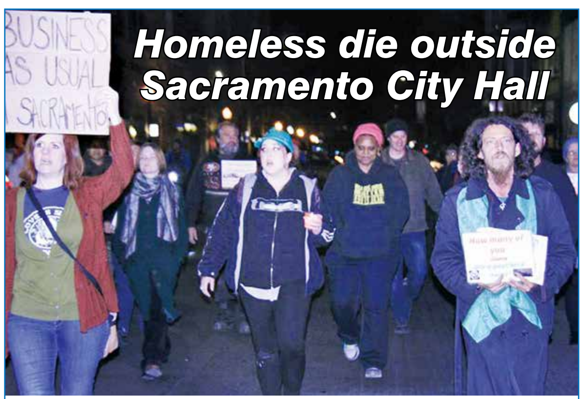
People march to protest the cruel deaths of two homeless men who died at the entrance to Sacramento City Hall as they huddled without blankets. Homeless people seek cover under the building's overhang to escape the cold. According to estimates, on average one homeless person dies each week in this region. Is this the kind of society we want? The government owns plenty of vacant homes. We must force them to recognize the human right to housing and act on it.

lot where everybody could livewith house rules and if everyone cleaned up after themselves. We deserve a chance.