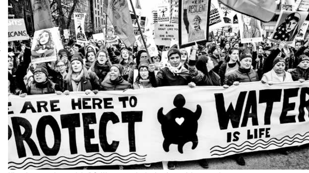
Historic women's march in DC. Women are in the forefront of the struggle to protect our water.

"Women are the backbone of our communities, whether it be in rural country homes or in the inner cities homes. Women are often the ones to stand up and protect their air, water and land while recognizing that they are protecting the future of all children, not only theirs.