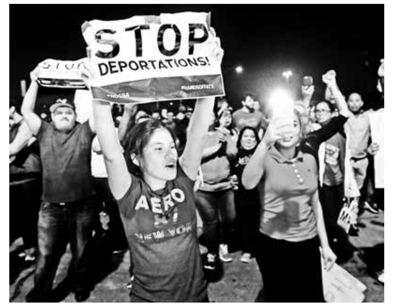
Rally in support of immigrants in Austin, Texas. The attack on immigrants is the opening gun to attack us all.