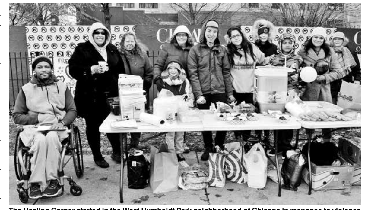
The Healing Corner started in the West Humboldt Park neighborhood of Chicago in response to violence in the community. It offers an alternative to police force in their neighborhood.

The most immediate solution we have available is to actually begin rebuilding relationships and trust between the police and the community, so that when violent