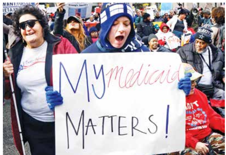
Philadelphia protesters, many of whom are disabled, fight to save Medicaid, a program that serves and saves the lives of millions of low-income people.

Today Medicaid covers 74 million Americans. Surpassing even Medicare, it is the largest single insurance in the U.S. Over 11 million people with incomes at or below 133% of poverty account for more than half of the enrollment in the ACA. Trump's 2018 budget proposes to cut Health and Human Services by 16%. HHS Secretary Price's tremendous regulatory powers already encouraged governors to impose work requirements for Medicaid recipients and dilute 'essential benefits' like emergency room coverage and maternity care. These changes threaten everyone's fragile health security, especially those