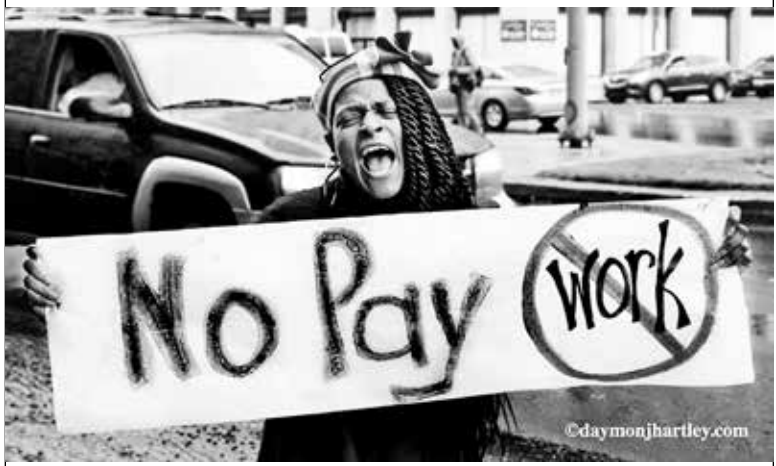
Detroit teachers refused to report for work in a sick-out in 2016 over the announcement of insufficient funds to continue paying them what they were owed. "The school system only spends about $7,000 per pupil and half of that goes to debt service so this protest is about the kids," said a teacher who after six years makes less than when he started.