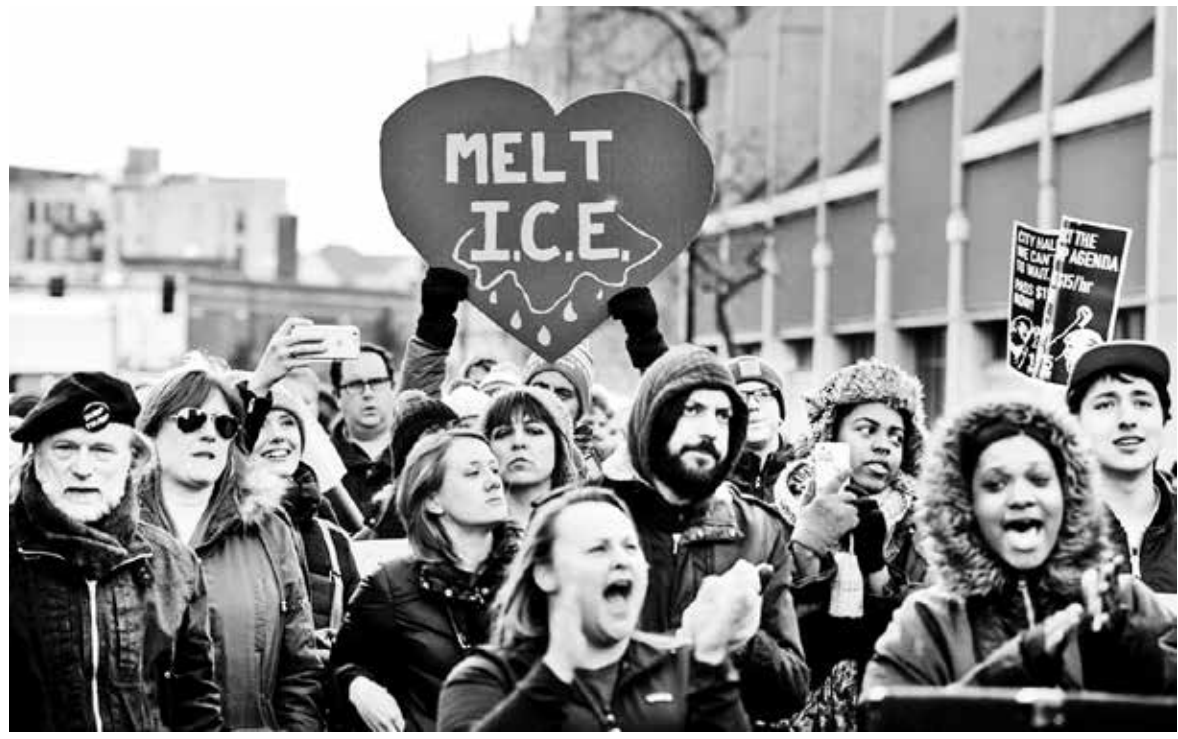
Signs in support of immigrants are appearing at protests across the country. ICE is the government agency that is rounding up immigrants. Immigrants are unjustly blamed for the joblessness that is systemic to an economic system based on providing billions of dollars for the owning class and

In the 2012-13 school lic college campuses; 25 have year, 51% of students from pre-