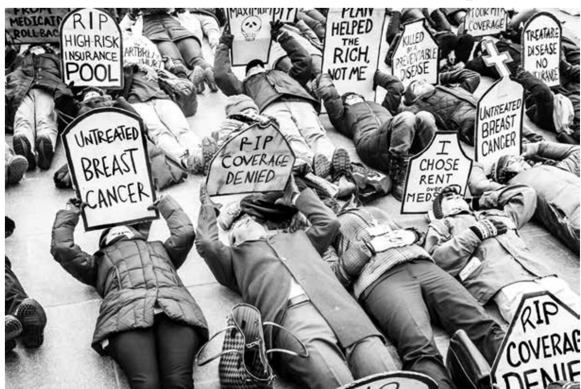
Rally and Die-In in defense of the Affordable Care Act, (Obamacare) in New York City after the proposed new healthcare bill to gut the ACA was released, putting many at serious health risks, even death.

Whether under Democrats or Republicans, it's prosperity for the corporations, and cutbacks and endless war for the rest of us. Why? Because for growing millions of us, our labor is no longer needed in an economy where computers