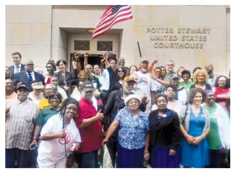
People at the Federal Court in Cincinnati, Ohio, where a challenge to Michigan's Emergency Management (corporate dictator) law was raised to the federal level. The law allowed for Flint's poisoning.