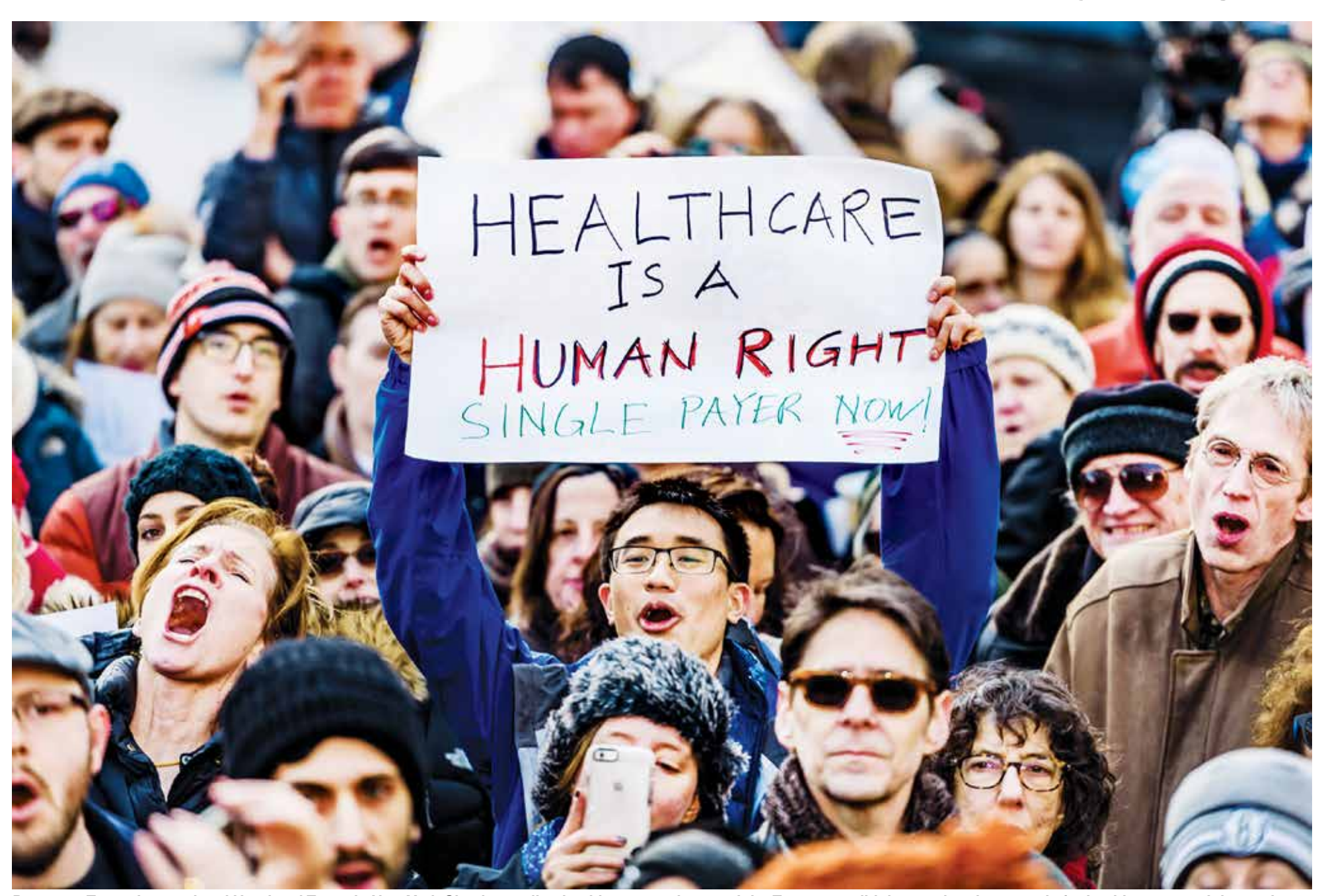
Protest at Trump International Hotel and Tower in New York City demanding healthcare as a human right. Trumpcare didn't pass, but the struggle for healthcare as a right continues.

Earth Day and March for Science Pages 2, 9, 11