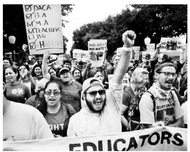
Protesters gather at the state capitol in Austin, Texas in June to protest the anti-immigrant Senate Bill 4.