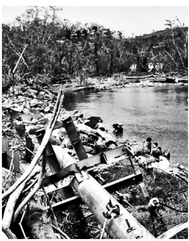
Families wash their clothes in a stream in Puerto Rico.

Three weeks after Hurricane María hit, the overwhelming majority of Puerto Ricans continue without electricity and running water, without access to telephone service or the internet. Those who have seen their power restored primarily live in the San Juan metropolitan region. Most residents are surviving on tiny rations of food and water and are waiting for hours in lines for gas to run generators and vehicles. Reports of an emerging public health crisis are on the rise as people die from diseases related to drinking river water polluted with feces, dead animals and the like.