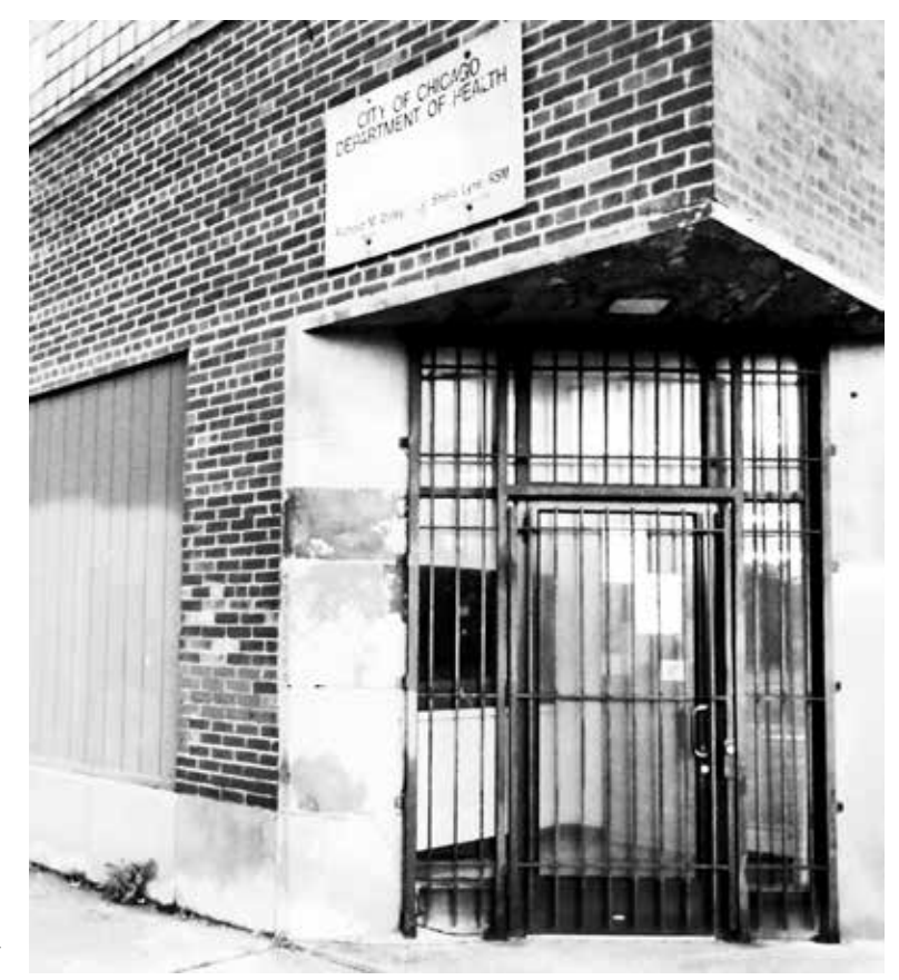
Boarded up mental health treatment center in Chicago.

Right now, if a homeless person is shouting in the middle of the street at the invisible voices in his head, he is likely to end up in jail where he is re-traumatized—and then sent back to the streets. We need to do better.