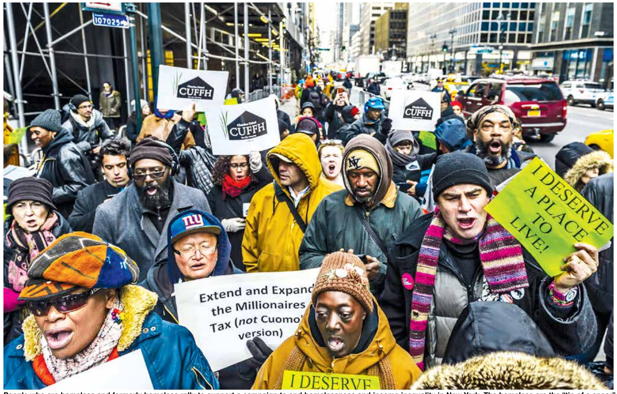
People who are homeless and formerly homeless rally to support a campaign to end homelessness and income inequality in New York. The homeless are the "tip of a spear" of the national movement for housing as a right.