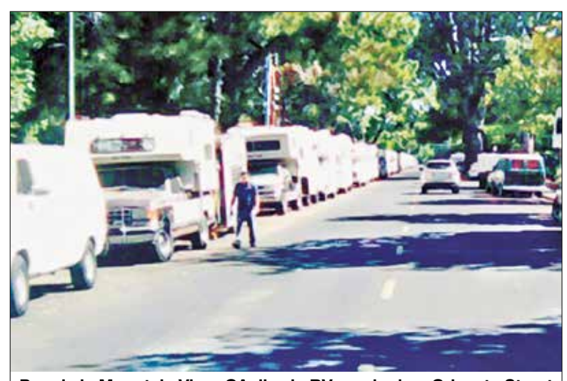
People in Mountain View, CA, live in RVs parked on Crisanto Street for as far as the eye can see.

SM: What we are doing is inviting homeless groups and organizations to 'get on the mule train': join together, join the Poor People's Campaign, have educationals. Education is the key. I believe in civil disobedience, taking over abandoned property. People who have nothing are so inundated and just trying to survive, and winter is coming. We get burned out. I tell people, come on, let's talk together, use the media we have in our hands. Through education, people become empowered. We need to stick together. Try to make it to a meeting. We'll pick you up. We need another National Union of the Homeless, share its history. We have to understand what we're up against. People are looking for something, and the time is so key and ripe.