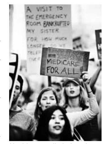
Healthcare rally in Los Angeles, CA.

While these budget resolutions are just plans and not actual spending bills, the resolutions, the executive orders, and the tax cut plan show where things are headed. The government will abandon us and leave us to die without a second thought.