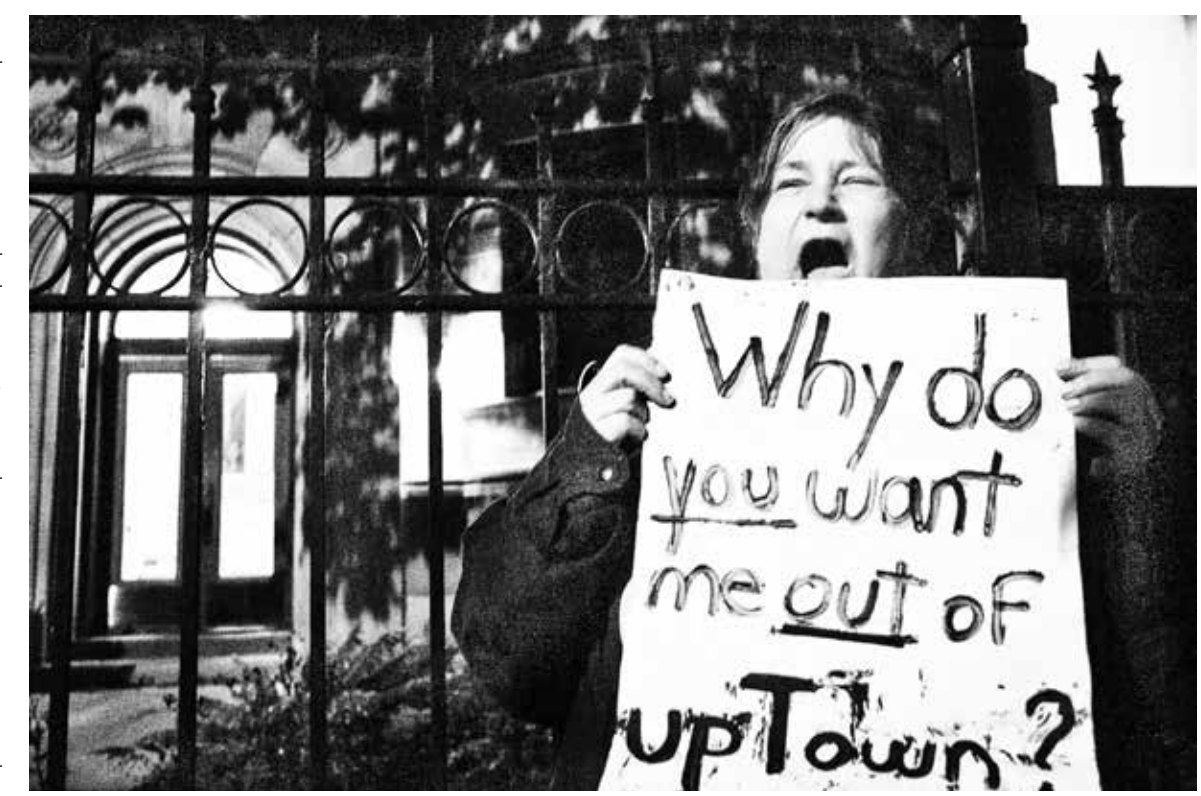
A woman who herself faces homelessness, fights alongside people who live under a viaduct in Chicago's upscale Uptown neighborhood, and who were recently driven out by the City of Chicago. Though scattered, the community remains strong and determined to make it clear that housing is a human right.

Homelessness has been seen in the streets of the United States for over 30 years, since the introduction of the microchip and automation into production replaced human labor and threw millions out of work forever, or into low-wage, part-time or contingent jobs that don't put a roof over one's head. We now have a society with astronomically high corporate profits on the one hand, and growing insecurity, misery, hunger and homelessness on the other. This is a shocking moral failure that could easily be solved by a political and economic system that takes care of people's needs, instead of landlords' and corporate profits. The basic demands of the homeless for homes and for all they need