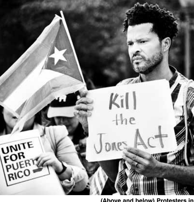
(Above and below) Protesters in Washington, DC demand that the US government help Puerto Rico.

As my college-student stepdaughter leaves the disaster that is Puerto Rico, as will many others, the already-ongoing brain