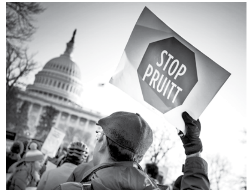
Stop Pruitt rally to oppose his nomination to the Environmental Protection Agency (EPA).

This is not the future that we want. As scientists, we have ded-