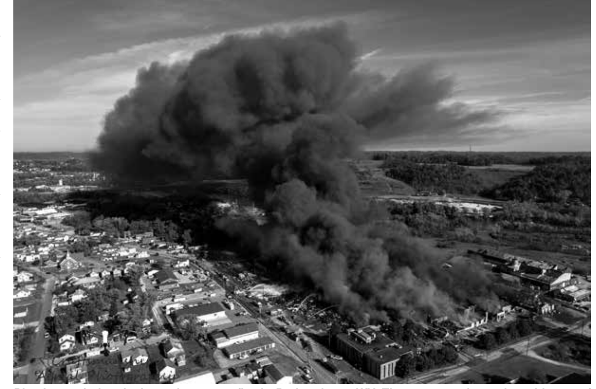
Plastics and chemical warehouse on fire in Parkersburg, WV. The company has a long history of environmental violations that the DEP let slide.

Welcome to our resource extraction colony, where people are less important than the wallets of wealthy CEOs. Welcome to our chemical fire. Welcome to WV, where that black plume of