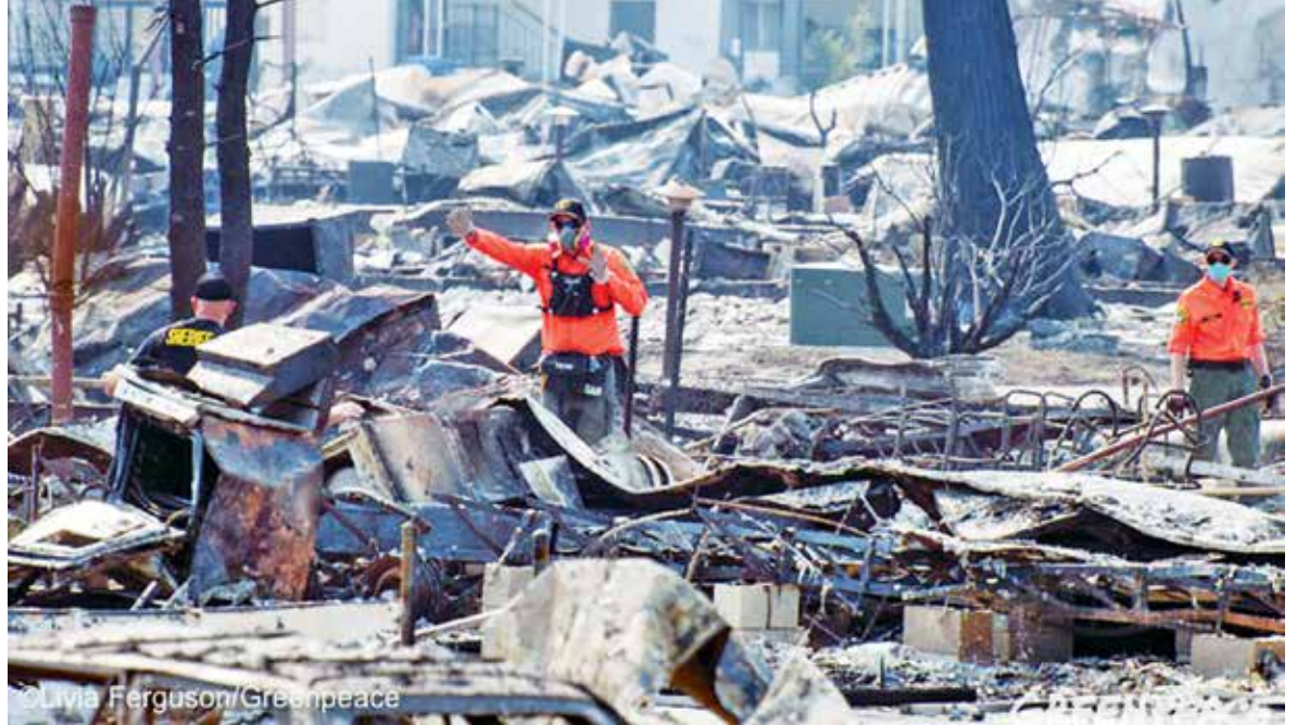
Fires destroyed thousands of buildings and homes in Sonoma County's largest city, Santa Rosa. Burned to the ground was the greater part of a large working-class neighborhood, a mobile-home park, and three expensive hillside developments.

While the governor's proclamation is in effect, landlords who try to raise rents more than 10 percent will be guilty of "rent gouging," a criminal offense with