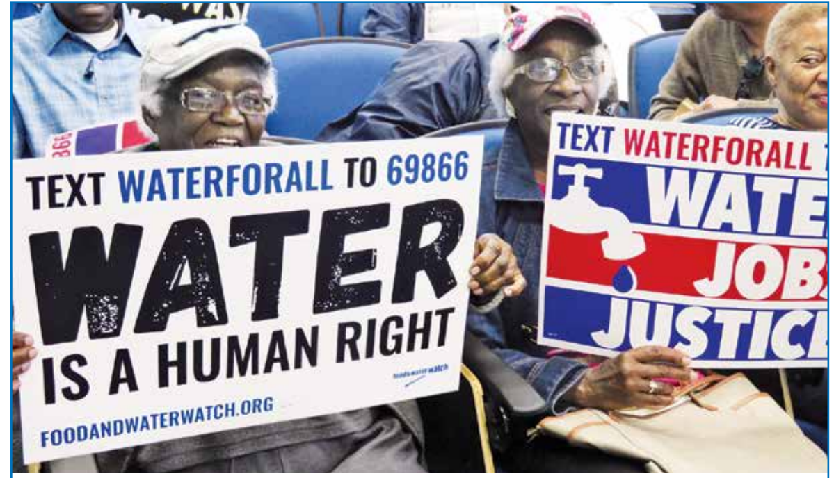
Atlantic City campaign event last year to insure the state can't sell the public's water utility, and the