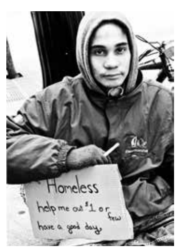
This young man has been on the Chicago streets for five years, sleeping at a homeless shelter.

Basing ourselves in the long history for justice and on the Universal Declaration of Human Rights of 1948, we announce our plan to build citywide organizations in Chicago around the following fivepoint basic agenda. These five points are not meant to fully represent all our areas of concern, but they serve as a unifying beginning to what will be a growing agenda and list of demands by the people of Chicago. We welcome participation in this summer's Chicago Poor People's Conference by any and everyone who agrees with the five-point agenda.