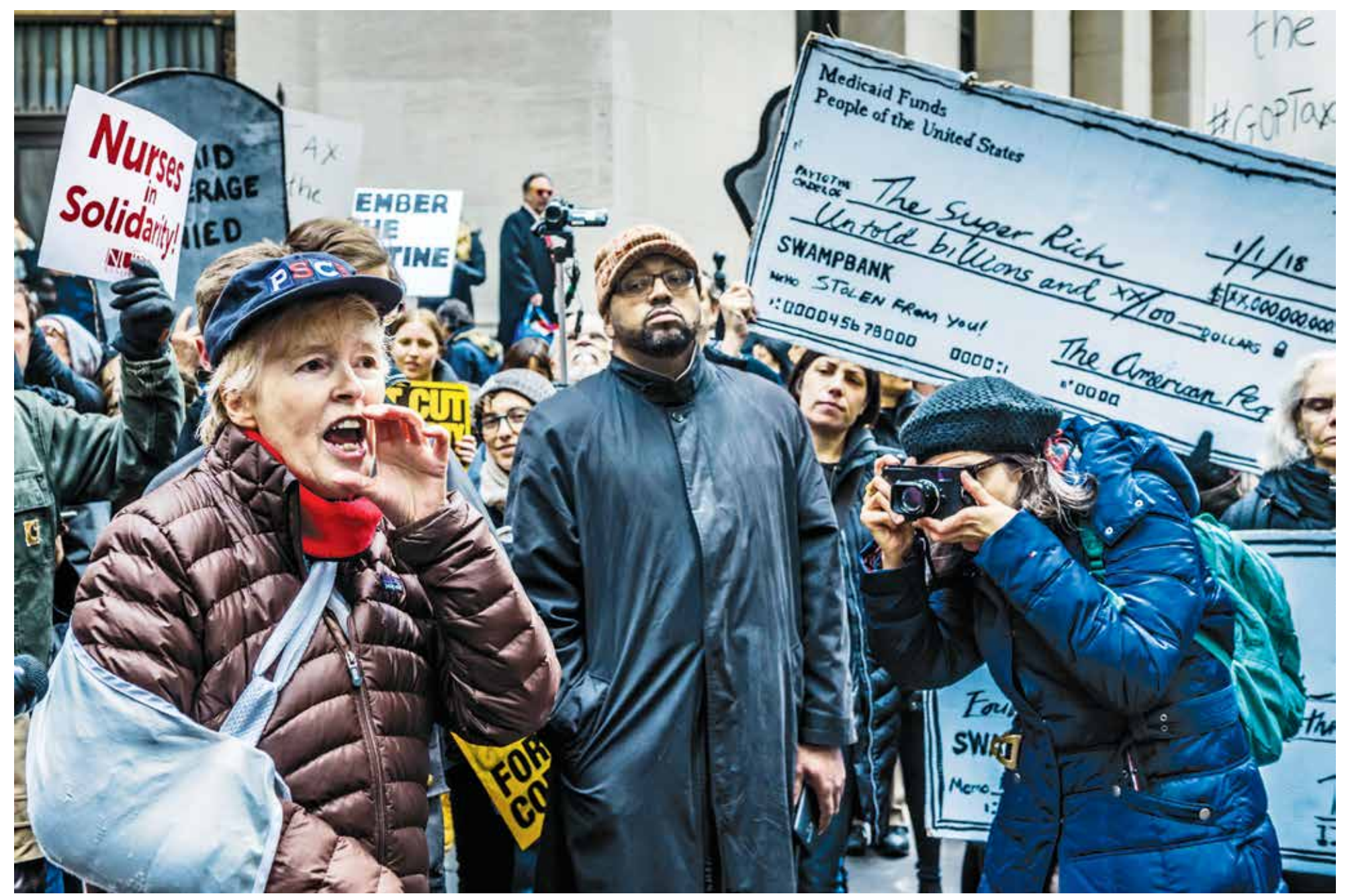
People outside the New York Stock Exchange protesting the tax bill that handed trillions of dollars to the rich, chanting "Kill the bill, don't kill us!"