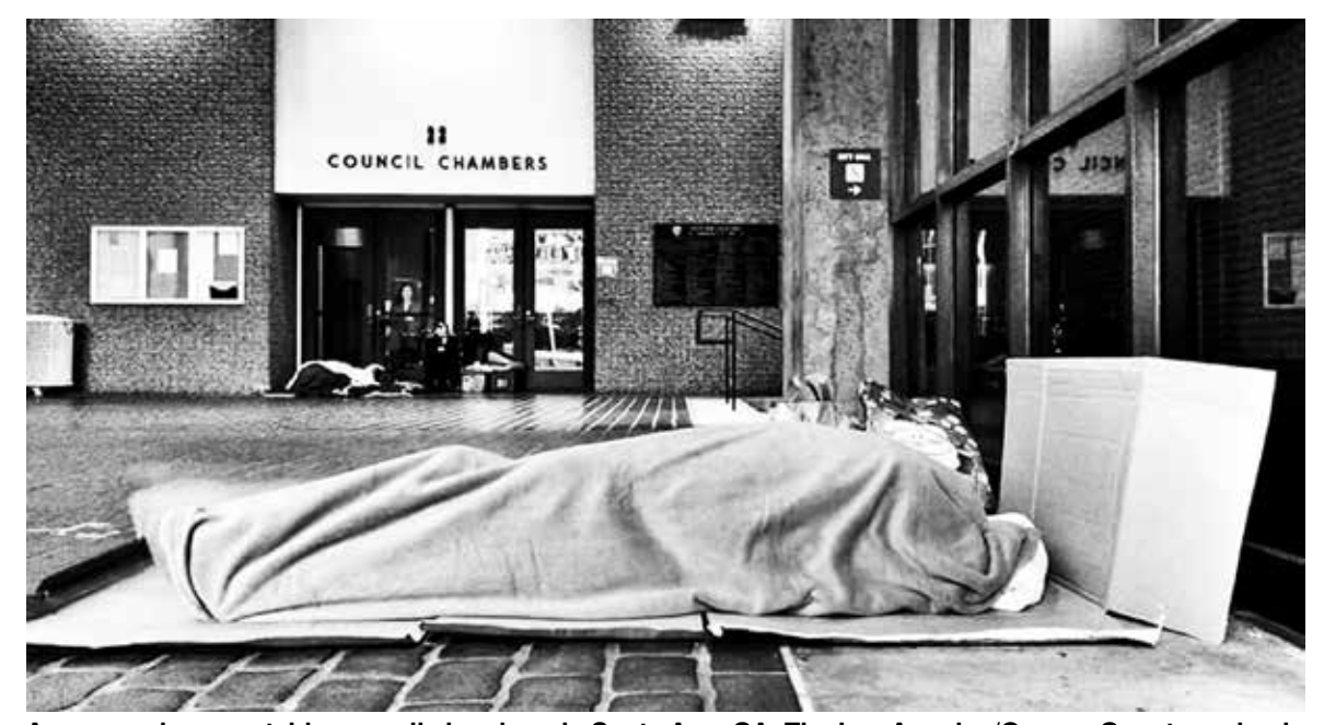
A person sleeps outside council chambers in Santa Ana, CA. The Los Angeles/Orange County region is experiencing a huge increase in homelessness.

Only the American people can solve this. As automation eliminates more and more human labor from the workplace, the crisis can only grow. We have to act. As stated in the People's Tribune editorial on page 2, "The government should take foreclosed-on homes back from the banks that fraudulently stole them, and give them to those without shelter." This is a step toward a whole new society where everyone's life has meaning.