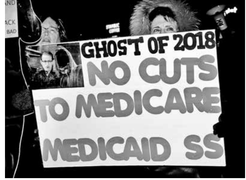
Protesting the Federal Tax Plan in Palatine, IL. The bill gives multitrillion dollar tax cuts to the rich and promised cuts to Medicare, Medicaid and even social security to pay for their tax give-away.

People are fearful and angry. Only 12 percent of American adults want to see Medicaid spending cut, and four in 10