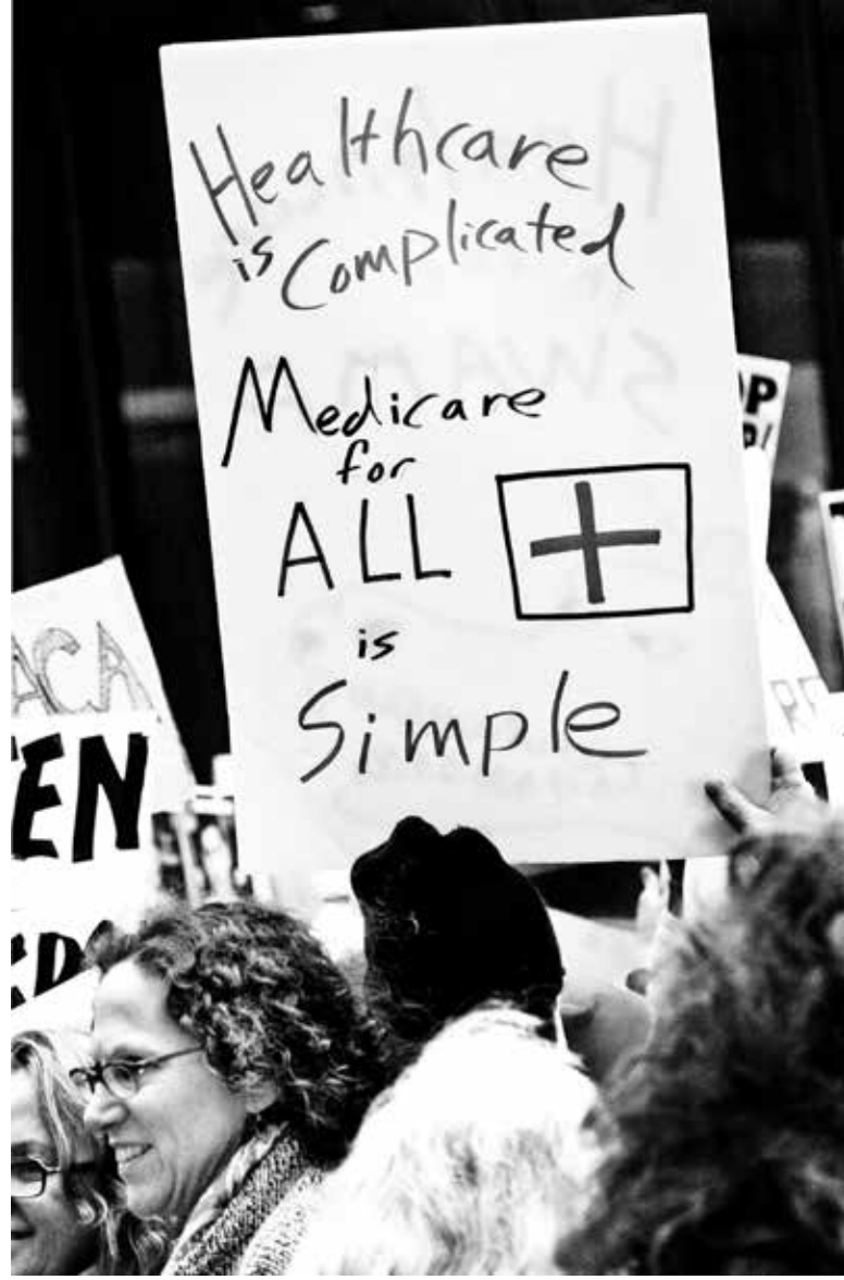
Rally for healthcare for all in Chicago. Creating a national singlepayer health plan (Medicare for All) is the next step toward beginning to solve the health care crisis.

Building an effective movement for National Improved Medicare for All means understanding the realities of the challenges we face. The current political system will not put NIMA 'on the table' unless a popular movement forces it there. And when it is 'on the table'. the people will have to fight to advance it.