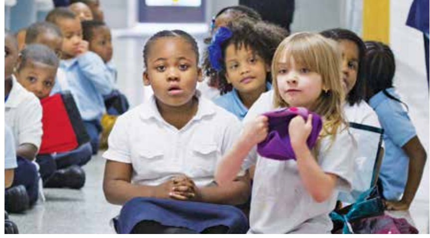
It will take unity across color lines to create a new world. Young people are pointing the way.

By the late 1960s, the area just south of Cabrini became known as "Ghost Town" because of the blocks of empty buildings that once housed businesses and jobs. Now