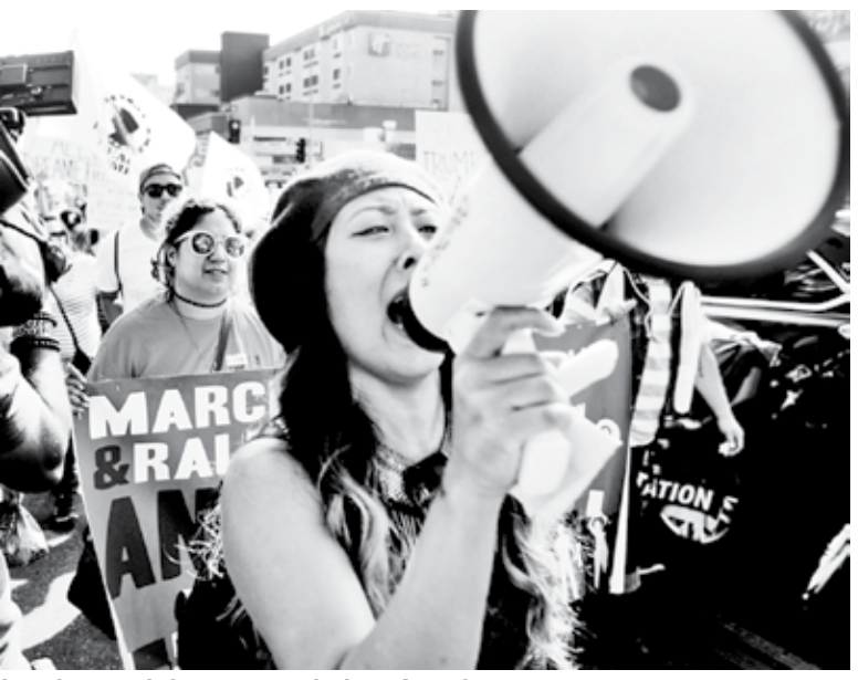
Immigrant rights protest in Los Angeles.

the shadows" strategy of undocu- maru@latinoadvocacy.org; Tania Unzueta, Mijente, 773-387-3186, tania@mijente.net, or Angélica Cházaro, NWDC Resistance, 646-