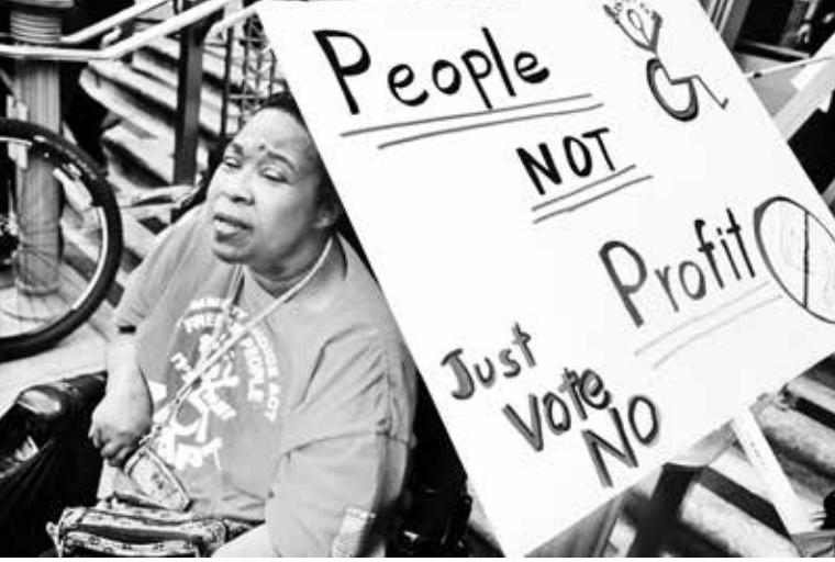
Disabled people protest Medicaid cuts.

Trump's cruel requirements that people work for their Medicaid (already in force in some states) are aimed the other way,