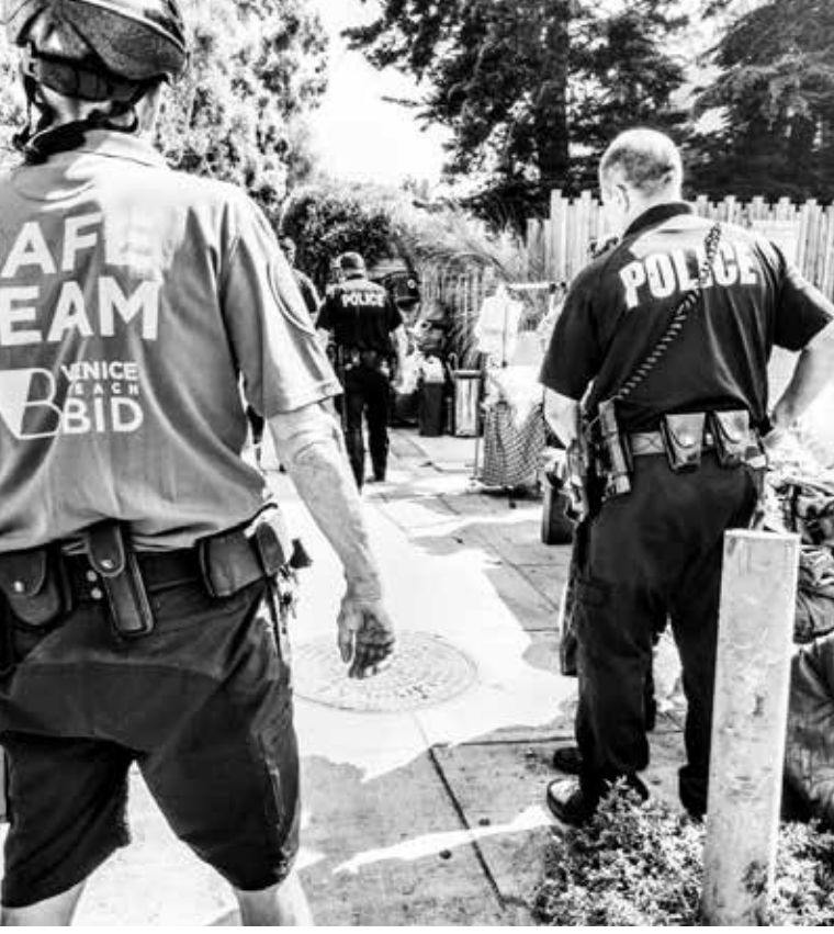
Business Improvement District authorities in Venice, California look on as personal belongings are taken from the homeless.

The Berkeley study states three major findings: 1) BIDs fre-