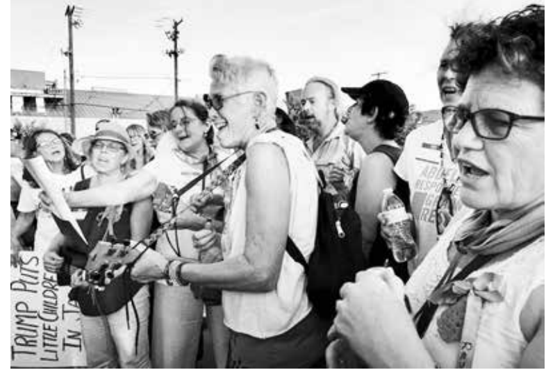
The Grannies paused along the refugee walk to sing, just before meeting the refugees at the respite center.

The next day we filled backpacks that were then delivered to families waiting for permission to cross the Brownsville-Matamoros bridge to enter the country, and to others leaving on buses to stay with sponsors across the country. We saw the wall, visited La Posada Providencia, and border patrol processing centers. The day ended with the grannies convening for a panel discussion with local aid groups about ways we could continue to support their work.