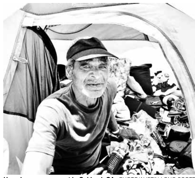
Homeless encampment in Oakland, CA.

This was an important gathering to address housing issues and