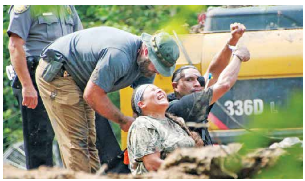
Water protectors are arrested at the site where Energy Transfer Partners is illegally constructing the Bayou Bridge Pipeline which threatens land, water and humanity.