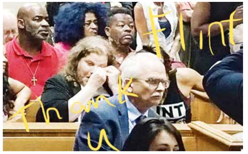
Residents brace to hear the decision to charge DHHS chief. Many were moved to tears upon hearing that he would face trial.