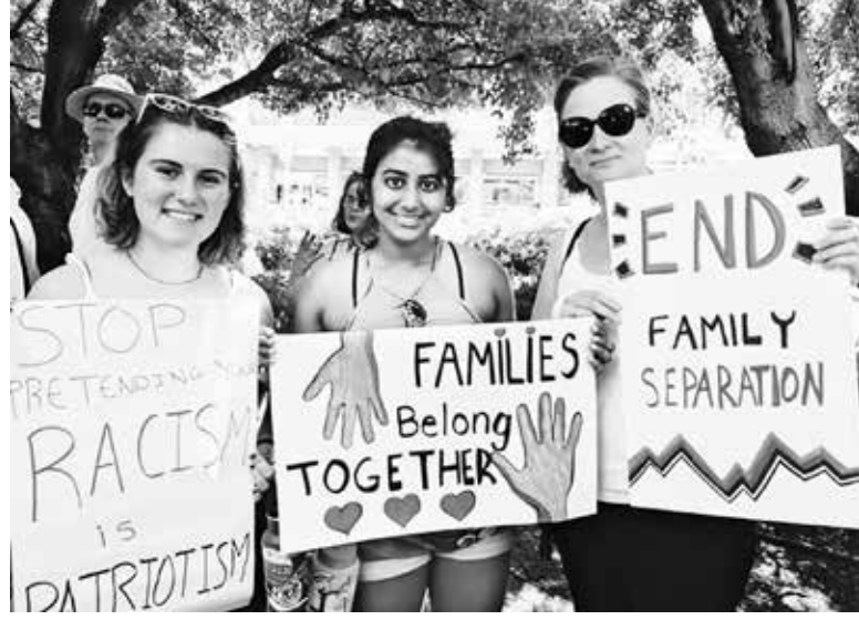
Protest in defense of immigrants.

We have seen this pattern repeated in this country and throughout the world—a country falls into economic crisis, the people demand change, and the ruling elite has to find a scapegoat to blame for the crisis. Keeping the people divided keeps them from challenging the rule of those in power. Eliminating the democratic rights of the immigrants here and globally helps set the stage for fas-