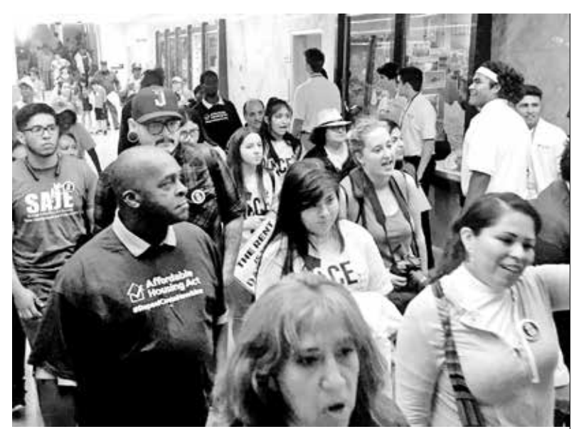
Renters crowd the halls of the State Capitol in Sacramento in June to demand repeal of the anti-rent control Costa Hawkins law. In California, corporate landlords make billions by avoiding rent control, charging massive rent increases, and evicting tenants when they cannot pay. Voters will have a chance to repeal Costa Hawkins if they approve Proposition 10 on the November ballot.