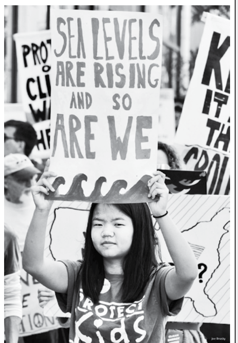
Young people are leaders in the fight for a society that protects the Earth and humanity from corporate destruction. This protest in Milwaukee, WI was part of the national and international Rise for Climate, Jobs and Justice Marches.

Not only does the ruling class have the political power to prevent public ownership, but they're also expanding that political power to privatize all things public and making them the property of this or that corporation. If they can rob the public while the people starve, to enhance their wealth, then "we the people" must have political power so all may eat.