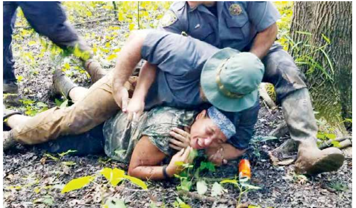
A water protector is tackled to the ground and arrested by Energy Transfer Partner's (ETP) private security. Protesters are being charged with felonies under Louisiana's new anti-protest law.

showed the nation that the people will not accept corporate dictatorship. The people have no choice but to carry on this fight not only in the courts but also in the streets, in every state house and in Con-