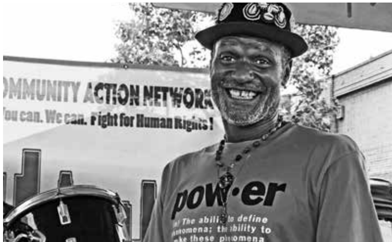
Los Angeles Community Action Network (LA CAN) is a leading force fighting Los Angeles Municipal Code 56.11 that limits the possessions of homeless residents to what fits in a 60 gallon Hefty bag.

In addition, in most cities you also can’t check in to any of the few “homeless shelters” available with more than one trash bag worth of possessions, either. They do have that restriction at MANY of the shelters across the country, and although the City funds