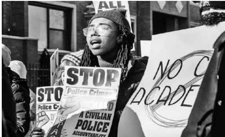
Chicago protest against the lenient sentence given to ex-police officer Jason Van Dyke, who murdered Laquan McDonald.

Everywhere on election day, there were signs of rebellion against the Chicago political "machine" and in favor of a new breed of participatory democracy, one that will allow people of color and the working class to maintain power over institutions that have traditionally been used to repress them, most notably the police.