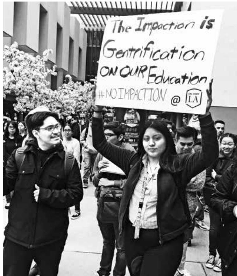
Cal State Los Angeles students hold rally against impactation proposal to cut admissions.

Go to notoimpaction.com to read the statement signed by over 100 faculty and staff and letters from community groups and unions. Video footage of the public meetings at East LA College and at Cal State LA are on YouTube at: impactionhearingelac .