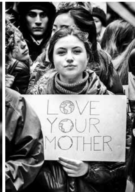
The March 15 th international Youth Climate Strike in Chicago.

development expanded dramatically during Trump’s second year, which experts warn will have terrible consequences for the climate and the planet.