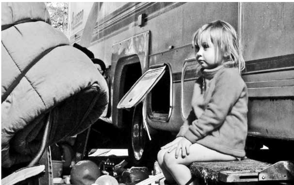
This little girl was living in a camper in Washington state with her brother, parents, grandma, aunt, and two dogs. They had tumbled through the many stages of homelessness ... eviction, doubled-up, motels, and then “camping” in an old RV. These kinds of situations are popping up all over the country as corporate real estate interests and state governments work together to force out those who can’t afford the skyrocketing rents in favor of those who can.