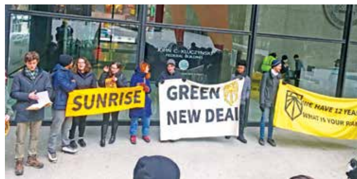
Youth rally outside the Chicago offices of Illinois Senators Durkin and Duckworth to demand support for Green New Deal.