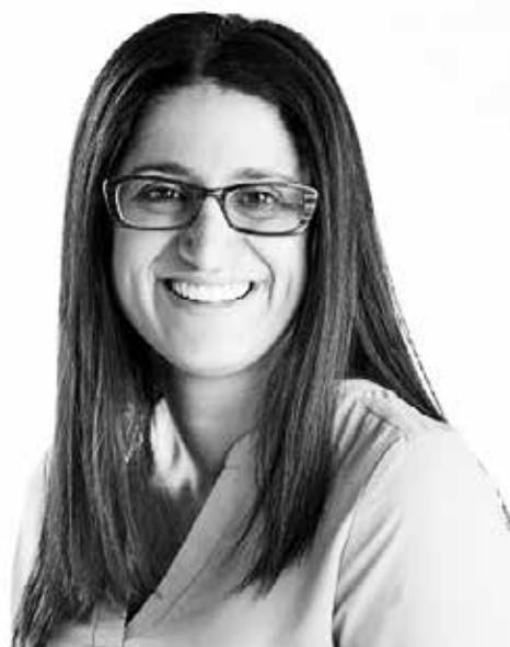
Dr. Mona Hanna Atisha helped expose children's high blood levels in Flint.

So that city that once birthed America's middle class became a city where our children were waking up to a nightmare. In 2015, I was working as a busy pediatrician, in my own bubble. The patients would come to the clinic and ask if the water was okay ... and I was reassuring them that, yeah, how can their water not be okay? This is America, right? This is the richest country in the history of the world. This is the 21st century. That all changed when I heard about the possibility of lead in the water. I had learned ... that [lead] can erode cognition and twist behavior and has these life altering impacts. And science, especially in the last few decades, has taught us that there is no safe level of lead, levels that industry told us was