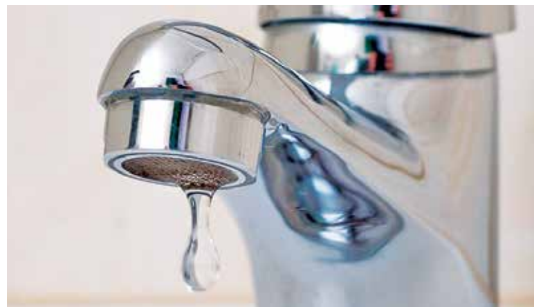
Every human being needs clean affordable water.

Warnings are only issued when a public outcry demands it or when conditions reach a crisis. In Parchment, MI, PFAS ( Per- and polyfluoroalkyl substances ) a dangerous carcinogen, has tested at 26 times the accepted levels. Southwest Michigan is a hot spot for this type of contamination.