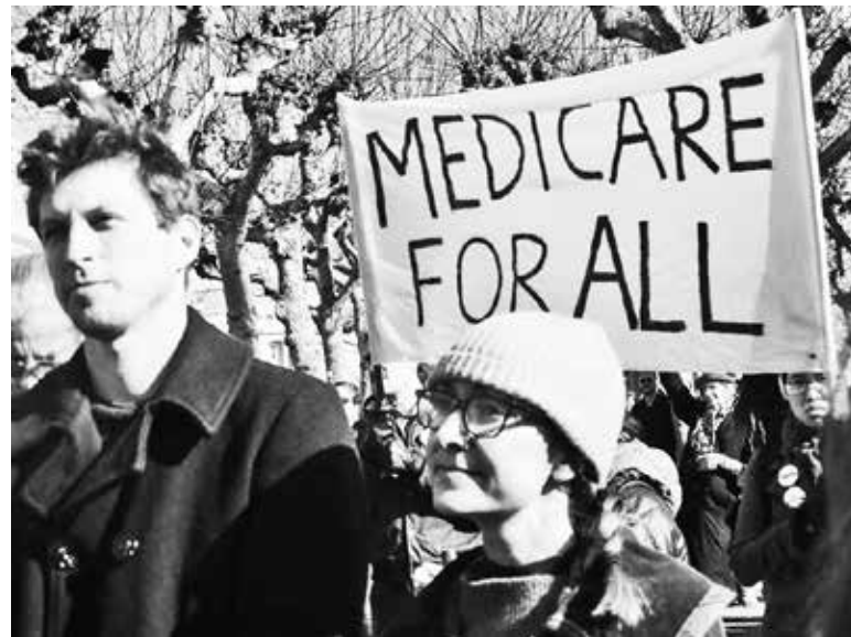
San Francisco, CA. Healthcare protest.

Make no mistake about it. Just as it took a movement for single payer healthcare 30 years to arrive at this point, it will take a far more unified and massive social struggle to realize and implement the scope of this transformative legislative proposal. The bill rightly and repeatedly emphasizes a financial structure aimed at ending our grotesque health disparities from rural health deserts and regional inequalities to income, immigrant, racial and gender-based health inequities, while insuring high quality healthcare for all people in this country. It is recognition of a society flush with an abundance of health resources but a dearth of distribution based on need regardless of circumstance. It challenges the capitalist equation that those that own the resources can dictate the delivery of our healthcare and goes on the offense against Trump's 2020 budget proposal