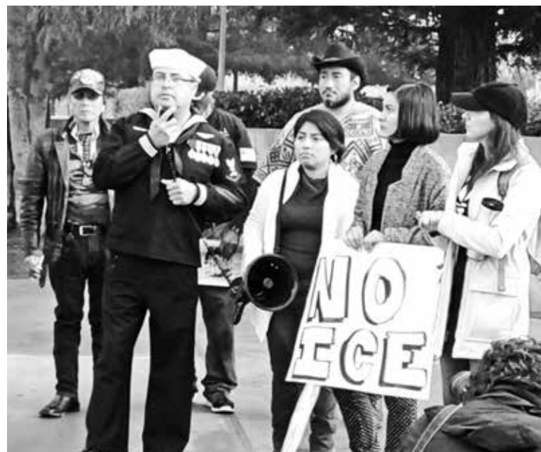
A decorated U.S. naval veteran narrowly avoided deportation on Valentine's Day, 2019.

To order copies of the special joint edition of the paper, visit tribunodelpueblo.org or peopletribune.org , or call 800-691-6888.