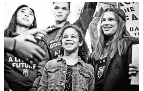
Washington, DC. Youth occupy Representative offices in 2018 to pressure the new Congress for a Green New Deal.

— Stephen Hawking, a leading cosmologist, theoretical physicist, and visionary (1942-2018)