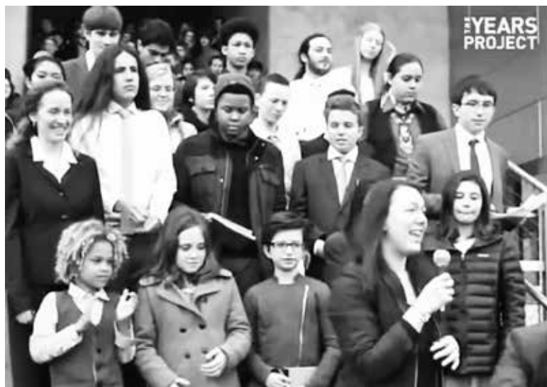
These youth are suing the U.S. government over climate change, arguing that the U.S. government violated the youngest generation’s constitutional rights through its climate policies.