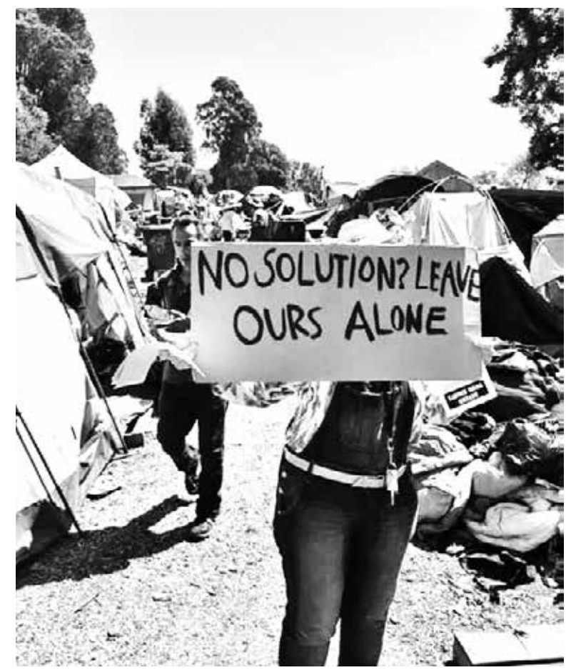
The city of Santa Cruz, CA, one of the most expensive cities in the U.S., evicted upwards of 200 people from their home, calling it an "unsanctioned encampment."

My heart goes out to every person sleeping outside tonight with no tent and no sense of security or community.