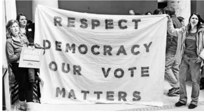
Demonstrators fill Utah's Capitol rotunda to protect Prop 3, the voter approved Medicaid expansion law. Lawmakers defied the voters' will, passing a new bill that restricts coverage.

Join us in Detroit to turn the tide of history together. For our future. For justice. For humanity. Let's #ChangeTheDebate.