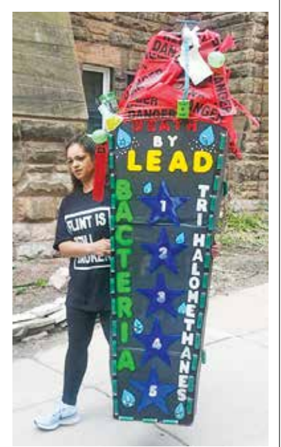
A symbollic coffin commemorating those who died as a result of the Flint water disaster.