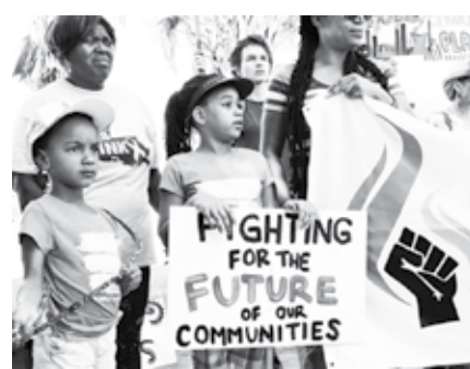
Coalition Against Death Alley march to stop the onslaught of genocidal chemical companies Louisiana.