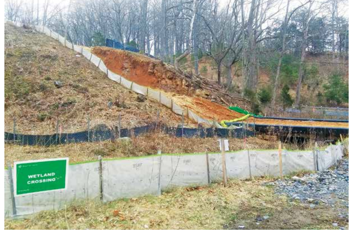
An example of the blatant disregard for forests and wetlands by corporations building the Mountain Valley Pipeline.

Once again, Appalachia will wear the scars of prosperity with nothing to show for it's