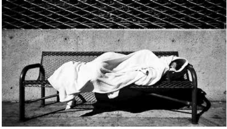
Man sleeps near The Courtyard Transitional Shelter in Santa Ana, CA.

The issues in question are sexual abuse toward female homeless women by male staff members, discriminatory practices based on nationality and race, American Disability Act (ADA) violations by staff and administrators of the shelters. theft or destruction of personal property, including vital documents like birth certificates among others, unsanitary condi-