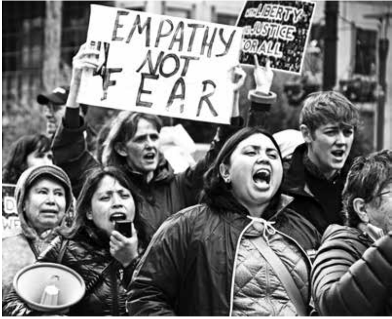
Hundreds gather in Oakland, CA, to protest the sheriff's policies that lead to deportations in 2017.

First of all, it's wrong to treat immigrants or any human being this way. Secondly, HUD Secretary Ben Carson said the new rule is necessary to "make certain our scarce public resources help those