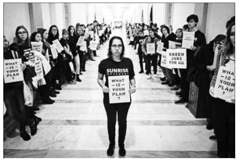
Over 1,000 youths gathered on Capitol Hill to garner Congressional support for a Green New Deal in December, 2018.

"The President and Republicans in Congress are hyping that they're working on a new plan, but they've had nine years to work on replacement of the ACA. That they can pass something new with a majority in both houses of Congress that will have all the benefits of the ACA without any of the flaws, and that it will fit both conservative and liberal ide-