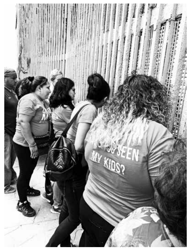
Deported moms fight for justice and human rights.