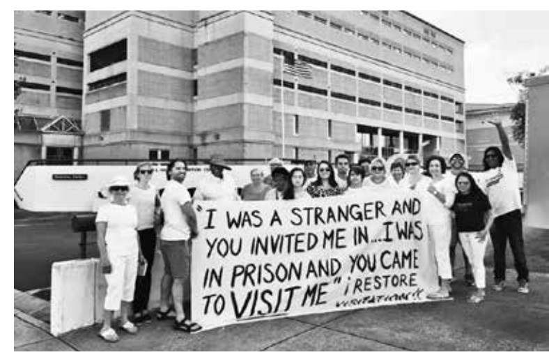
Members of Shutdown Etowah County Detention Center in Gadsden, Alabama, and the Etowah Visitation Project, 2015.

The Etowah Visitation Project is a member group of Freedom for Immigrants, formerly known as Community Initiatives for Visiting Immigrants in Confinement, a national network which visits and monitors approximately 55 immigrant prisons in 23 states. Through visits and/or letters, we connect with immigrants who are being detained in the Etowah County Detention Center while they await immigration hearings or deportations. Our objective is to be there as friends and listeners, open to people of all religious, ethnic and cultural backgrounds. We bear witness to the suffering and to the enormous strength and resilience of character that many of the men possess.