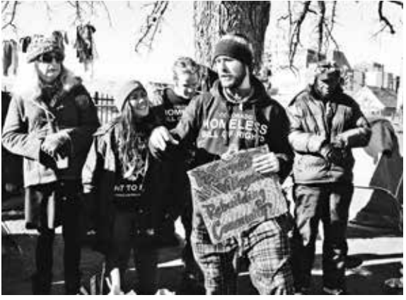
There is a growing nationwide movement for the rights of homeless people to survive and be housed, as seen here in Denver.

"In the richest country in the world, it is simply unacceptable that we have people living in the streets. Today, there are over a half million peo-