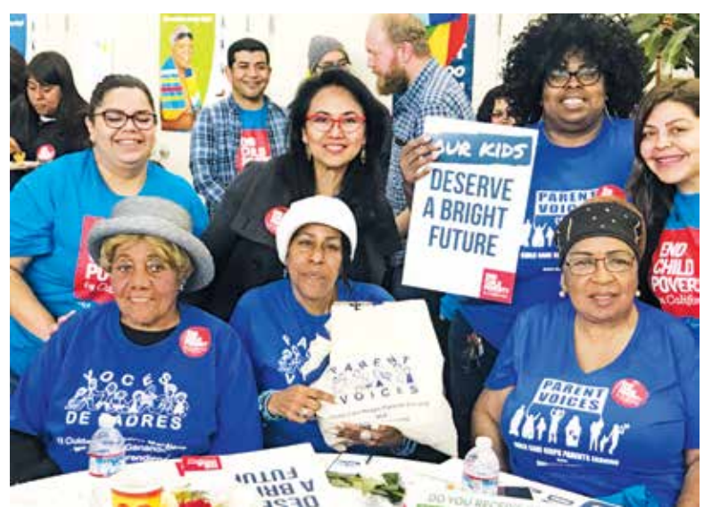
The group Parents Voices fights for their kids' future in Oakland, CA.

Our stories and struggles are interconnected as is our progress and success. I fight for affordable high quality childcare even though I no longer need it because of my child's age. Others fight to house Oakland's homeless, and I'm honored to support their work whenever I can, however I can. Be kind to the people fighting for and with you.