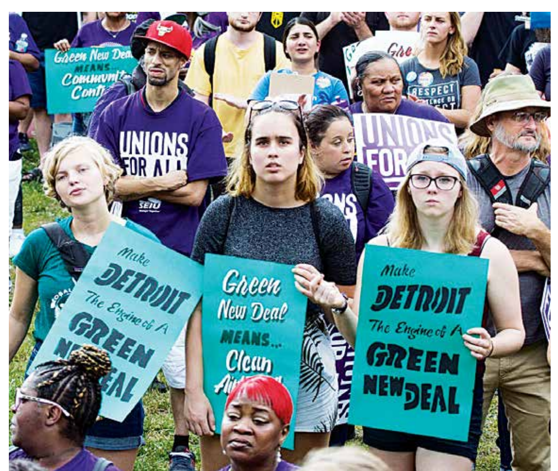
Climate activists in Detroit. Climate change was a major issue at the recent DSA convention in Atlanta.