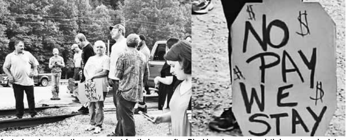
Kentucky miners continue to protest for their pay after Blackjewel, once the sixth largest coal mining company in the country, filed bankruptcy.

don't consider myself a humanitarian because my activism leans more towards militant. I, however, have found myself forced to be the voice of reason when it comes to the topic of fairness of the Blackjewel miners.