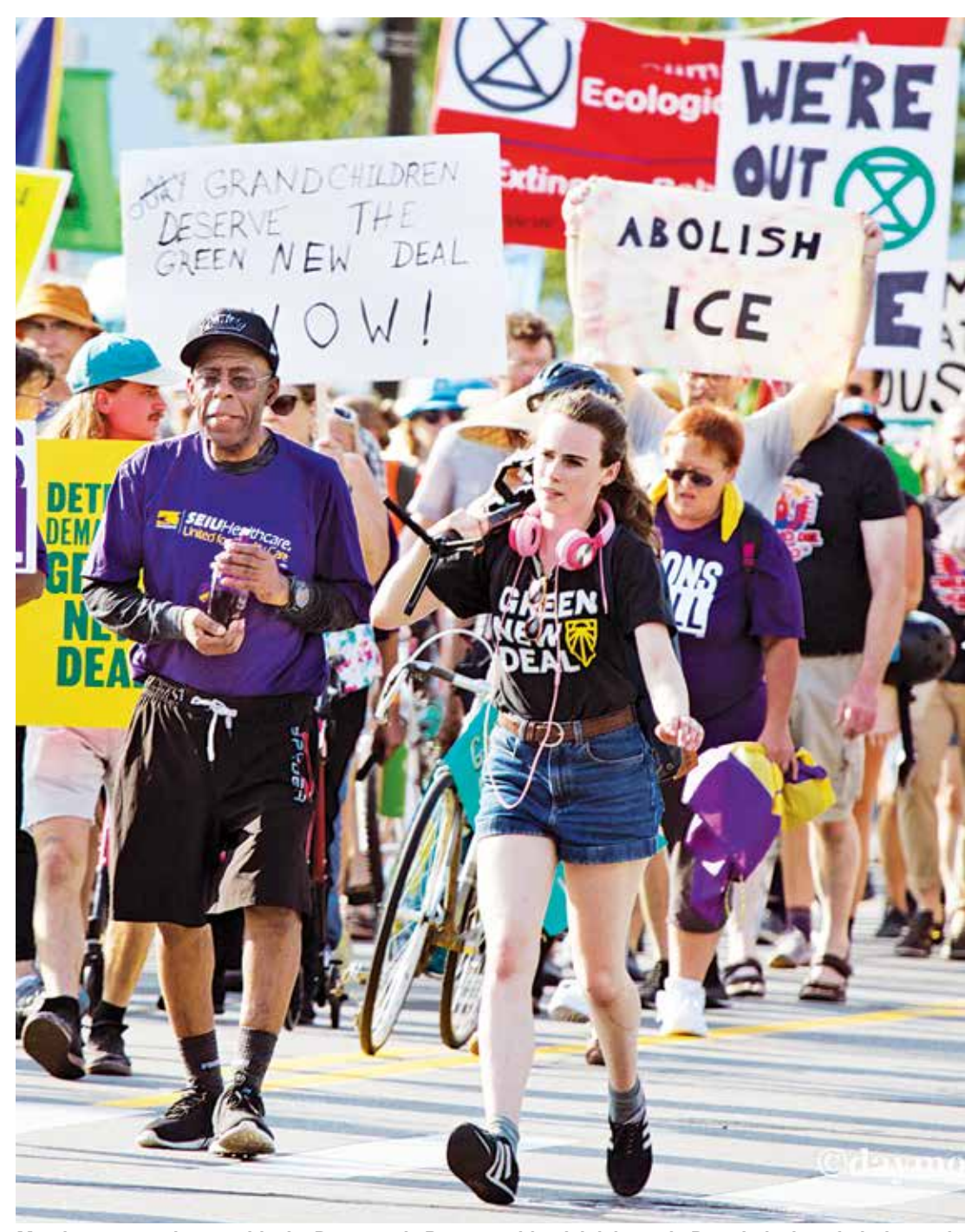
Marchers protesting outside the Democratic Party presidential debates in Detroit declare their demands.