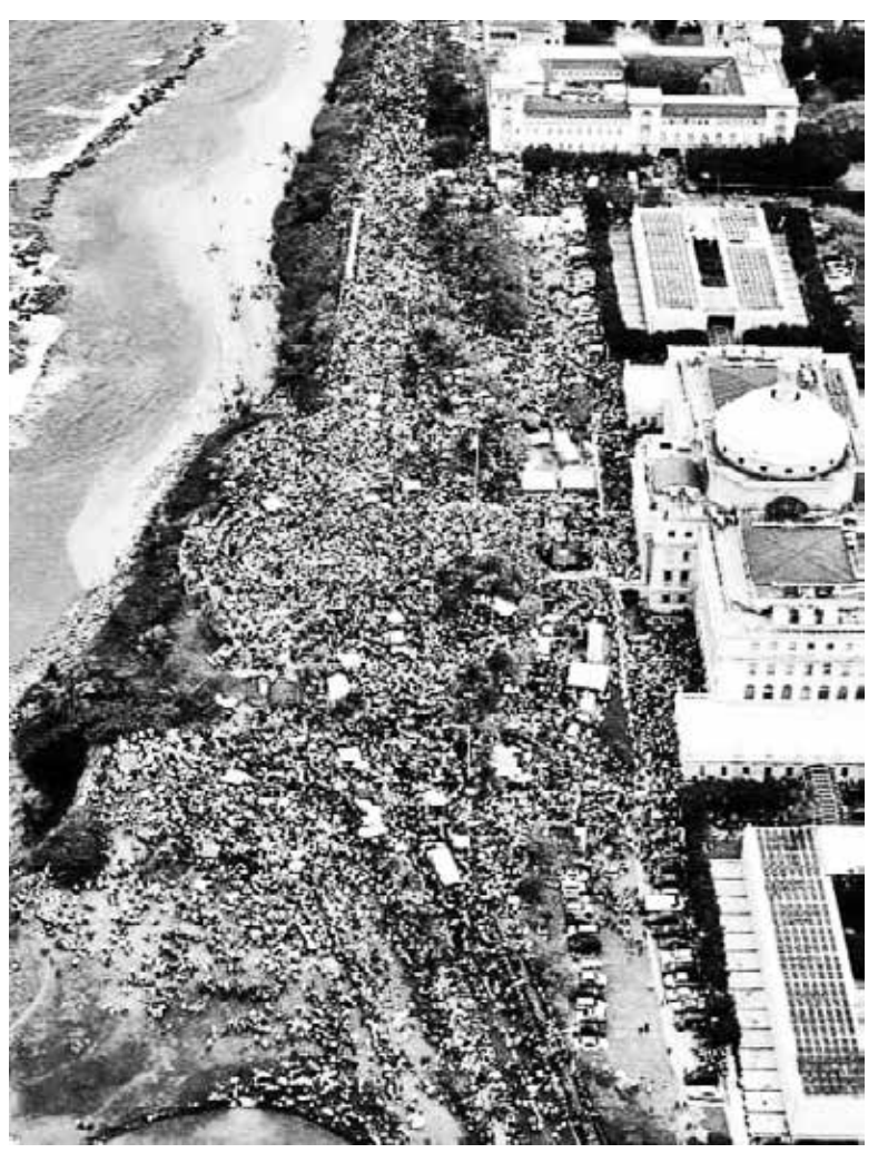
Over a million people, close to a third of Puerto Rico's population, took to the streets and forced the resignation of their governor, Ricardo "Ricky" Roselló Nevarez.

Following the "Renuncia Ricky" uprising, people's assemblies are mushrooming throughout large cities and small towns across the island of Puerto Rico. Small but growing groups of people are challenging the current political parties system and demanding new ways of economic and social participation in an effort to get rid of the corrupt political elites and the exploitative colonial capitalist system that nurtures them. As Agosto suggests, only deepening levels of independent popular organization may avoid the fading of the "Ricky Renuncia" uprising into the dustbin of history.