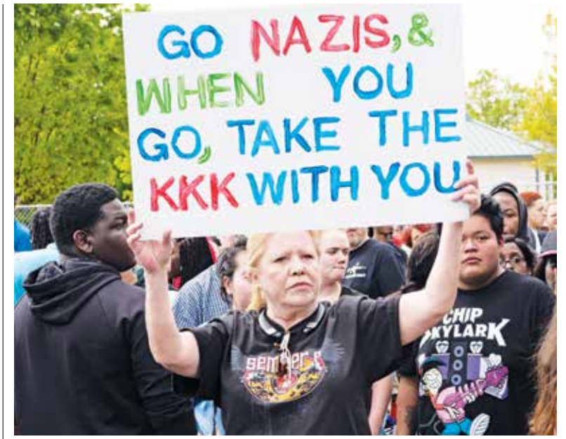
Local townspeople and various groups protest the Nazi presence in a small Georgia town.

That's where your vote comes in. The ruling class political parties are so tightly tied to fascist control by corporate power and money because hoarding essentials like housing and health care for the ruling class works for them. We the people need government that works for us. You show what you need-and build unity with the other millions of people being kicked to the curb by a dying capitalism—by defending democracy, using your right to vote for candidates who fight for your needs. That sends a message. Voting your interests allows us to stay independent of the ruling class drive to make workers servants to corporate power and profits, regardless of the cost to humanity and the planet.