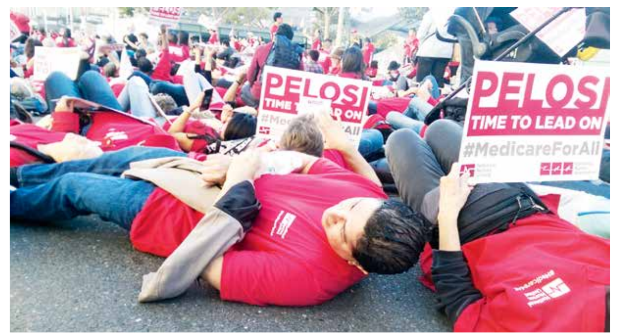
Rally and "die-in" in support of Medicare for All in San Francisco. Thousands of people in the U.S. die each year because they lack health insurance.

Obama Care, the Affordable Care Act, is not a good sys-