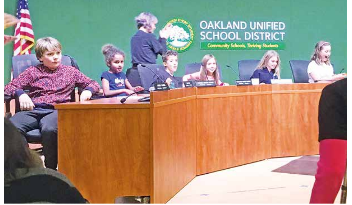
In October, the Oakland School Board called the police on an audience of over 600 people opposed to closing schools. As the protest grew, police beat and arrested parents and teachers. At the following meeting, a 'Peoples School Board' (seen in this photo) took over after officials fled. Children took the officials' seats and spoke against the police attacks.

Oakland has families who have had to change schools three times in the last couple of years due to school closures. The entire community wants to keep every school open. When they protest at school board meetings, board members cut the mic if they think you are not on "their topic." They shop online and look at email, but never, ever respond. Then