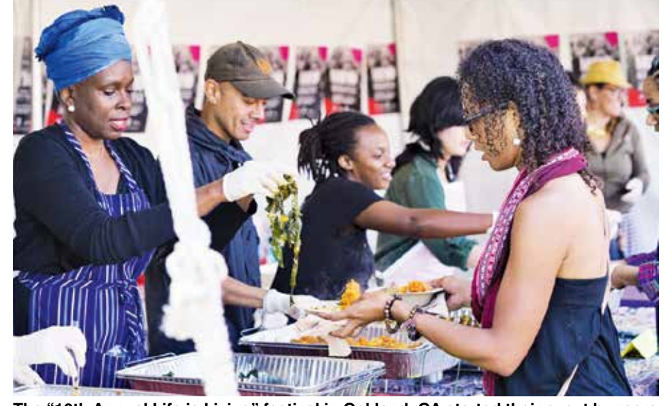
The "10th Annual Life is Living" festival in Oakland, CA started their event by recreating the Black Panther Breakfast program. Volunteers provided free breakfast to anyone who came, no questions asked.

ers with advanced degrees, are suffering, imagine what our students are enduring? Over 84% of students in our district suffer from housing insecurity, including the inability to pay full rent or mortgage for one or more months, the inability to pay utilities, threats of eviction, or having to choose between food and housing. Some student leaders are starting to talk about getting affordable public housing on our community college campus, to meet important basic needs for students and faculty and staff who are struggling.