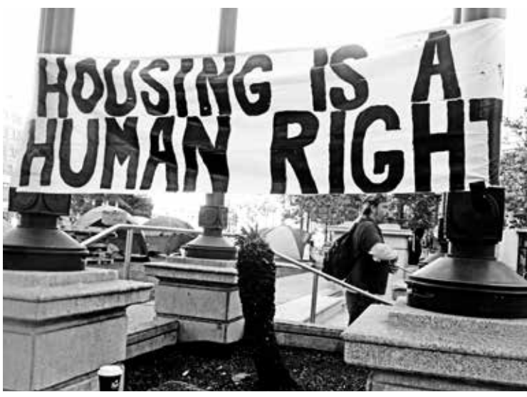
Housing Justice Village protest at Oscar Grant Plaza, Oakland City Hall.

Tomorrow we start a new Village. For all of us who have had our homes bulldozed by the city of Oakland. For all of us who have had our vehicles that we lived in towed by the city of Oakland. For all of us who have our medication, medical equipment, paperwork, family photos, ashes of our loved ones who passed away, work uniforms, laptops, clothes, IDs, EBT cards thrown away in front of our eyes despite our pleas to stop. For all of us who have been left on the side of the road after the city demolishes our curbside communities. For all us who were promised support and help but instead got mistreatment-we come together, we assert our right to housing and our right