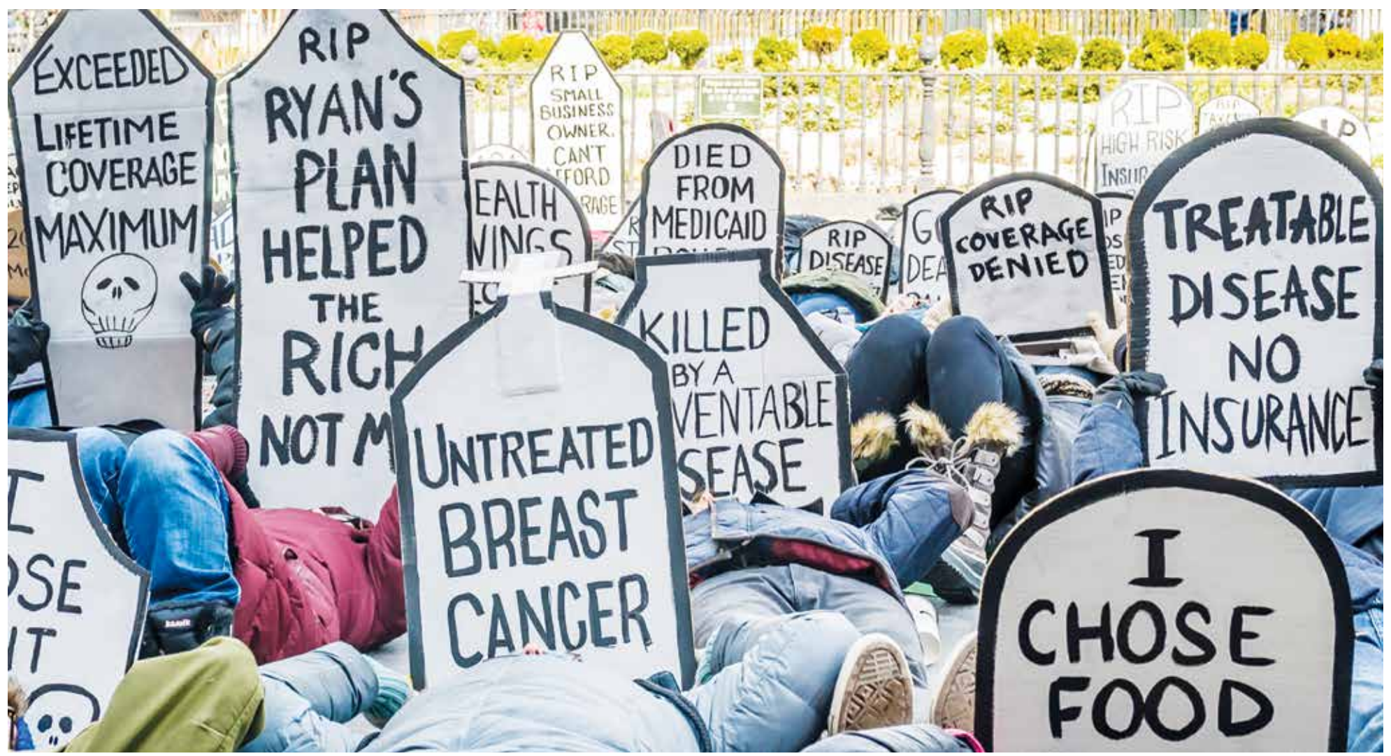
The activist group, #GetOrganizedBK, held a rally and die-in at the Brooklyn Borough Hall steps in 2017 in defense of health care. The movement for universal healthcare has helped put Medicare for All at the forefront of the 2020 Democratic primaries.