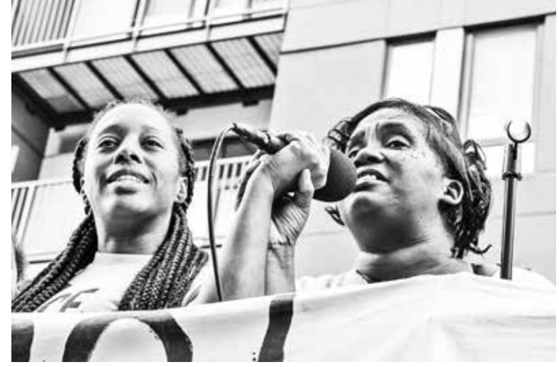
"Moms 4 Housing" announce their takeover of a vacant West Oakland

We are not just speaking for ourselves, but for the 4,000 homeless people in Oakland. Every time a village pops up, they try to destroy it immediately. They ignore people who are totally suffering. The Village creates encampments where there is no suffering, and they want to destroy us. We are speaking for the rights of people who are living like this, who have lost their homes because of gentrification. We are just gonna keep on getting louder and louder, homeless and housed folks together. We aren't gonna leave without a fight.