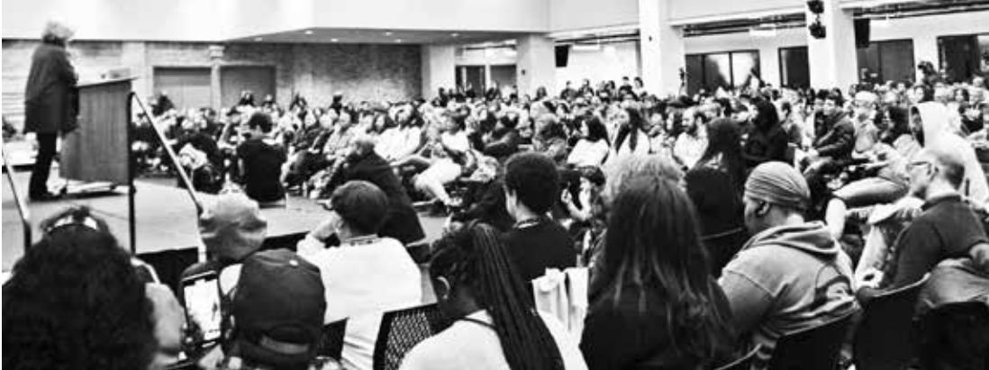
Participants and panelists at the National Alliance Against Racist and Political Repression (NAARPR) conference in Chicago.