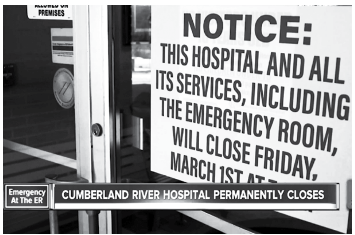
Hospital closures, particularly in rural areas, are another manifestation of denying healthcare for all.

Corporations are now focused on improving automation technology to boost their profits. An assembly line robot doesn't need a pension or health insurance. Large retailers will need less employees for the same reason. Employer-based health insurance may meet the needs