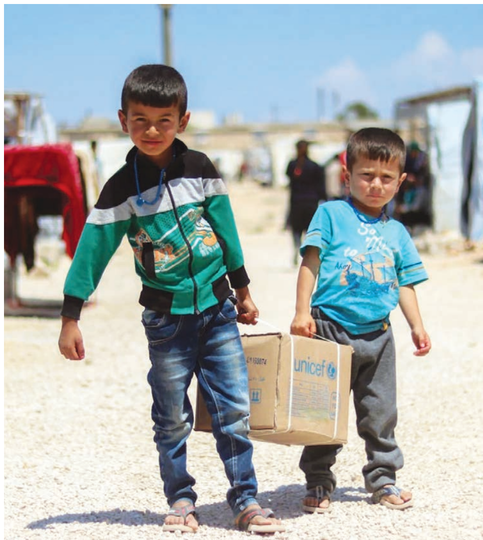
Children at a migrant camp in Syria. Today millions of families are displaced by war and climate.

Food security, clean water, healthy soil, breathable air, and peace, the very things all living beings need to survive, are being decimated by greed for wealth and power. Our dehumanization is in blatant view.