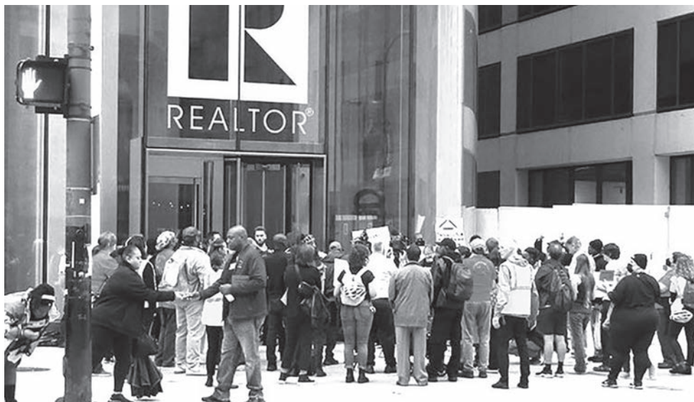
Bring Chicago Home activists rally at Chicago Realtors Assoc. at 430 N. Michigan Ave.

No matter who we are, we all need a home!