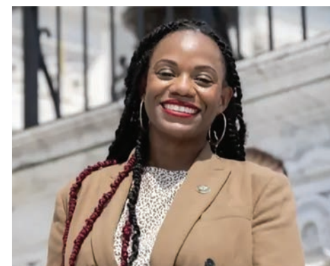
Congresswoman Summer Lee

investment in American families, de-escalation of violence, diplomacy, and humanitarian aid,” Lee said in a press release. Read the full story in the online People’s Tribune at https://bit.ly/3u7SieU .