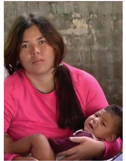
Many migrant families shelter on floors of Chicago police stations.

We need to adapt and start taking care of our new neighbors, and everyone in Chicago who needs help. The cruel austerity imposed upon us has led us to think mostly of taking care of number one. It would be a blessing to take care of one another. It's for all of us; what's good for you is good for me. The migrants are not taking away from us. In fact, they offer us an opportunity to regain the spirit of helping one another.