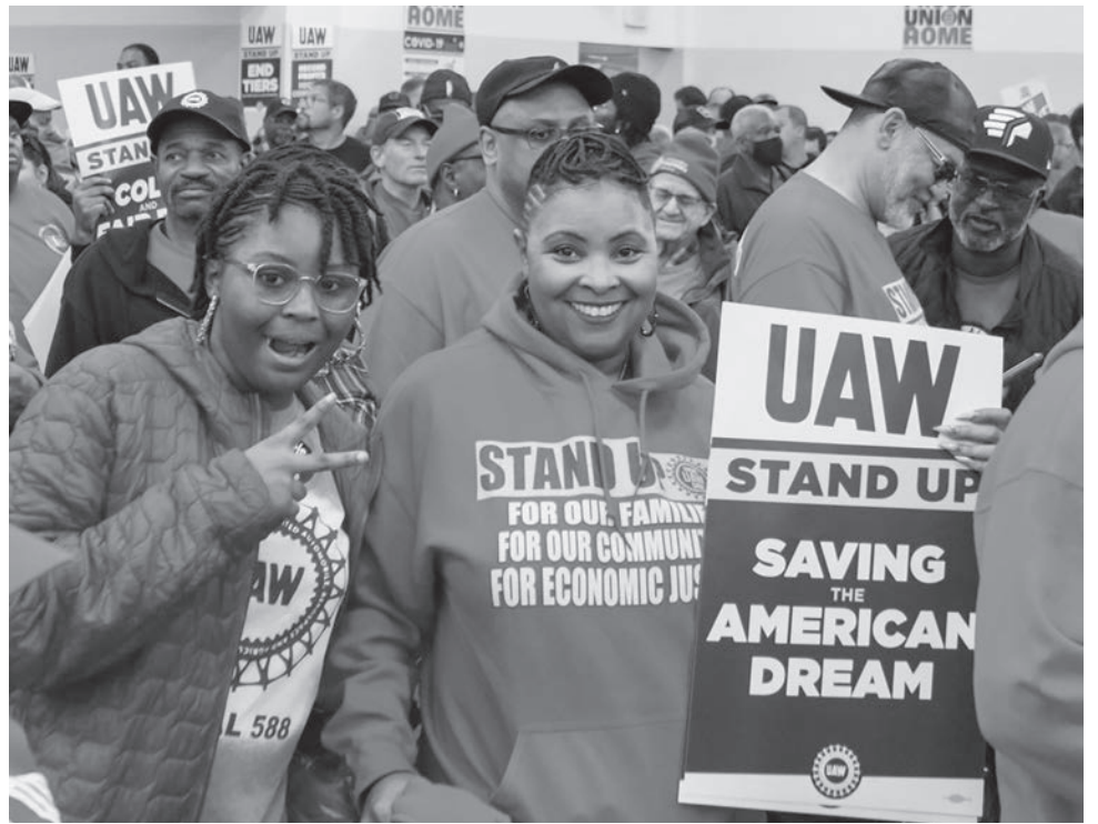
Chicago solidarity rally at UAW Local 551.

"When working class people go on strike, we can put an end to the race to the bottom. We can stop the struggle living paycheck to paycheck. We can take our lives back. We can take our time back and we can build an economy that works for the working class and for all of humanity," said President Fain.