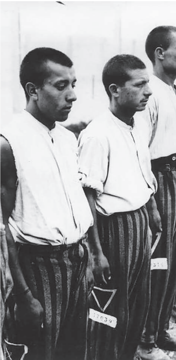
Dachau concentration camp, 1933. The first step was dehumanizing those who were rounded up. Could the homeless be next?

Fascism: “... a centralized autocratic government headed by a dictatorial leader, severe economic and social regimentation, and forcible suppression of opposition.” — Webster’s Dictionary