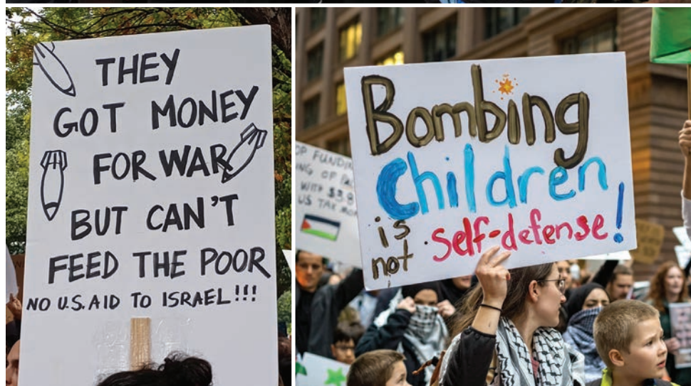
Protest for a ceasefire of 10,000 people in Austin, TX on Nov. 12.