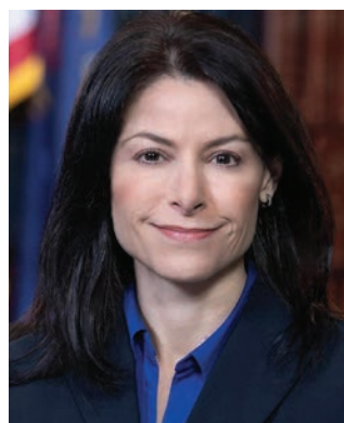
Michigan Attorney General Dana Nessel

Resilient as we are, Flint residents will not give up on being made whole.