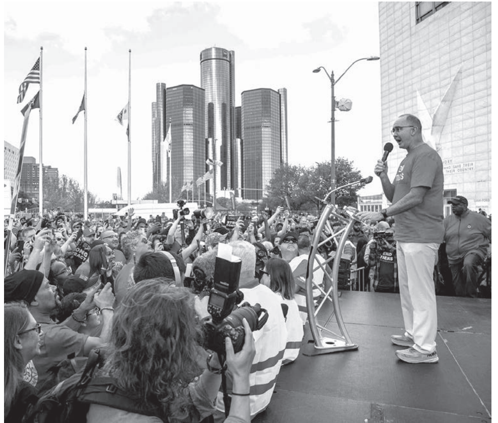
UAW President Shawn Fain addressed UAW members and supporters at rally in Detroit launching the Stand Up Strike.