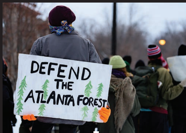
Forest defenders try to stop Cop City.

See P. 3 and 6