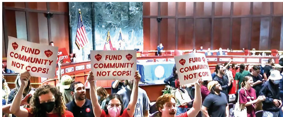
Protest at Atlanta City Council over Cop City. In 2021, 1,100 Atlanta residents, 70% of them opposed to building the police facility spoke, and on June 5 and 6, more than 400 opponents spoke. The City Council approved the $90 million funding for the facility anyway.