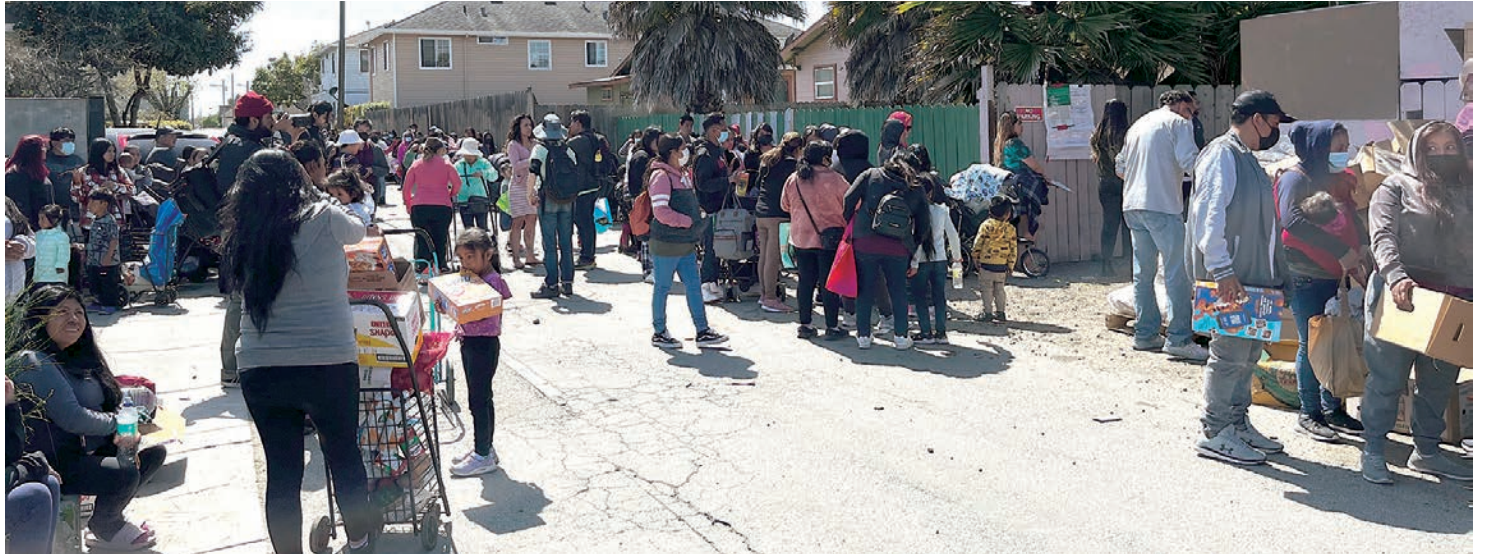
In April, some 1,000 farmworker families mainly from Pajaro line up for a distribution of food, clothes and household goods in Watsonville, organized by the Center for Farmworker Families and others.

“The flooding of Pájaro has been absolutely devastating. It makes me angry that they knew these levees needed to be redone in 1995. And they just chose not to do it. I think they planned on doing it for 2025. And on the Watsonville side of the levee, they spent five times more money shoring up the levees than on the Monterey side of the levees, and that’s why they didn’t break in Watsonville, but they broke on the Monterey side [flooding Pájaro]....Somehow farmworkers are not viewed