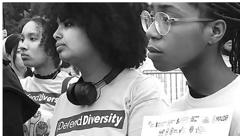
Rally outside Supreme Court before it heard cases on (top) affirmative action and (right) student debt.