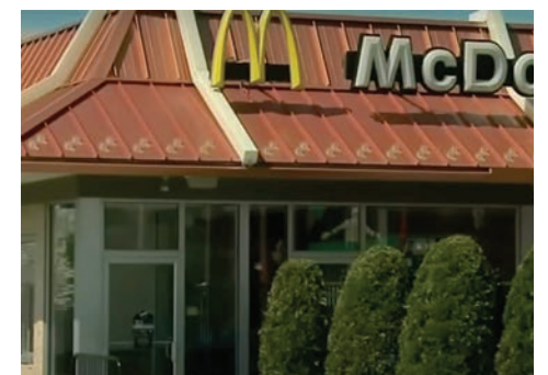
2023: Children found working at Louisville McDonald’s until 2 a.m., and without pay.