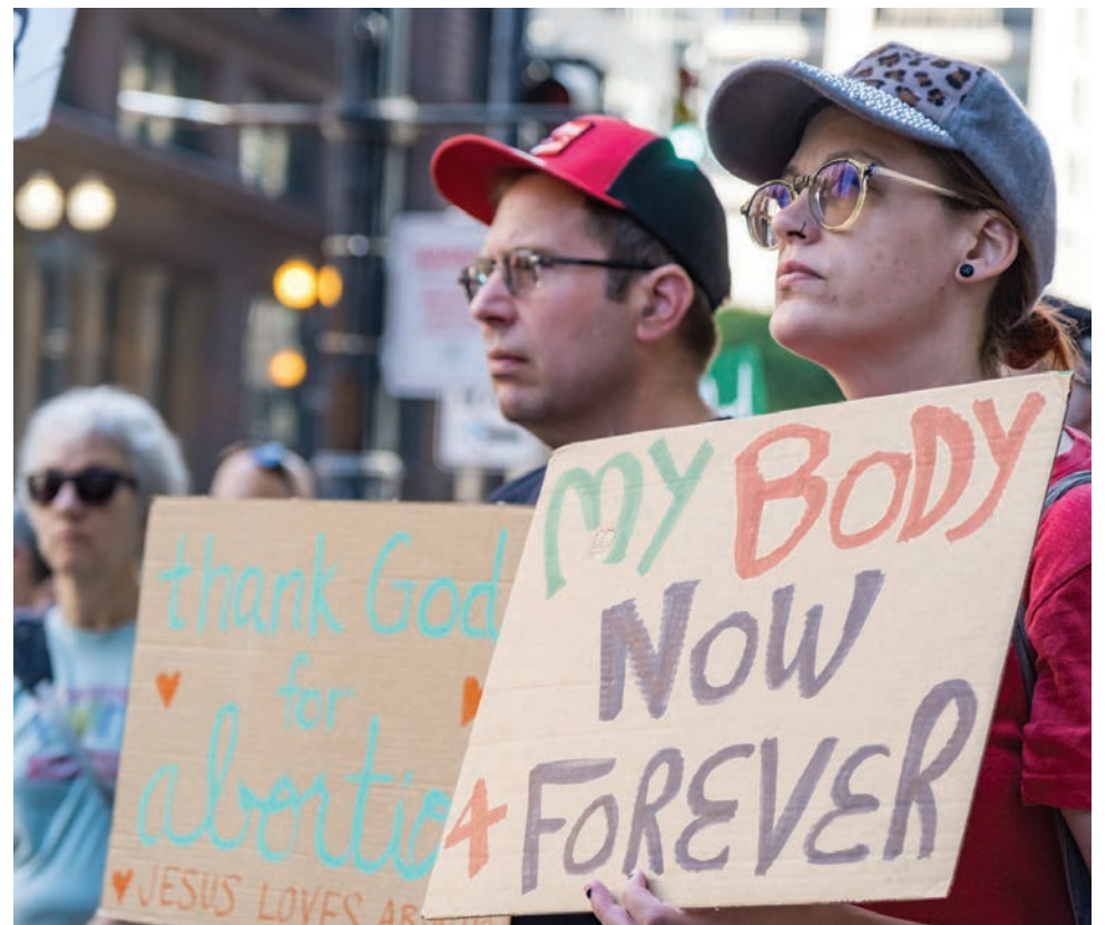
Chicagoans rally on the one-year anniversary of the Supreme Court overturning Roe. The rally highlighted the fight for reproductive justice and LGBTQ+ rights.

Attacking the rights of a section of people threatens everybody’s rights. Either everyone has their rights or no one will have their rights. As history teaches us, the only way forward is for a massive movement for rights and democracy from the scattered battles raging on many fronts, with the people most affected in key leadership roles.