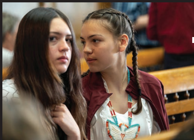
Sisters, two of 16 youth in landmark climate suit against Montana.

P. 4 and 5