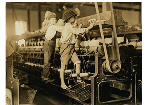
1908: Boys working in a Georgia textile mill.

The organization, One Fair Wage (OFW), representing more than 14 million workers in the service industry, is working to end all subminimum wages in the United States and to protect child labor laws. Three hundred thousand service industry workers and over 2,000 participating restaurant owners nationwide are working together to increase wages and improve working conditions. Organizations like One Fair Wage need your support. Donate at onefairwage.site