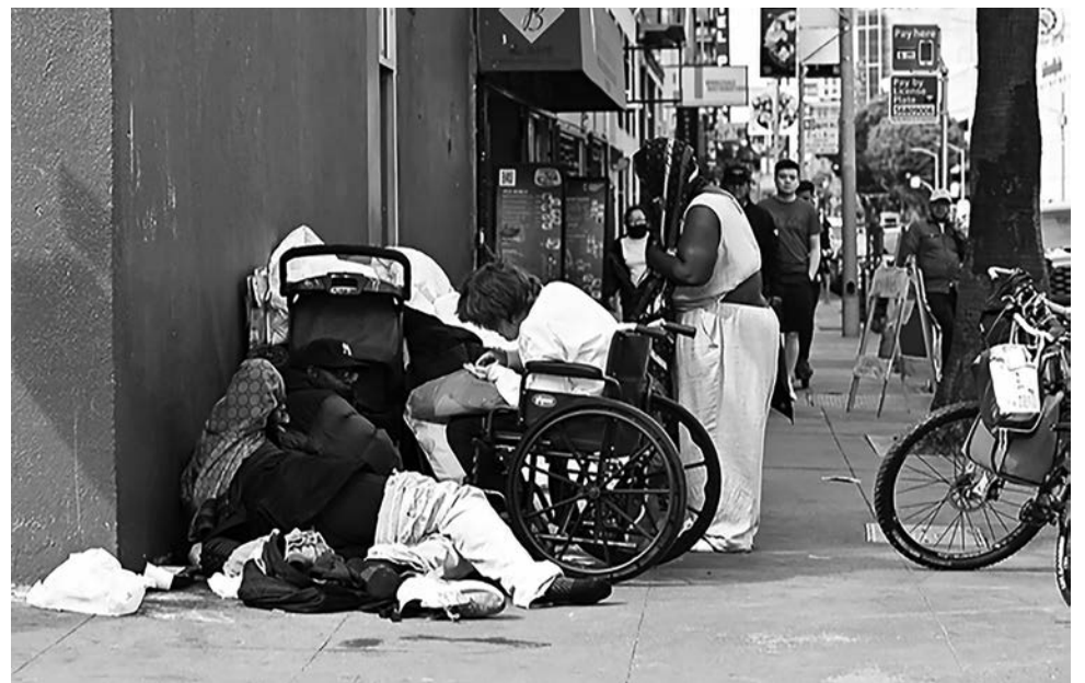
Unhoused people living in the Tenderloin District of San Francisco face sweeps and arrests for living in the streets, June, 2023.

In the largest survey of homeless Californians in decades, done by the University of California at San Francisco, the leading cause of homelessness was overwhelmingly found to be the crushingly high rents and unaffordable housing, and lack of meaningful help getting rehoused once housing is lost, despite