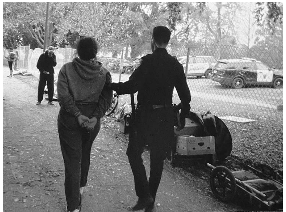
A handcuffed evicted Santa Cruz Benchland’s camper is escorted to a squad car by a police officer. An unhoused person is a prime candidate for the CARE Courts.