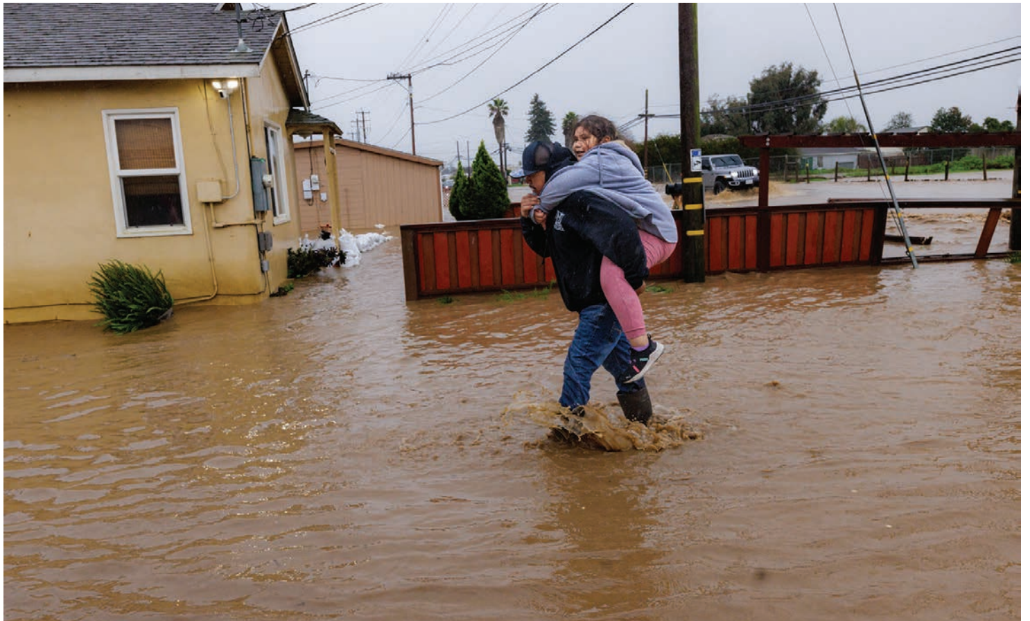
A dad helps his daughter through the flooded streets of Watsonville, the community next door to Pájaro in January.

“I know my people who live in Pájaro, and