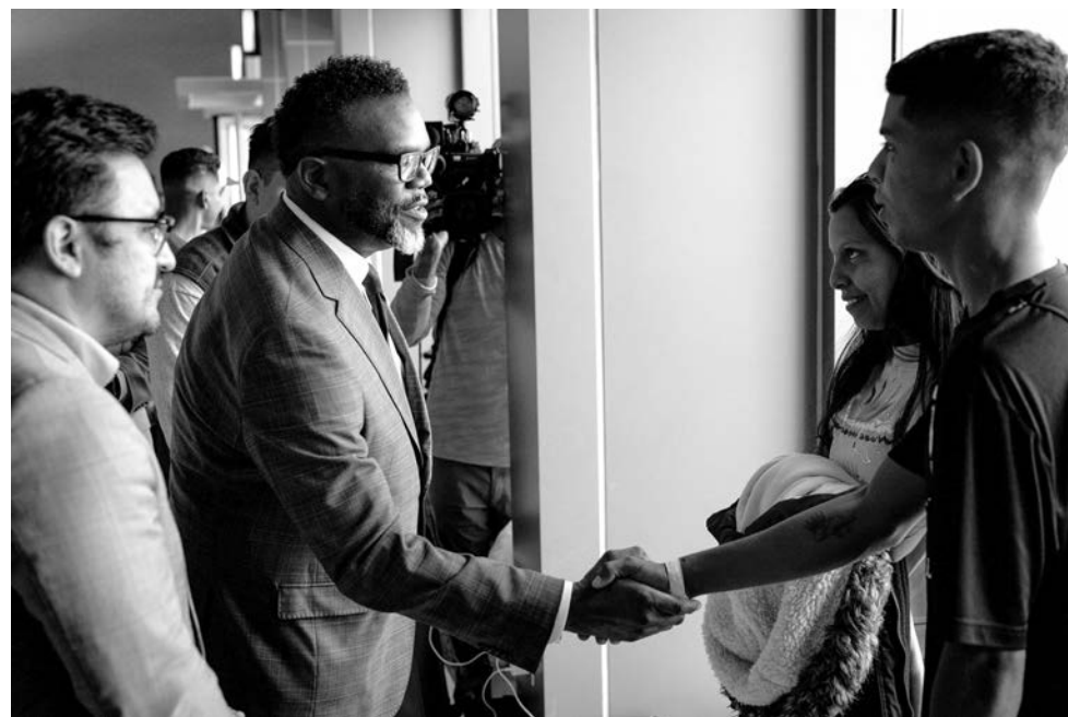
Chicago Mayor Brandon Johnson visits migrants at the Chicago Police Department's 12th District Station in the Pilsen neighborhood, which is housing migrants.