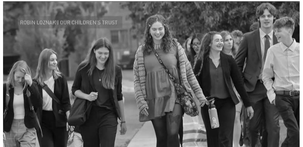
Youth plaintiffs in Held v. Montana testified that the state violated their constitutional right to a clean and healthful environment.