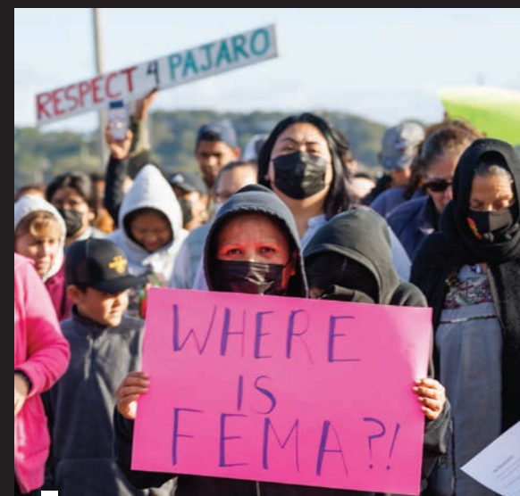
Farmworkers demand aid after Pájaro, CA flooding.

See P. 8