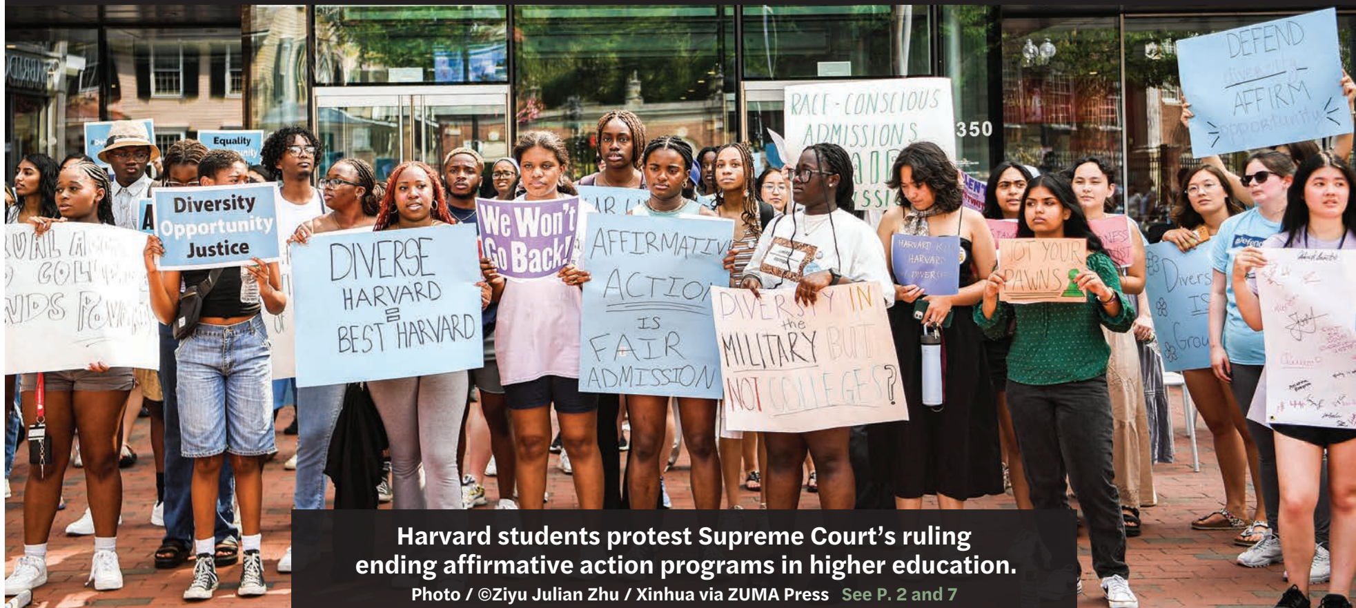
Harvard students protest Supreme Court's ruling ending affirmative action programs in higher education.

See P. 2 and 7