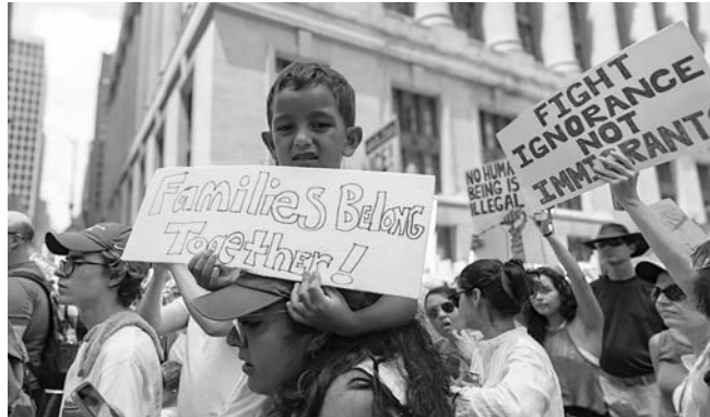
Families Belong Together protest, Chicago, 2018.