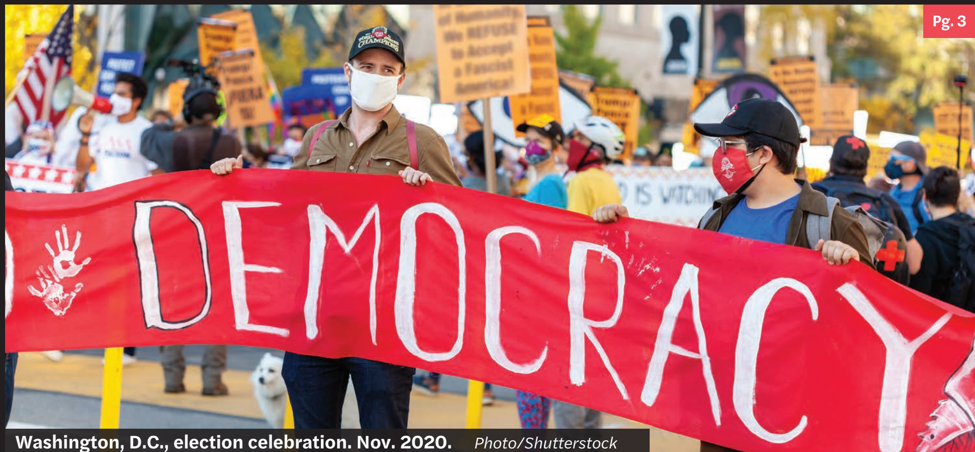
Washington, D.C., election celebration. Nov. 2020.