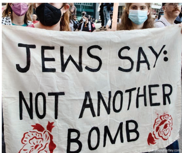
LEFT: Protest at DNC.