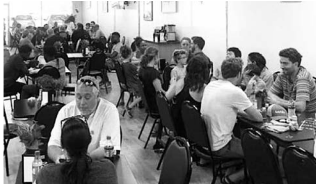
Residents pack Haitian restaurants in Springfield.

rallied to the Haitians' defense. A Columbus, Ohio councilman summed up people's caring spirit with these words: "[Our] strength lies in us being together as a unified community... because today it's Haiti, and tomorrow it's another country. It is a narrative that ... isn't fair and it creates chaos and uncertainty and an unsafe environment for entire communities, cities and countries. And certainly, here in the city of Columbus, we will not stand for it."