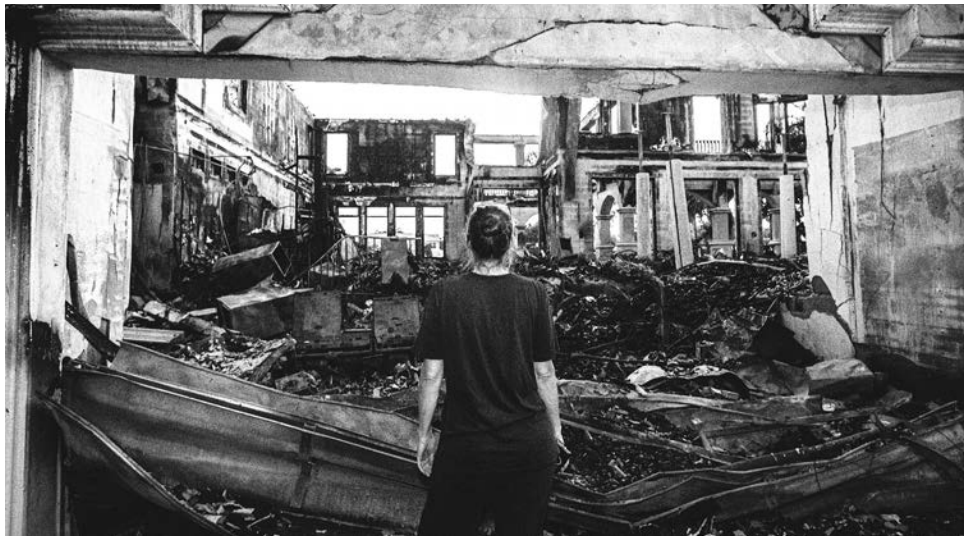
Hurricane Helene demolished this Florida home.

As carbon dioxide continues to fill our atmosphere at a rising rate, causing water temperatures in the Gulf to rise to 90°F, Big Oil and their 60 big bank funders continue to rake in big profits. While they spew lies and propaganda about global warming, ignoring scientists, we are suffering extreme more frequent weather and disasters like Hurricane Helene. If it wasn't for organizations like the Rocking Chairs and Sunrise, seniors and youth groups working together all over the country and globally, calling out banks funding fossil fuel, how much longer would we be in the dark? Their fearless efforts are heroic. We watched many of them getting arrested this past year protesting banks like Citi, Bank of America, Wells Fargo, and Chase. If we don't all stand up and join the movement, we will actually collapse as a civilization.