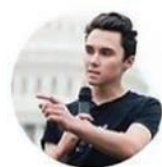
David Hogg davidhogg111