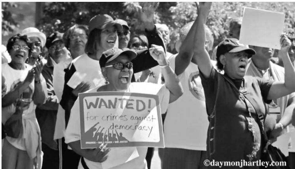
Residents protest dismantling of democracy in Flint, MI, two years before the disastrous water crisis.

All who care about defending and expanding our freedoms dare not avoid using the VOTE, while we can. This along with other social justice activities is one tool in the toolbox to secure political power.