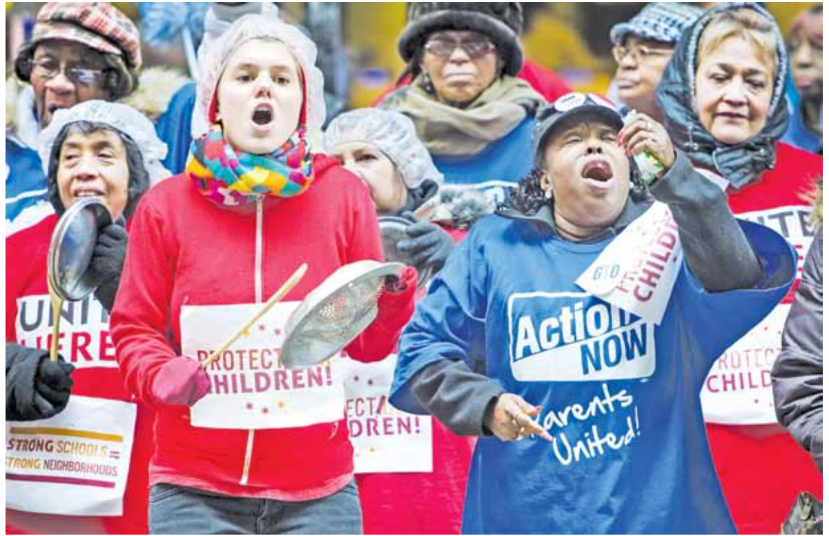
Thousands of parents, students, teachers, public school employees and community members rally against proposed closing of 54 public schools in Chicago. (Below) A protester is arrested in front of Chicago City Hall.

Chicago is a Democratic Party town. Mayor Emanuel is taking the lead and made clear in his election campaign his intent to attack public workers unions. Nationally, Democrats have elaborated a plan, based on the Bush era No Child Left Behind,