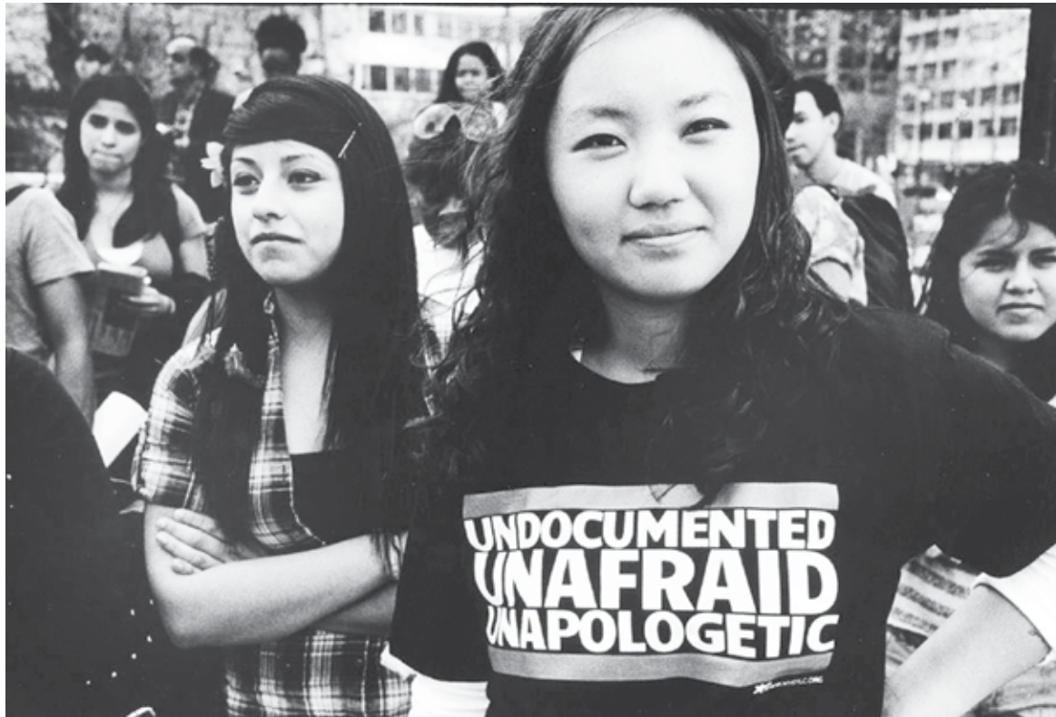
Dream activists protest at U.S. Immigration and Customs Enforcement (ICE). The courage of the “Dreamers” is an inspiration for the pro-immigrant movement and the nation.

Undocumented workers are among the most exploited, low-wage workers in the U.S. They are forced to live in constant fear of deportation, isolated in the shadows of mainstream American society. This isolation of the immigrant worker is directed at weakening our entire working class. The legal and extra-legal attacks against this section of the working class are part of the general government assault on all workers. Undocumented workers and documented workers—those who are U.S. citizens and those immigrants with work visas—are part of the same working class.