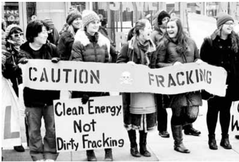
Antifracking rally in front of the state of Illinois building, Chicago.