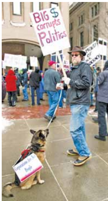
Spokane, WA Move to Amend the Constitution protest.