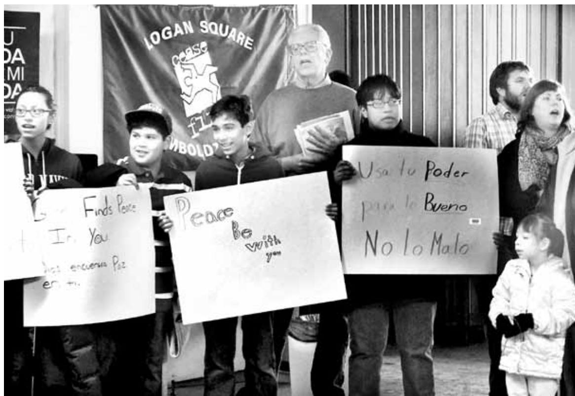
Palm Sunday gathering in Chicago calls for a real remedy to violence.

A few weeks prior to the event, a baby was deliberately gunned down with her father in the streets of the city. Yes, the individual who pulled the trigger was deprived, but he, like the gun, was made in the U.S.A. Just locking him up or executing him does not address the destruction