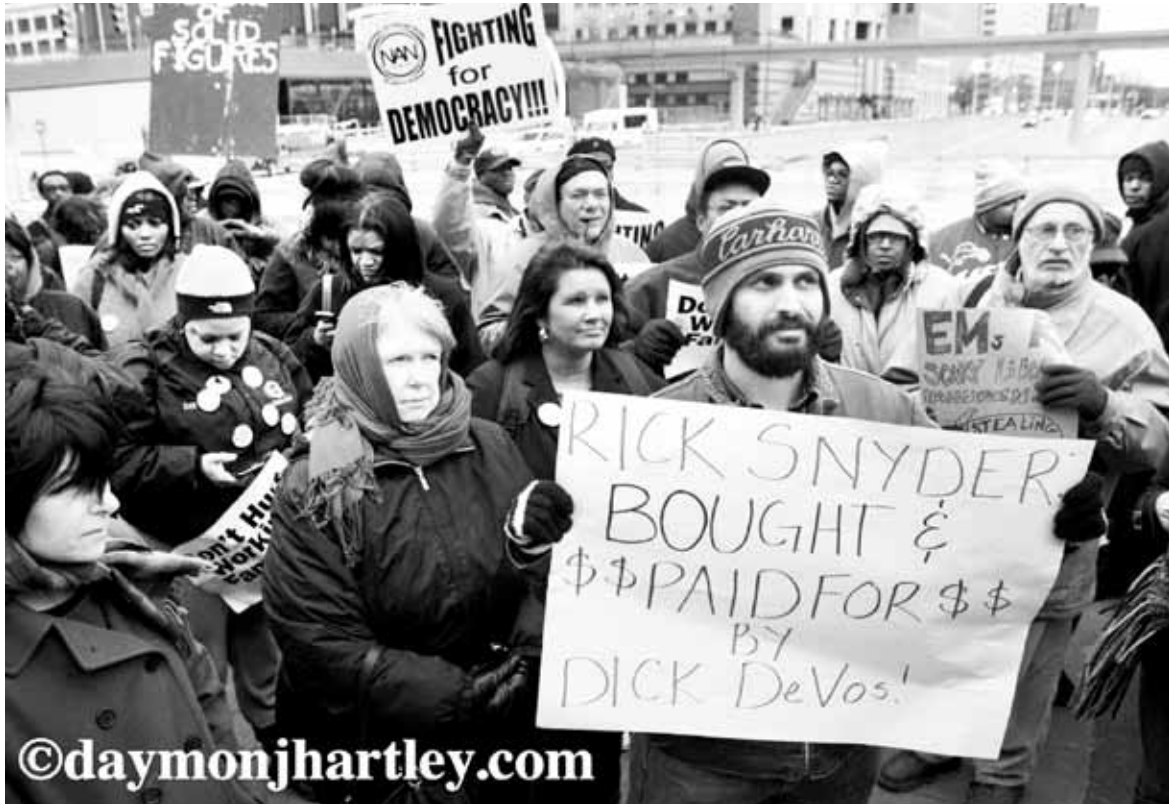
Protesters rally against Right To Work and for democracy at the state capitol in Lansing, Michigan.