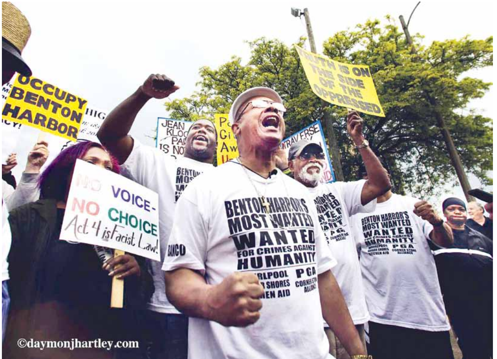
Protest against the corporate takeover of Benton Harbor.