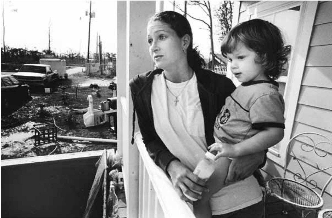
Mississippi Gulf residents in Hancock, post Hurricane Katrina.

I used food stamps to feed my family several times over the past forty years so I looked up some facts to help talk about these ideas. Most of the people who get food stamps are in households where people work, they just do not earn enough money to pay their bills and food. One half of the people on food stamps (provided through the Supplemental Nutrition Assistance Program called SNAP), are children. The capitalist economic collapse of 2008 eliminated millions of jobs