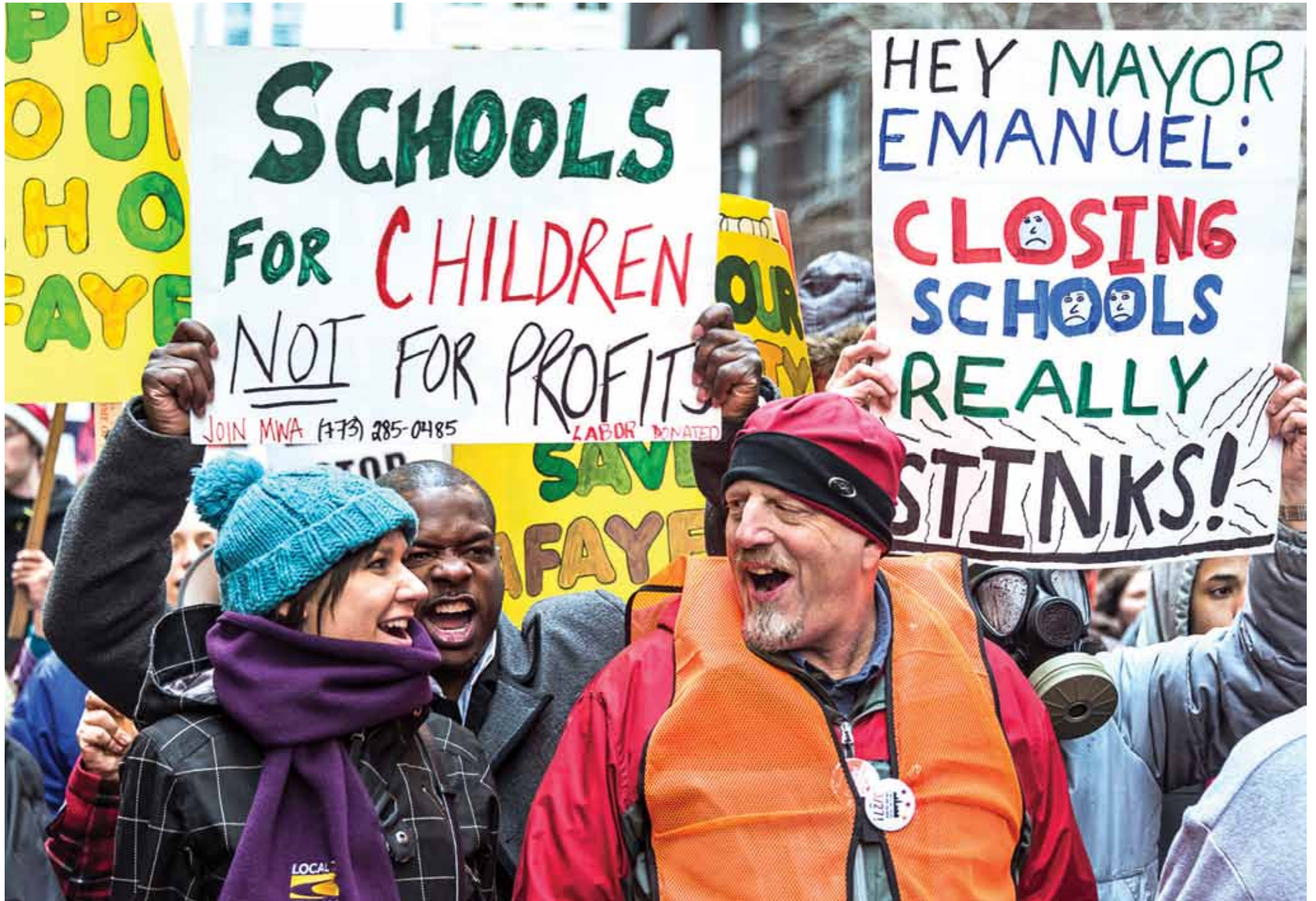
Parents, students, teachers, cafeteria and custodial workers marched through the streets of Chicago, protesting plans to close 54 of the city's public schools. Over 100 demonstrators were arrested in front of City Hall on March 27th. Read the story on page 6.