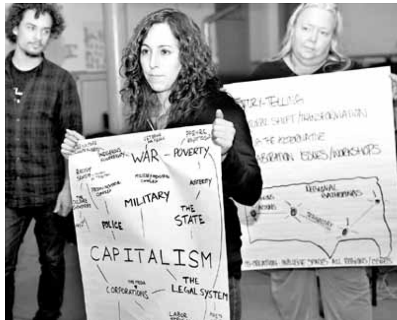
U.S. Social Forum National Planning Committee held in Philadelphia.

to step up and take its place in history by advancing the interests of working class, low-income, and grassroots struggles. The moment is urgent and the opportunities are great."