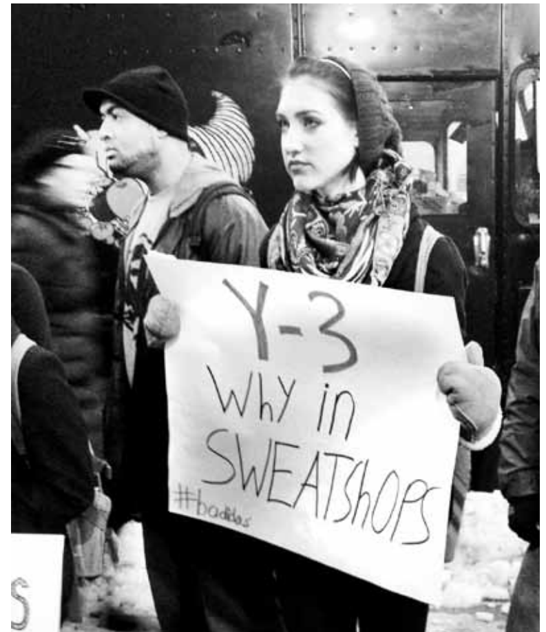
United Students Against Sweatshops supported Indonesian workers’ claims against Adidas’ Y-3 apparel line during NYC’s Fashion Week.

The Remember the Triangle Fire Coalition is leading efforts to install an inspiring permanent public art memorial in New York City at the site of that tragic fire. Remembering the Triangle fire, and how in its aftermath solidarity and activism became a progressive force that bettered workers’ lives, should remind us that when citizens get together in common cause, their lives, their children’s lives, and everyone’s prospects for the future improve. For more