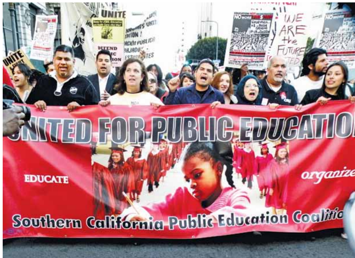
‘March 4th: Day of Action’ in Los Angeles. The group with the banner is: The Southern California Public Education Coalition.

We also have exciting campaigns coming up in California for the 2014 election! Please join us to help pass a hoard of county ballot initiatives in support of the We, the People Amendment. Start by signing up to volunteer through our petition at www.movetoamend.org .