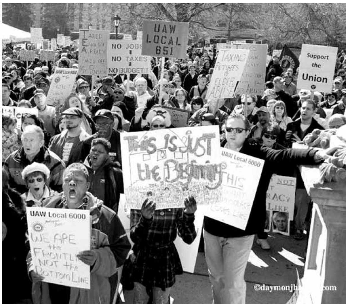
Protesters demonstrate against Governor Rick Snyder, the Emergency Financial Manager and Right To Work at Cobo hall in Detroit.

Michigan has sustained one half of all the manufacturing job losses in the country—a burden no one state can absorb. The Governor has taken the bold and lawless step of hiring an overseer to manage the "City fire sale", under the guise of managing the crisis. We have many wonderful municipal holdings that are being "eyed", that we fear will soon be snatched away forever. Our beloved paradise called "Belle Isle"—a place where families can take their children and walk through wooded areas, watch deer and ducks, walk by quiet ponds dotted with Mr. and Mrs. Swan and their babies, and stroll down pathways during hot summers—is on the list. Art Deco buildings decorated by artists of every genre are on the list. So are examples of the "Spirit of Detroit", labor movement replicas, religious institutional beginnings, and the many stories of freedom walkers. All this misery to cover up the Great Theft! Detroit is a