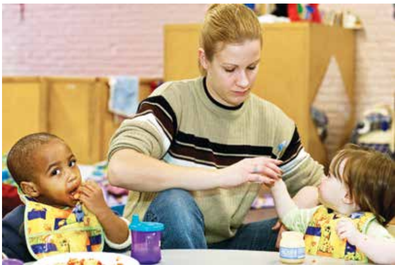
Childcare center for low-income families in Michigan. Families today are receiving a smaller share of assistance than prior to welfare "reform."