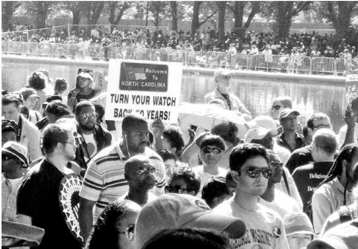
50th anniversary of the March on Washington.