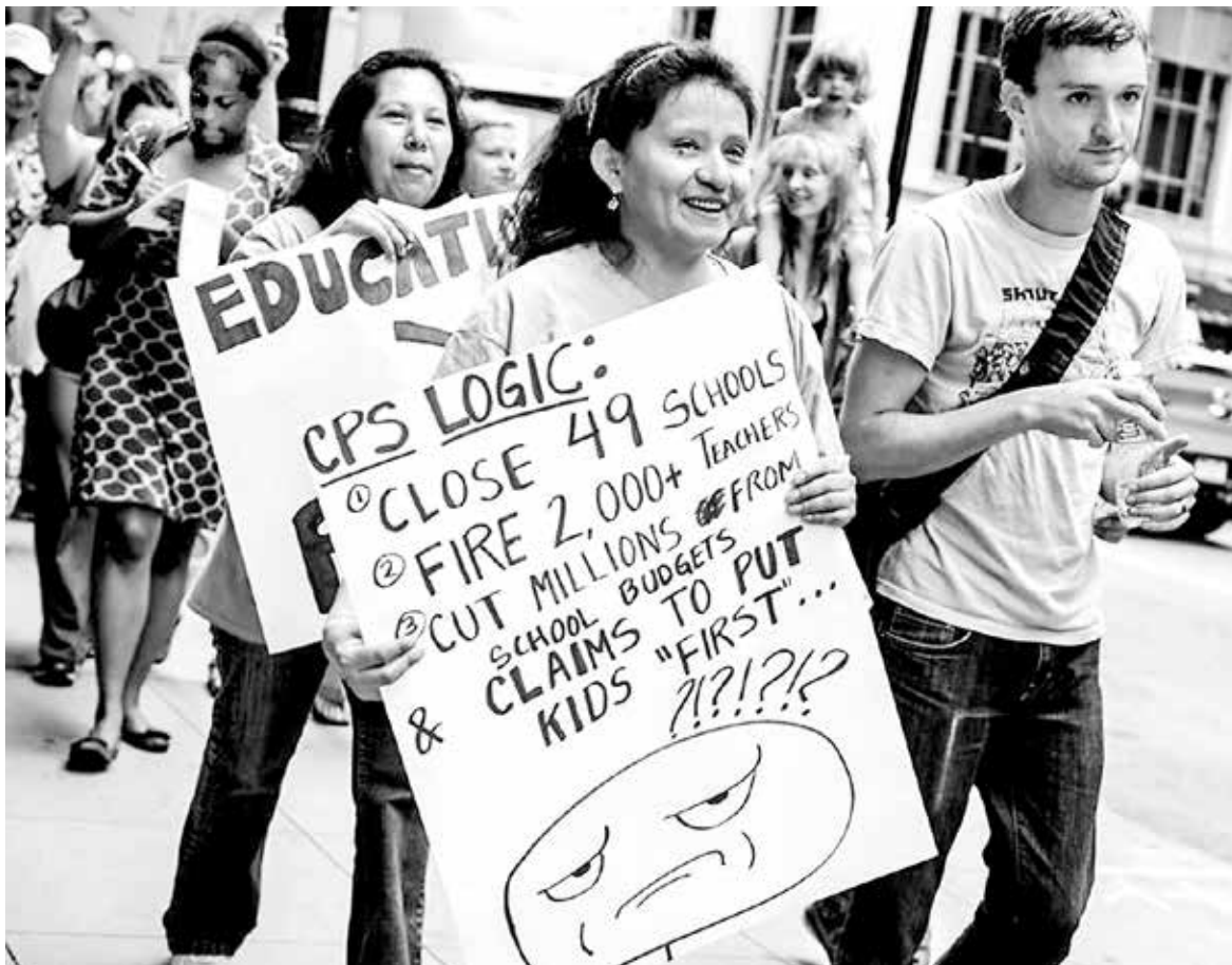
Parents and students march in front of the Chicago Public Schools headquarters on August 28. They are part of a national Journey for Justice.