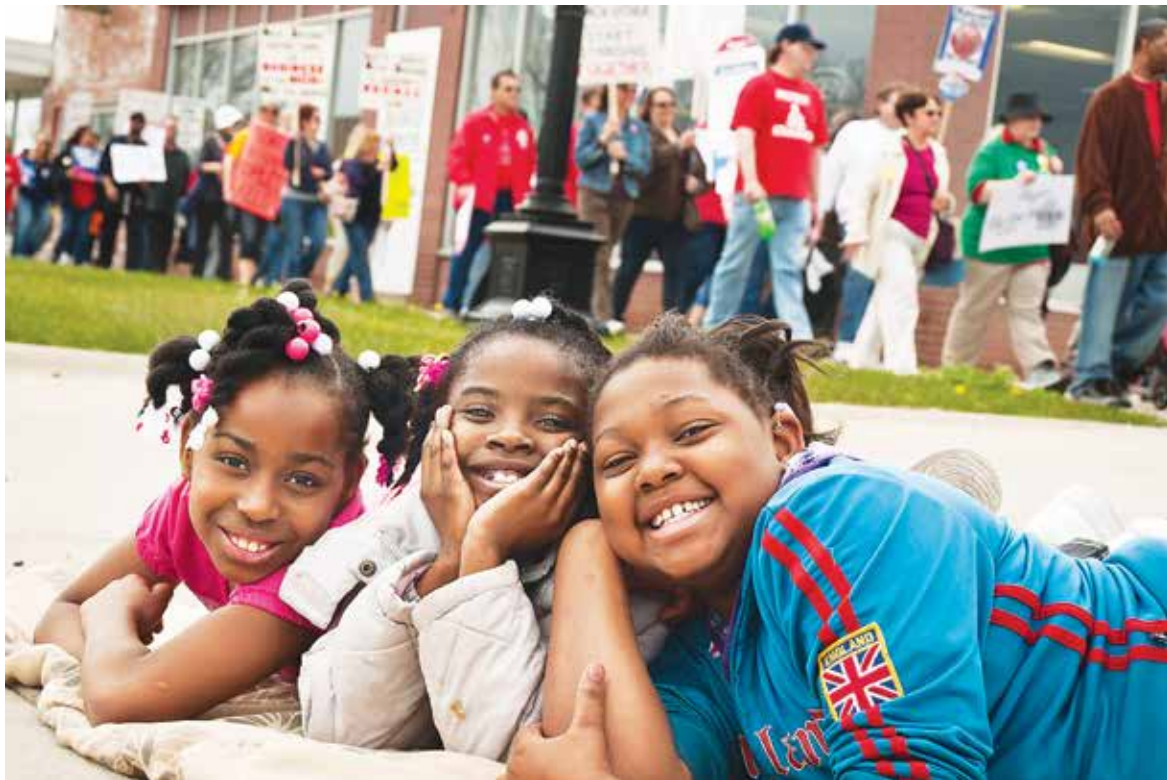
Benton Harbor youth at a protest against Governor Rick Snyder, who put an undemocratic, non-elected Emergency Manager in Benton Harbor.

Meeting Act. We are living under the power of the corporations and dictators and the city of Benton Harbor is a great example. We must fight the corporations, bankers and dictators. We, the people, must organize and organize and