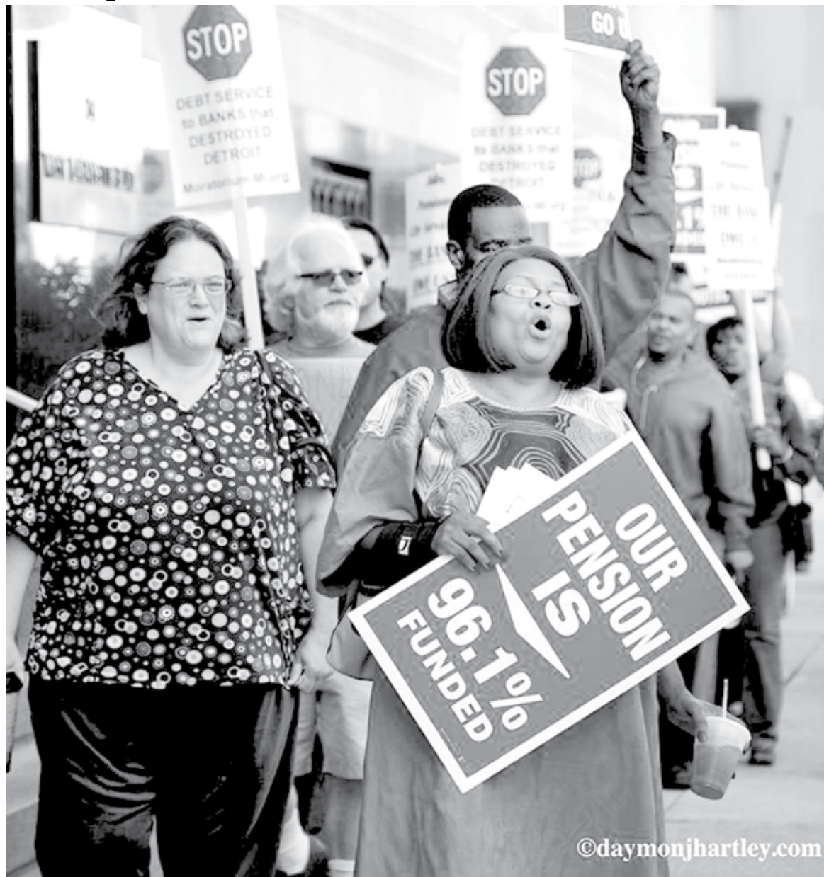
Detroiters' protest in front of the Federal courthouse on the first day of hearings around City retiree pensions. The pensions are at risk because the corporations won't pay for labor they don't need. The Emergency Financial Manager appointed by the governor is enforcing this.

The financial crisis we are facing is based off of a lie: "there is not enough money." The "Great Recession" officially ended in June 2009 as profits and stocks rebounded. The rebound was made possible through a major shift of wealth as trillions of federal tax dollars were funneled into the financial institutions and corporations. Additionally, the private sector has boosted its profits by streamlining their ef-