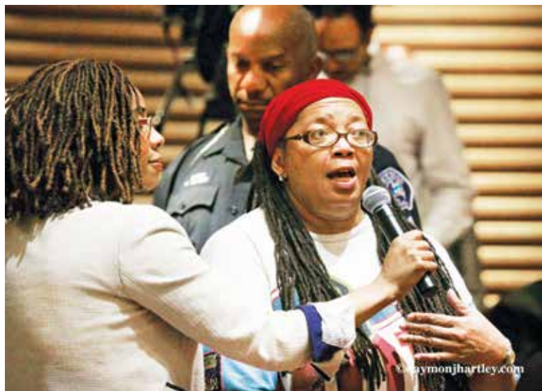
Detroiters speak out at the first meeting of their non-elected Emergency Manager.