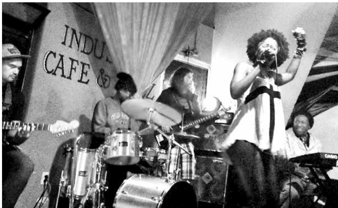
Flight School open mic band in rotation.

I started playing bass seriously as a preteen and grew up in a musical household, always tinkering with the drums, guitar and keys as well. Having played in several bands throughout the years I've learned a lot about perceived success and failure as a musician. The biggest success one can have in music is to be able to transfer emotional energy through sound and word to an audience. To connect, as it were. Without that connection, there will be no momentum for the art. When the crowd feels it, that's