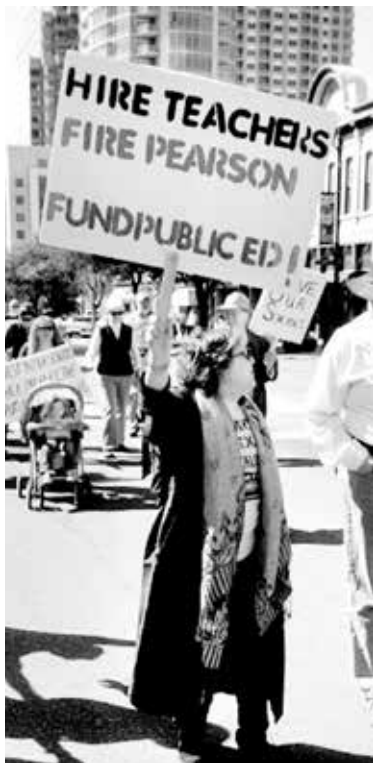
Over 12,000 people march in Austin, Texas for funding for K-12 and all levels of public education.

2 CAW: Coalition on the Academic Workforce , http://www.academicworkforce.org/CAW_portrait_2012.pdf