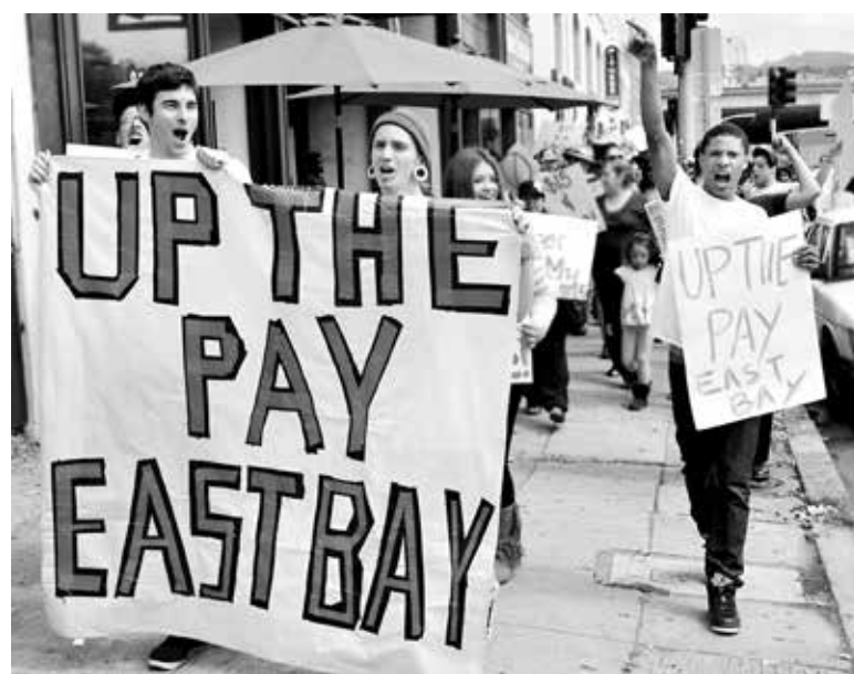
Fast food worker strike in California.