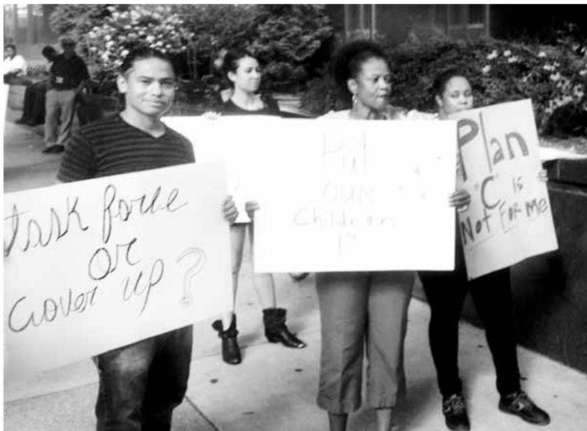
African American and Latino Students and Community Protest at Richmond, VA School Board Meeting in July.

See more at: http://www.waysidecenter.org/african-american-and-latino-communities-join-forces-at-school-board-meeting-demand-better-conditions-for-all/#sthash.NbzJTcO5.dpuf