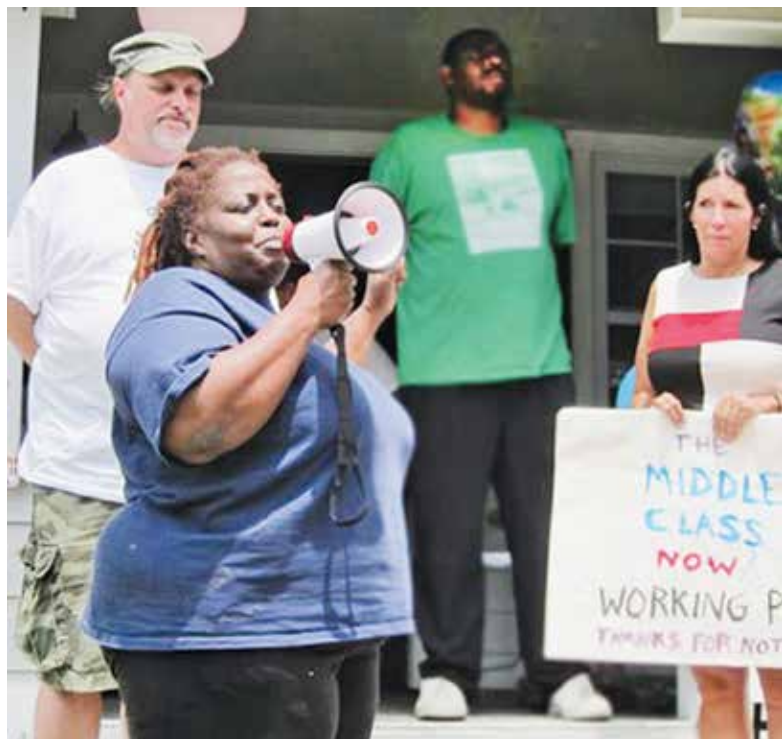
Housing takeover for a homeless family in Tampa, FL.