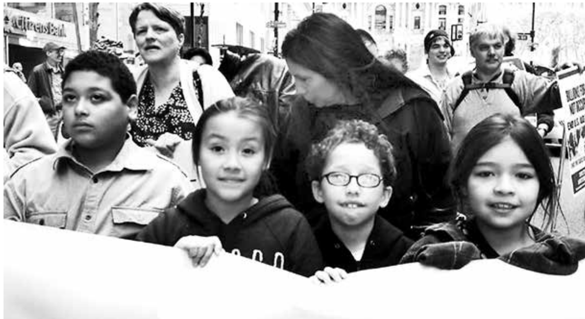
Children and others protesting the growing poverty in Philadelphia.

The World Courts of Women exist to rewrite our histories, reclaim our memories, and find new visions for our times. The Courts of Women are public hearings that exist to share voices of survival and resistance from the margins. Those gathered at the World Court on Poverty in the U.S.: Disappeared in America People's Movement Assembly, along with the host organizations, seek to break the silence on poverty as a violation of both women's rights and human rights. We reject the myth that dire poverty only exists