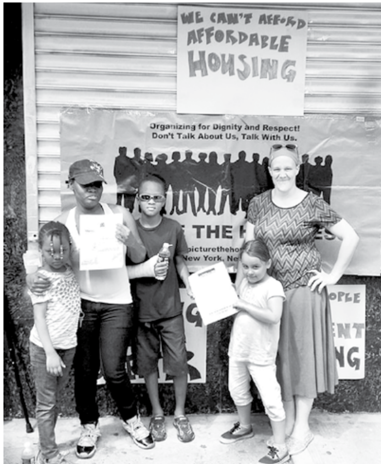
Homeless people in Bronx, NY wage a protest after receiving a disturbing letter that their shelter is closing.