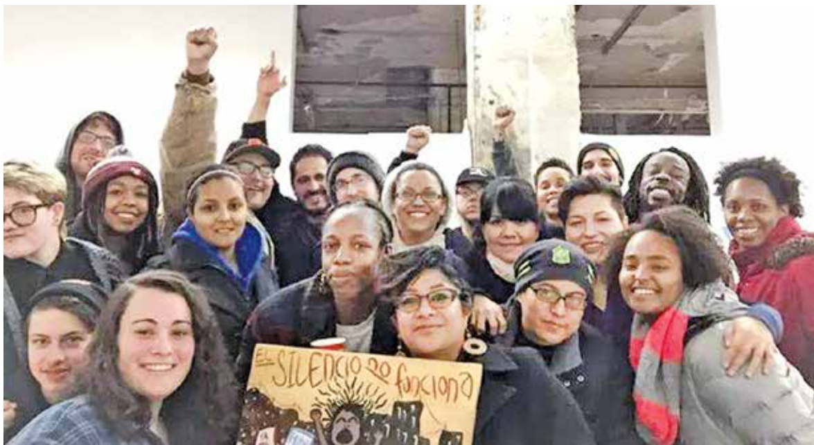
The group, "One Struggle KC," and friends after successful bridge-building event.