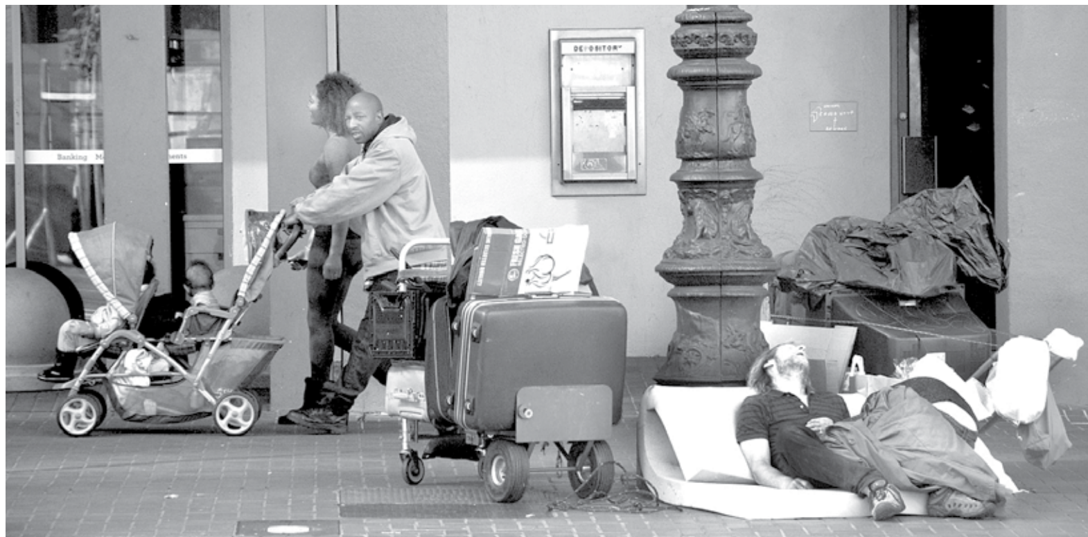
Homelessness on Market Street in the Tenderloin, one of the areas with the highest concentration of homeless people in San Francisco. This is a common sight in the neighborhood.

The homeless sleep on the streets at night when suddenly the Department of Public Works (DPW) turns on the water hoses and douses them with water. It gets worse when DPW then