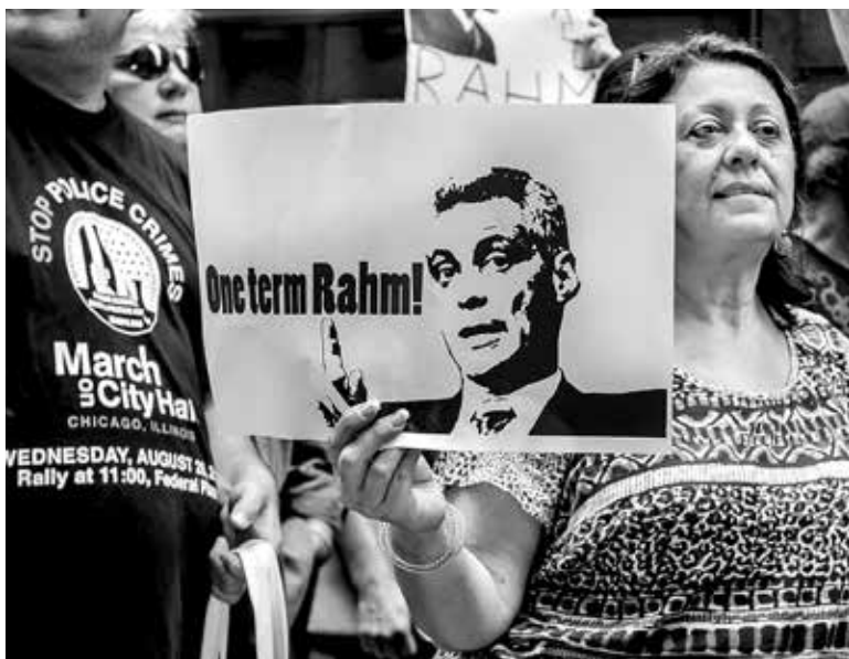
One-day boycott of Chicago Public Schools. Community groups marched to City Hall to demand that Mayor Rahm Emanuel meet their demands.