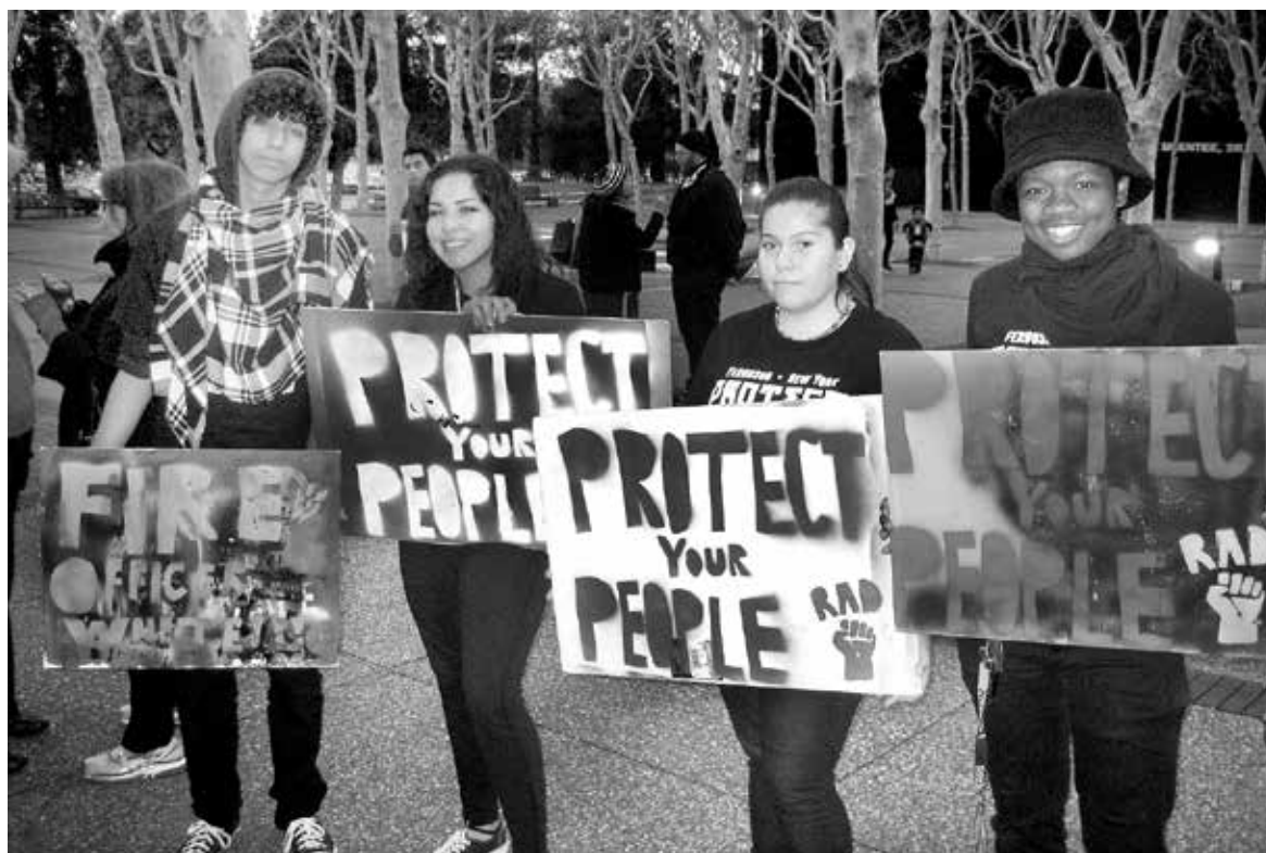
High school students join the Protect your People March. They are part of RAD (Regeneration Against Destruction). "We believe we exist in a world that is constantly being destroyed, we are here to take a stand and regenerate it."

San Jose's recent Mayoral election did little to change the situation. The vote was split between the mainly upper-income and white neighborhoods on the West Side, who voted for the