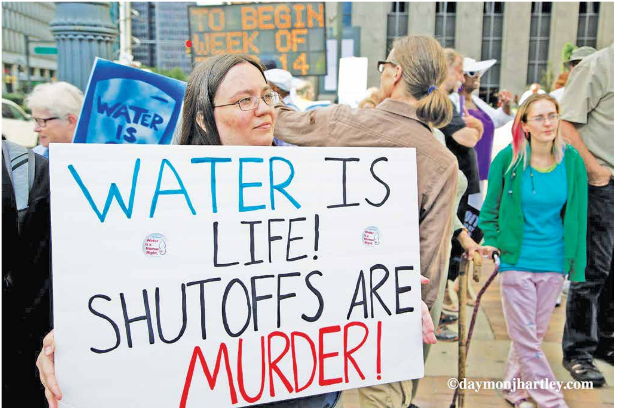
Protesters fighting water shutoffs in Detroit were greeted by a convoy of Canadians who traveled to the city with hundreds of gallons of water to help those who have been cut off because of unpaid bills. As people begin to fight the growing poverty in America, a police state is being imposed to crush their resistance.