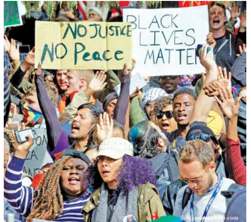
Rally in Ferguson, MO., demanding that the officer that killed Michael Brown be indicted, draws people from all of the country.