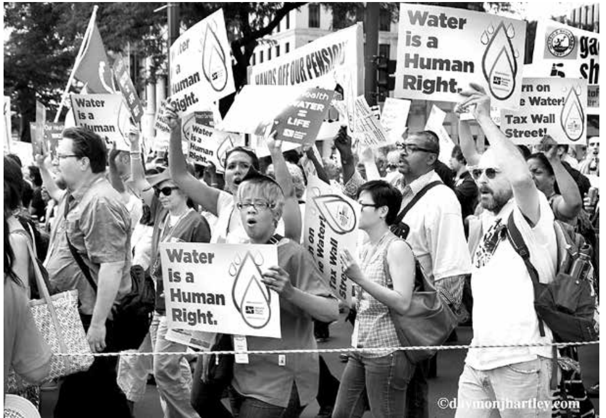
Protests to turn the water back on for thousands of the poorest residents in Detroit, MI, unable to pay the skyrocketing price. Water is being privatized throughout the country so corporations can profit. Water should belong to the people.

BK: The EM affects everything. The whole city, including the water department, was under the EM at this time. The impetus for shutoffs was coming from him as well as the bankruptcy into which he and the governor had put the city of Detroit. The shutoffs were in part to make the water department more desirable, either as an asset for full privatization and sale or for regionalization under the Great Lakes Water Authority. Aspects of the sewage treatment and other things have been contracted out to private contractors. Union workers are concerned that people will come in that don't know what they're doing. It's designed to weaken and break the unions. The threat was that they would