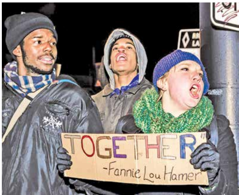
Rally in Chicago to reclaim the radical legacy of Martin Luther King.

For more information, call 770-624-0062.