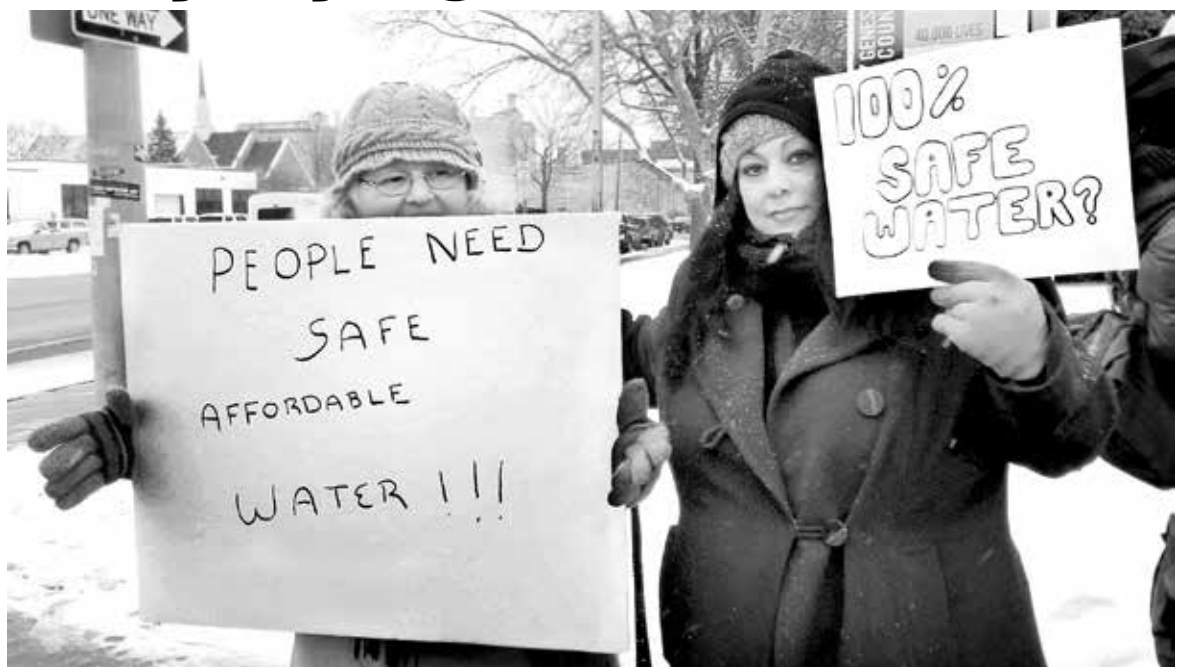
Water wars in Flint, Michigan. The water in Flint, Michigan contains excessive levels of cancer causing trihalomethanes.

Even before the Department of Environmental Quality issued it's finding on the life threatening contaminants in Flint's water, the