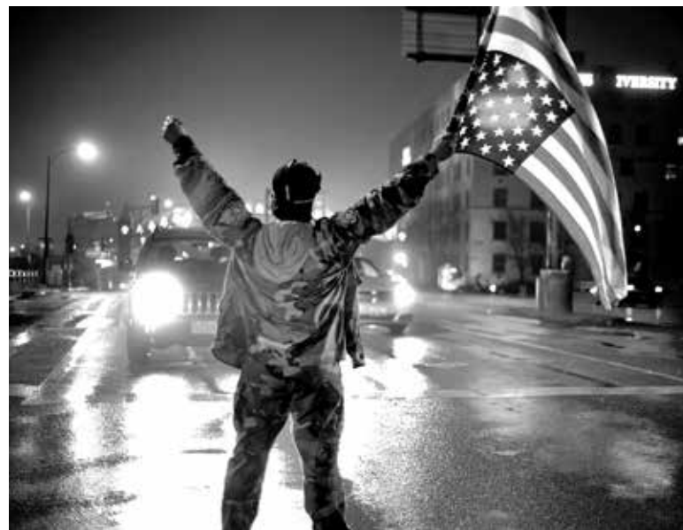
On the eve of the Ferguson Grand Jury verdict that failed to indict the police officer that killed Mike Brown, some protesters marched with the American flag upside down, a sign of distress.

When the Grand Jury announcement finally came, anger mounted as grief dissolved into a dignified rage, not only in Ferguson, but on Grand Avenue in the historically white