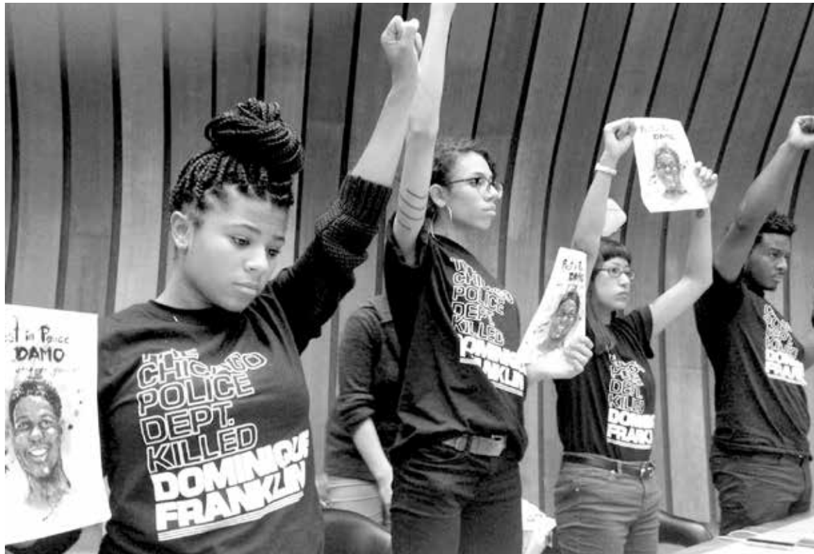
The “We Charge Genocide” delegates raise fists in silent protest to the U.S. government’s responses at the United Nations Committee Against Torture in Geneva, Switzerland.