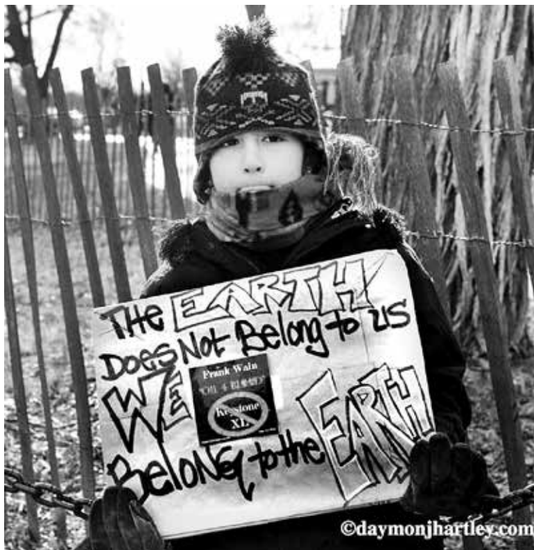
A young protestor along the route of a massive demonstration in Washington D.C. against the Tar Sands XI pipeline.