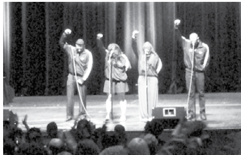
The Nilus West High School Slam Team performing at Louder Than A Bomb 2015, at the sold out four-thousand seat Arie Crown Theater.

“I feel like Chicago is in a renaissance right now... I feel a movement coming... I feel it in