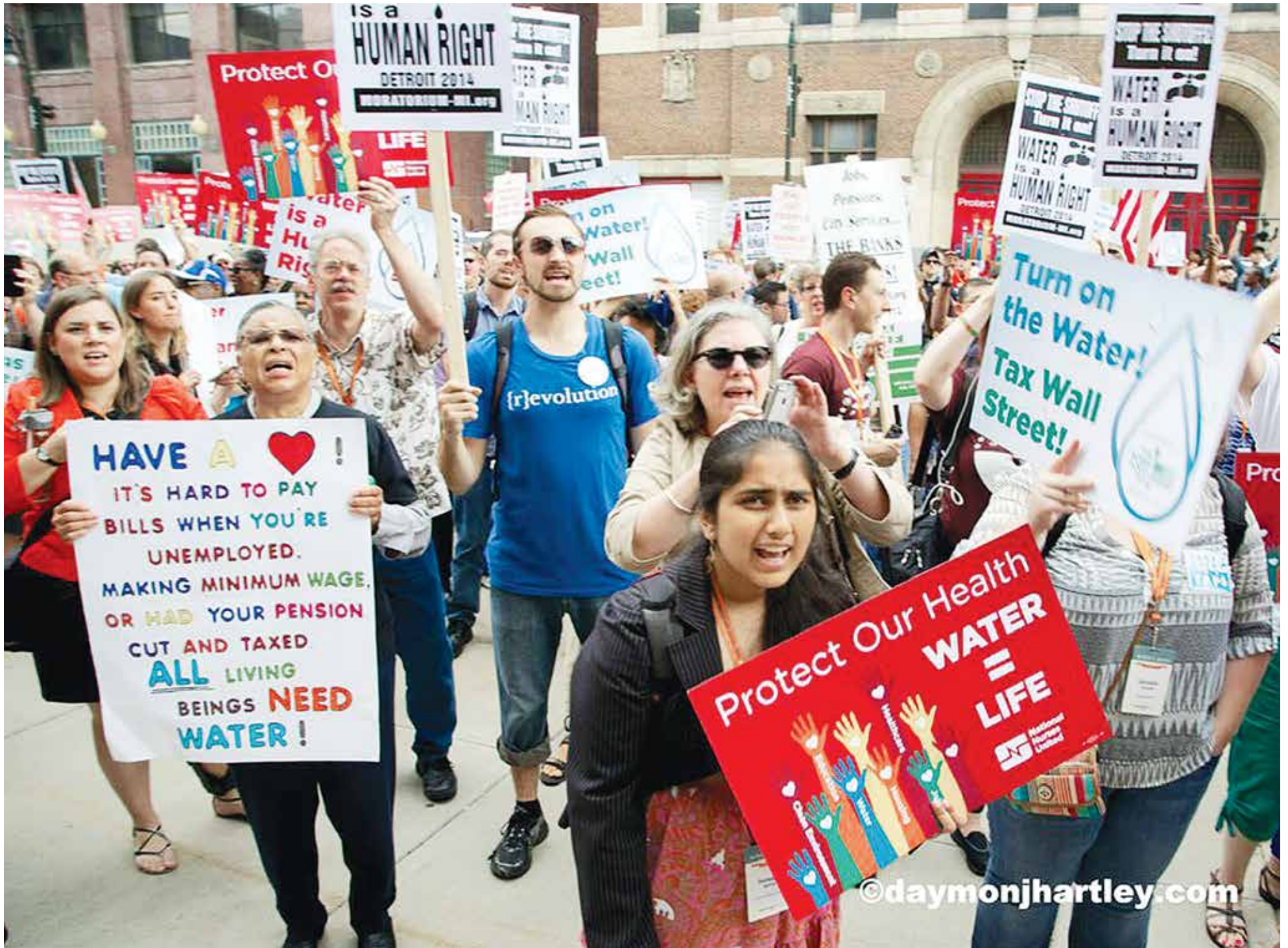
Protest against immoral water shutoffs to thousands of Detroiters. Water must be publicly owned and managed in the interests of the people.