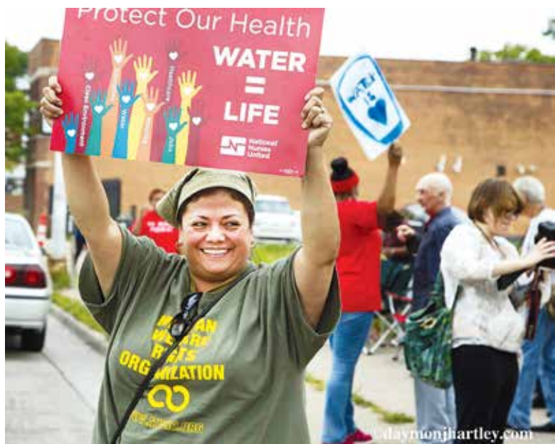
Protest against the water cutoffs of thousands of Detroiters last year. Thousands more homes are scheduled to be cut off, beginning in May.