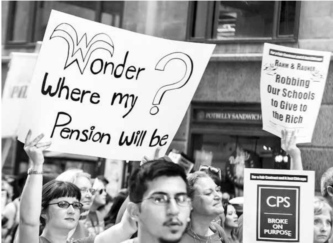
Chicago Teachers Union Rally for a Fair Contract.