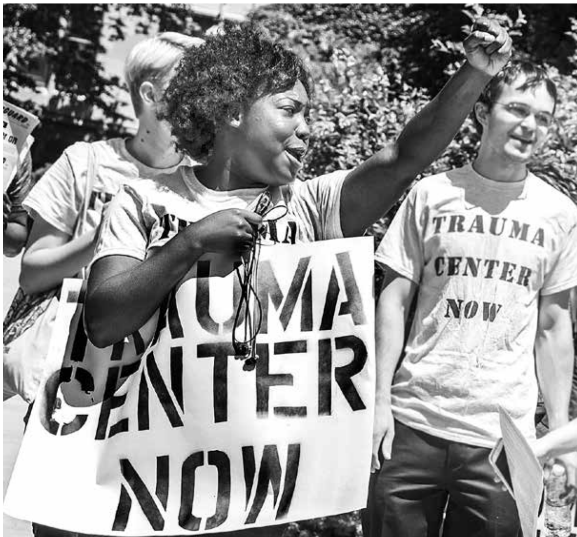
This five-year battle for a trauma center on Chicago's Southside was sparked after a young man, waiting for a bus, was shot. He had to be transported to a hospital 10 miles away and died.

Today, billions are made in profits from a healthcare system that more and more people