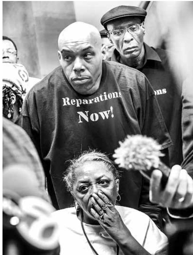
Chicagoans celebrate after the City Council voted for a reparations ordinance, which recognized that police torture took place (decades ago), and grants up to $5.5 million and benefits to the victims.

The growing police state marks the last stand of an economic system that cannot provide jobs or a decent life for the majority of workers. We must continue to fight every attack on our liberties, recognizing that the very police state that tortures and kills the poorest workers is what is standing between us and a new restorative, reparative society without police terror, one that insures that everyone’s needs will be met.