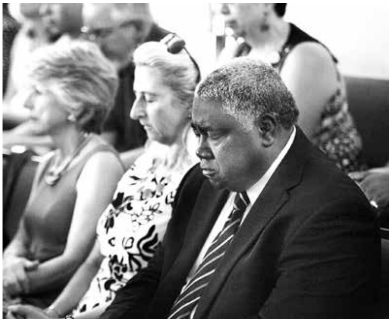
Prayer vigil held for the Emanuel AME shooting victims at Morris Brown AME church in Charleston, South Carolina.

What remains is for a crisis to erupt that allows for a full-blown fascist offensive. The legal power of the government to declare a