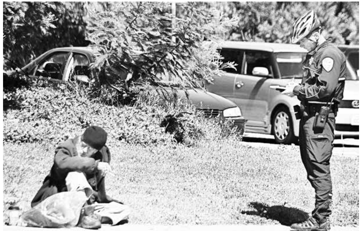
A homeless man sitting in the park is ticketed by a San Francisco cop. We must fight the rampant, petty criminalization of people abandoned by this economic system and demand that the government provide homes for people.

BERKELEY, CA — What we have here is an occupation, a fight for the commons, a fight for homeless rights. We have a literature table, we have a free box, we