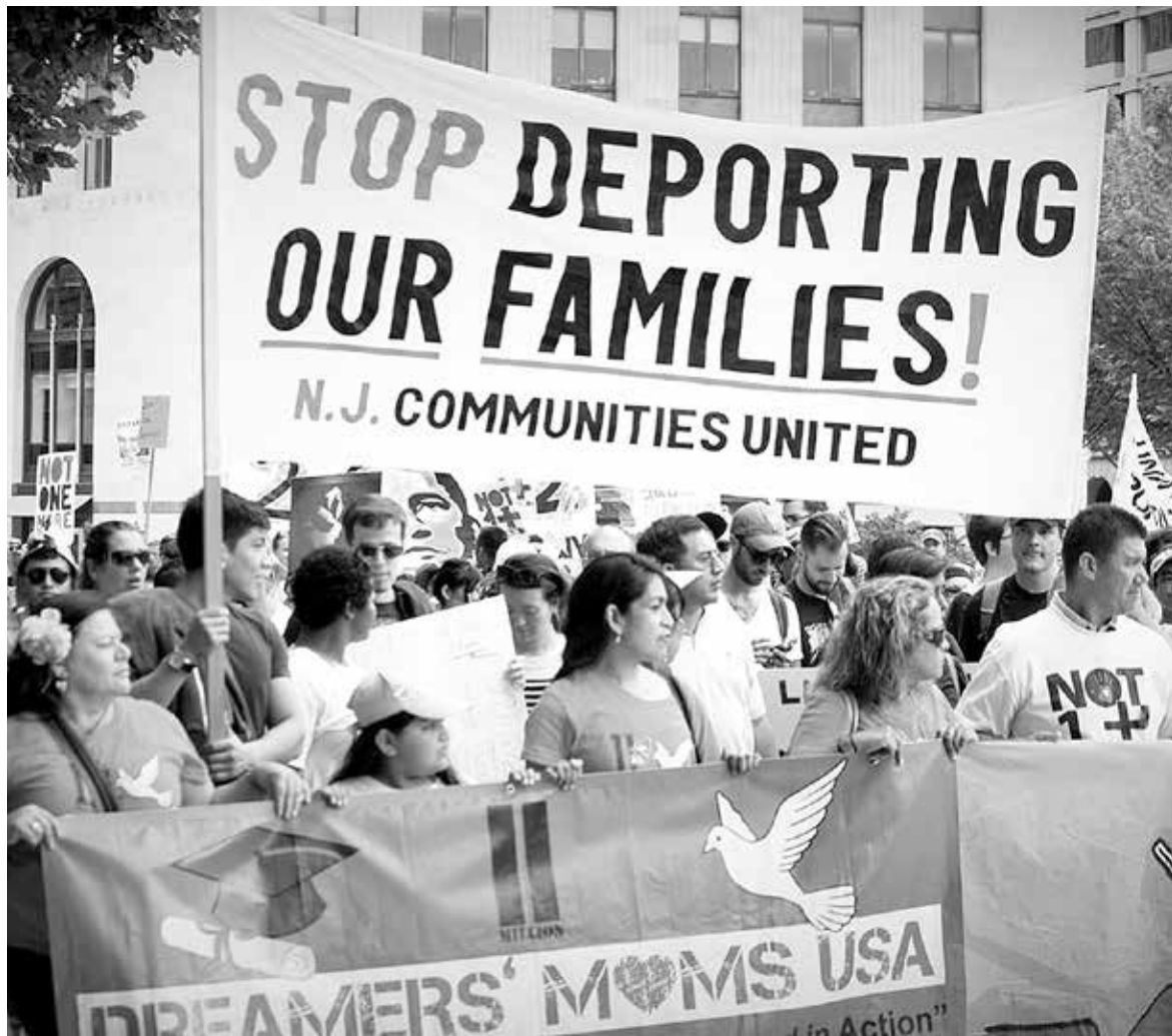
Protest for immigration rights in Boston, MA.