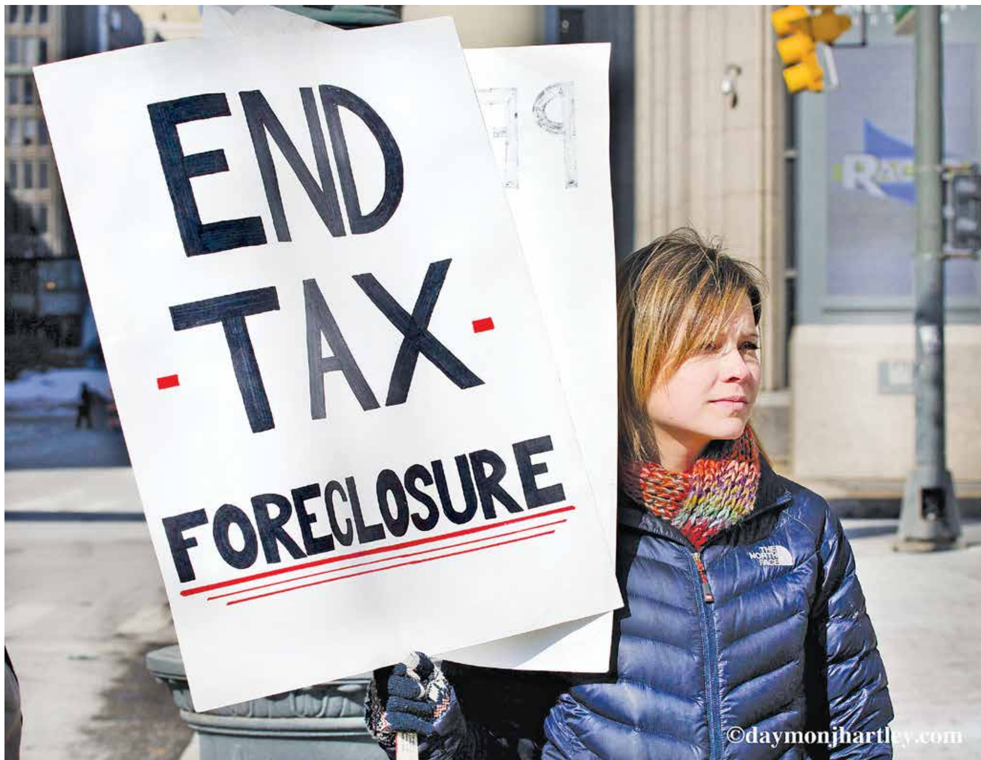
Protest against tax foreclosures on homes in Detroit, Michigan. Millions of families nationwide, unable to pay their mortgages and property taxes, face homelessness as speculators gobble up their homes.