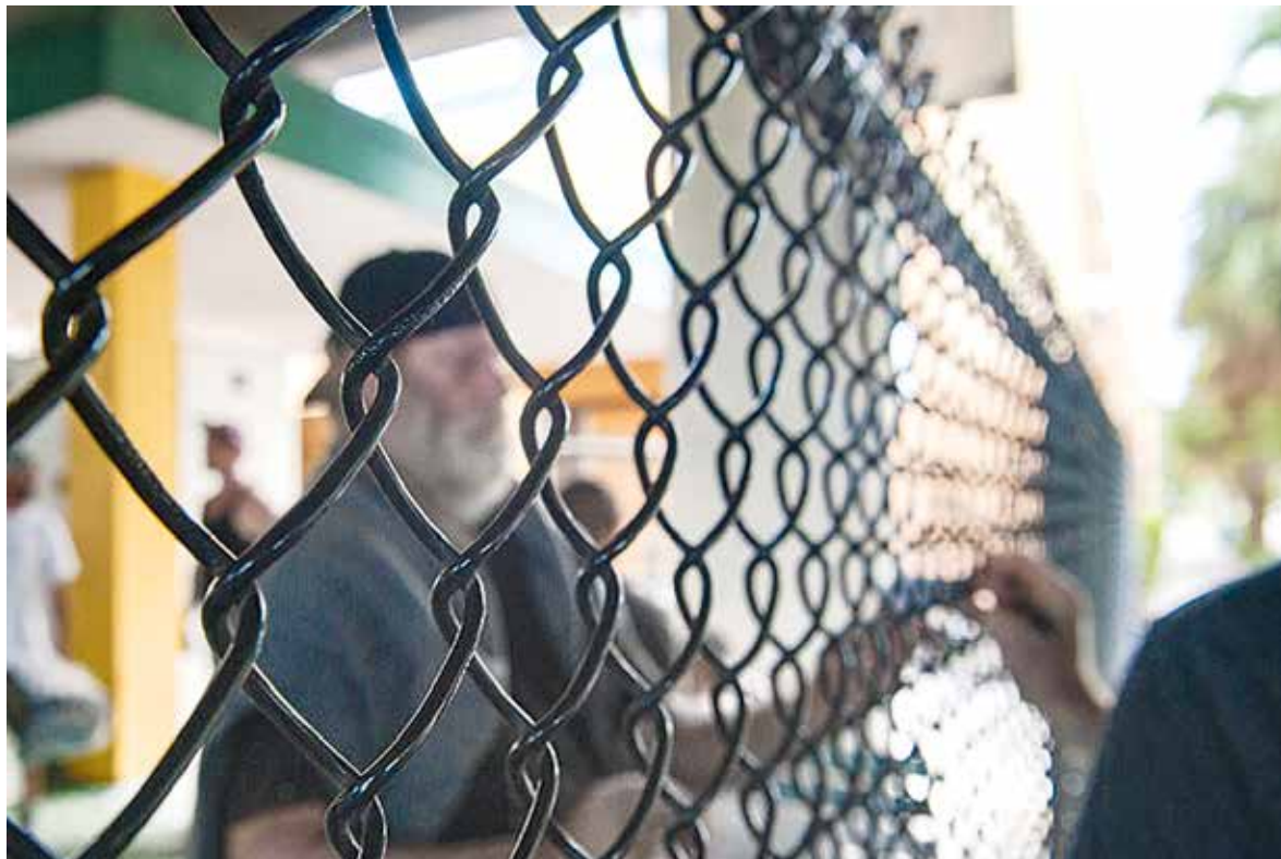
A homeless man speaks to reporters from inside a prison-like “courtyard” surrounded by a wire fence at a shelter in St. Petersburg, FL.