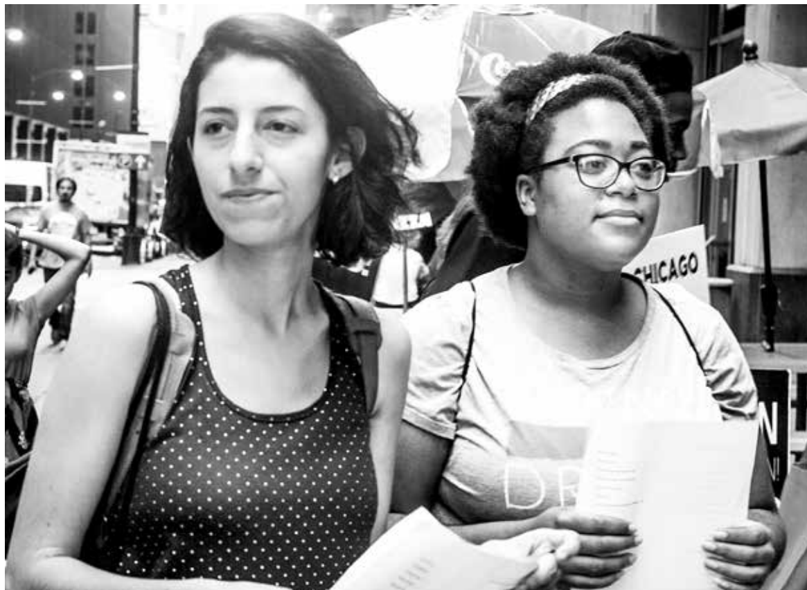
Chicago Fight for $15 activists gather in solidarity with New York workers whose $15 demand is before the New York Labor Board.

It is in the interests of the exploiters to keep us divided and confused. Given American history, to do so they must attack the