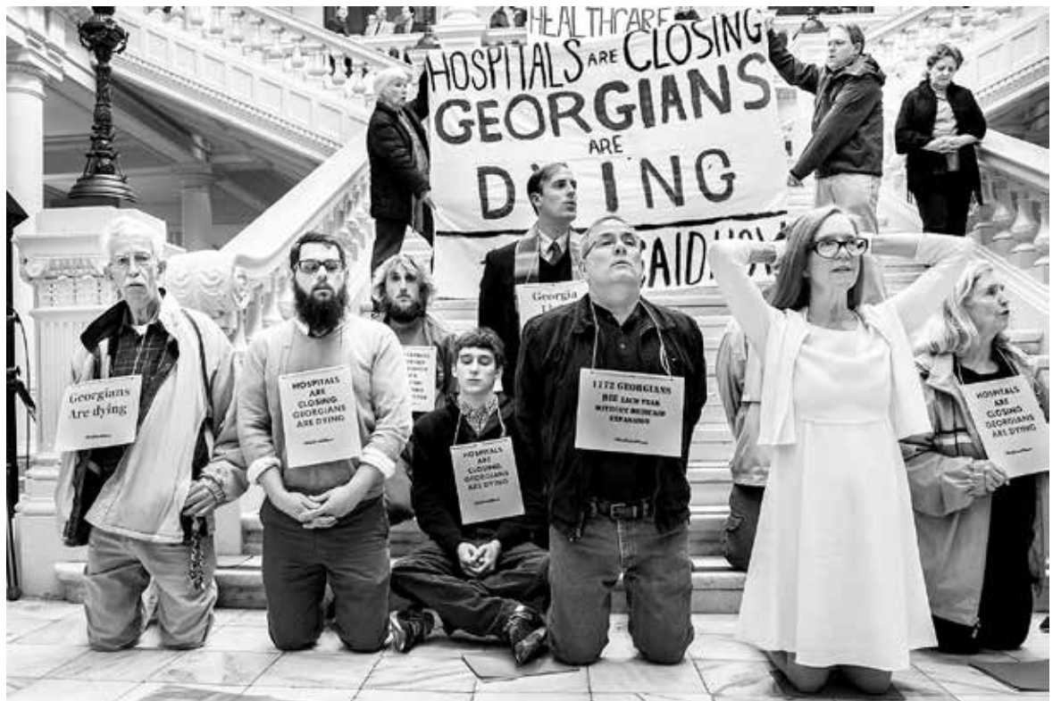
Protest in Atlanta, GA, where the governor vowed to not accept federal funding for Medicaid expansion; 1200 people died in Georgia last year due to a lack of healthcare.