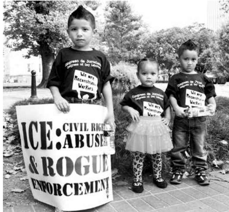
Immigrant leaders and children protest raids and deportations.

Revolutionaries must go on the offensive. They must show that every attack on any worker, whether they be immigrant, homeless, young or old, Black,