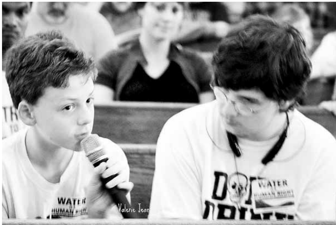
This boy's community is getting sick as a result of the poisonous Flint water. His mother's health deteriorated with no one held accountable.