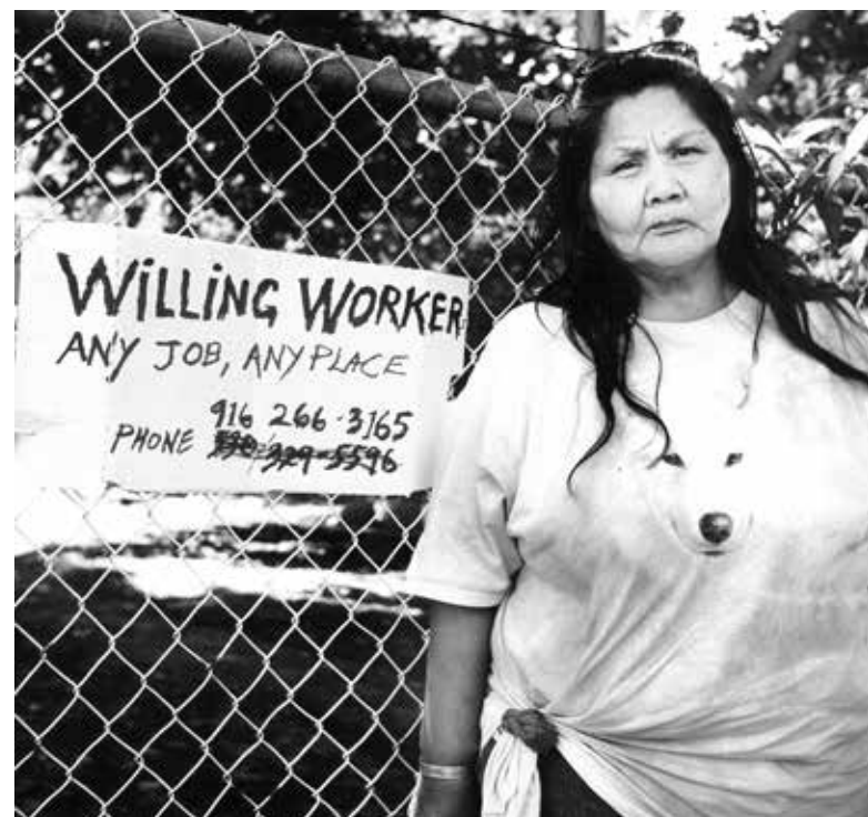
Homeless unemployed worker in Sacramento, California.

From rent strikes and mass resistance to evictions during the Great Depression, to the labor coalitions that fought for (segregated) New Deal housing programs, to the Civil Rights-era uprisings which demanded civil rights, tenants’ rights, and economic justice—the right to housing has only been