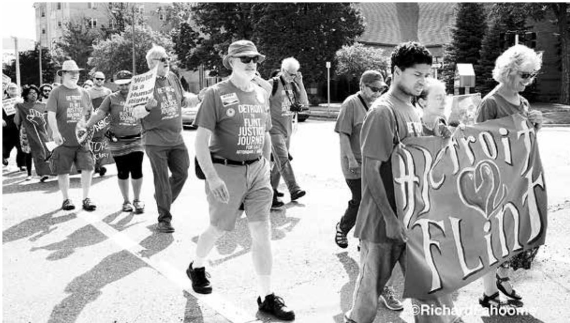
Marchers on a “Water Justice Journey” from Detroit, where thousands have had their water cut off, to Flint, where people are becoming ill from their water.