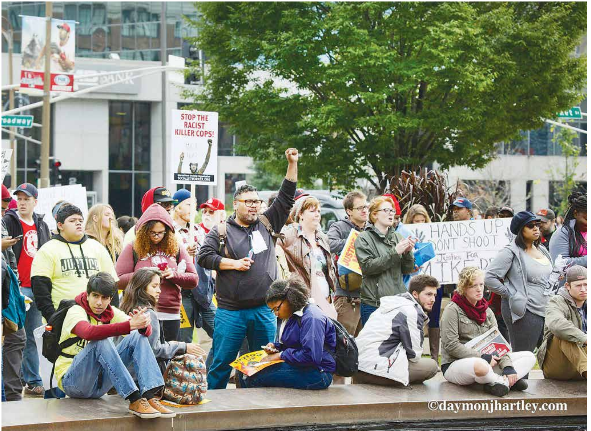
Crowds gathered in Ferguson, MO, a year ago to protest the police murder of teenager Mike Brown. People marched in Ferguson recently to mark the one-year anniversary of his death.