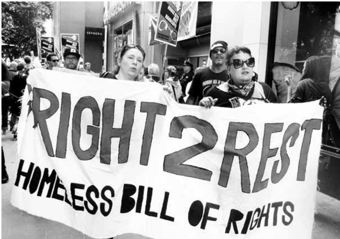
Homeless leaders march against criminalization of the homeless in San Francisco in July.