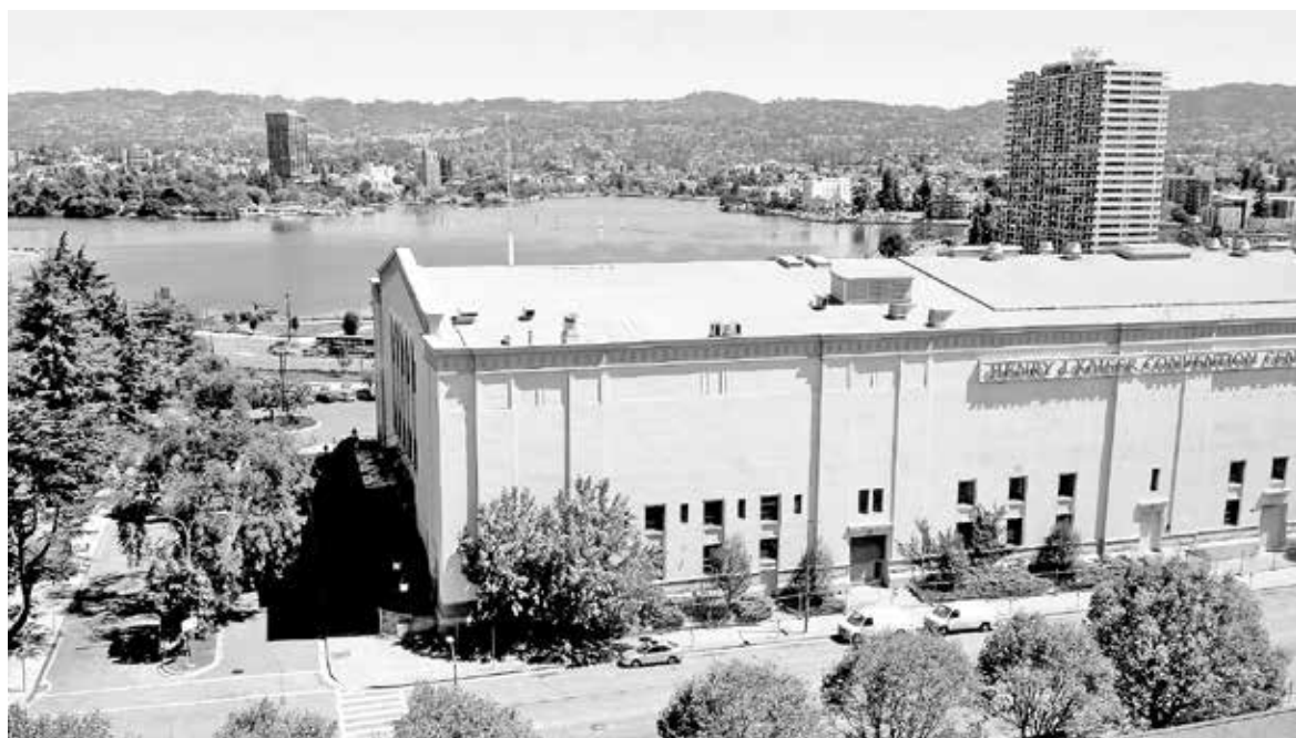
Gentrification in Oakland, CA targets Lake Merritt and the Kaiser Auditorium, as seen from Laney College.

Massive property grabs are transforming public spaces in Oakland into commodified territory controlled by militarized police and private security forces. The southeast end of Lake Merritt park has been modernized and Oakland’s City Council just voted to privatize the Kaiser Convention Center on this land. The massive building publically owned since 1914, will be filled with shops, entrepreneurs and trendy eateries, rather than the original plan by a local, community-based group to make it into a multi-purpose community center with adjacent Laney Community College to produce 1700 jobs, many for students!