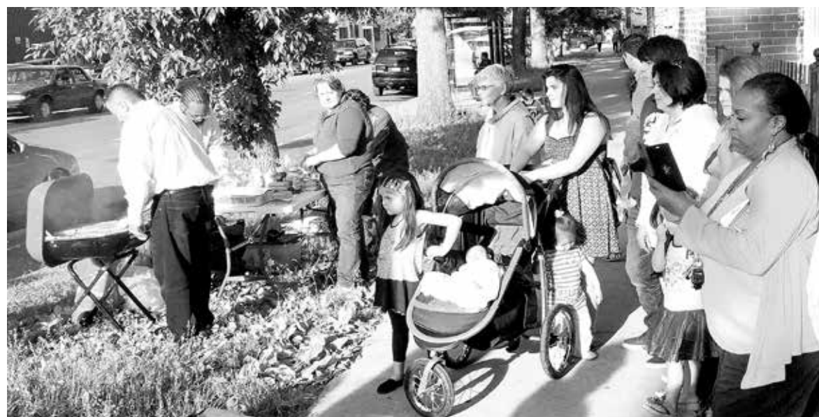
Vigils like this one in the West Humboldt Park neighborhood of Chicago are asking questions and trying to unite to protect the lives of people in the communities.

Mothers wearing pink t-shirts with “Mom Patrol” written across the top, set up card tables and cook food for neighborhood children. “Once, we were singing happy birthday to a kid and an officer drove by and flipped us off. Another time, an officer