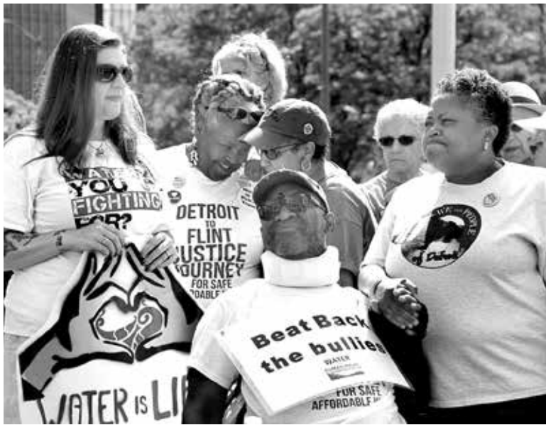
Marchers on the “Water Justice Journey,” a 70-mile march from Detroit to Flint, MI to unite people statewide in a fight for water as a human right.