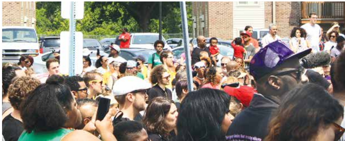
A diverse crowd gathered for the one-year anniversary of Mike Brown's execution by (former) police officer Darren Wilson at the site on Canfield Drive in Ferguson, MO, August 9th.