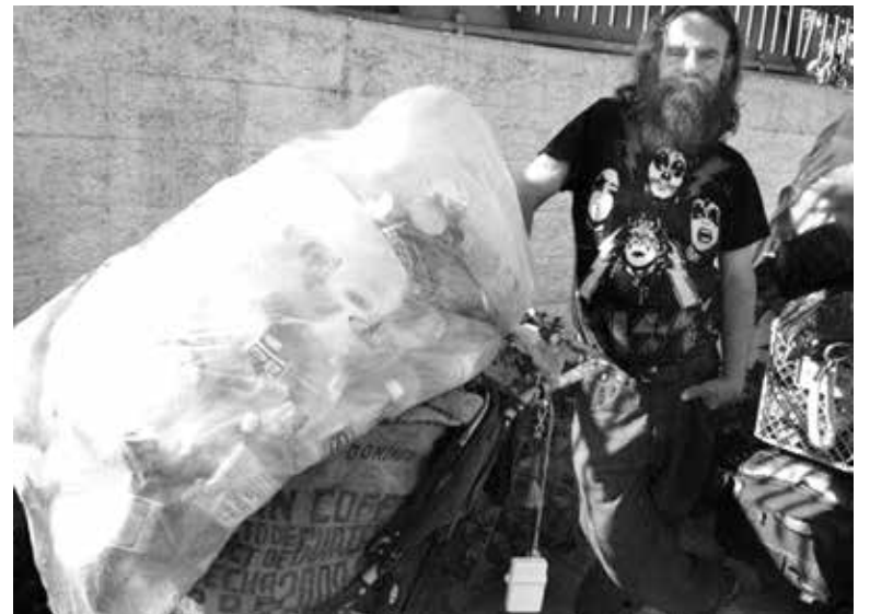
Every morning, men and women line the sidewalk outside the San Francisco Community Recyclers center with their shopping cart or bags of bottles and cans to redeem for their survival.

More and more, the struggle of our day and future will be to get an economy that matches current production. Meaning we need a system of distribution that matches the system of production. Meaning we need to abolish this way of doing things and replace it with a communal society. This is not utopian thinking. And in the future, it is the most practical solution, as the owners of capital