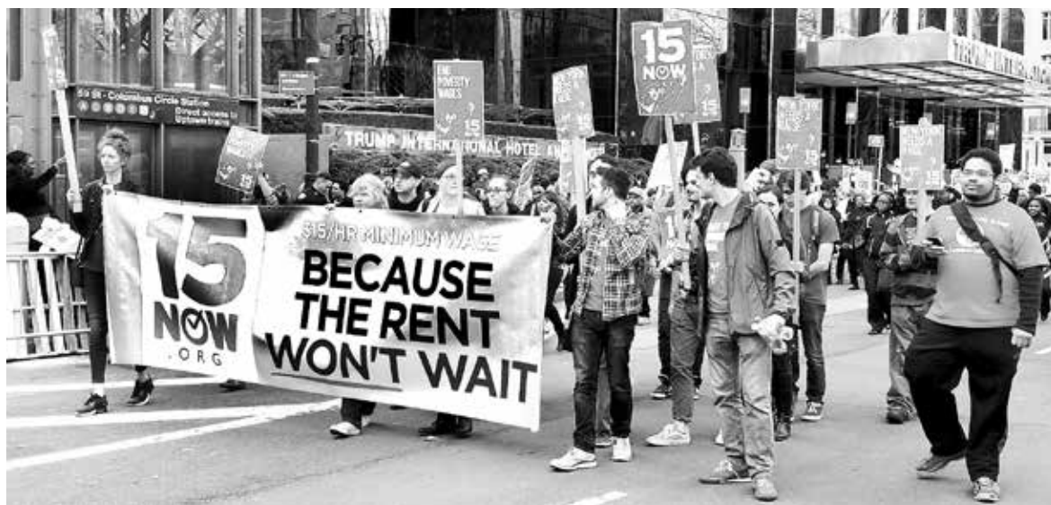
Struggle for minimum wage in New York City. Recently, Los Angeles, CA became the largest city in the U.S. to raise the minimum wage to $15. The fight for $15 is part of a growing movement worldwide.