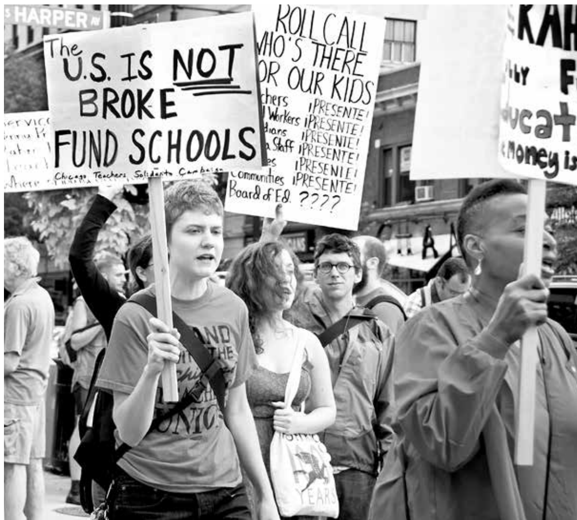
Demonstrators protest the closure of 49 schools in Chicago, 2013.

Those who suffer the most at the hands of the ruling class, those who are losing everything, will be the primary force for building a cooperative society that benefits everyone. No longer pitted against each other, people of all nationalities, skin color,