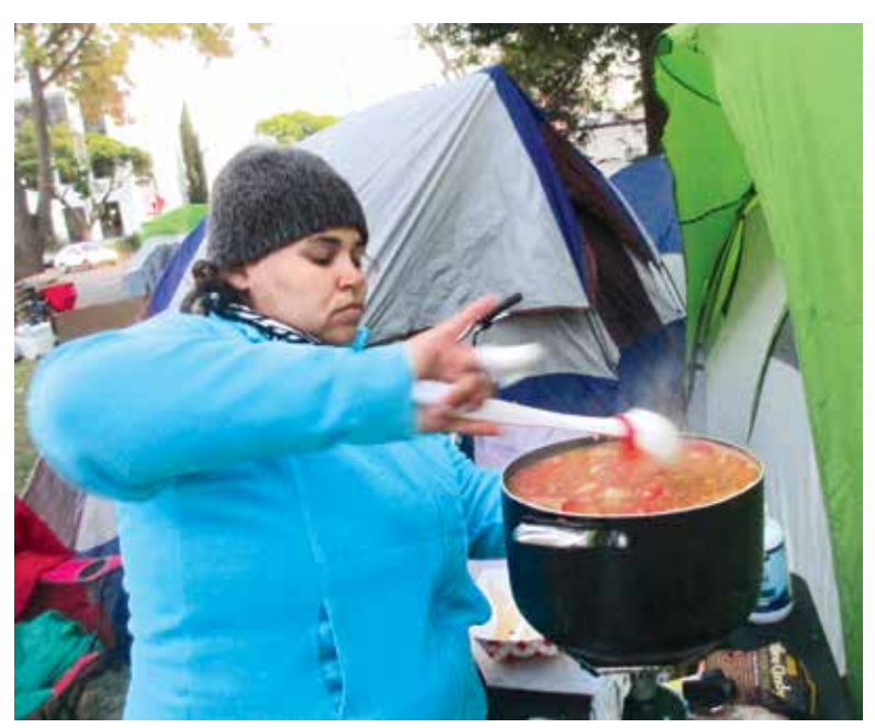
Occupiers at Liberty City, Berkeley City Hall in California.