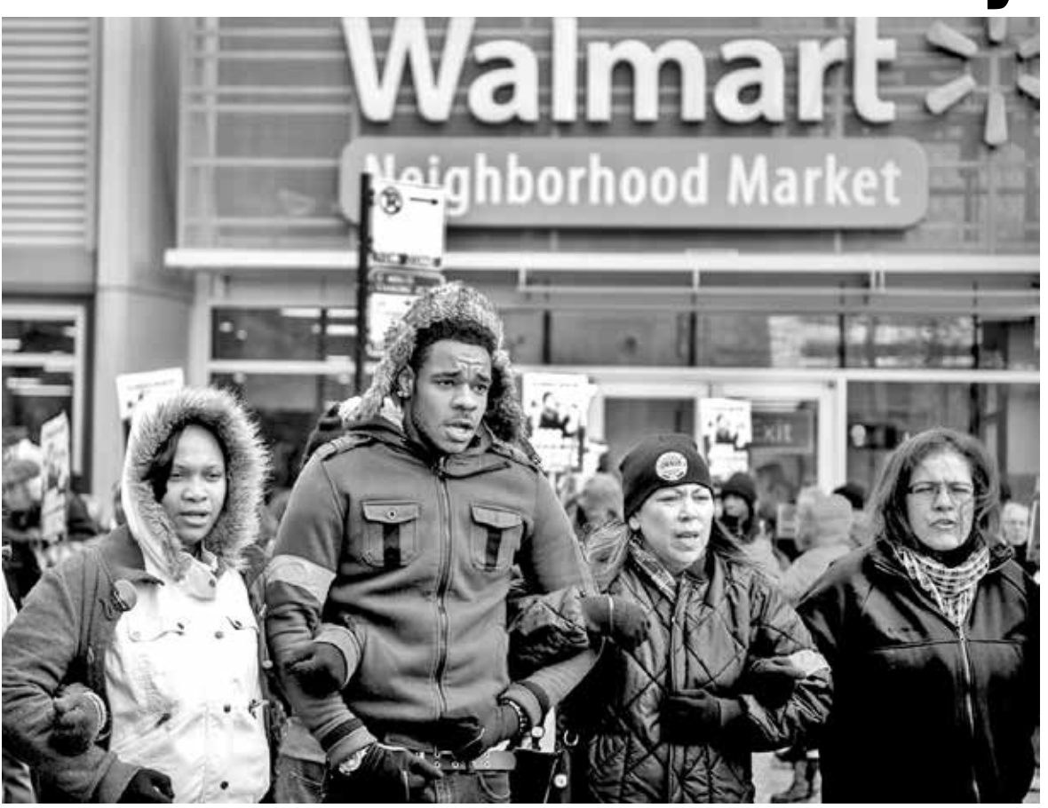
Protest of low wage workers against Walmart in Chicago.