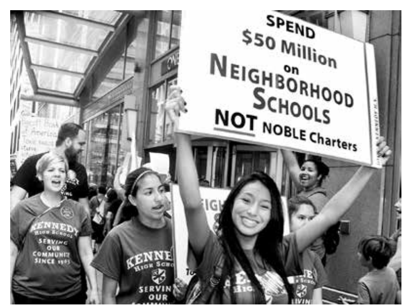
The Chicago Teachers Union pickets the Board of Education last year. Now, after the closing of 50 schools, teachers face mass firings of up to 5,000 if they don't take the contract offer of Chicago Public Schools.