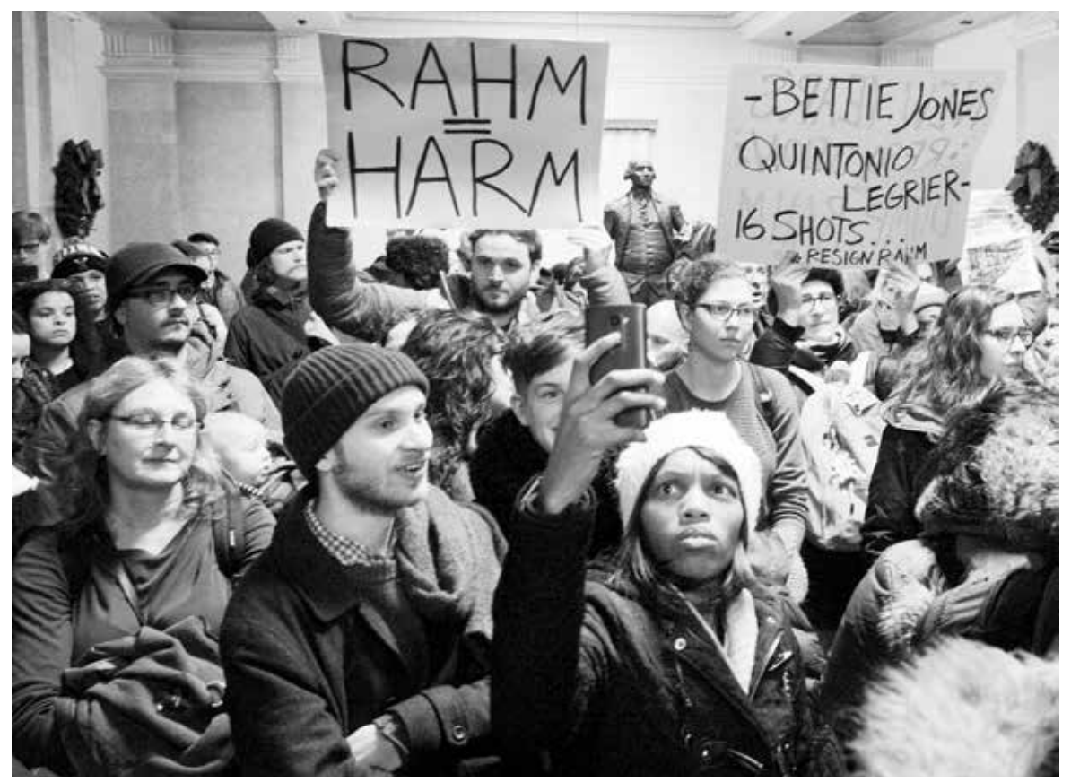
Chicago protest against more police killings, this time of a 55-year old mother and 19-year old engineering student. Demonstrators want the Mayor out.