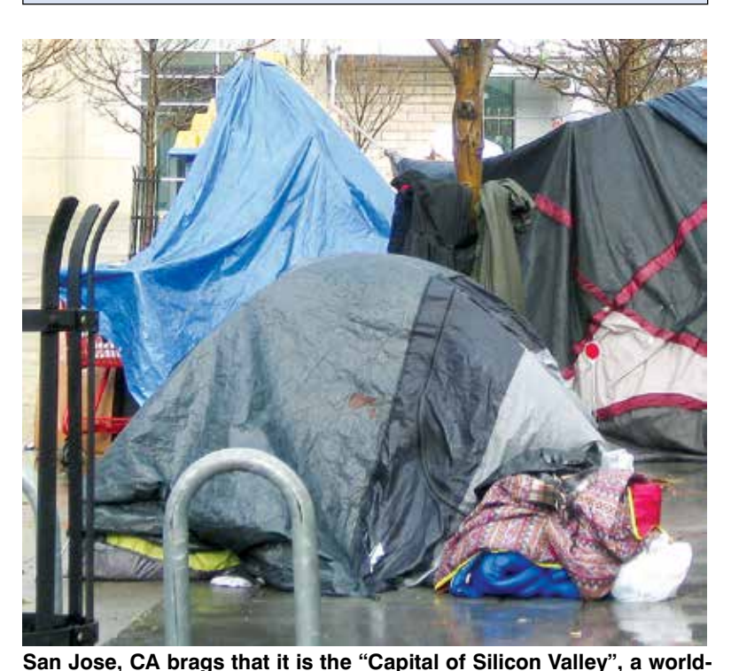
class center for technology and innovation, but it cannot even provide basic human necessities for its people. Thousands are homeless, forced to live in tents outside in the rain, like these on the doorstep of San Jose's futuristic City Hall.

The homeless and their advocates understand that sanctioned encampments are difficult to operate, just as they understand that homeless encampments are not an acceptable solution for homelessness. But, the homeless also understand that no solution is possible unless the community and its government agencies recognize that the homeless (and low-income renters) have rights and are willing to defend them. At least for the moment, in Santa Clara County, this first crucial step has been won.