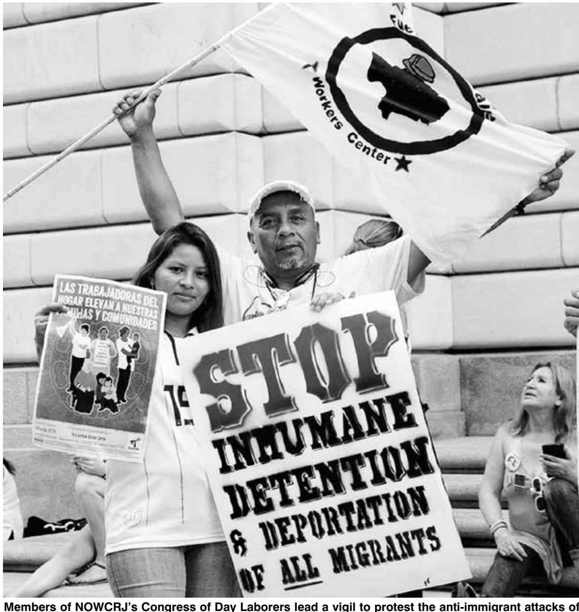
Members of NOWCRJ's Congress of Day Laborers lead a vigil to protest the anti-immigrant attacks of Louisiana Governor Jindal. Immigrant workers are part of our working class.