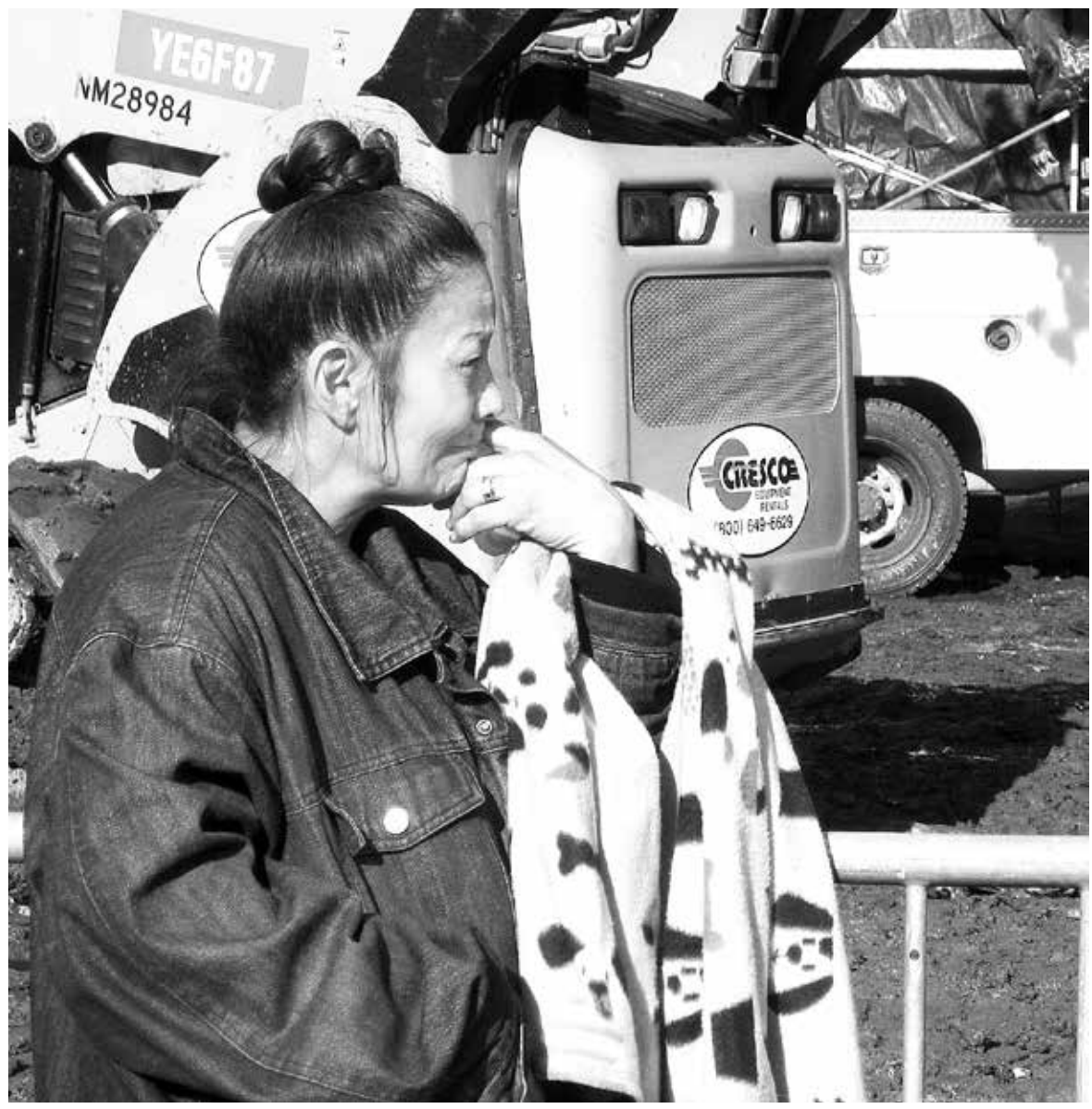
A former resident of San Jose, California's "Jungle" encampment weeps as it is destroyed by bulldozers supported by city police in December 2014.

The corporate ruling class has for decades painted the home-