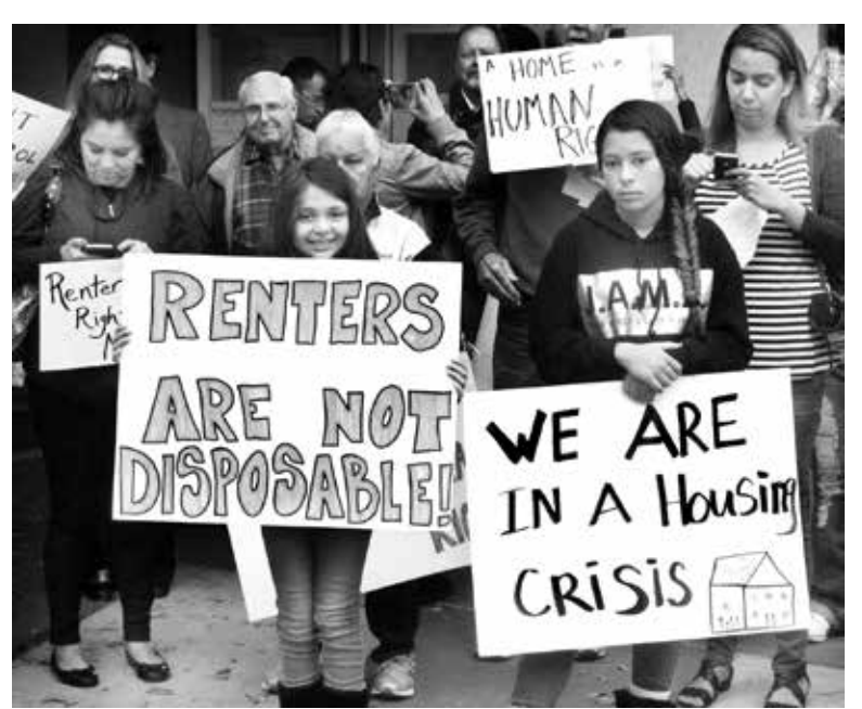
The high-tech economy creates a dramatic polarization of wealth resulting in workers facing high rents, low wages, or no jobs. Yet, the capacity exists today to feed and house every human being on the face of the earth.

When we talk about vision we're talking about what's possible—we're not talking about dreams. Everybody on the street knows that they're getting more and more production today with fewer and fewer workers, and the time is around the corner where we're going to get that production with no workers. There won't be any work—the kind we could call work today won't exist. Nobody today chops the ground with a wooden plow—they don't do that anymore. It's not necessary, and neither will work be necessary in the coming period of time. So what kind of a world are we going to have? We're going to have a world that's possible based upon