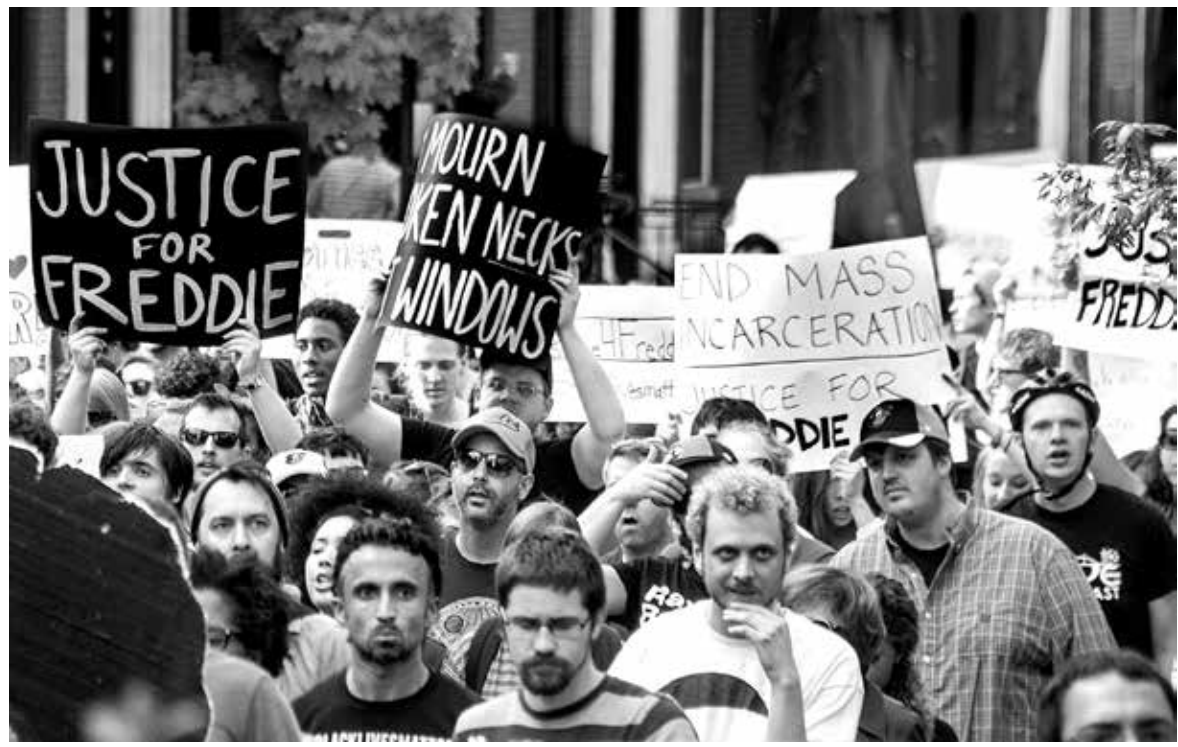
Protest for justice for Freddie Gray who died in police custody in Baltimore, MD.

Police violence might appear to be just racism. There is no doubt that it is racist, but it is becoming apparent that it is directed against all types of working people. As more people are losing their stake in the "American Dream" to robots, they are served violence. The billionaire