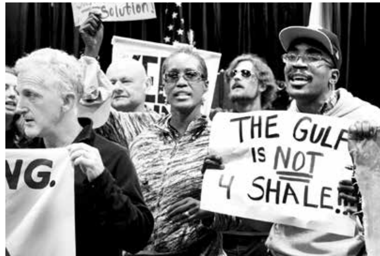
Protest in New Orleans over the oil spills in the Gulf of Mexico. Protesters took over the auction of oil leases.