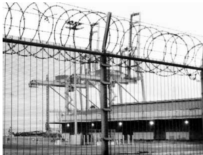
This razor-wired fence, near a temporary shelter for the homeless on the San Francisco waterfront far from any services, has the look of a prison camp.

People say it's irrational for cities to behave this way—because it is inefficient in solving the problem of homelessness. It doesn't help people and it isn't cost effective for the city itself. So, what motivates this criminalization of the most vulnerable population of the city? The politicians and decision makers truly do not care