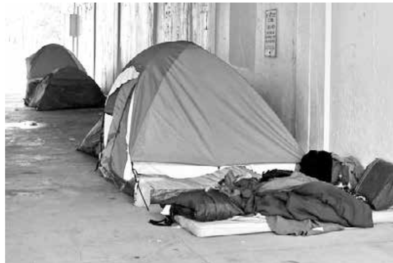
Tent city under the viaduct beneath Chicago's Lakeshore Drive, an area where some of the most sought after properties for the wealthy are located.

who are displaced, I am reminded that God has chosen to dwell among them. And I believe it is where God's people are to pitch their own tents. We are to be on the move with God, occupying the places where there is pain and suffering—where there is injustice and oppression. It is among these tents that we will meet God face to face. It is among these tents that we will hear God's voice, reminding us to seek the justice that leads to peaceful habitations. It is among these tents that we will learn to seek the “kingdom of heaven” where everyone is welcomed and everyone's place is restored.