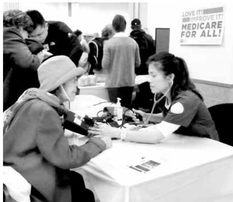
Attendance was up at the yearly winter health fair for the homeless in San Jose, CA. Life expectancy is 78 in the U.S., but 42 to 52 years for the long-term homeless.

Programs like health fairs are incremental at best. But, the