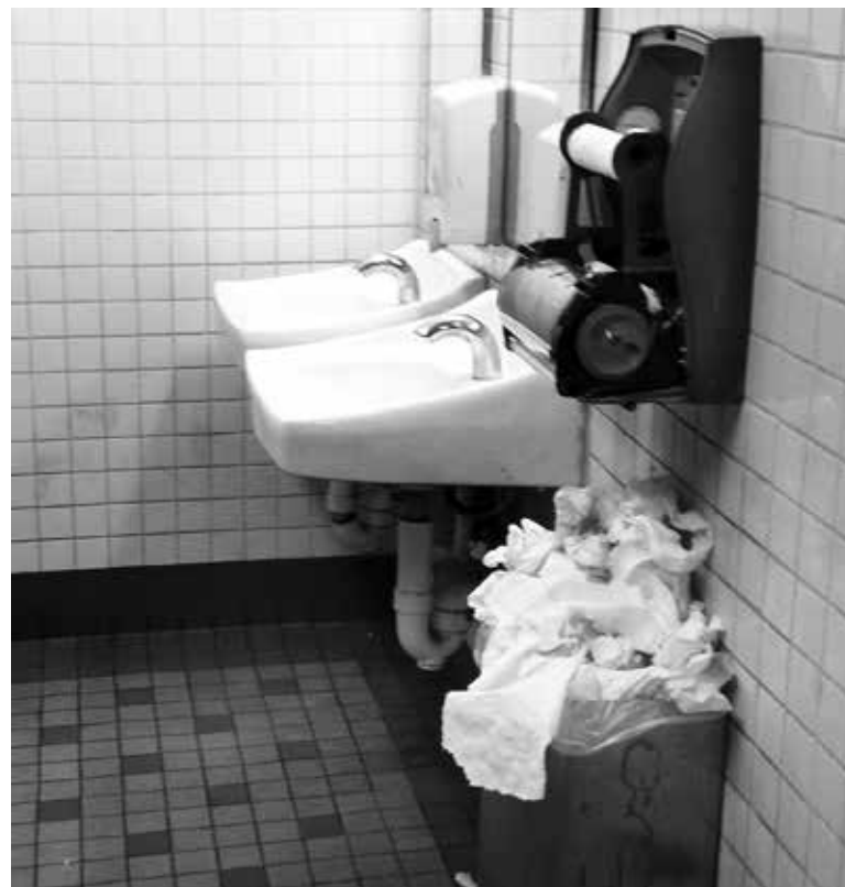
Students ask where to find a working bathroom at Laney College. This one has 1 broken sink, 1 broken towel dispenser, 1 overflowing trash container. Faculty are told if more janitors or maintenance engineers are hired, it will come out of faculty salaries.

Regardless of whether we matter to corporations or to a government they control, we matter to each other. Real value lies in the relationships between human beings, and when we stand together to demand that our schools be safe, healthy, dig-