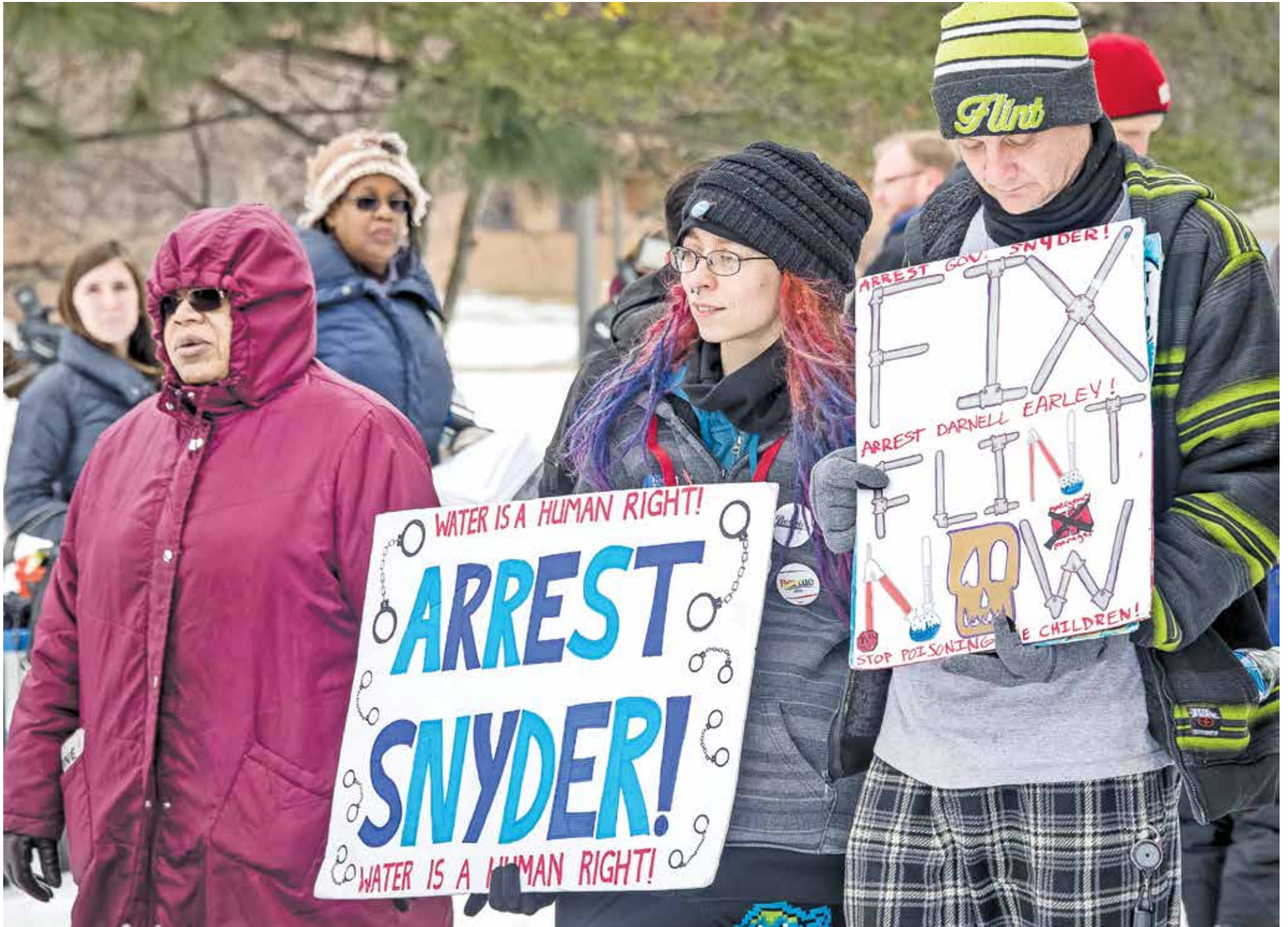
Flint residents brave the cold to protest the poisoning of their water. The city's former Emergency Manager, a dictator appointed by the governor, switched to a polluted water source over the objections of the community, resulting in water contaminated with lead and other toxins.