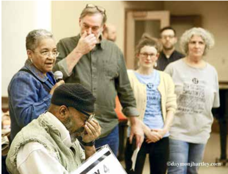
Five of the Homrich 9 defendants. They are charged with civil disobedience for blocking trucks contracted by Detroit's governor appointed Emergency Manager to shut off people's water. Democracy was attacked further in the trial of two defendants. Prosecutors, fearing they were going to lose the case, dismissed the jury and put the trial on hold.