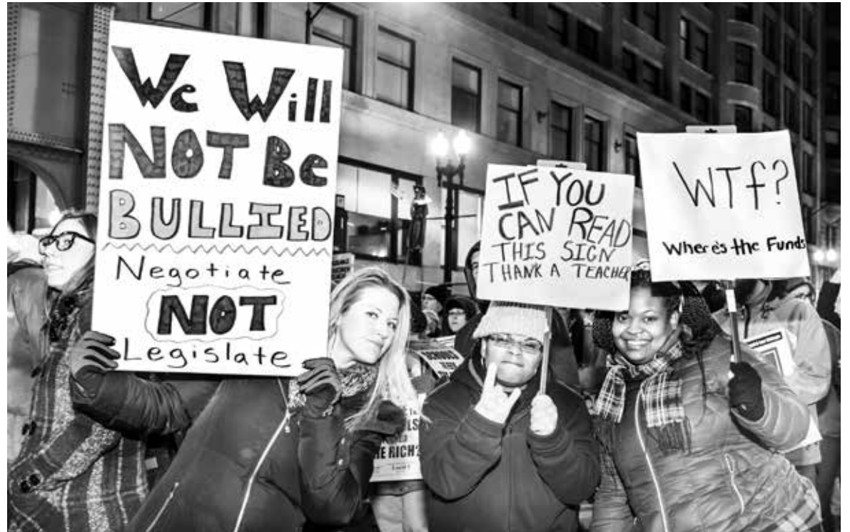
Chicago Teachers Union rallies for a fair contract.

Leaders of the Chicago education movement are learning the toxic lessons of Detroit’s public schools and Flint’s water crisis. Emergency manager dictatorships in Michigan are seen as threats of what might happen here. Rauner has already threatened to take over CPS, declare bankruptcy, and gut pensions, wages and the union itself. We are learning of cover-ups of asbestos and lead in Chicago public schools, reminiscent of Michigan. Chicago, Flint