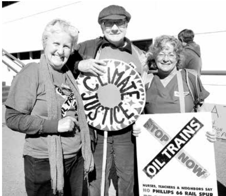
Members of California Nurses Association attend the rally to stop the oil trains in San Luis Obispo. Public safety threats from the trains include oil spills, fires, and explosions.