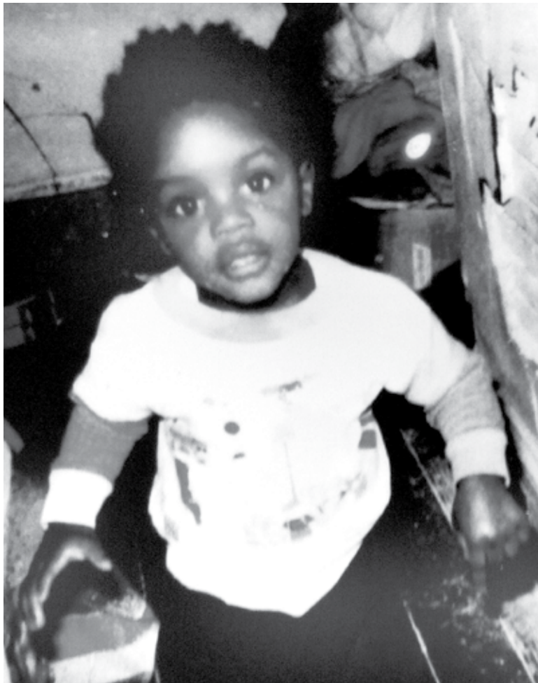
Freddie Gray as a child. Gray died in police custody in 2015 at the age of 25. He and his two sisters were found to have damaging lead levels in their blood from lead paint chips that fell off the walls when they were children.