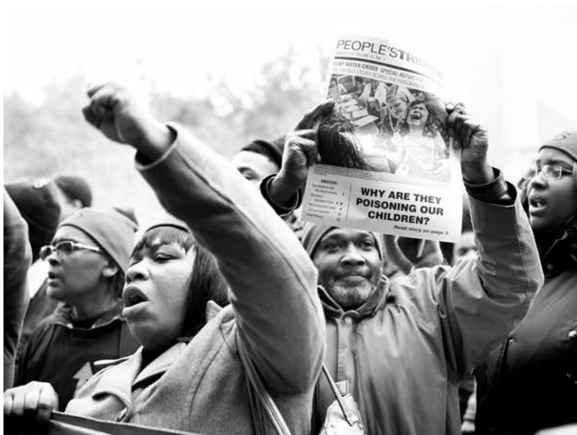
The Fight for 15 Movement protested outside of the Democratic Debate in Flint, MI in March.

Contact the People's Tribune to order copies to distribute in your communities and electoral campaigns. Call 800-691-6888 or email info@peopletribune.org or order on the web at peopletribune.org .