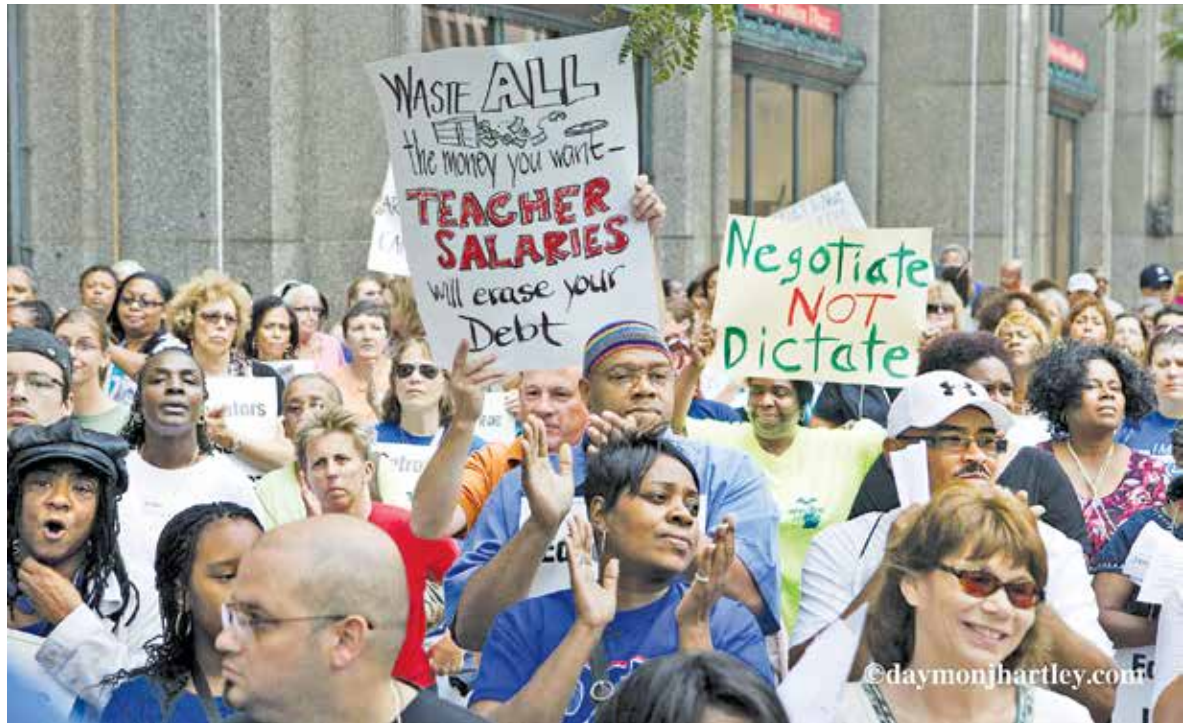
Detroit teachers and supporters protest back in 2012 against the Emergency Financial Manager takeover of Detroit Public Schools. Recently, it was exposed that Detroit public schools have widespread vermin, mold and barely functioning heat.

It is made clearer every day that the corporate government has no answers and no solutions for a discarded population who were once valuable to Detroit’s automobile and manufacturing industries, the denial is beginning to crack. New fighters come into this struggle every day as they connect the dots. Emergency management is one symptom of a dying capitalist system that cannot serve the needs of the many and survive.