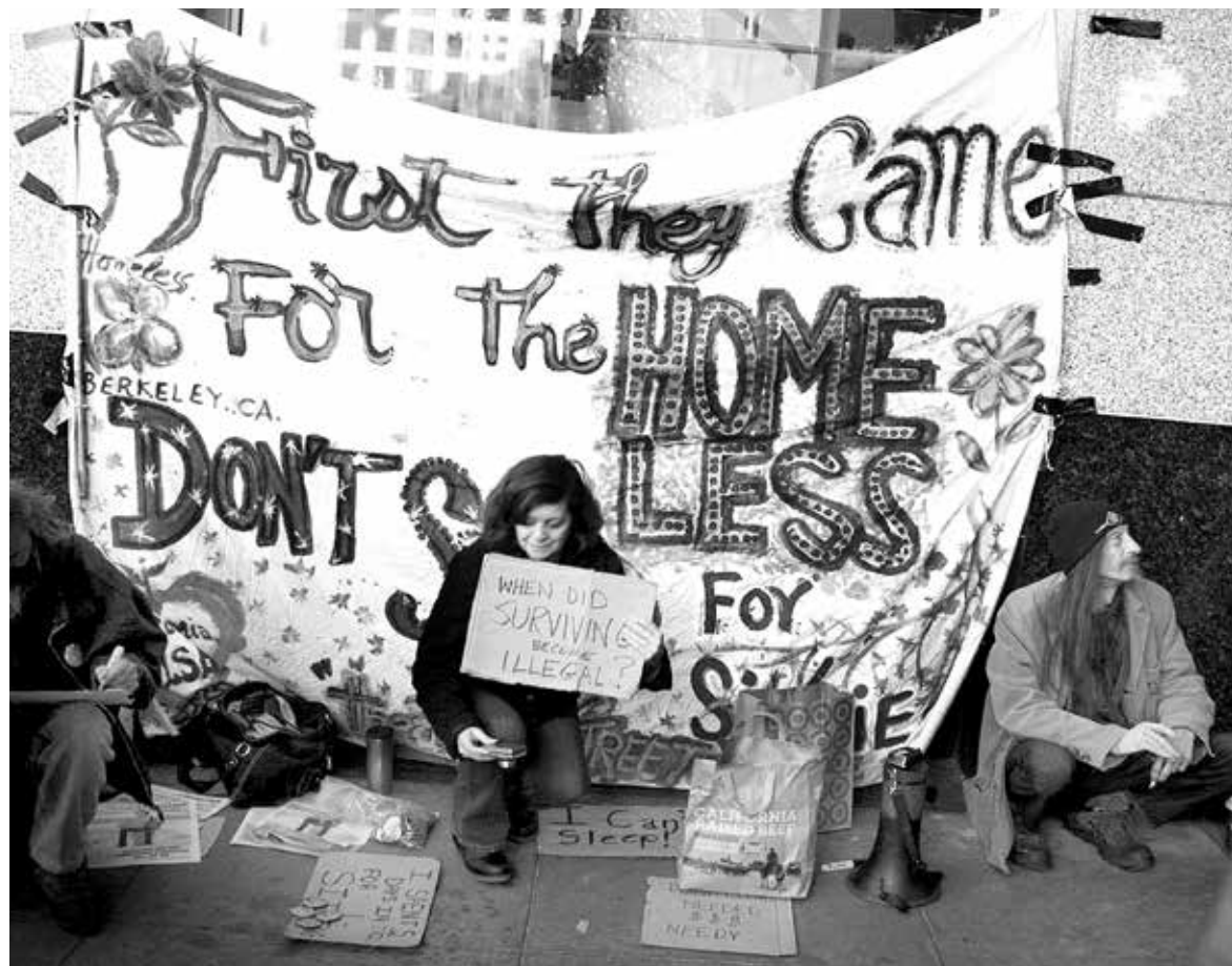
The homeless-led group, First They Came For The Homeless, protests San Francisco's notorious “sit/lie” law outside of Macy's, a big supporter of the law.

ous solution. Unfortunately “giving” something is bad. There is no profit in that. So, that is not an option. Allowing them tents for shelter will alleviate suffering, and provide storage, security, privacy, personal space, and most importantly, stability to improve their situation. Instead of allowing this, cities attack homeless looking to take care of themselves. They steal the people's gear, destroy personal possessions, medicines, identification, and tragically, memories. Pictures, family heirlooms, and such. This is done without regard for the law. And the cities get away with it because the homeless cannot fight back in the legal sys-