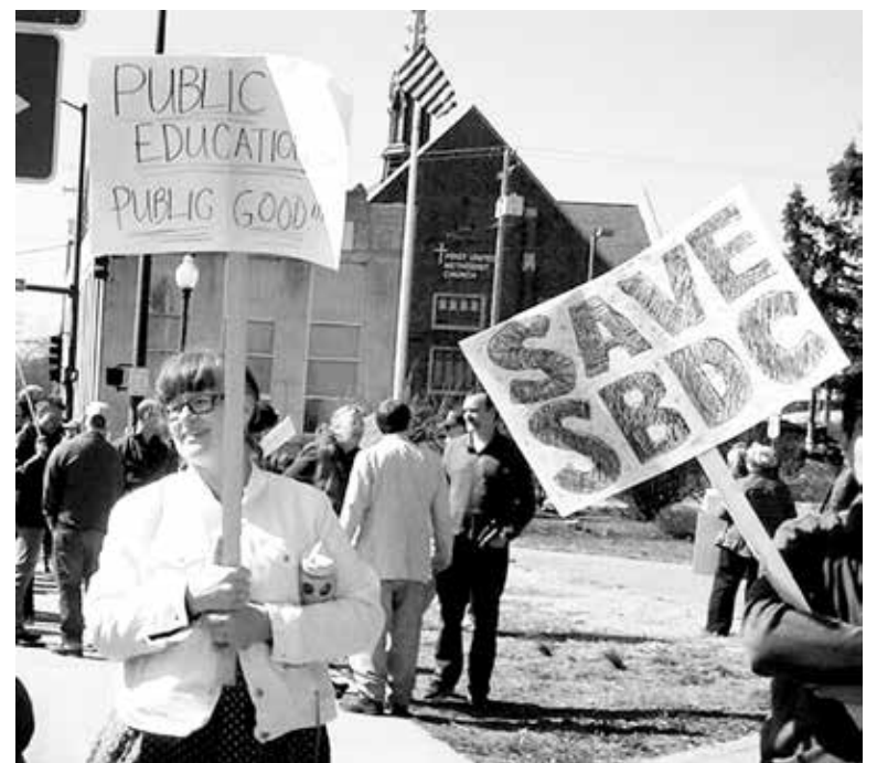
Protest over the budget cuts leading to layoffs of 55 employees at a community college in Southern Illinois. Academics are becoming disposable members of the working class.