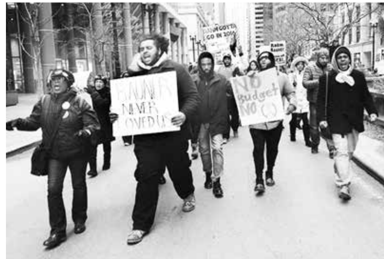
Chicago State University activists lead a protest in downtown Chicago at the State of Illinois Building. Without state funding, the university may close.

The students' cry of "Save CSU" has been joined by volunteers from the surrounding community who have formed a