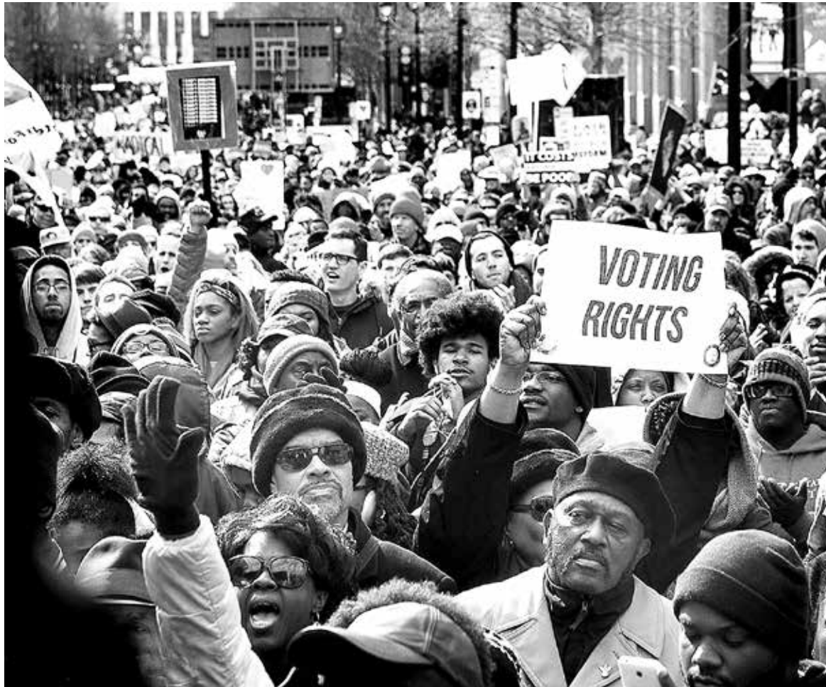
The "Moral March" in Raleigh, NC, is part of an important movement in the South for voting rights, public education, economic sustainability, workers rights and livable wages, healthcare for all, Medicaid expansion, the environment, and equal protection for all.

High-tech automation means the jobs are gone forever. The