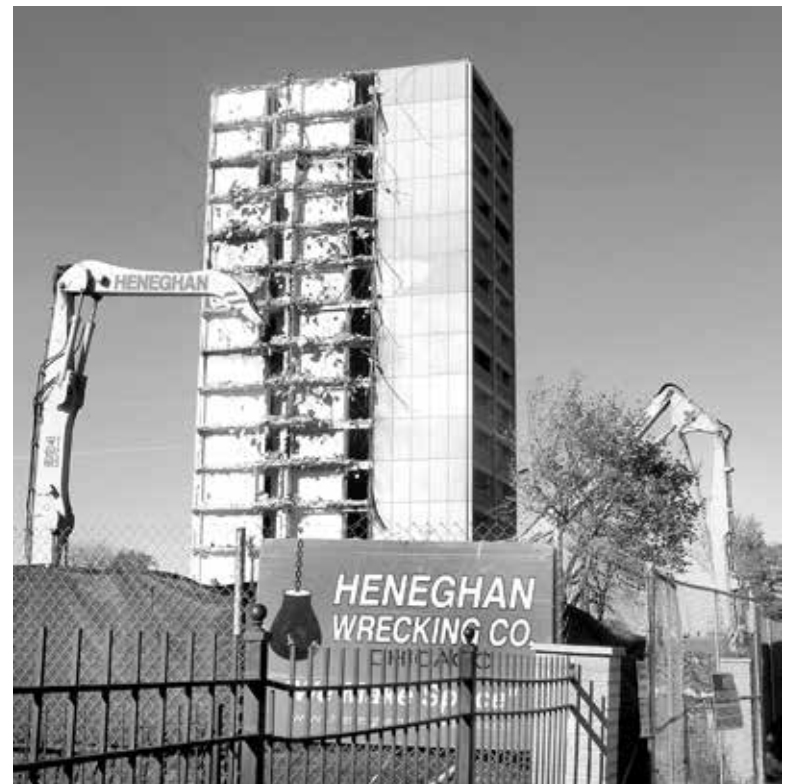
Private contractors tear down public housing units at Cabrini Green Projects in Chicago in 2011, paving the way to build more housing for the wealthy.

We must understand that when the system forces us to stand up and fight or lie down