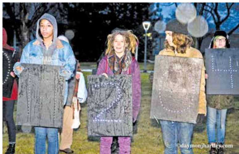
Protesters in Michigan against the massive water shutoffs to 34,000 households in the last six months alone.

MT: That's what they always say. I'm sure there were people in Germany who said I've heard about these bad things happening in the next township but 'they will never come after me. They came after the Jews but I was not one... then they came after the union organizers but I wasn't one... then they came after the welfare recipients but I wasn't one of those... then they came after the Detroit residents but I wasn't one. And then one day someone knocked on my door but no one was there to do battle. This nightmare is going to come to a theater near you unless you wake up.