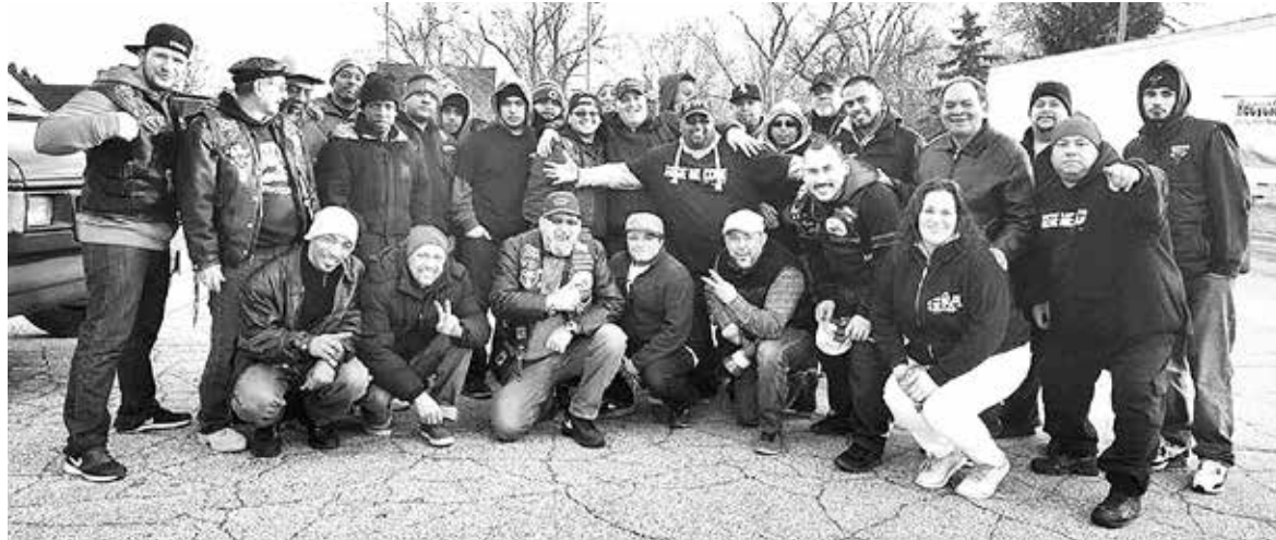
Car and motorcycle club members from Chicago's Humboldt Park join with other community leaders to bring water to Flint.

We organized the second drive in partnership with Humboldt Park United. These big, rough looking guys and women gathered tons of water. We