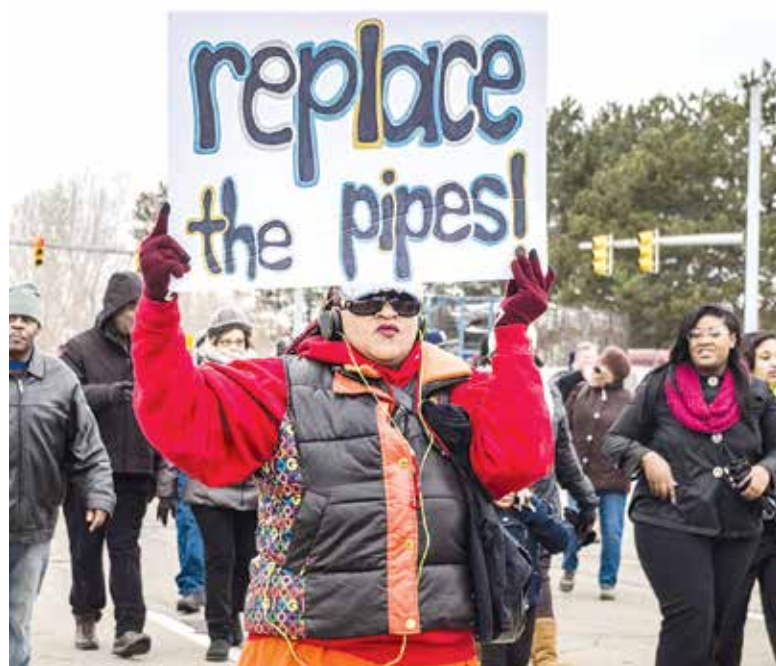
Protesters in Flint, Michigan express their outrage over the poisoning of their water. The decision to switch the water to the filthy Flint River was made by the governor appointed emergency manager over the protests of the community.

The struggle continues here in Flint and in Michigan. We are seeking disaster relief status from the Federal government to replace all of our lead pipes. We are demanding Medicare for all regardless of age to confront the enormous health challenges. Last but not least, we demand an end to the dictatorship system gripping ours and