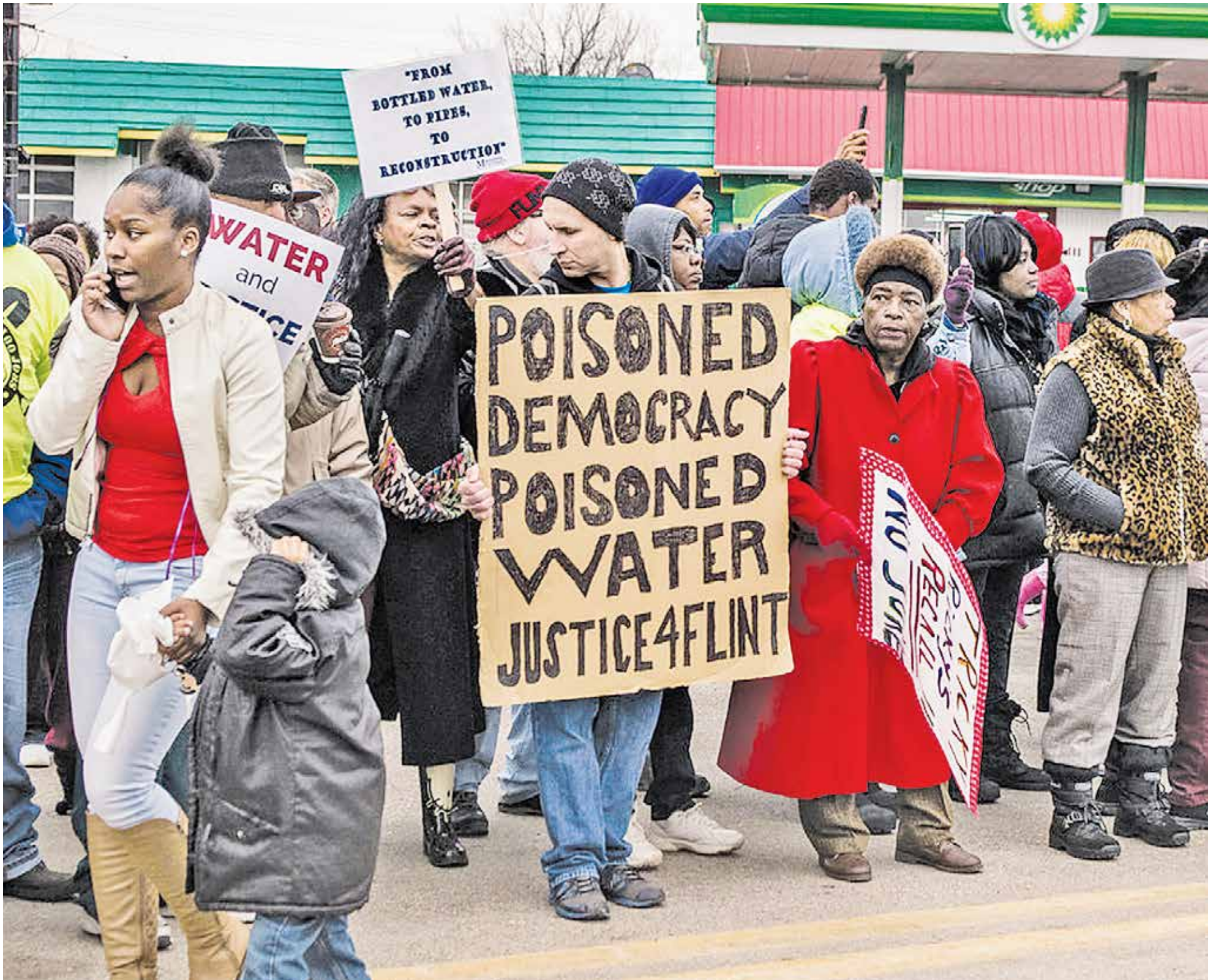
Democracy was denied when Flint's water was switched to the polluted Flint River over the will of the people by the non-elected state appointed Emergency Manager "to save money." As a result, a city of 100,000 people was poisoned.