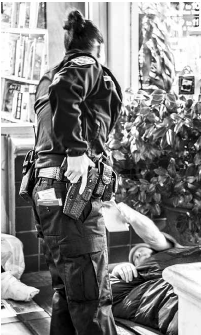
An officer with the Santa Cruz Police Department places her hand on her gun as she issues a citation to a man sleeping outside of a bookstore. The City Council voted to continue to criminalize sleeping.