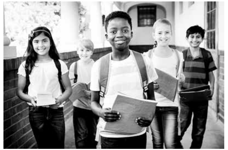
Can we have a public education system—not based on for profit enterprises—where all children are happy and prepared for opportunity and life-long learning in a new economy?

These corporate created educational methods and content could be what is holding back a lot of students from achieving success. This educational system creates another way in this society in which people feel hopelessness and their frustration that can erupt in detrimental ways. Are human beings being molded to fit