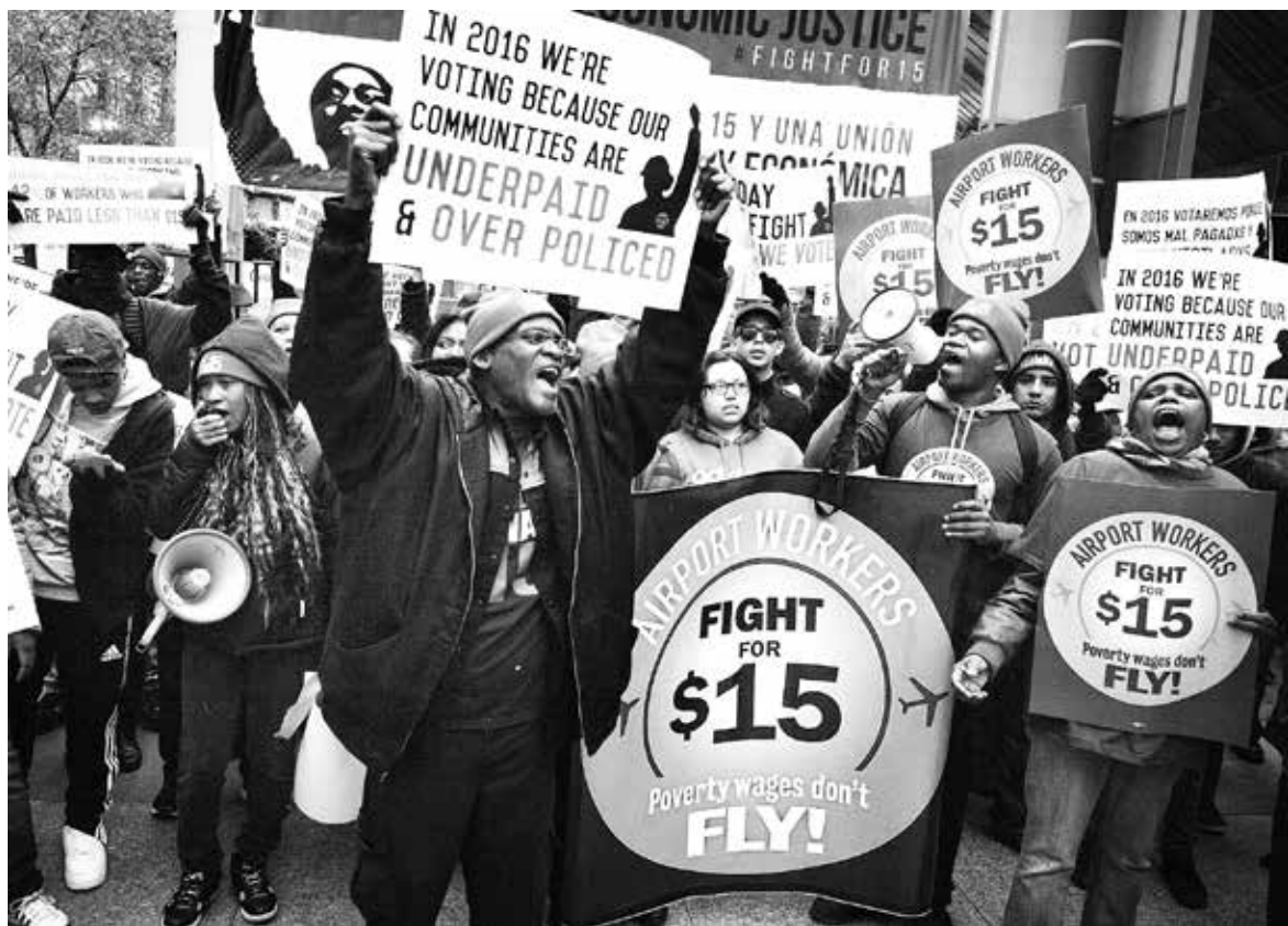
Airport workers join nationwide fight for $15 movement.

"The leaders, the practical leaders, must come together. They must embrace an understanding of what the solutions are. You can't do it without study, analysis of social development and educating the people about the true reality of what is happening in the country. We need to take books into the trenches. We must organize the preparation of young people around, science, history, current events. These steps are the path to reconnecting with what we have in common and creating a new future."