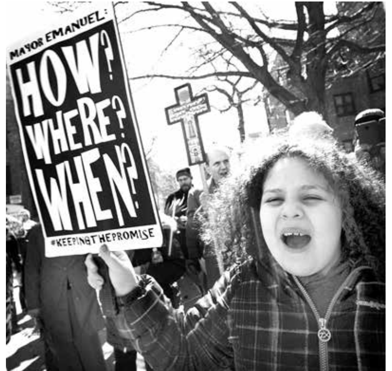
Palm Sunday brought faith and community leaders together to demand housing justice and an end to takeovers by the wealthy developers.

Cities across the country have used similar transformation plans to eliminate public housing and displace the poor. The battle to ensure that everyone has a home will continue in Chicago. The battle must continue because more and more families are being pushed out of their homes and into the streets.