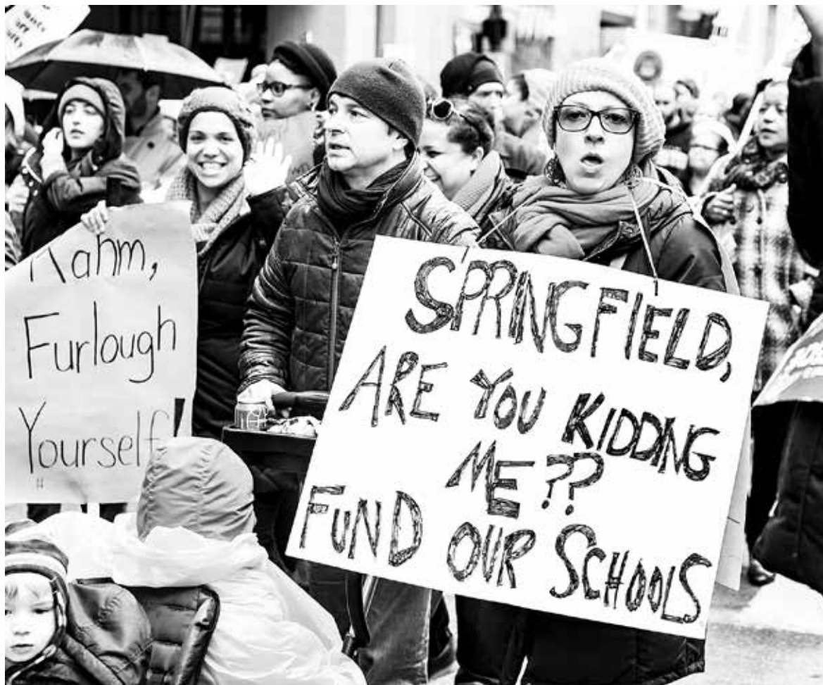
Chicago Teachers Union strike on April 1 for public funding for schools.

The planners of the April 1 "Day of Action" demanded funding sources that can only be gained from the State of Illinois. The consequence of this is a transition from scattered economic struggles toward political activity. Corporate giants like Pearson, Bill Gates and charter school corporations are merging with the government, demonstrating how this "privatization" is a merger in the interest of the corporations and making the government the target. Governor Rauner has threatened to take government intervention further, to impose an emergency manager dictatorship to strip union workers of their pensions and rights while taking over the public schools. From Michigan through Puerto Rico to Illinois and California: expanding emer-