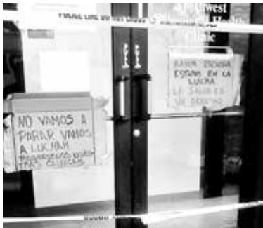
Closed Woodlawn Chicago Mental Health Clinic.