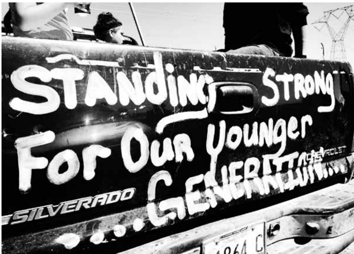
Protests at Standing Rock. People are standing together at Standing Rock to protect the sacred water.