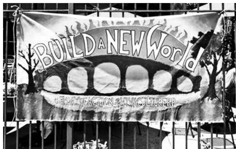
A banner for the Live Community Culture Day of Action hung outside the open mic at the Royal Coffee in Chicago.

We must remember and imagine our humanity like warriors. Our unity depends on creating a strong political and cultural opposition. Our ability to practice truth, tell stories, find joy, play music, give and receive touch and seek our own education cannot be privatized. LCC empowers artists and cultural workers to step into the spotlight as the bloodline of the united movement, encouraging each neighborhood to hear its own heartbeat. Caravans move from one neighborhood to the next diminishing borders and reclaiming public spaces as our