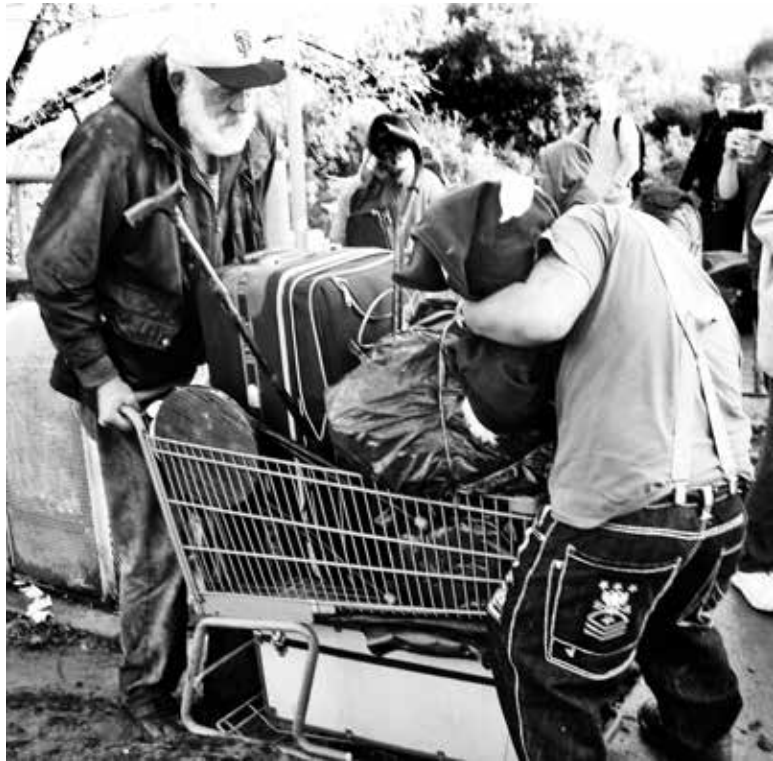
Two men pack all they own in a shopping cart during one of San Jose, CA's police sweeps of homeless encampments.