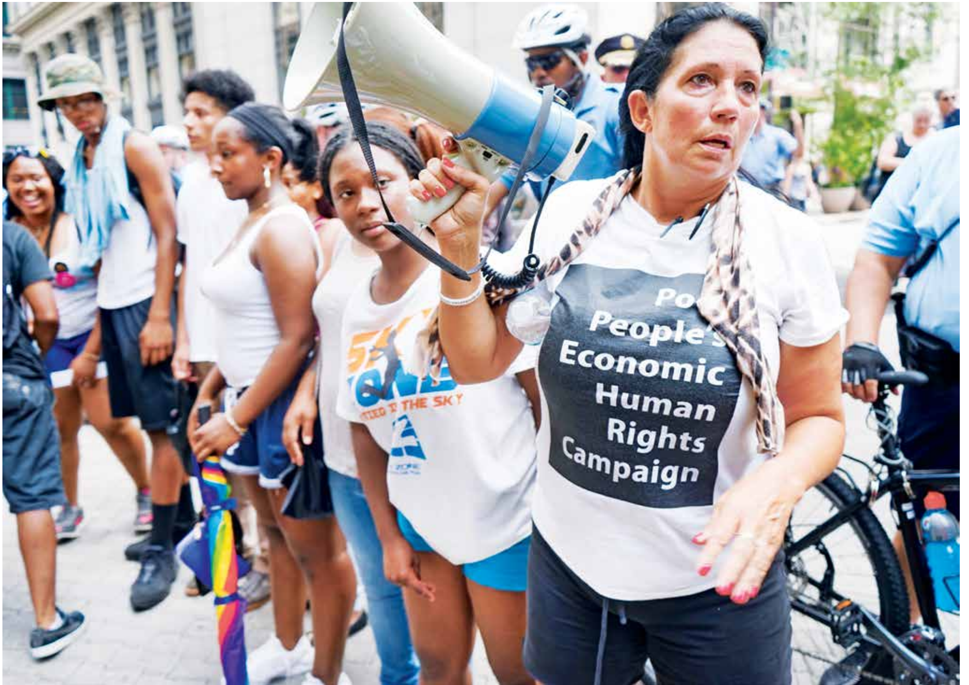
People suffering from the growing poverty in the country make their voices heard outside the Democratic National Convention in Philadelphia in August.