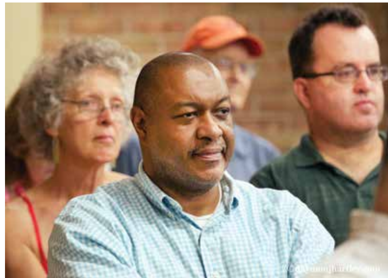
People listen to a report back from delegates to the Democratic National Convention at a Detroit Labor for Bernie gathering.

CH: A lot of people experienced a change in consciousness. They said, “Oh my God, the corporations have taken over both parties!” It was like a loss of innocence. At one point, 2000 people were outside chanting “Jill, not Hill!” for the Green Party candidate, Jill Stein. There were young people, people with disabilities, and homeless people. This is an important moment for our country. People will look back at 2016 and say, this is when the two party system started to change. People are looking for a new kind of politics, a politics that doesn’t take money from corporations and doesn’t sell itself to billionaires. This is where the movement has to go if we want to end the poverty that is crushing our people.