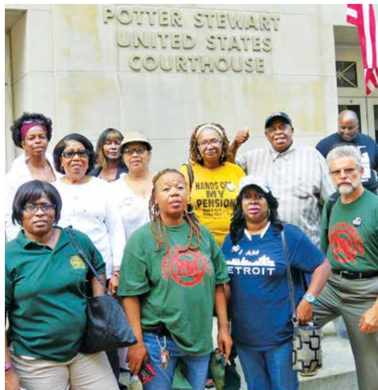
People gather in front of the Federal Court building in Cincinnati, Ohio, where a challenge to the constitutionality of Michigan's Emergency Management (corporate dictator) law has been raised to the federal level. This challenge, and the movement around it, is crucial to the struggle for democracy in America.

The significance of the Federal appeals case is that it connects the dots, tying the many struggles directly to the Emergency Manager law. It makes clear that our fight is with the State as it merges with the corporations. Michigan is a template for what is sure to become national.