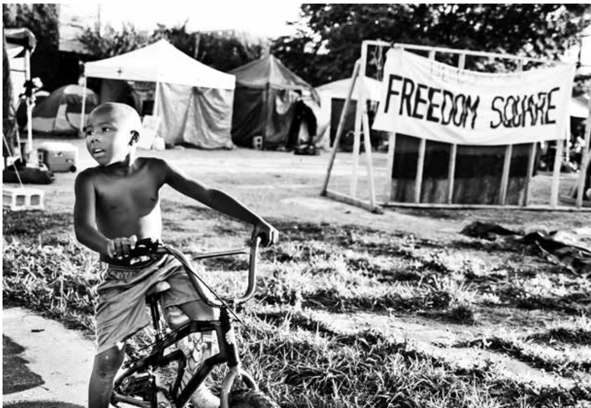
Occupation of the vacant lot across the street from Homan Square, a historic police “black site” in Chicago.

“#LetUsBreathe has been occupying Homan and Fillmore and rebirthing the space as Freedom Square. Our camp is set across the street from Homan Square known for snatching up black folks, torturing them, or