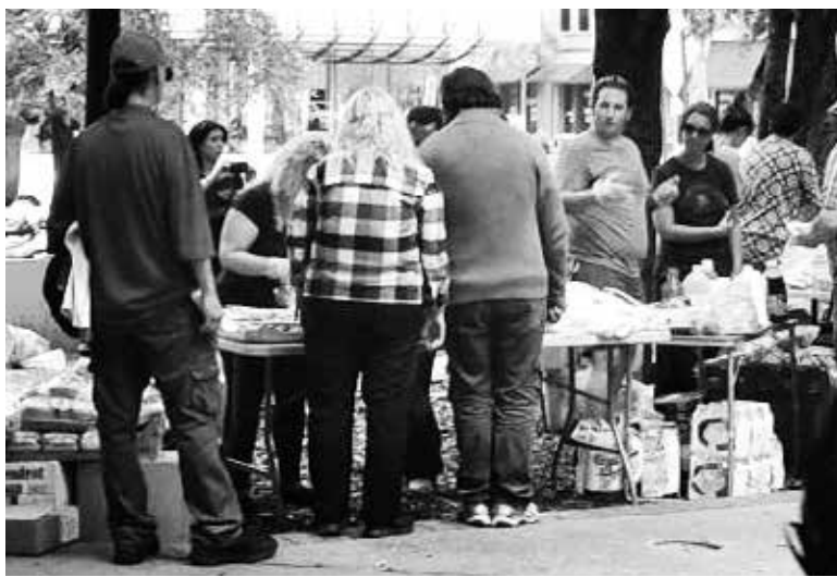
Barely surviving by using Florida soup lines. The state ranks number two in the highest homeless population and number one in criminalization of the homeless. State-wide groups are forming to defend the homeless.