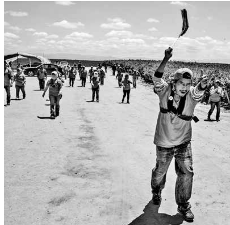
The strike and union campaign at Klein Management are part of a larger movement among Mexican indigenous farm workers sweeping through the Pacific Coast. The struggles of the farmworkers must be supported. We are one working class. United we stand, divided we fall.

Conflict about the piece rate paid by Klein Management, the farm’s owner, led to a workers’ rebellion. In April, the company was paying pickers 95¢ per pound. By mid-May, the price had dropped