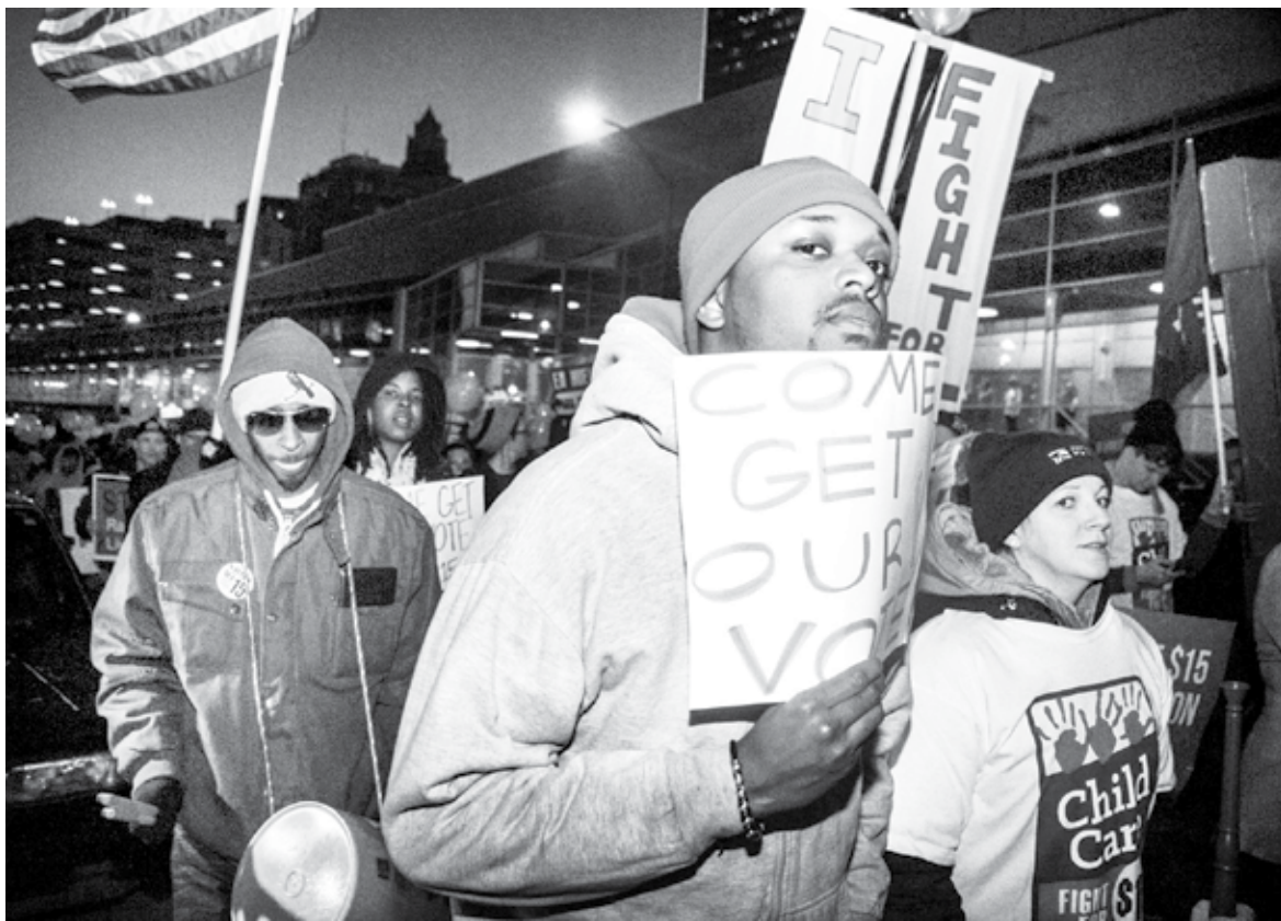
Rally in Chicago for $15 an hour and a union. Workers are bringing their demands into the elections, saying there is no excuse for poverty wages.