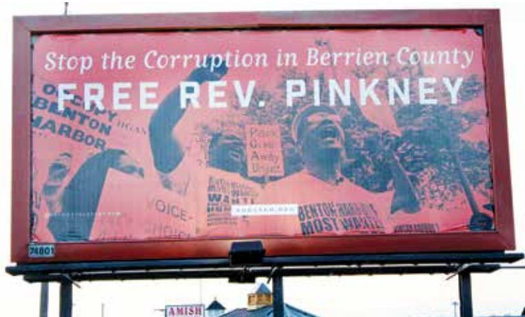
Billboard in Benton Harbor, MI.