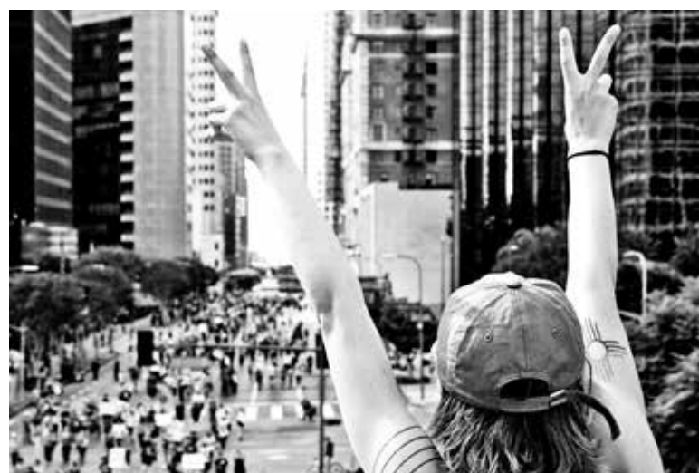
Some of the thousands who marched following the election of Trump. Millions more will demonstrate their anger and fears for the country on Inauguration Day.

“The Women’s March on Washington will send a bold message to our new administration on their first day in office, and to the world that women’s rights are human rights. We stand together, recognizing that defending the most marginalized among us is defending all of us.”