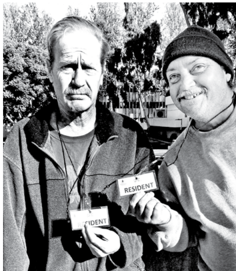
Resident homeless men residing at the Courtyard Transitional Center in Santa Ana, CA. Homeless people at the Center have been denied services like food for not having a badge.

Several collective, public, direct actions, including one in which we set tents on Lake Shore Drive stopping morning rush hour traffic for some minutes, seems to have gotten officials to back off on the intention to evict us from our tents—for now. To be continued.