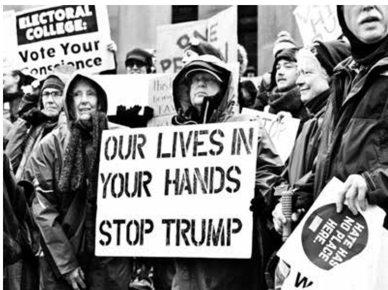
In an unprecedented effort, protests occurred throughout the country to lobby electoral college voters to change their vote.

The Electoral College was established in 1787 by the rulers in order to subvert the will of the people. The facade of democracy was instituted through voting. However, Native Americans, African Americans, women and all whites who did not own taxed property were excluded. African American votes were counted as 3/5ths for the southern Slavocracy. Therefore the voting crowd was safely in the hands of the Southern Slavocracy and the rising banking/industrialist