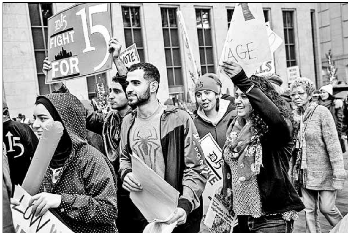
Protests of low-wage workers are sweeping the country. Meanwhile, companies say they will put robots in to do the work, rather than pay higher wages. The fight for a new society based on human need, not corporate profit, is a life or death question.

Just as what has happened to us transcends race, religion, ethnicity or national origin, so must be our unity. Without that unity there is little chance of building a new America where the human and economic needs of all our people are met. The robot and the computer make such a new America possible but it will become a reality only when they are publicly owned and operated in the interest of "We The People," and not the corporations.