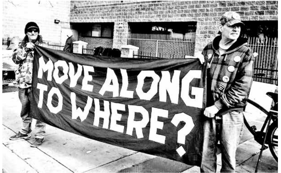
The homeless are continually driven out of Denver's downtown. People have frozen to death as a result. The American people are joining with the homeless, demanding that government provide homes to those in need.

"People are dying and freezing. You're running us off the street where we're warm down to the river where they're freezing to death. You're moving us to nowhere. They're dying! Why am I going to jail, what law am I breaking by just sleeping at night? There have been three or four confirmed deaths on the river because—this is a quote from their mouths—they didn't want to go to jail so they moved to the river and froze to death! Any is too many, one is too many! Pick a spot and say this is for camping only. Tell us somewhere we can stay and be in the area of resources."