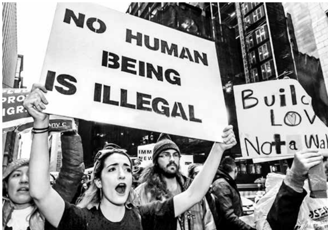
From the Editors of the People's Tribune