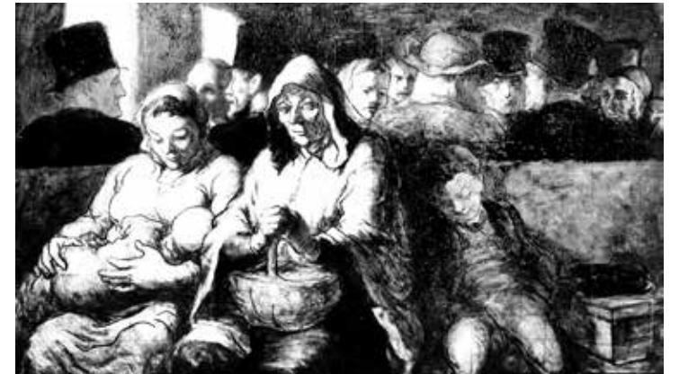
This famous painting depicts the impact of industrialization; the hardship of third class railway travelers in mid-19th century France.