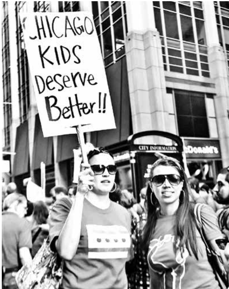
Chicago teachers, parents, and kids are leading the nation in the struggle to get corporate profit out of education and save public education for our children. Trump's education nominee will lead the fight for destroying it.