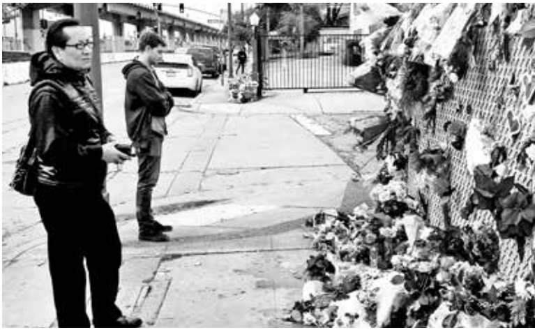
An altar on the street where fire destroyed the artist live/work space known as "The Ghost Ship" in East Oakland, claiming the lives of 36 people. The young man in the photo is from Portland, in Oakland for the funeral of his friend.