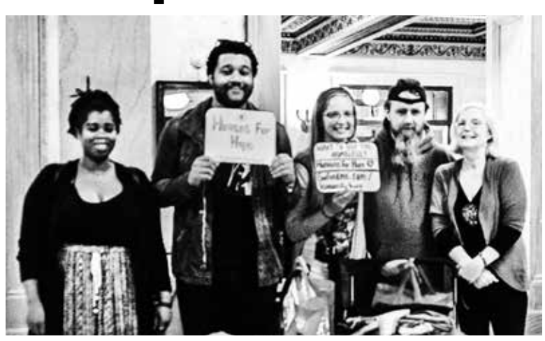
Humans for Hope volunteers gather as they prepare to build strong bonds with brother and sisters living on the streets of Chicago.