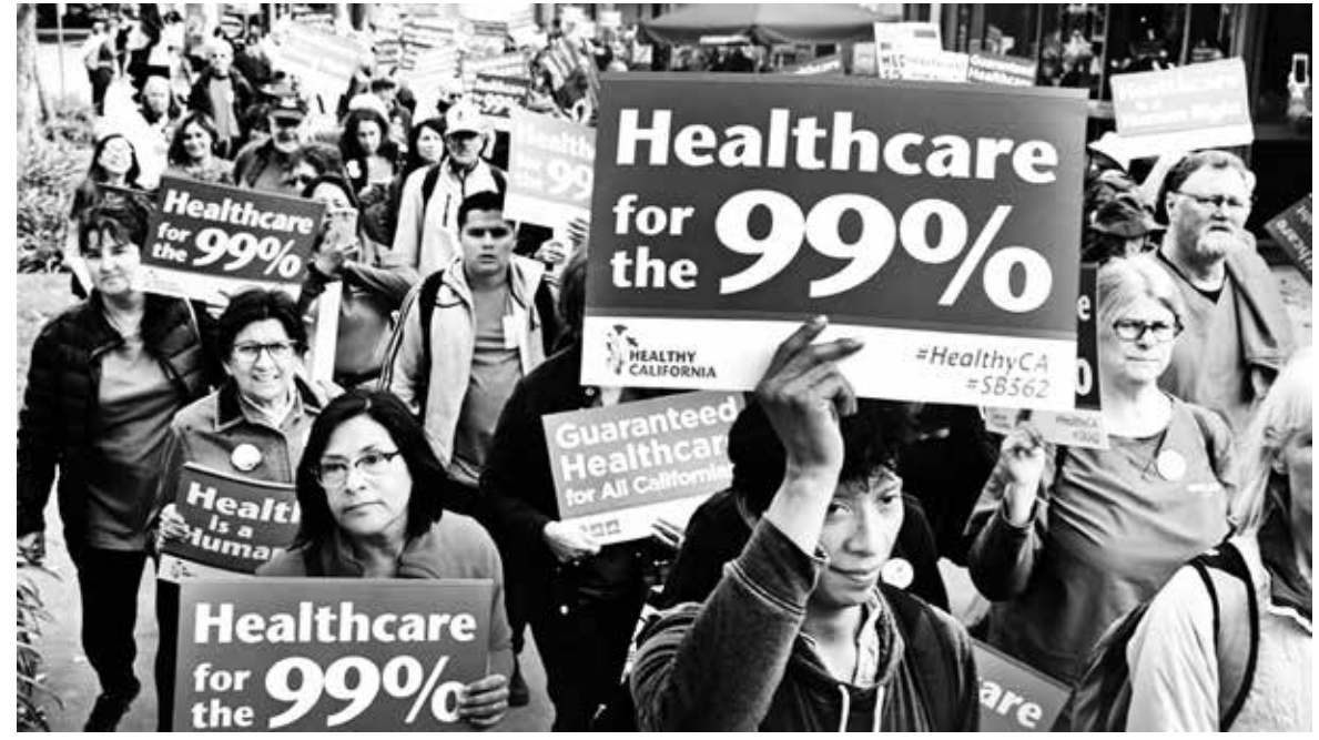
Rally in Sacramento on behalf of SB 562, the Healthy California Act, which would establish single-payer health care in California.

An active grassroots movement has emerged as hundreds of community organizations, unions, small businesses and churches have endorsed the bill. Leading