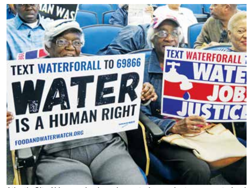
Atlantic City, NJ campaign launch event where volunteers were trained on how to gather petition signatures to force a referendum on whether the state can sell the publics' water utility.