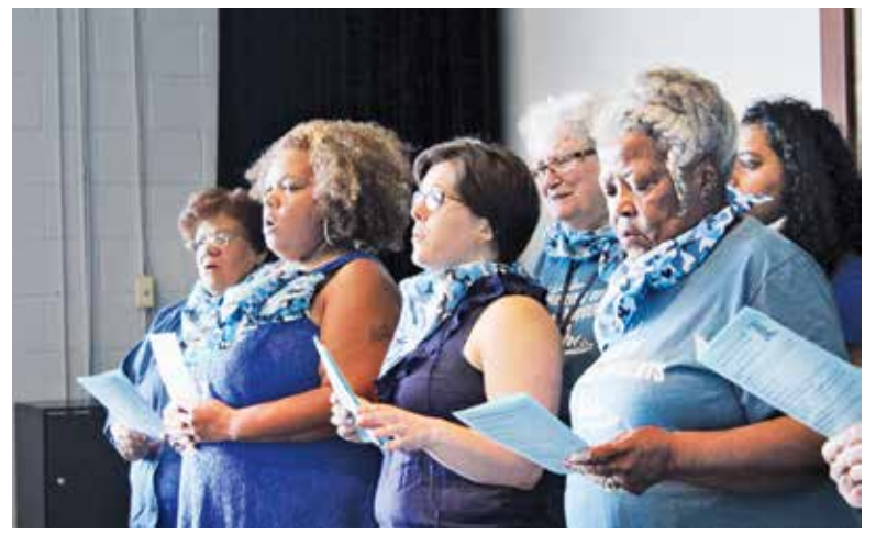
The choir sings, "Stop Shutting Water off..."

My water was cut off twice... My children were ashamed to go to school. It affected their education, not being able to launder your clothing, not being able to bathe properly... I got bacterial pneumonia and still have lasting effects... Water is a human right, it's more than a right, it's a life-giving necessity... I won't stop fighting for myself, for the citizens of Detroit, the citizens of Flint, the citizens of Michigan and the people of this country... What's going on is not about that people don't or won't pay their bills...it's caused by