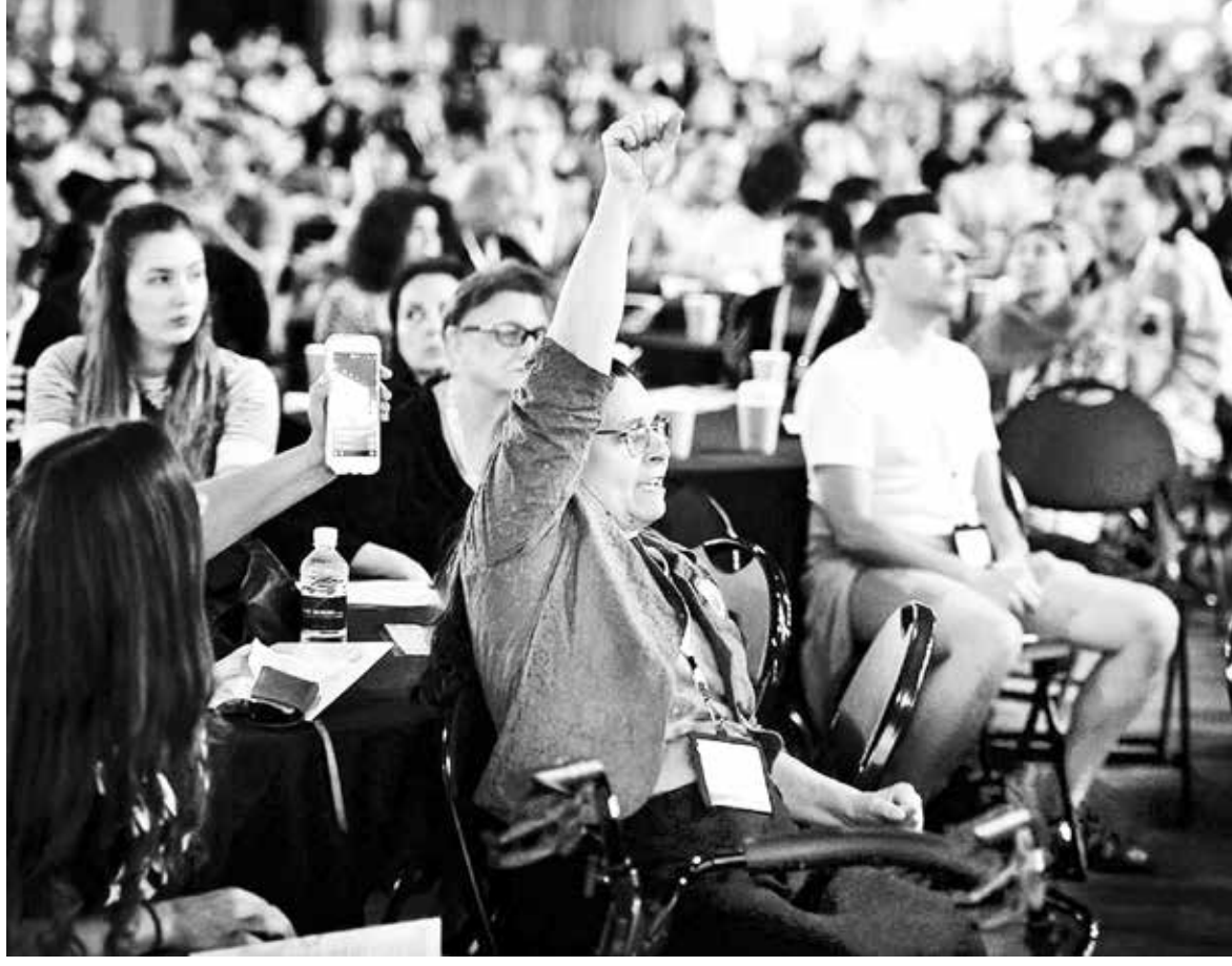
Crowds at the People's Summit in Chicago in June, 2017. Grassroots people who are fed up with corporate owned government and corporate parties are stepping forward and running for office.

One expression of this incipient new independent political motion found a voice in the People's Summit held in Chicago