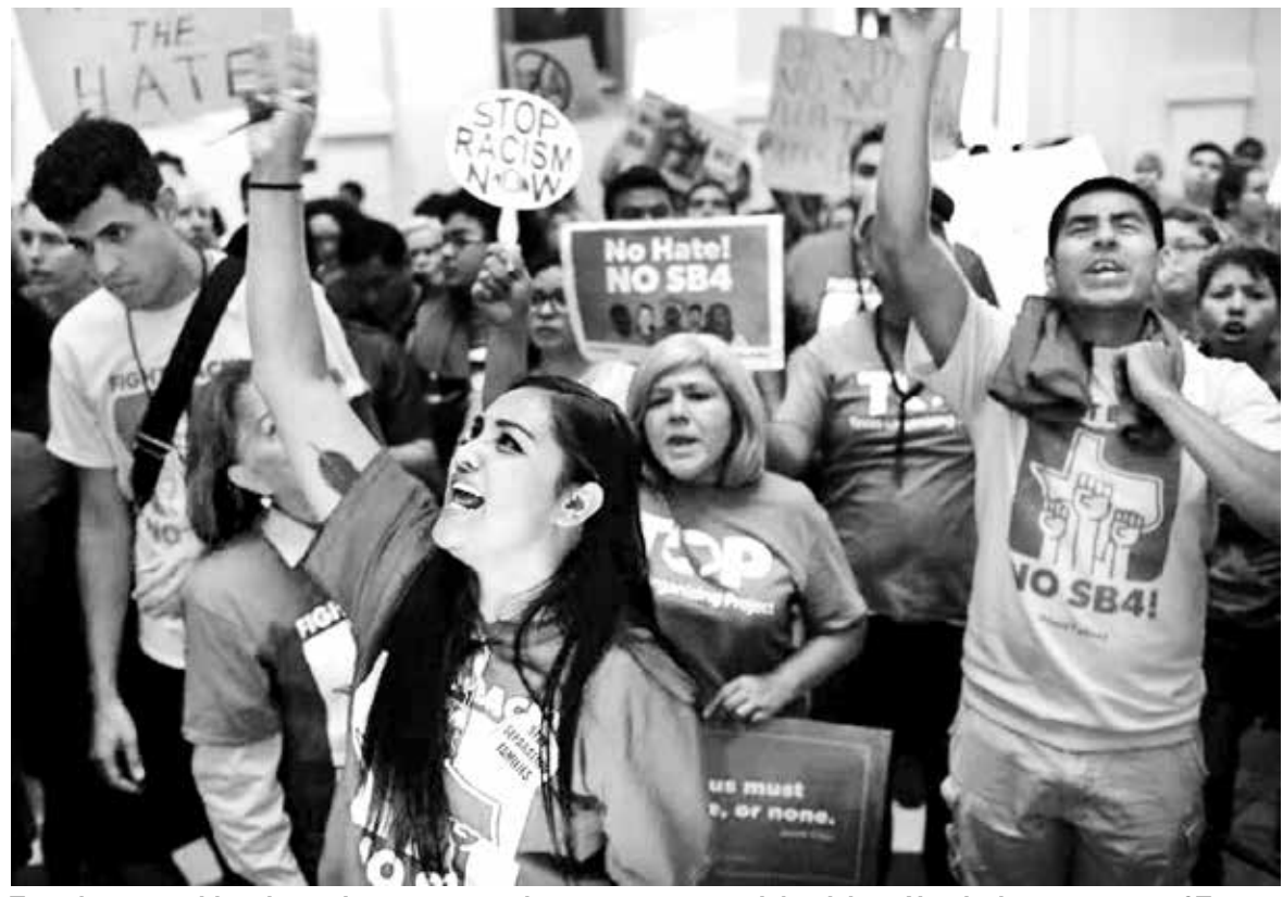
Texas's new anti-immigrant law appears to be contrary to people's wishes. Nearly three quarters of Texans are concerned about undocumented immigration. But more than three out of five think immigration is a plus and oppose building a wall. Even more don't want to deport the state's millions of undocumented residents, with 80 percent of the youth defending immigration and immigrants.

SB-4 specifically attacks the undocumented among us and aims to isolate and pit one section of society against the other. The