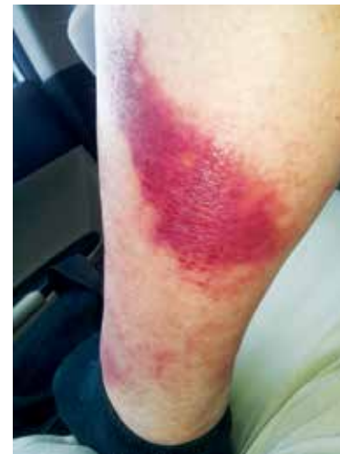
Chronic skin disorders are common seven years after exposure to toxins in the gulf following the BP oil disaster.

3: In August, 2018, Alabamians will go to the polls in a Special Election to vote for a new governor. Governor Bentley, in office during the BP spill and settlement fight, resigned amid scandal. If our electoral efforts bear fruit, we will have a governor