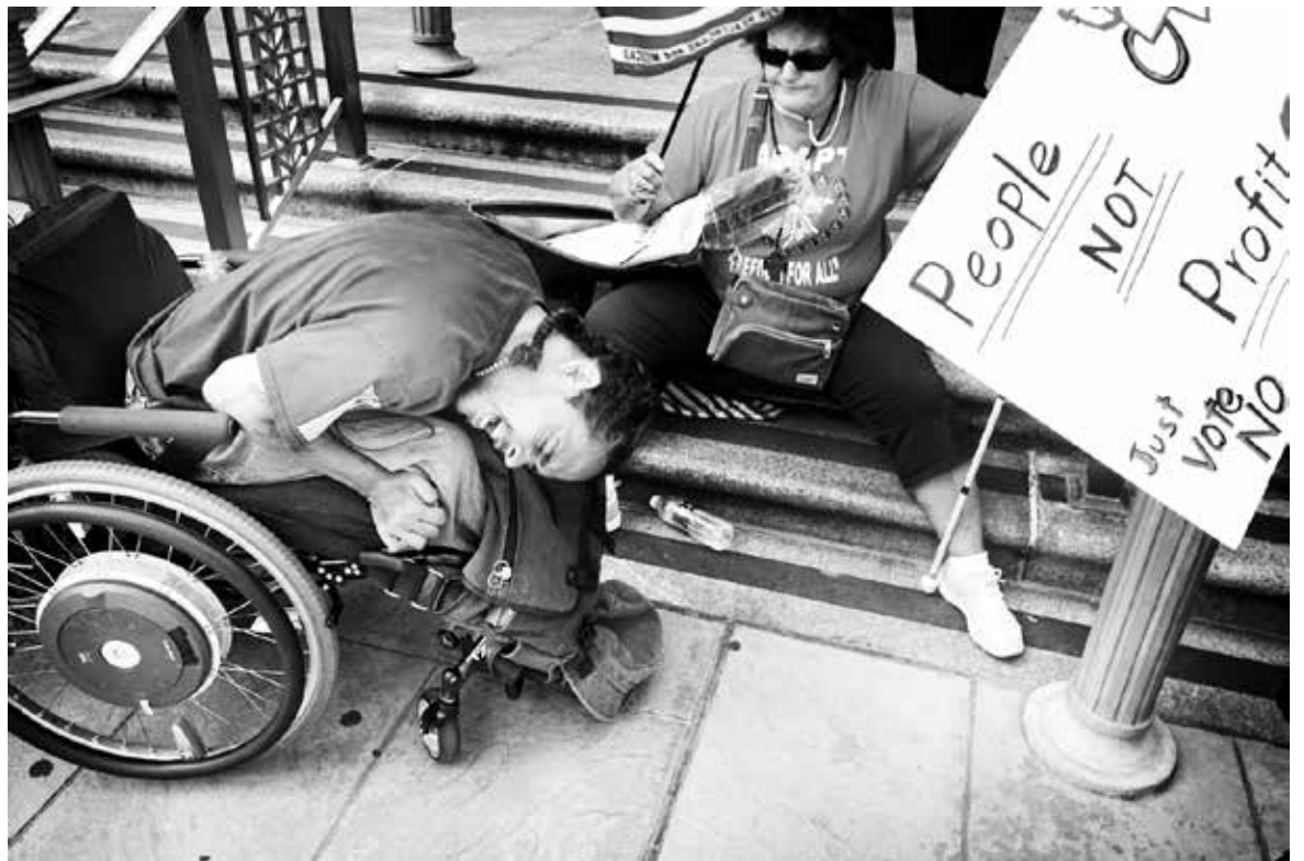
In Philadelphia, and across the country, disabled people in wheelchairs are denouncing the dismantling of Medicaid contained in the Senate healthcare bill. We need healthcare for all, no exceptions.

There is no doubt that real healthcare reform is needed. Even with the Affordable Care Act (ACA or Obamacare) and its Medicaid expansion, there are still millions without healthcare, and rural hospitals are closing. But nearly all the healthcare "fixes" put forward by the corporate parties (Democrats and