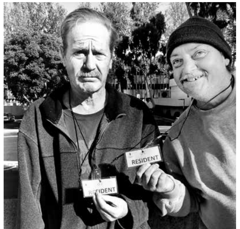
Homeless people residing at the Courtyard Transitional Center in Santa Ana, CA have been denied services like food for not having a badge.