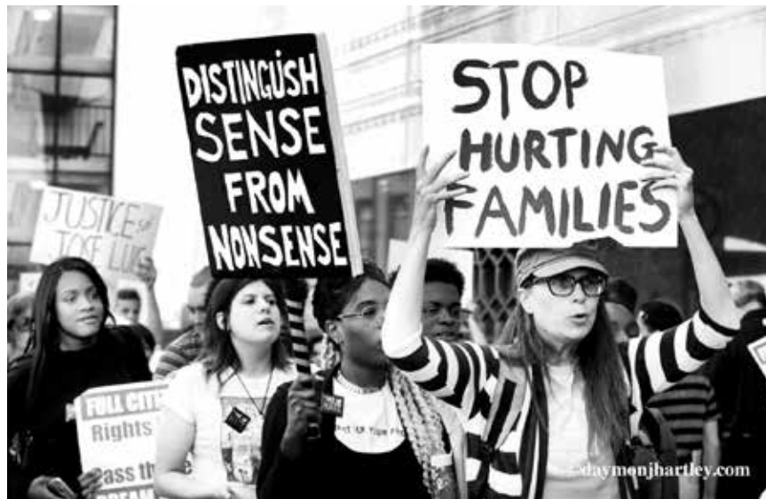
Protest against ICE detention center in Michigan. People everywhere are saying no to the immoral attack on immigrants and are standing in their defense.

“Without reliable access to the facility and the people inside... it's difficult for loved ones, let alone journalists to ascertain the truth. (I was also denied access to the facility during visitation hours last Sunday)... whether it was intentional or not, by citing the presence of activists and media as a reason for not allowing visitors, ICE (Immigration and Customs