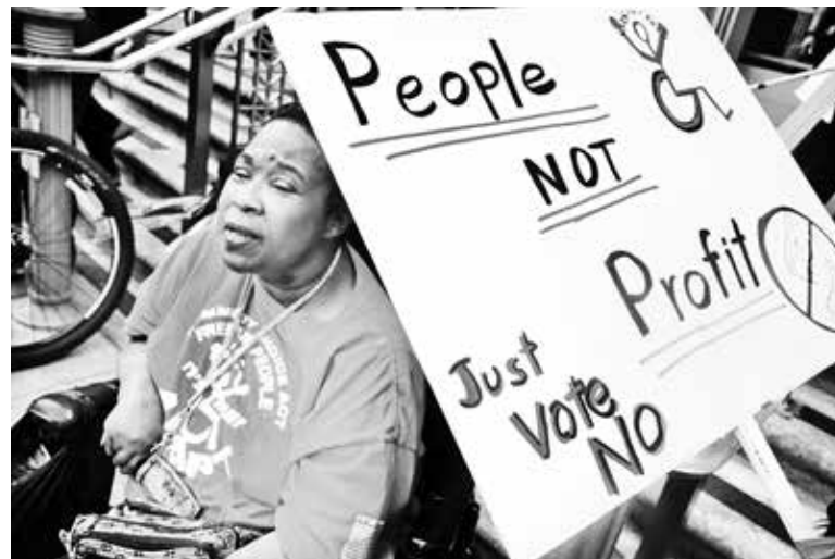
Healthcare protest in Philadelphia, where disabled people in wheelchairs denounced the dismantling of Medicaid contained in the Senate healthcare bill.

Between now and then we must lobby the other members of the House to support H.R.676—Expanded and Improved Medicare For All, by becoming co-sponsors, and lobby the members of the Senate to introduce H.R.676 as a companion bill in the Senate.