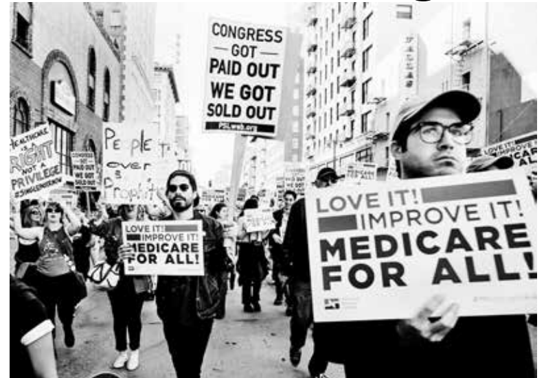
A rally demanding Medicare for All in Los Angeles in February 2017.

As labor-replacing technology destroys benefited union jobs, lack of comprehensive and affordable healthcare has become a key pathway to dispossession in this country. This is not about a scarcity of resources or the relative weaknesses of national or state bills. It's about politicians bought and paid for by corporate America, about their power to make money. They want government out of the business of providing healthcare altogether. For them, healthcare is a tool for investment and profit making, a tool to restructure the American tax system and reorganize the relationship of the federal to state