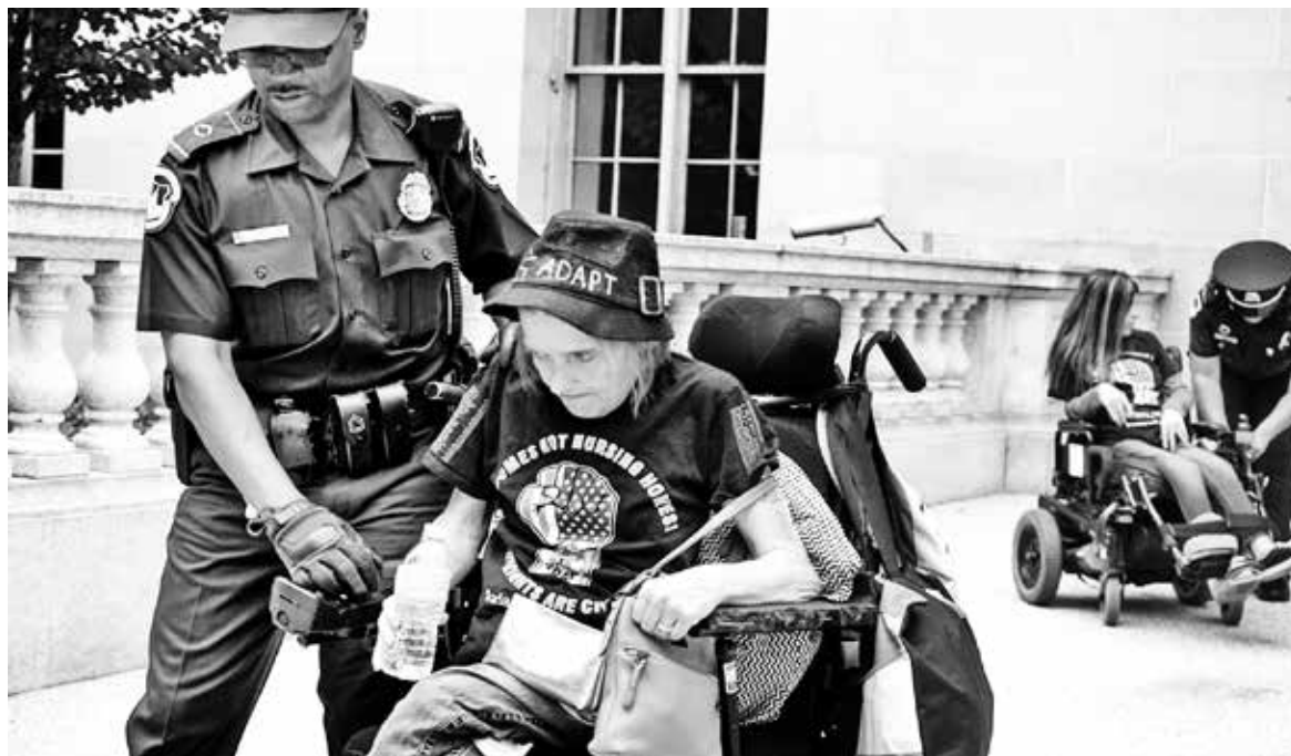
Disabled people were arrested after protesting the Senate healthcare bill outside Sen. Mitch McConnell’s office on Capitol Hill. The bill would dismantle Medicaid as we know it.