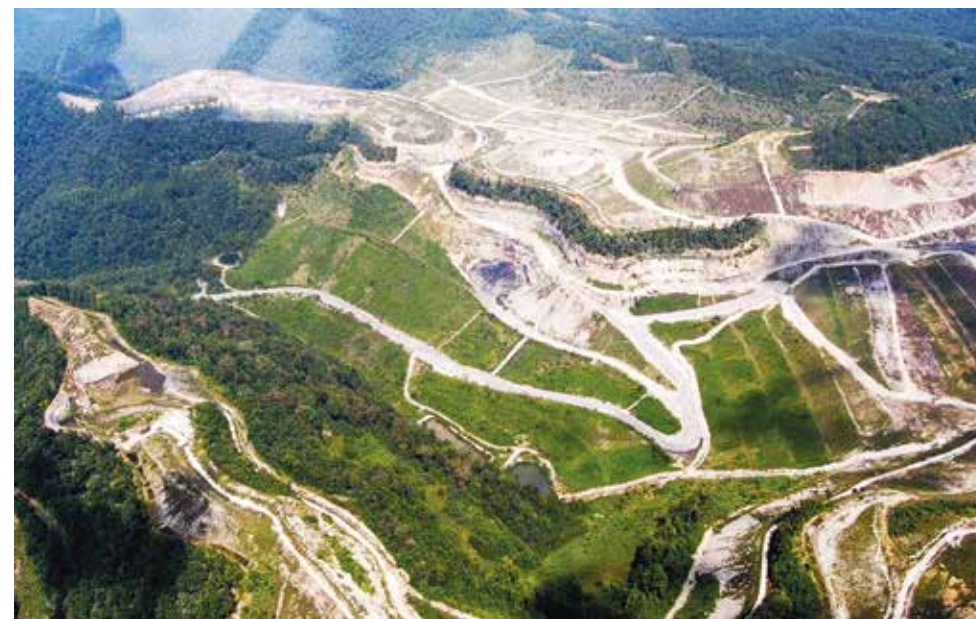
Activists fighting mountaintop removal (where coal companies blow up mountains, severely damaging the land, air, water, and health of the people in nearby communities where cancer rates are rising), are calling out the Bloomberg-backed coal film.

"I have fought the impacts of the coal in industry in Boone County, West Virginia all my adult life. I was born and raised here. Mike Bloomberg and Carl Pope couldn't handle living like we do for a day, and they wouldn't know coal if they tripped over it. While he was executive director of the Sierra Club, Carl Pope accepted $26 million from Chesapeake