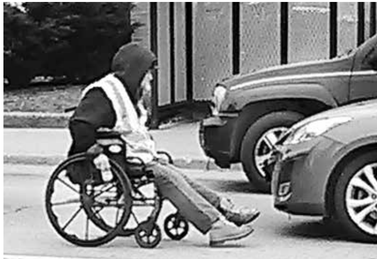
This Chicago panhandler has been struck by cars three times.