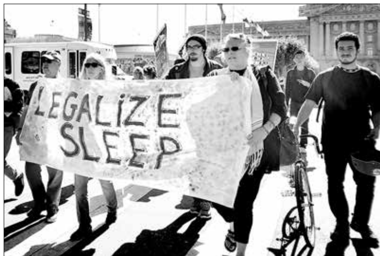
Marchers at a recent "Defend Our Housing, Right to Exist and Oppose Trump's Wall!" action in San Francisco that brought together homeless movement leaders from around California and the West.

There are a greedy few who make it hard for the rest of us but people are waking up to that and it won't be long now... the change is here... I hope you're ready.