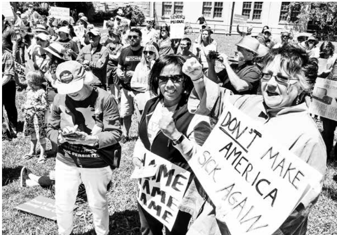
Protestors in Atlanta, Georgia earlier this summer oppose proposed cuts in Medicaid and demand healthcare for all.

Georgia and nine other Southern state governments refused to expand Medicaid. Working and poor people in the South have no choice, but while acting to defend and call for Medicaid expansion, they must necessarily go on the offensive for improved Medicare for all, a step in the direction toward a national public health service based on peoples’ need, not the insurance marketplace.