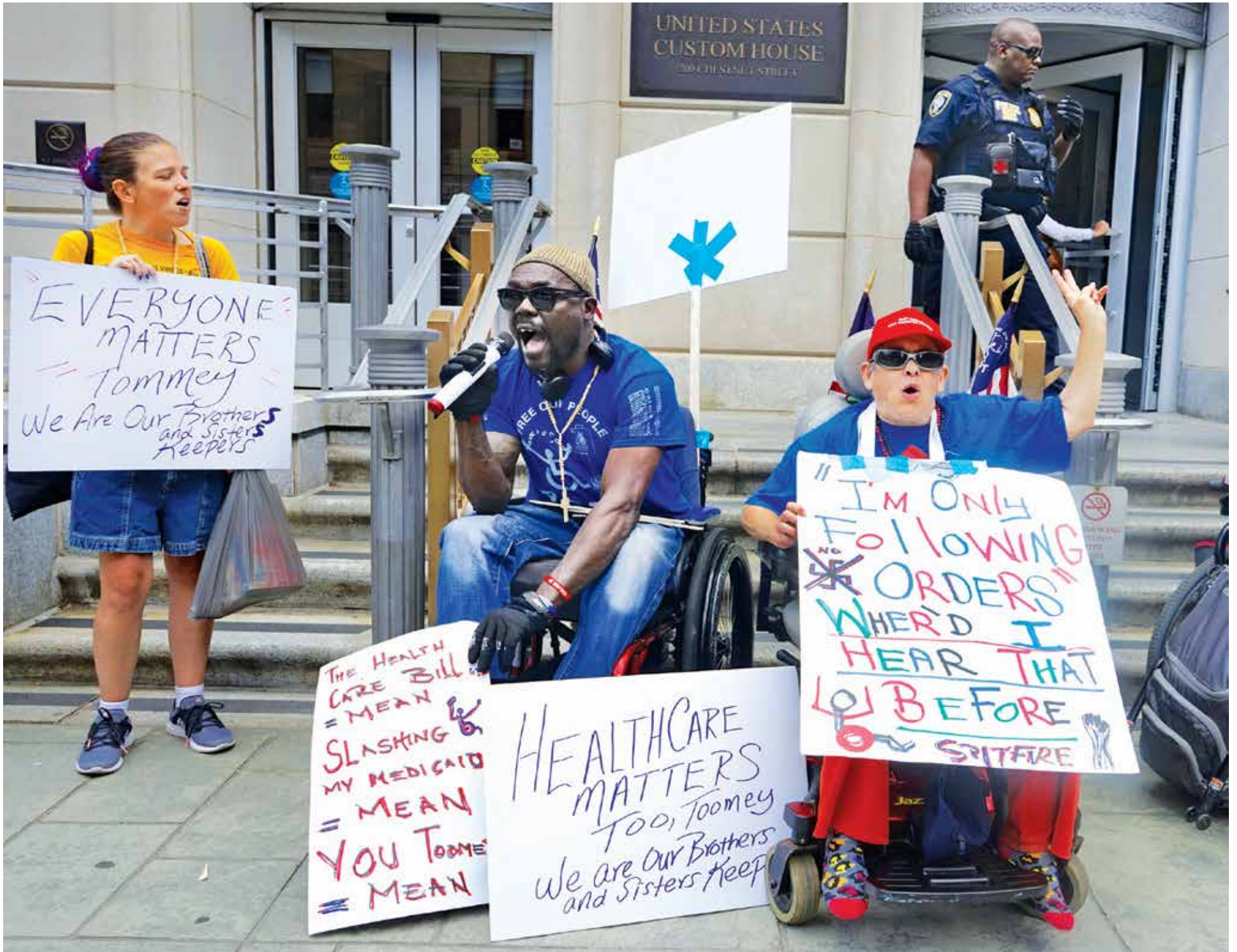
Protests have erupted across the country, including this one in Philadelphia, where disabled people in wheelchairs came to denounce the dismantling of Medicaid contained in the Senate healthcare bill. See page 3, 11, and 12.

WATER – FIGHTING FOR A SAFE ENVIRONMENT PAGES 6 & 7