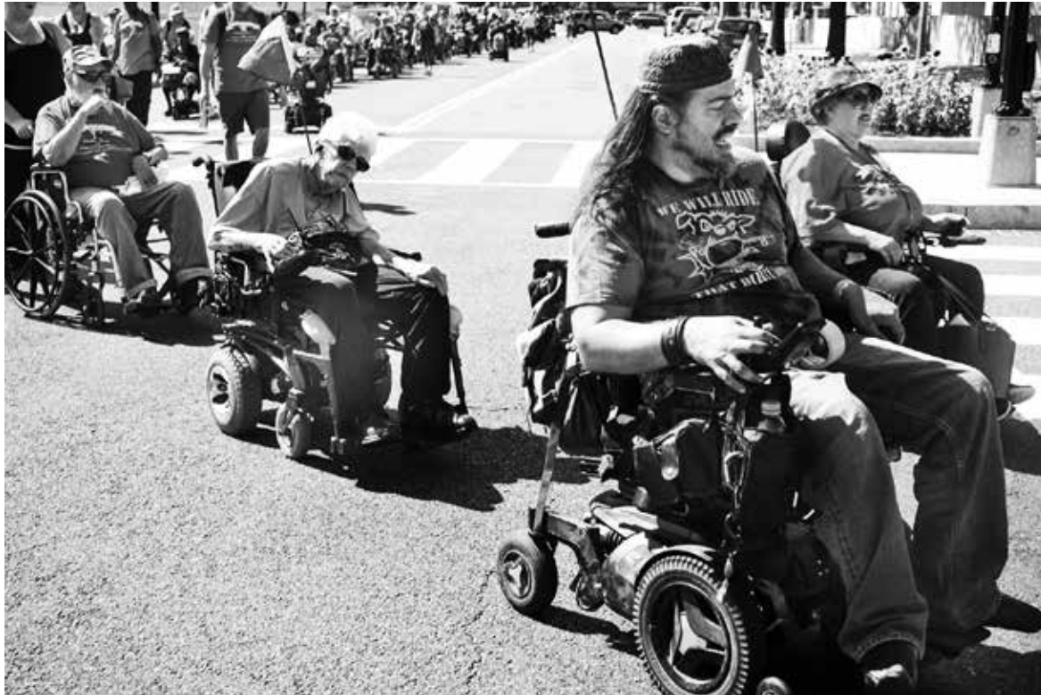
Disabled people once again lead the fight for everyone's health care, disrupting a US Senate Finance Committee hearing on the worst health care bill yet, angering Senators pushing the bill, which was later withdrawn.

In the final analysis those who use sacred scripture, the word of God, to further the oppression of the American people for the benefit of profit shall reap the wrath of God. There is a price to pay for a healthcare legislation unjust. In light of the example of Jesus Christ and considering a politics morally inept, those who long for a healthcare system for all, and not just a tax break for the 400 wealthiest families, must daily cultivate compassion, hope and justice, and in so doing gradually change the hearts and minds and thus the politics, making healthcare for all not only a possibility but a reality and a right in the lives of millions of Americans.