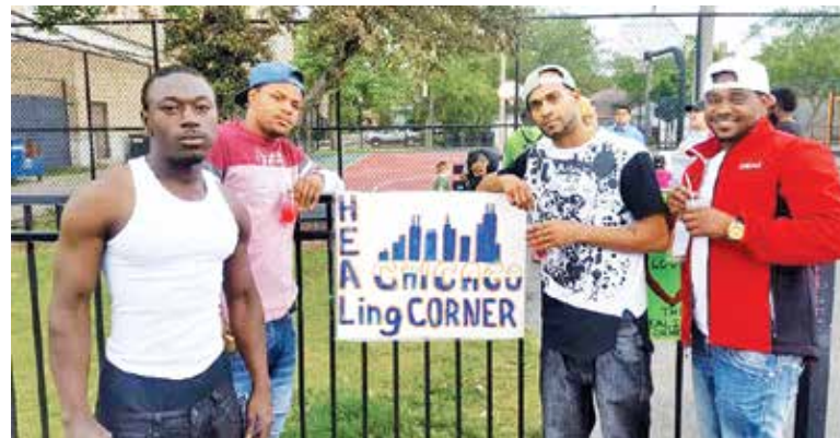
Young men in the West Humboldt Park neighborhood of Chicago share the compassionate vision of the Healing Corner organization for their community.

Just as Colonials divided and conquered African countries, exploiting minerals in the Congo for First World use, there is a land grab under way on the West and South sides of Chicago. Gentrification is growing at an exponential rate, while at the same time these boys are being locked up and/or killed. Time and time again our public services are being privatized for profit. Traditional public schools are doing more with less and obtain higher growth rates with their students because of the quality of teachers. We shouldn't be seduced by char-