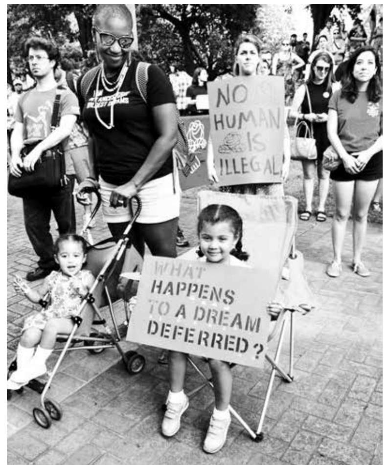
Protest in New Orleans against the possible deportation of 800,000 youth in the DACA program (which allows people brought to the U.S. without documents as children the temporary right to live, study, and work in America).

Editor's note: These are excerpts from an article by Dave Ransom published in the Tribuno del Pueblo, sister publication of the People's Tribune.