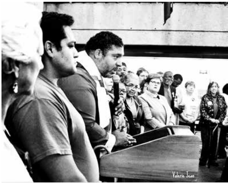
Rev. Dr. William J. Barber II (left) speaking at the Poor People's Campaign: A National Call for Moral Revival in Detroit in September.