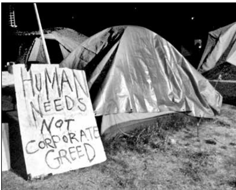
Tents and signs at the homeless-run Poor Tour tent community, Berkeley CA.