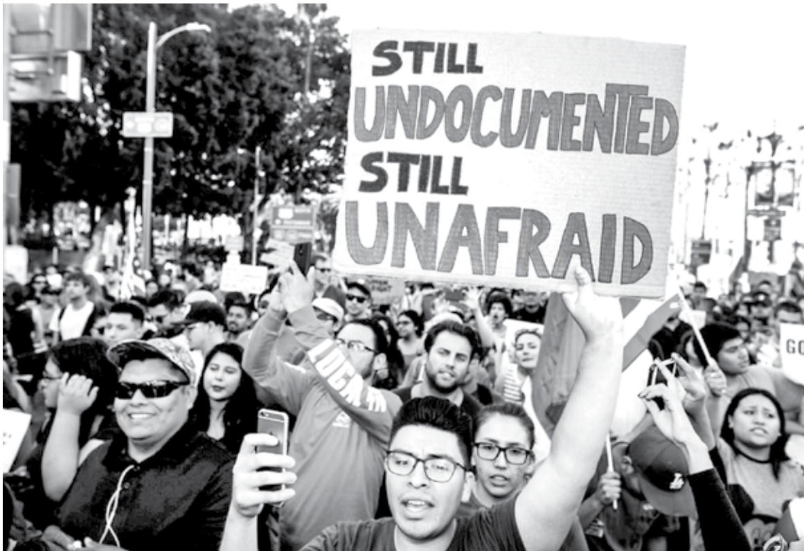
Protest in Los Angeles following Trump's order to rescind the DACA program which allows people brought to the U.S. without documents as children the temporary right to live, study and work in America.