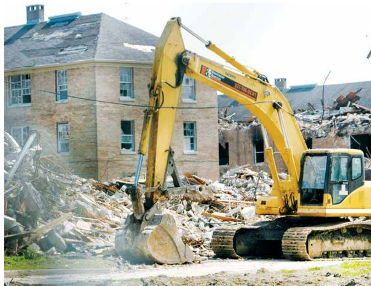
Undamaged public housing was torn down after Katrina in New Orleans to reduce public housing units and prevent those who lived there from returning. There is now less public housing available and new housing is mixed income, meaning there is less for the poor. See more from Katrina: soldiers pointing guns at citizens (youtu.be/ZrNYX1IDbQk) and a formerly busy street corner with lots of small businesses that never returned after Katrina (flc.kr/p/4uzAkc).

Beware! This is the next stage of the process after the water goes down.