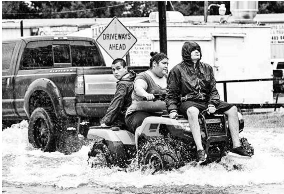
People make their way through flood waters caused by Hurricane Harvey in Texas.

In New Orleans after Katrina, while government help for the people was slow or non-existent, the government actively aided the corporations in making the rich richer. Troops were brought in to suppress any resistance. Undamaged public housing was torn down and replaced with new mixed income housing, creating fewer units for the poorest. Many of the poorest workers were driven out of the city and never allowed to return. Private contractors profited hugely from the rebuilding effort. Unions