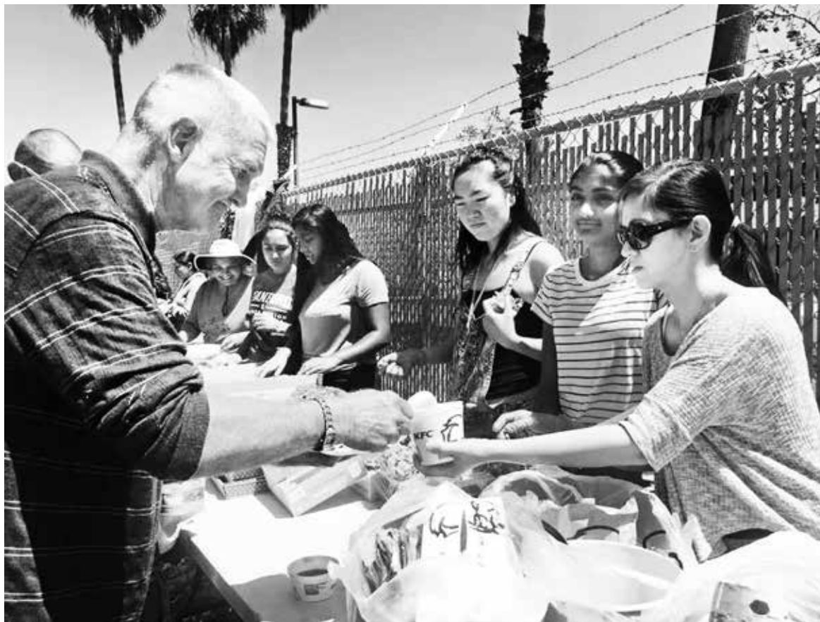
Volunteers with CHAM Deliverance Ministry feed the hungry despite threats from city officials in San Jose, CA.