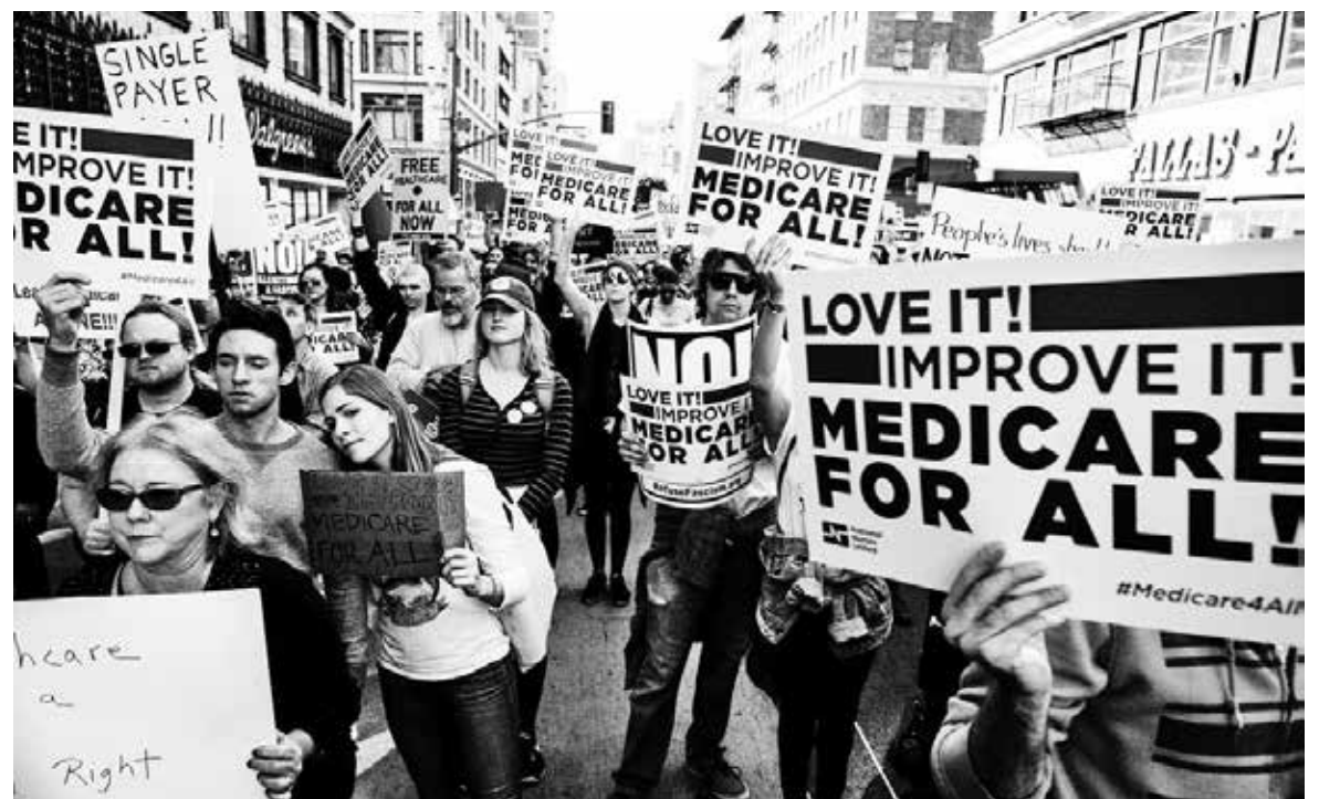
Medicare for all rally in Los Angeles.

So what does “socialized medicine” really mean? It means we don't have to worry about getting care when we're sick or injured. It means we get all the care we need