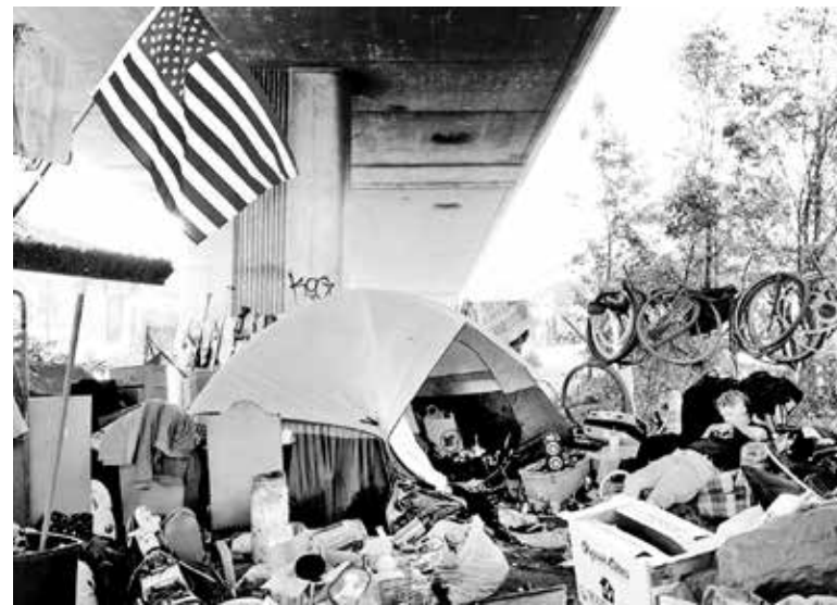
Homeless encampment in Oakland, CA, where a one bedroom apartment now costs $4,000 a month. Developers are dispossessing whole communities. The city gave out 1,000 building permits in the first quarter of 2017, but not one to build affordable housing.

I would like to start a Homeless Anonymous meeting. People from both sides of homelessness, those still in it and those out of it, sharing their experience on how to overcome the homeless hurdles and then how to overcome what happens after