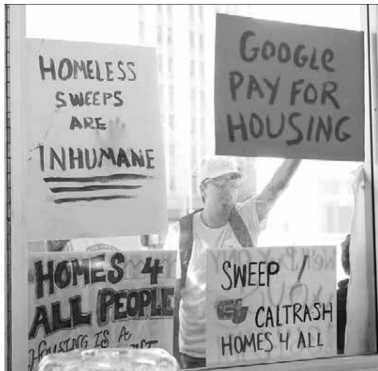
San Jose residents filled the windows of City Hall with their signs at a "House Your People" rally on August 1.