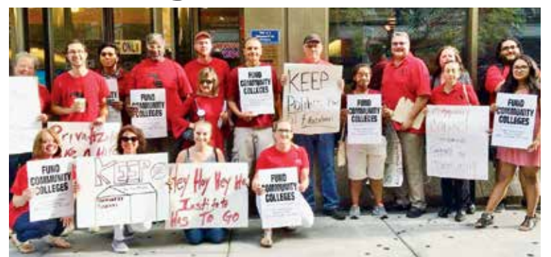
Local 1600 faculty, professionals, and part-time professionals stand up against charter community colleges in Chicago.