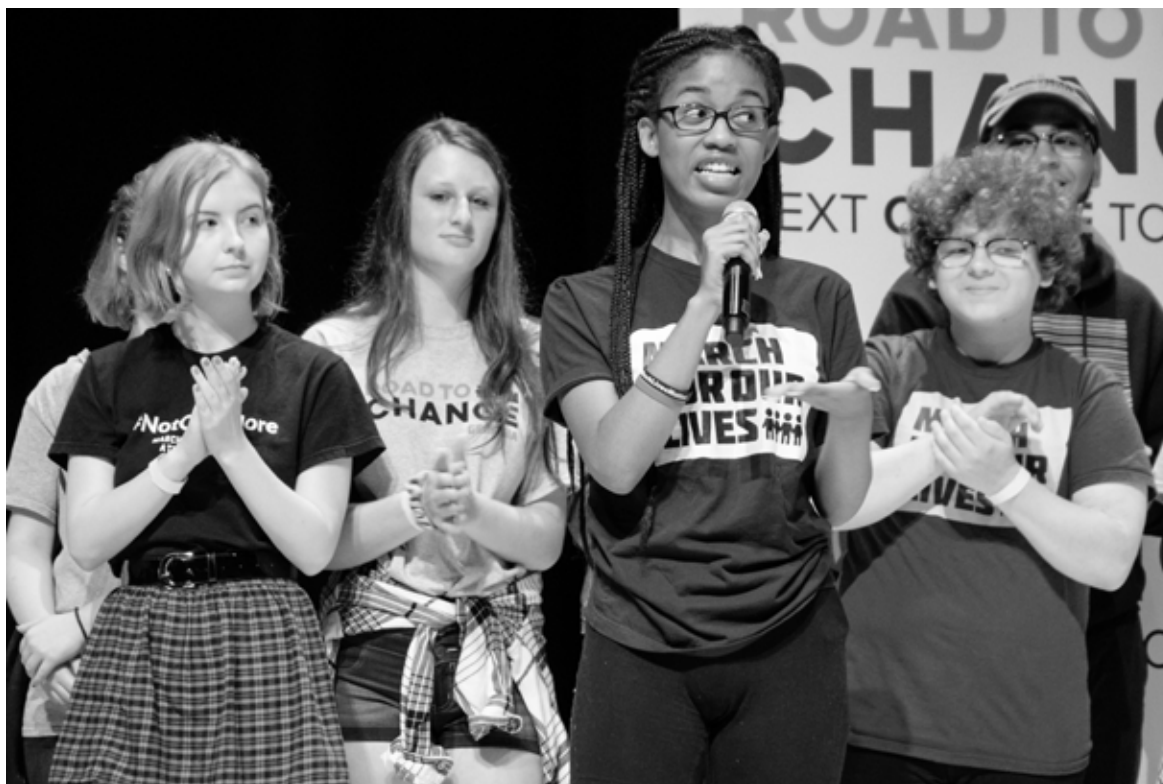
The youth-led “March for our Lives: Road to Change” is touring the country to get out the vote to stop the killings in the schools. Here they rally in Atlanta, GA.

Across the country, we are seeing a surge in interest in the elections among many as people express their demand that the government provide for people's basic needs. Across the country, progressive candidates have stepped forward to challenge entrenched political hacks, often incumbents from big-city Democratic Party political machines that stand in the way.