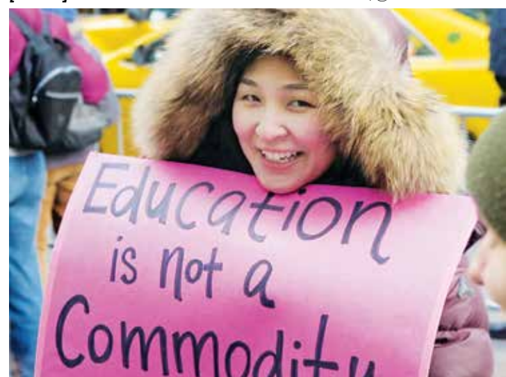
[Below] New York.