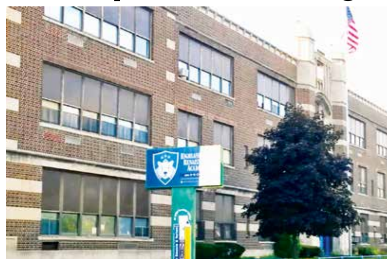
Highland Park Renaissance Academy is a for profit charter run by the Leona Group. Students complain about few books, no resources, no library, no sports, art or music. Students say they are kicked out for standing up for themselves.

who runs an entire city only makes $65,000 a year so why is no one concerned about these questionable decisions and bizarre actions? Why do Black and Brown communities in Michigan continue to be