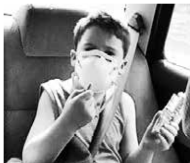
Wildfire smoke can be especially harmful to the elderly, pregnant women, children and those with chronic heart and lung diseases. People wear face masks in an attempt to protect themselves.