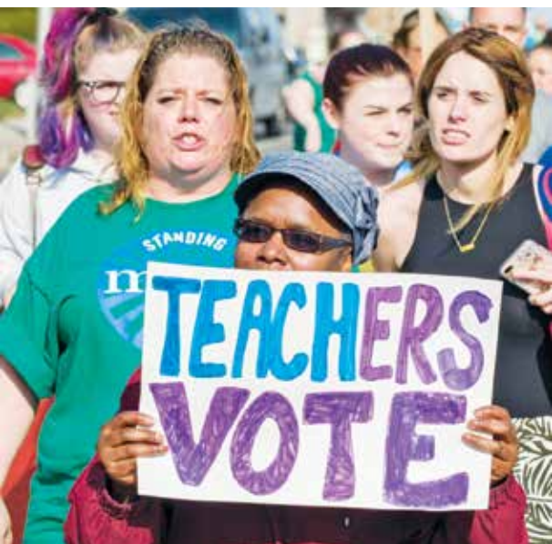
[Above] Milwaukee teachers getting out the vote. [Below] Protest against gun violence in schools.

Teachers, parents and students are joining together to fight for a publicly owned education system. Will it be education that serves the people or the corporations? On these pages, they share their thinking on this fight. Please send your thoughts and articles to the People's Tribune . — The Editors