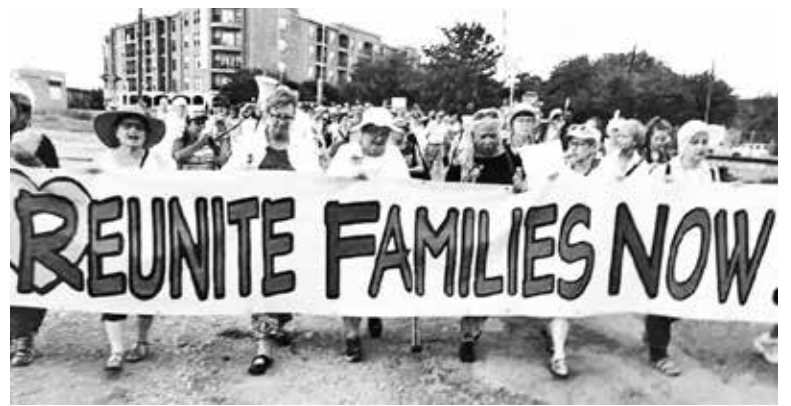
Grandmothers and their allies feel it is morally corrupt to separate children from their families. They caravanned to the US-Mexico border to make their voices heard.

Contact Maru Mora Villalpando at 206-251-6658 at Northwest Detention Center Resistance.