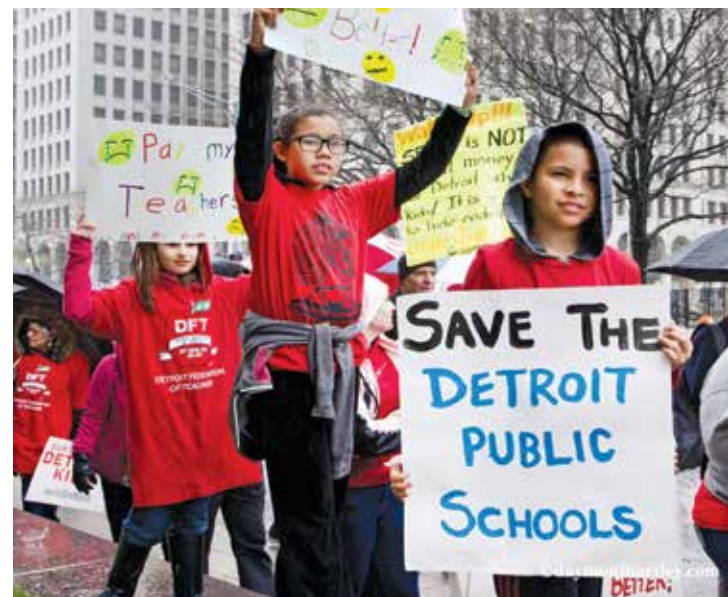
[Above] Students and teachers picket Detroit Public Schools headquarters in 2016.

To bring about change, "we are going to have to pick apart the laws that are already in place," said Harmon. "Long-term, we want democratic, local, direct control of schools and we want full-blown accountability from schools, school leadership, and the parents and community."