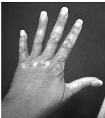
Lisia's hands have rashes, from Flint's water, that constantly itch.