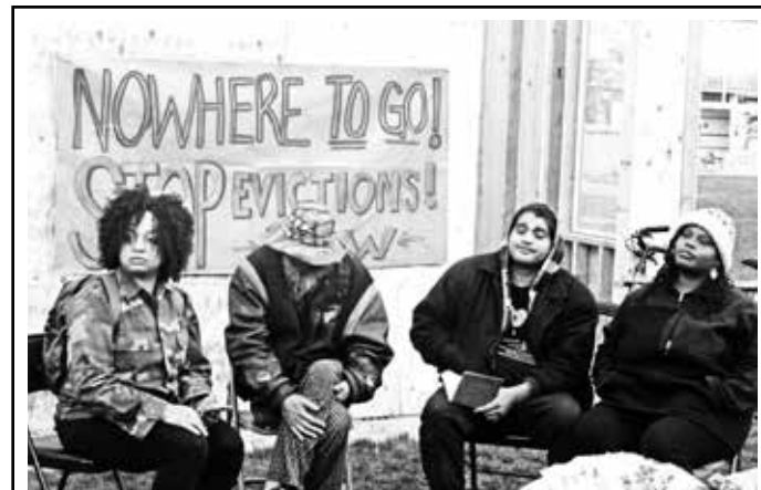
Speakers and members of The Village, an independent women and children's tent community, gather for a MLK Jr. Day celebration and speak-out at Oscar Grant Plaza in downtown Oakland, CA.