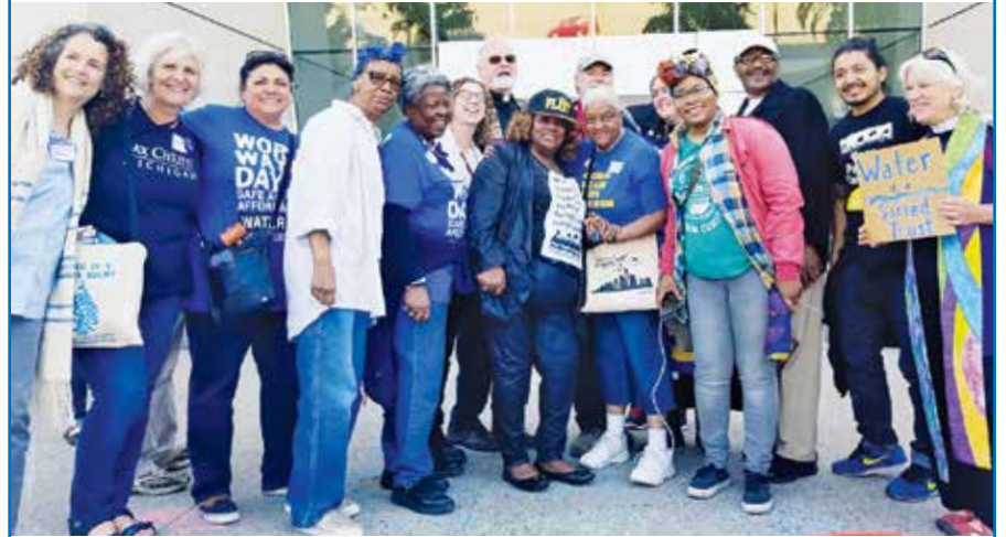
As part of Poor Peoples Campaign 40 Days of Action on June 4, 2018, activists from around the state joined the protest at Michigan Department of Environmental Quality in Lansing, MI. The agency was the primary culprit in the ongoing Flint water disaster. Dozens were arrested and 13 will stand trial on March 5 of this year.