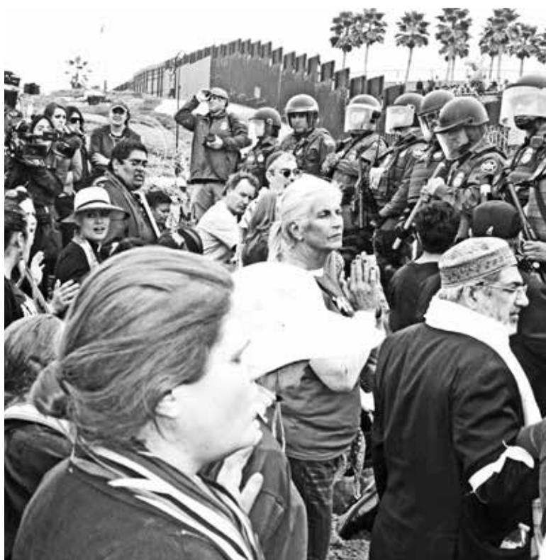
Demonstrators in solidarity with migrants and refugees at the border in December.

As we approached, we could see a tangle of barbed concertina wire laid out in front of the fence. Behind the wire stood a phalanx of heavily armed border patrol. When we reached the edge of the wire, some of the clergy formed a semi-circle and offered blessings for the migrants. As prayers were spoken aloud, border patrol officers used a megaphone to inform us that we were trespassing on federal property and that we needed to move to the back of the wire. I recited the Priestly