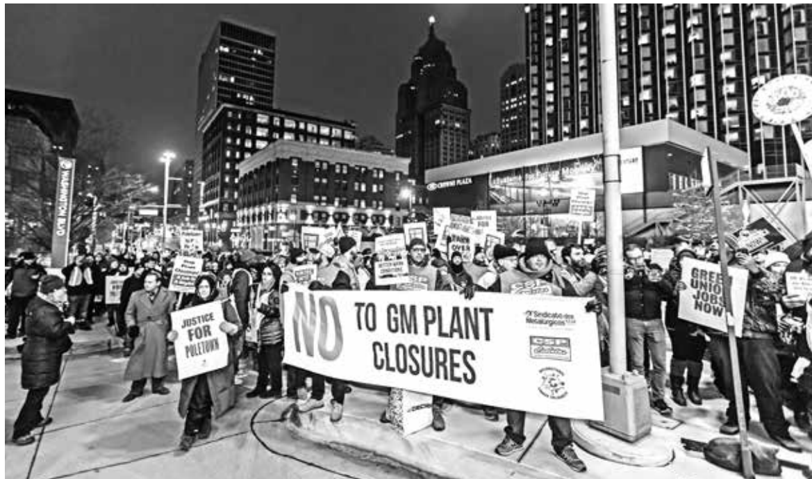
[Above] Protest outside the North American International Auto Show in January about GM’s plans to close five Michigan plants.

“The Hathcock Court’s decision to overrule Poletown vindicates an important legal principle to protect people from what the founding fathers called “the