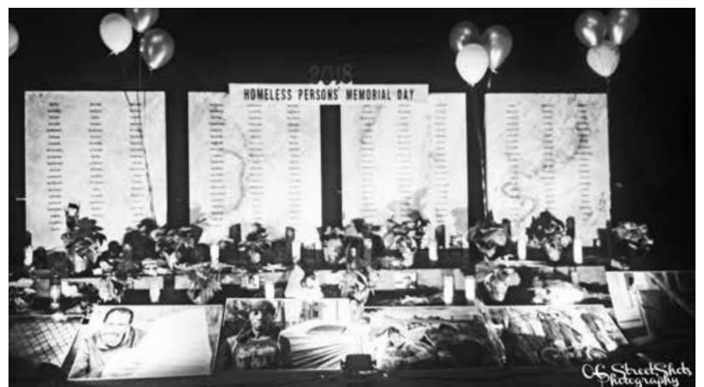
Homeless person's Memorial Day altar, Orange County, CA. Remembered were the 244 official homeless deaths, not including the uncounted homeless deaths.

While shelters are short-term solutions for the homeless, the lack of affordable housing, adequate long-term housing, and mismanagement of funds by nonprofits as