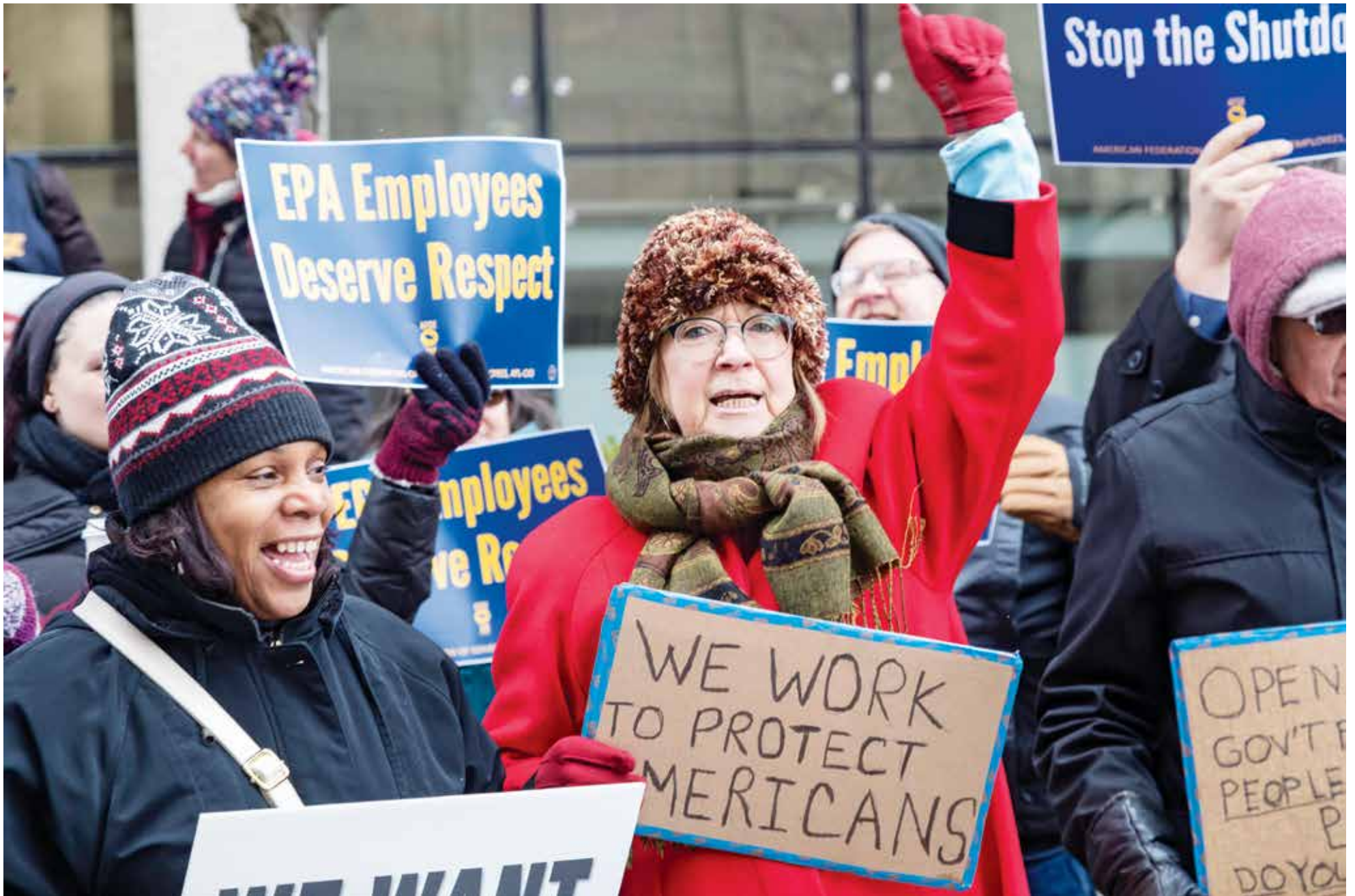
Unionized federal workers demand an end to the government shutdown at a protest in Detroit, MI on January 10.