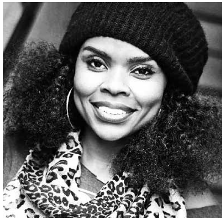
Tamar Manasseh, Chicago mayoral candidate.