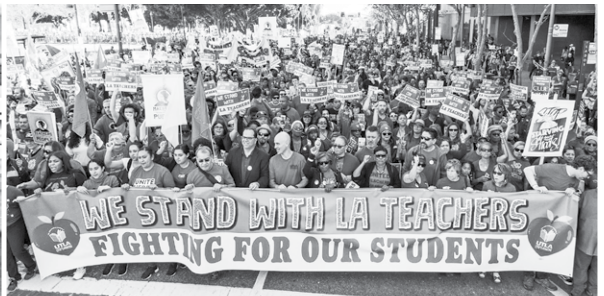
Scenes from the L.A. Teachers strike.