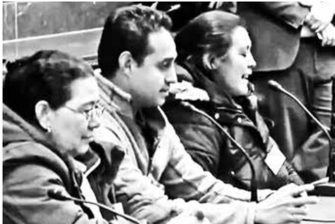
Low-wage federal contract workers such as janitors, security guards, and cafeteria workers tell U.S. senators how the government shutdown has affected their lives. Contract workers don't get backpay.