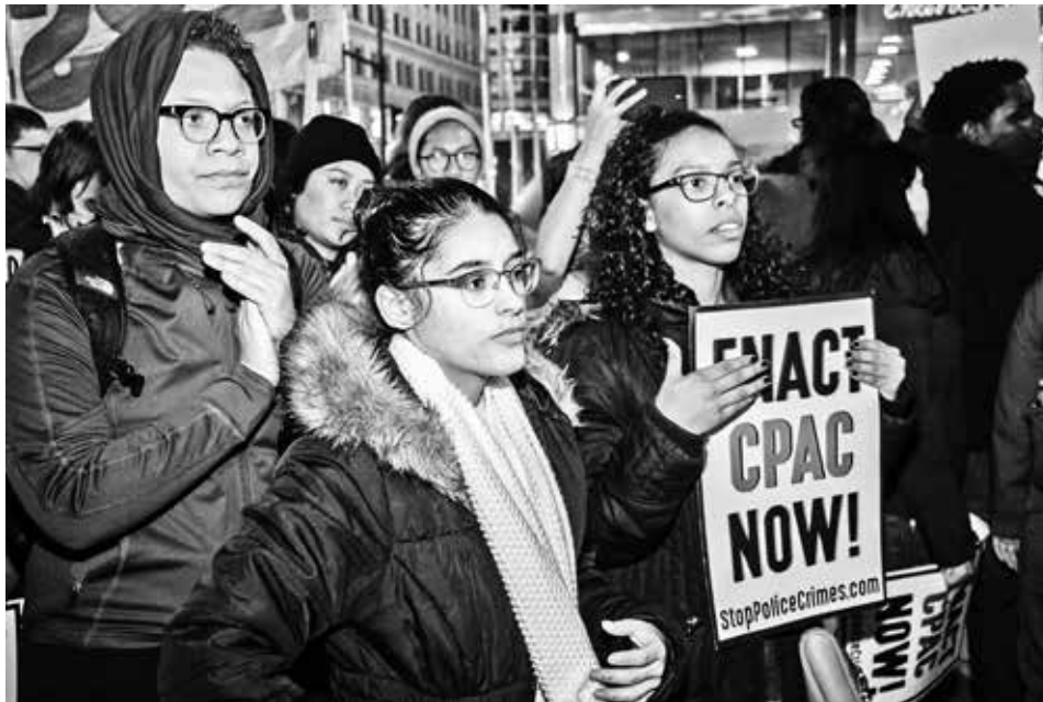
One of many protests for justice in the Chicago police murder of 17 year-old Laquan McDonald in 2014.

There is no middle ground here. Either we get community control of these trained killers and inveterate violators of our human rights or they will continue to murder and torture us with impunity. And we can see things getting worse in the wake of this travesty of justice if we do not act