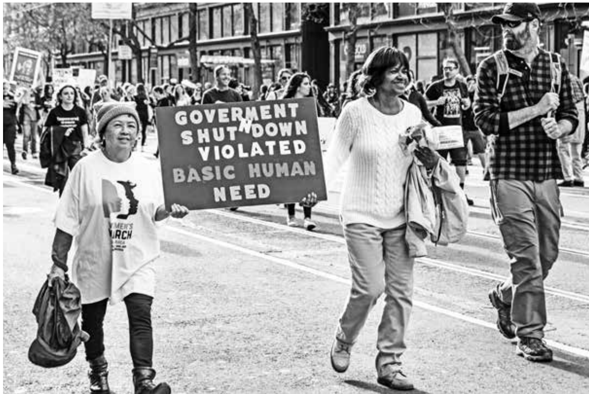
January 19, 2019, San Francisco, CA, participants at the Women's March hold a sign criticizing the government shutdown while marching on Market Street downtown.

From the beginning, Trump tied the shutdown to the government's ongoing attack on immigrants. But the shutdown is an ominous escalation of an ongo-