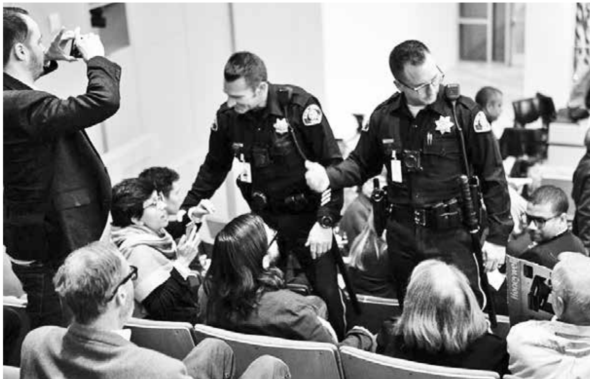
Police officers remove audience members and stifle dissent against Google's plan to displace low-income community members in San Jose, CA in December, 2018.

The year leading up to the vote featured a public process designed to mislead residents and keep us detached from those driving the proposal. The Council handpicked a public engagement committee that included business associations, non-profits and even Google, but lacked representation from residents, especially those at greatest risk like renters and unhoused people. City-sponsored community meetings were held, but were poorly advertised and designed to mislead attendees and poach consent. Google actively worked behind the scenes to cre-