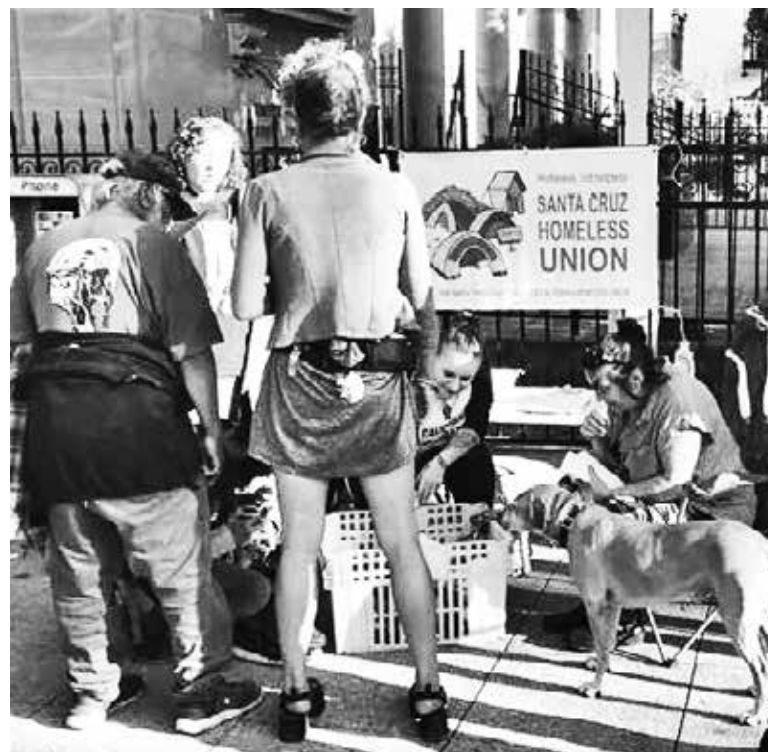
The Santa Cruz Homeless Union distributes clothing outside the local Post Office.