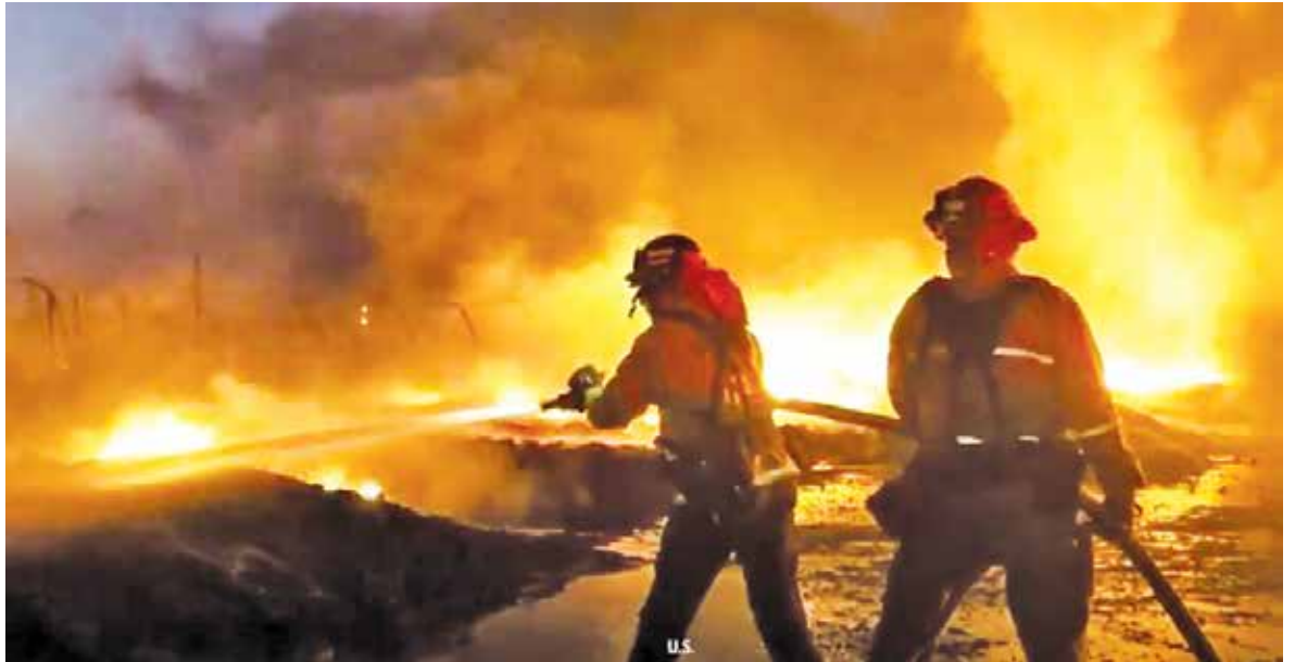
PG&E admitted in federal court that its equipment probably caused 10 wildfires this year in California. People are calling for the utility to be publicly owned.