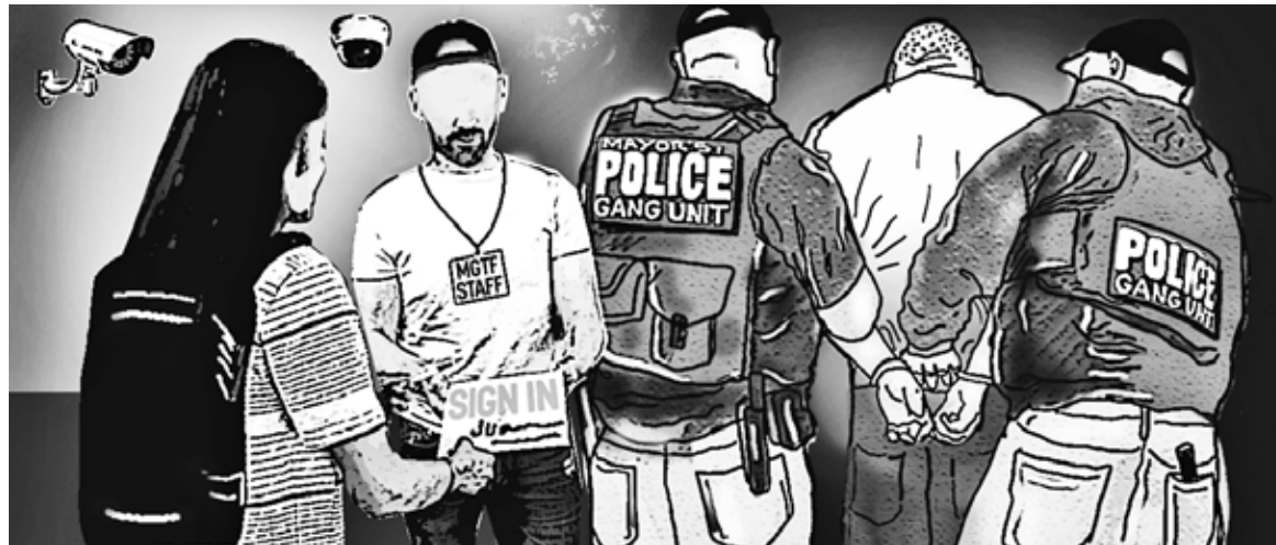
ILLUSTRATION/SILICON VALLEY DEBUG

the District Attorney and the Gang Investigation Unit have to do with youth services when their sole purpose is prosecution, gang intelligence, monitoring and arresting suspected gang members and associates?