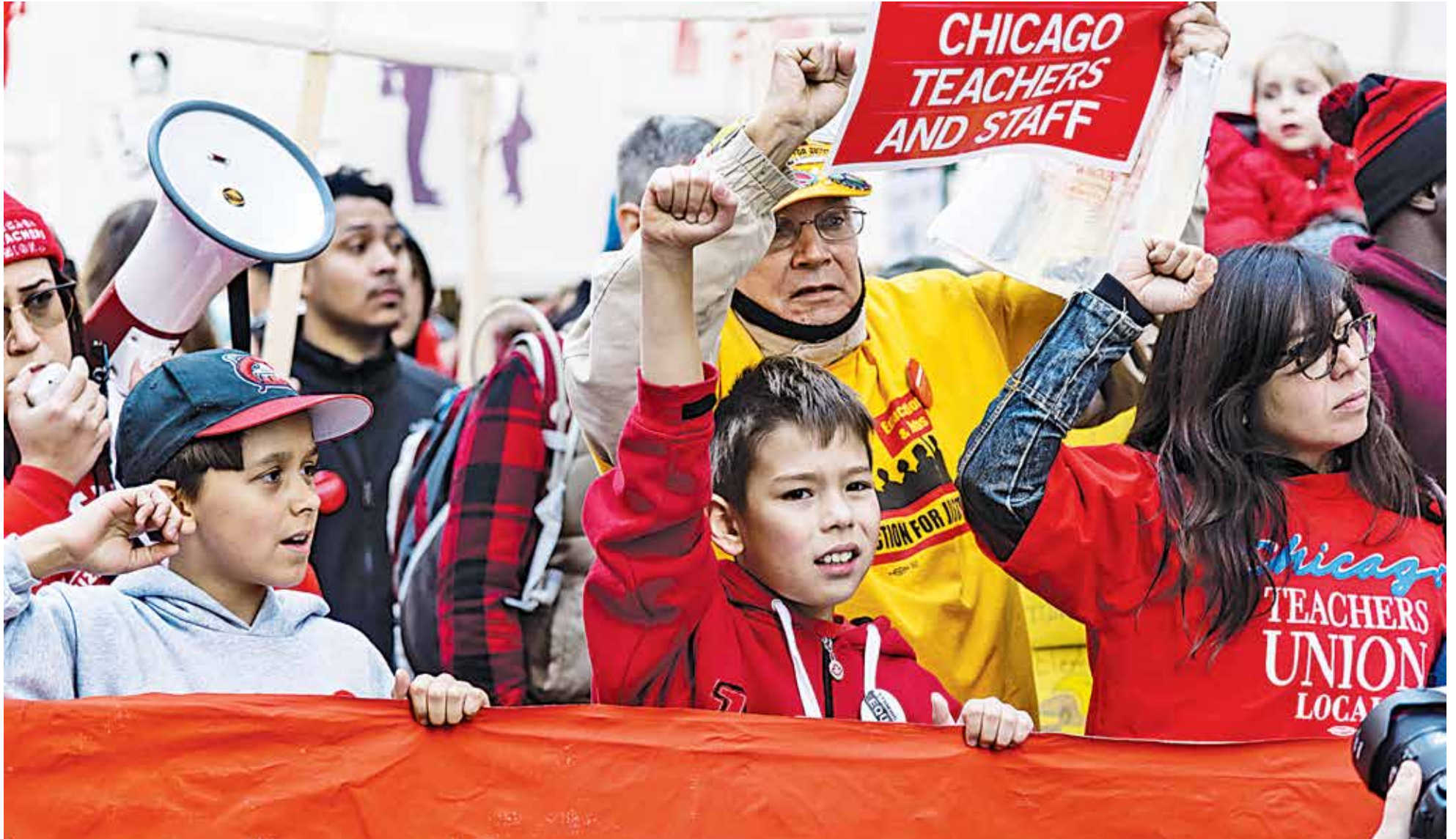
Students and parents were among those marching in support of the recent Chicago teachers strike over the lack of basic resources for their students. See page 5.