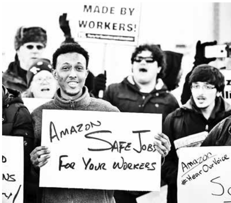
Amazon workers protest working conditions such as computer tracking that requires them to work at high speeds that steadily increase.

Outrage swept a Minnesota Amazon Fulfillment Center after the company discovered a man lying on the floor for 20 minutes in apparent cardiac arrest, and workers were told: “Get back to work.”