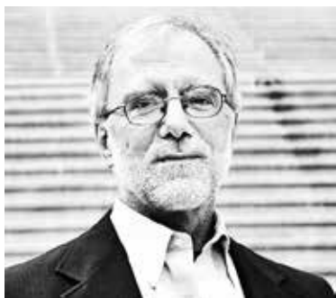
Howie Hawkins, potential Green Party presidential nominee.

Our program includes an Economic Bill of Rights and a Green Economy Reconstruction Program: A right to a job, a living wage or income above poverty for those who can’t or shouldn’t work. It includes a decent home for everybody, comprehensive healthcare, and a good education, from Pre-K to tuition-free public college.