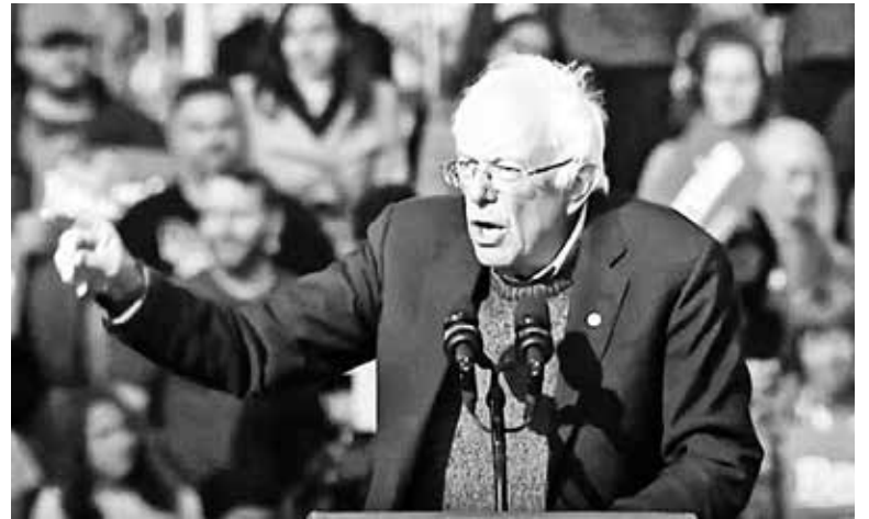
U.S. senator and presidential candidate Bernie Sanders.

The wealthiest will pay their fair share of taxes. We will rescind Trump’s tax breaks for the billionaires and large corpo-