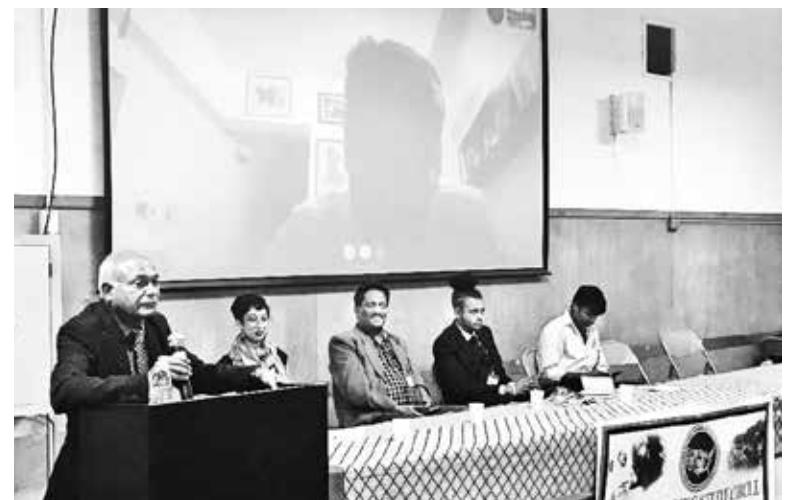
Dr. Kancha Ilaiah Shepherd addresses social issues at the conference.