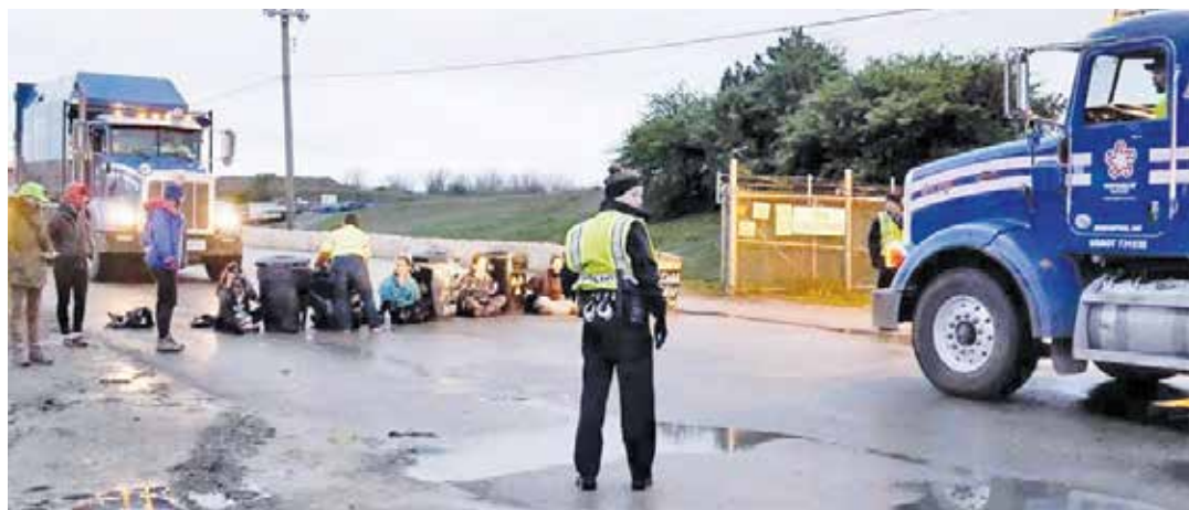
After a two and a half year fight, in October, members of Earth Defense Coalition were vindicated when a St. Louis county Circuit Court granted motions to dismiss all charges for blockading entrance to the West Lake Landfill Superfund site.

Video and interviews from the event can be seen here: vimeo.com/channels/1509643convergence