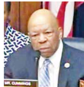
Congressman Elijah Cummings, 1951-2019.

“Why would they be paying for water they cannot even