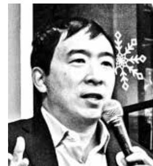
Presidential candidate Andrew Yang.

As a first step toward a solution, he has proposed a universal basic income (UBI), where the government would offer every adult in the country $1,000 a month to help them cover basic needs while they relocate, train for new jobs, or do work such as raising children. The UBI would be funded by a tax on those companies that benefit the most from the new technology. Yang says he sees this UBI as a way of stabilizing the economy and people’s lives so that