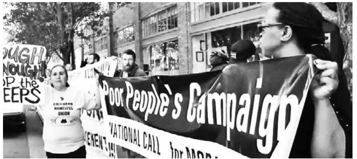
Homeless protesters in Sacramento disrupted a "policy experts" workshop on homelessness because they weren't invited to the event and couldn't afford the $100 registration fee.

We can meet these crises with the vision of a green economy that will build millions of houses on a model of cooperation and environmental preservation. Paradise fire displaced just 55,000 people—but the numbers driven