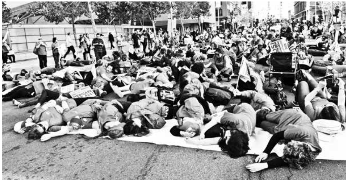
[Above] Rally and “die-in” in support of Medicare for All in San Francisco. Thousands of people in the U.S. die each year because they lack health insurance. [Right] Young people in Chicago participate in the global Youth Climate Strike.

English writer condemned “Rulers who neither see, nor feel, nor know/but leech-like to their fainting country cling.” Percy Shelley wrote the poem “England in 1819” to denounce the parasites desperately holding on to power in his day, a time of great change as the Industrial Revolution transformed an agricultural society.