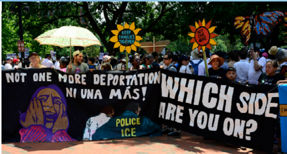
Protesting President Trump’s immigration policies in Washington, DC in 2018.

Download and view report: http://bit.ly/ICereportAFSC ■