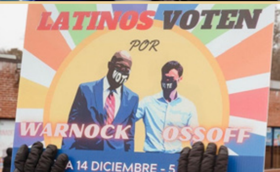
Celebrating in Georgia, FB Photos and Video Stills