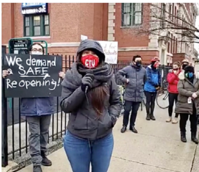
Parents of locked out educators speak out for safety and in support of teachers and staff.