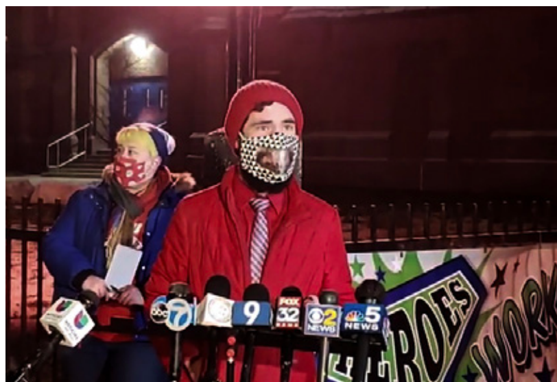
Educators at Nathan Davis Elementary protest being forced back into buildings, despite a 16 percent positivity rate in their community.

Video Still, View video on CTU Facebook page