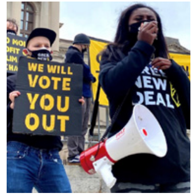
Standing up in Georgia

"For many of us, this election was about a new growing vibrant diverse South . . . about learning from and working with the black organizers who have been doing this work here for decades . . . about young people taking back our future from absent and lying politicians who make profit off the backs of essential workers as over 10,000 Georgians died of COVID-19 . . . about the people we've brought into the movement, about politicians who we've elected, who work for us, and getting them to back the Green New Deal. We know the violence [at the Capitol] was a response to the successful organizing . . . contacting almost 800,000 voters . . . Our opponents are powerful, but we're the majority and we're more powerful. The South is shaping the politics of this country. . . And we're sure to fight for a livable future."