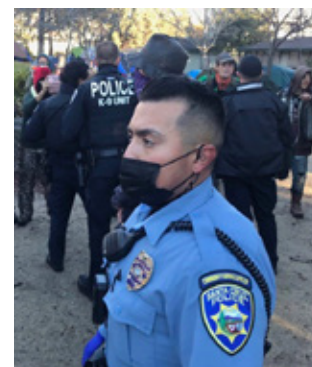
Heavily armed police are turned back by peaceful protesters and residents of the San Lorenzo Park encampment.

On December 30, the Santa Cruz Homeless Union and Food Not Bombs filed for an emergency temporary restraining order in federal court against the city of Santa Cruz. It was granted that same day and effective through January 6, preventing it from shutting down San Lorenzo Park. ■