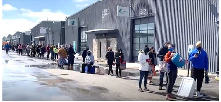
Food line in Austin, Texas, after the storm.

"Officials said 33 prisons lost power and 20 had water shortages after the state's electrical grid failed for several days during single-digit temperatures. Though the Texas Department of Criminal Justice said generators kept electricity on, staff, prisoners and their families reported frigid—and increasingly horrific—conditions around the system.