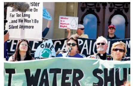
Detroiters fighting to stop immoral water shut-offs prior to the pandemic.

Please contact us for more information or to contribute ideas at info@peopletribune.org