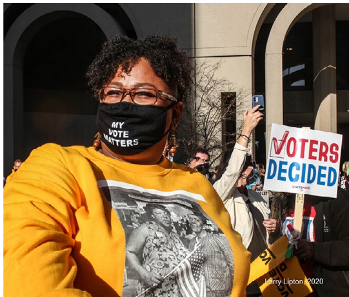
Detroit celebration of Trump's presidential defeat.

What can we, the people, do? First, we should recognize that the far right is a serious threat and needs to be crushed, at the polls and by government. But we should also see that fascism