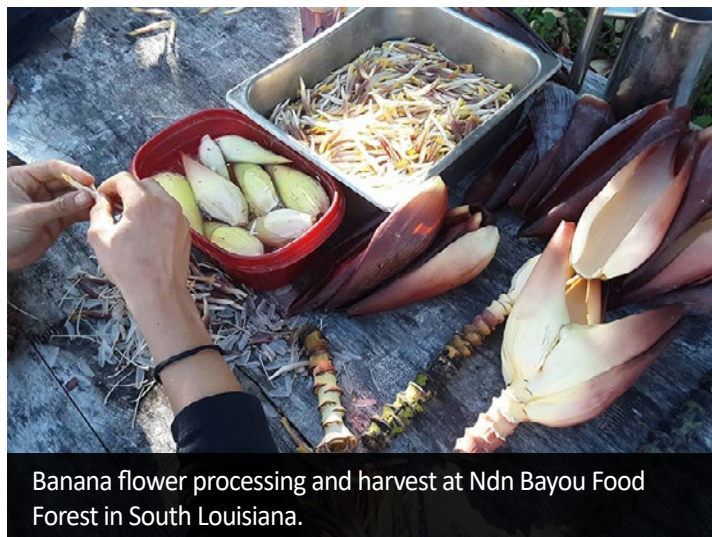
Banana flower processing and harvest at Ndn Bayou Food Forest in South Louisiana.

Over 400 fruit trees have been propagated and will be cared for until they're ready to be planted later this year. These and a diversity of other fruit, nut and native wetland trees are being gifted to neighbors and gardeners locally, and in neighborhoods throughout New Orleans via a partnership with the Lobelia Commons' food autonomy initiative. These gifts are often accompanied by public demonstrations and skill-shares.