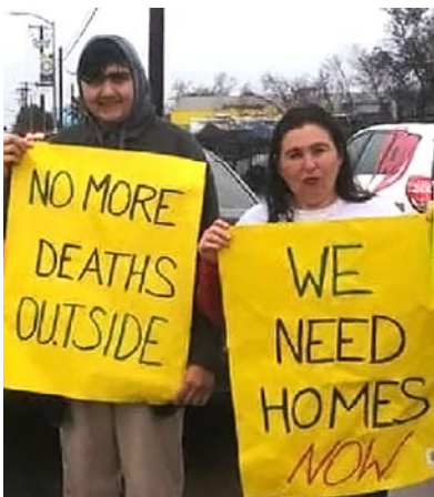
Pressure from below must continue.

The final version of the bill will contain some relief for the many who are suffering — but not enough. The millions who used the ballot as a weapon to advance their interests will have to keep the pressure up even after the stimulus package is signed into law.