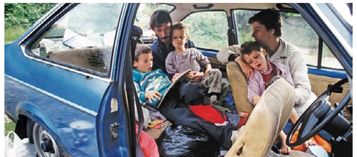
More and more homeless families are living in their vehicles.

More than 80 million people voted for change on Election Day 2020. Their demands must be heeded!