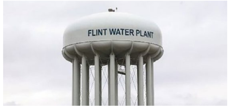
The people of Flint are still struggling for justice.

Also, the property damage max of $1,000 for Flint homeowners is woefully inadequate as this amount does not consider (1) the exorbitant utility rates for unusable water that Flint citizens were expected to pay during the Water Crisis, the tainted water, and (2) the other costs incurred because of the tainted water: