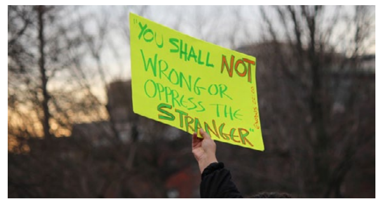
Protest against the immoral treatment of immigrant families, 2017

fed them, housed them. She had six children of her own. Three boys, three girls. The girls ended up going to New Mexico, then to Arizona to Catholic school. The boys went to military school. She sent them here for a better life. My family has struggled but worked hard.