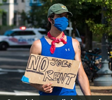
Cancel the rent rally last year in Washington, DC.

By one estimate, 12 million renters are behind an average of $5,000 each on rent. Homeless activists and advocates are reporting a large jump in the number of people newly entering