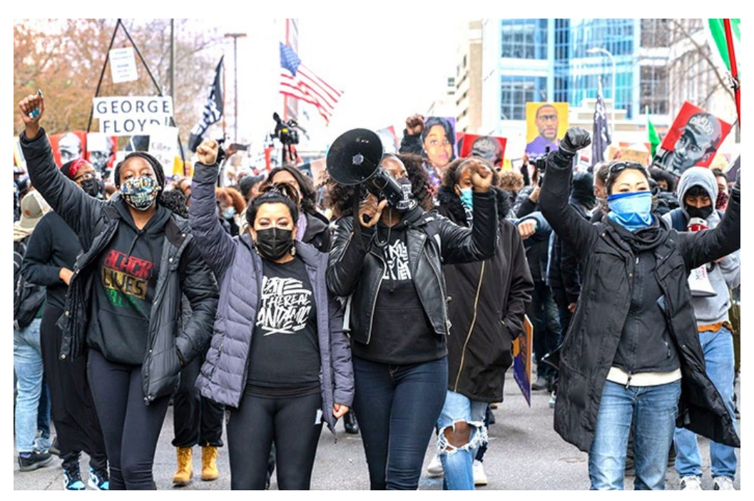
Joy in Minneapolis after the verdict in the trial of Derek Chauvin, who was convicted of killing George Floyd.

Emphasizing that police departments are descendants of the slave patrols, more activists called for defunding the police after the police murders of Alton Sterling and Philando Castile in 2016. Grassroots leaders point out that police departments soak up anywhere from 25% to 50% of the general fund in many U.S. cities. For example, in Baltimore, for every dollar the police get, the schools receive only 55 cents. (Jobs programs get a nickel, while substance abuse, mental health, and violence prevention programs receive a mere one cent each.) People are demanding the defunding of the police and the refunding of our communities. That means taking money away from this system where it's failing and putting money where it will succeed, building long-term public safety and an economy for everyone, with the ultimate goal of abolishing the police.