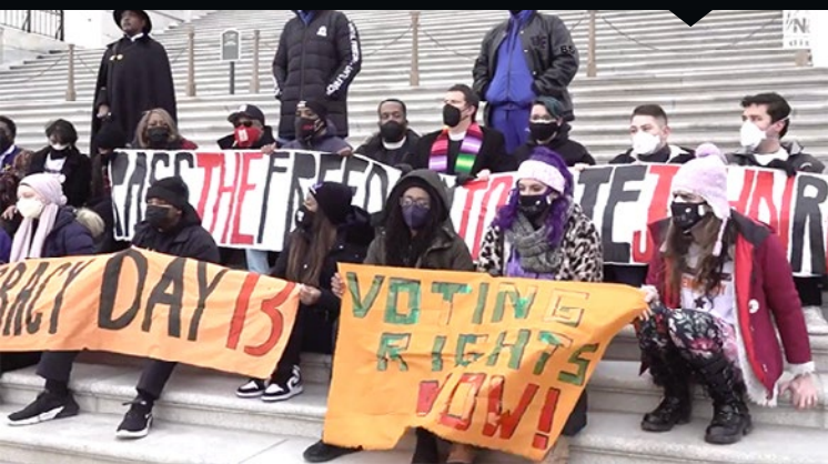
Hunger strikers for democracy on Senate steps