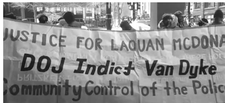
Protest demanding justice for Laquan McDonald after the early release of Police Officer Jason Van Dyke who shot Laquan 16 times, killing him.