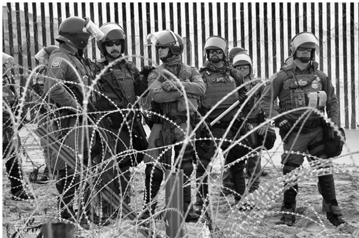
Border patrol agents welcome migrant caravan from Central America by showing their military might, 2018.

We call on the Biden administration to turn the page on impunity once and for all, beginning with shutting down BPCITs. We also call on Congress to fully investigate the impunity enabled by BPCITs and CBP, and strengthen the integrity of investigations through legislation.