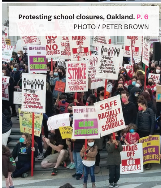
Protesting school closures, Oakland. P. 6