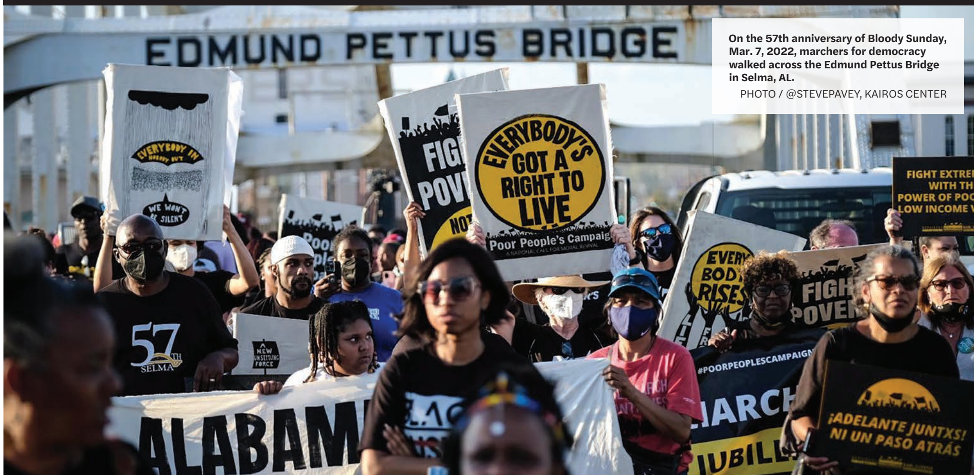
On the 57th anniversary of Bloody Sunday, Mar. 7, 2022, marchers for democracy walked across the Edmund Pettus Bridge in Selma, AL.