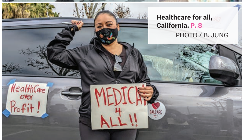
Healthcare for all, California. P. 8