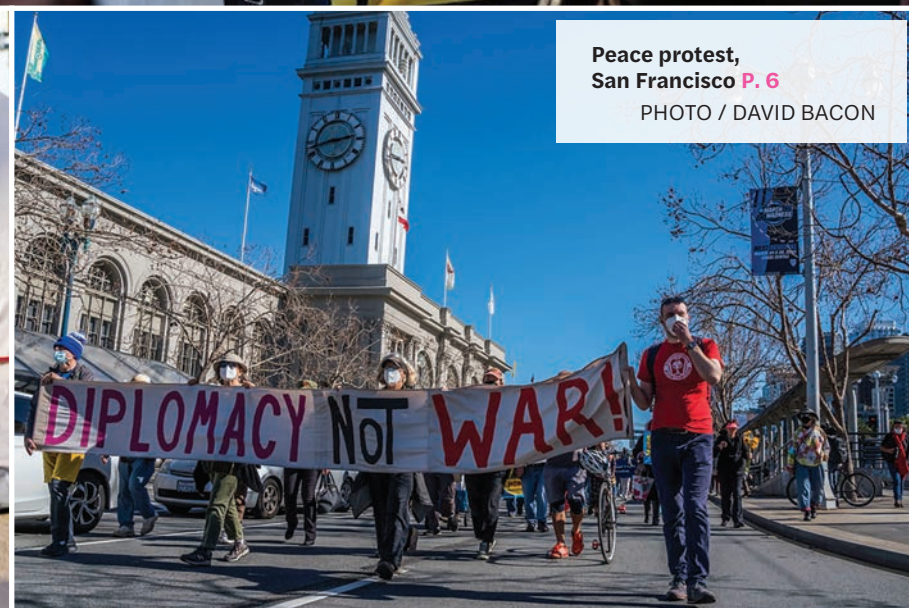
Peace protest, San Francisco P. 6