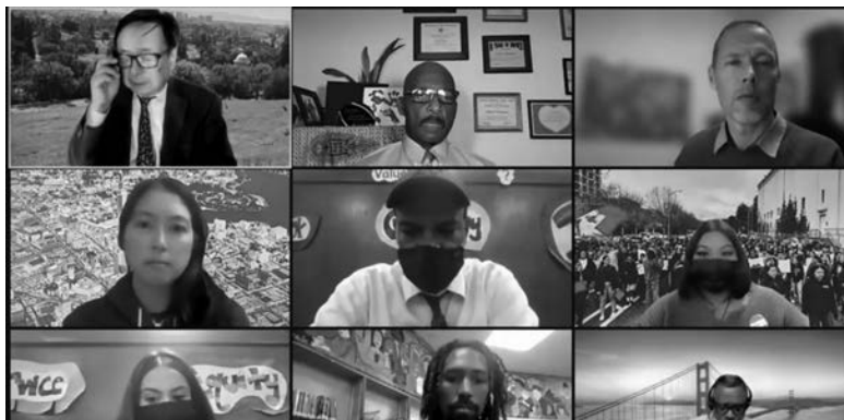
After the Oakland School Board planned school closings, an outraged community responded in a public Zoom meeting.

We will take over these schools. We will host teach-ins. We will bar ourselves to these buildings. When our schools are under attack . . . we stand up, and fight back. Not one more school!