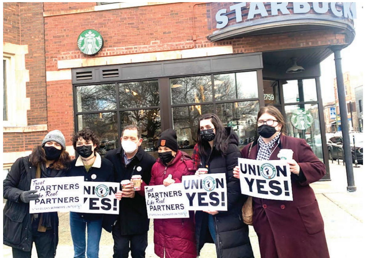
Congressman Jesus Garcia and Congresswoman Jan Schakowsky lend support to Starbucks workers in drive to unionize the Logan Square store in Chicago.

Union organizers urge sympathetic members of the public to visit the unionizing Starbucks stores and tell the workers there that they support them. (They also suggest ordering with the name “Union Strong” – and leaving a big tip!) They also call on