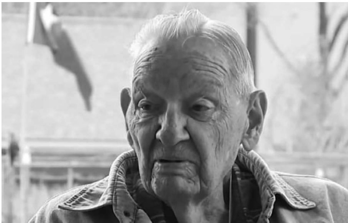
"I've never missed a vote" said 95-year-old WWII vet. New Texas voting laws may prevent him from voting absentee for the first time, because the state doesn't have his driver's license or SS# on file.

Democracy itself, along with the outcomes of all our struggles, is at stake. We dare not fail.