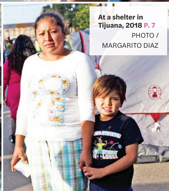
At a shelter in Tijuana, 2018 P. 7