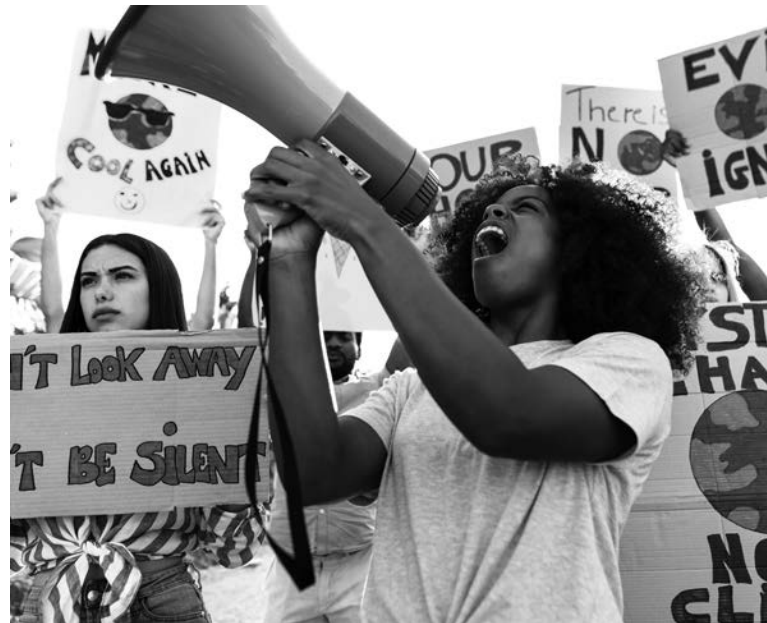
Climate protest, Lansing, MI, 2020