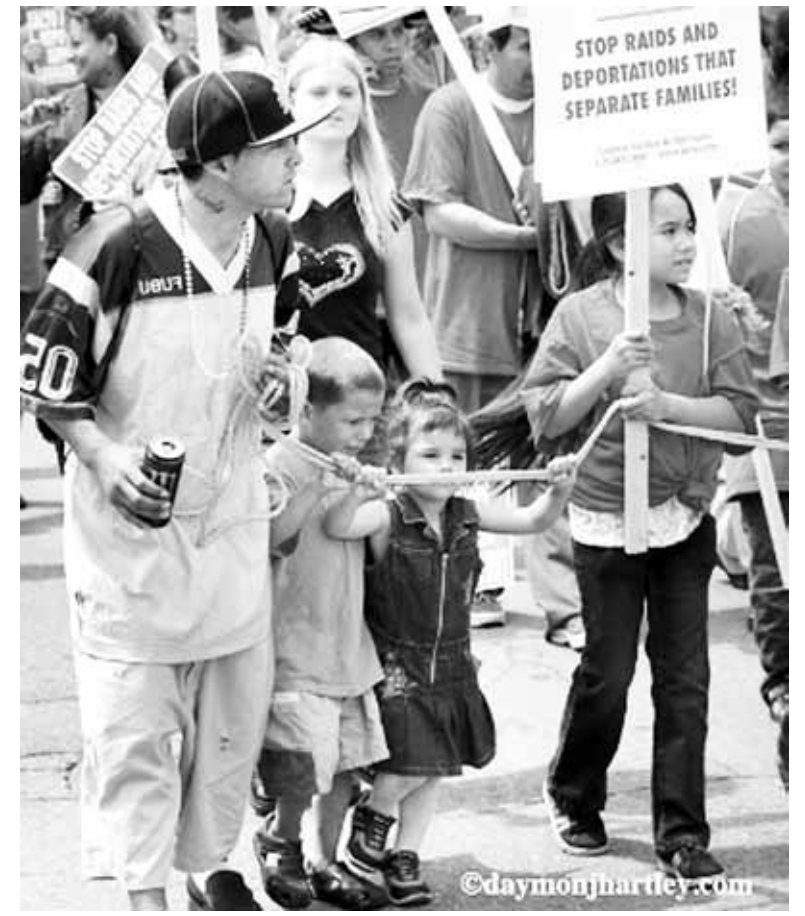
Immigration march in Detroit, Michigan.

ICE initially told counties that they had the option to opt out of Secure Communities only to rescind that offer after counties at-