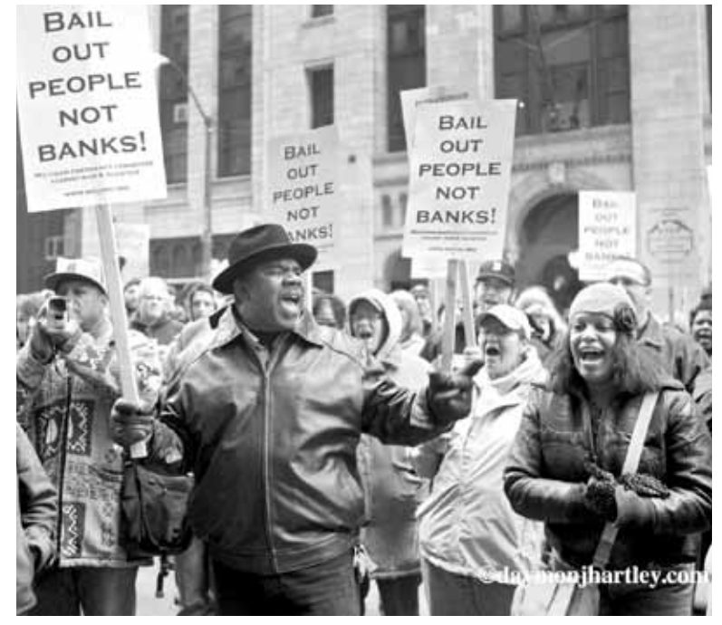
Occupy Detroit protests Bank of American and Michigan governor's expanded "Emergency Manager" law which empowers the governor to replace elected officials with appointed corporate managers.

America is entering a revolution in thinking. What kind of society do we choose: Wall Street or Your Street? Cut pensions or tax corporations? Will society control