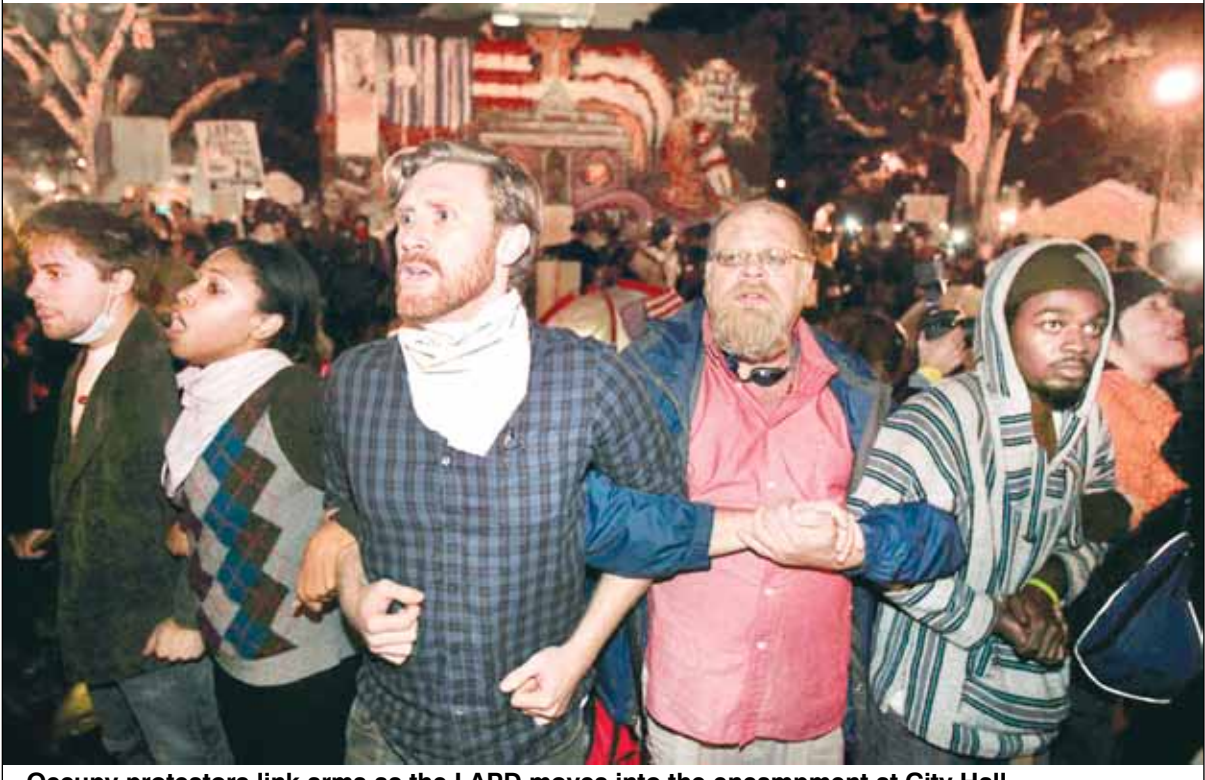
Occupy protestors link arms as the LAPD moves into the encampment at City Hall.