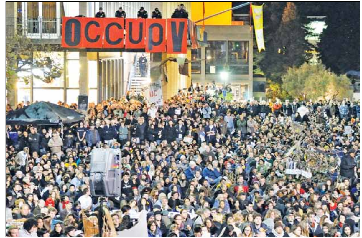
Student strike on the UC Berkeley campus.

Occupy Wall Street protests against evictions of foreclosed properties. Protests, which took place in 20 cities, reclaimed vacant bank-owned properties.