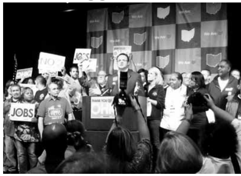
Victory celebration in downtown Columbus after voters repealed Ohio's vicious anti-labor law.