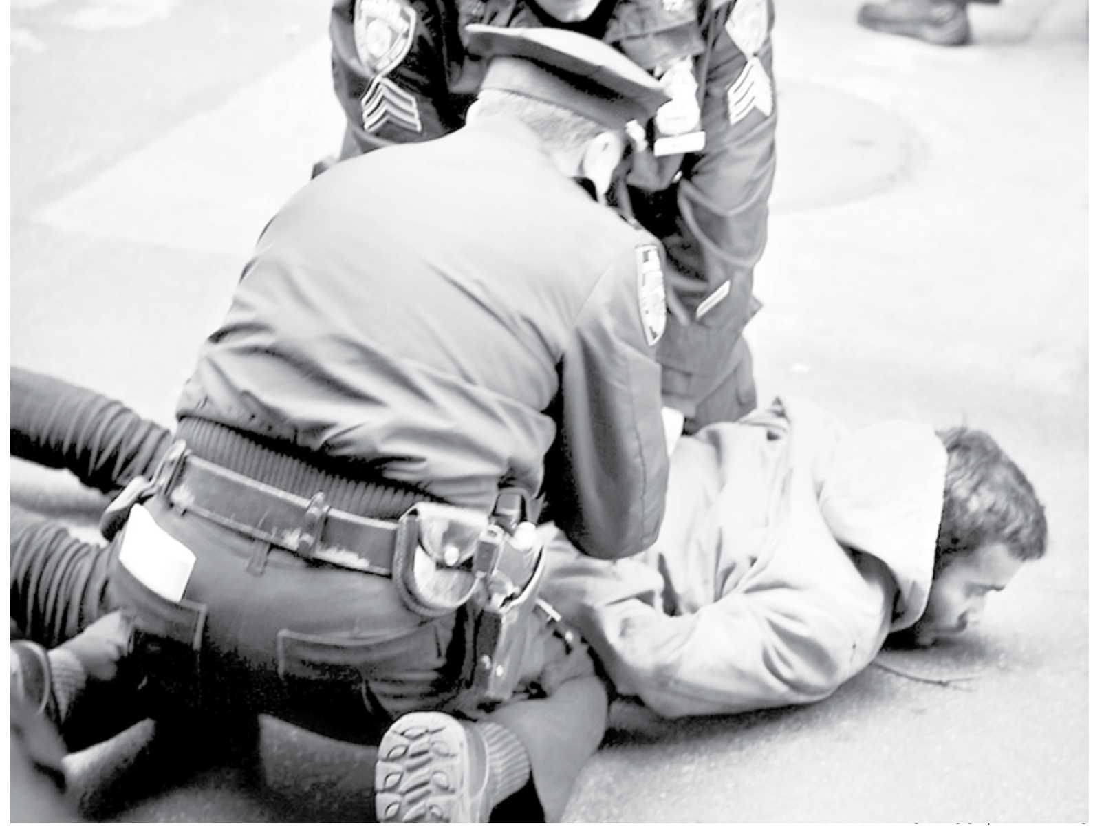
Occupy Wall Street protester arrested by NY police. We, the people, must utilize every aspect of democracy left to defend ourselves and advance our cause.

Freedom of participation depends on the individual controlling the necessaries of his or her existence. If someone controls the essentials of your life you are