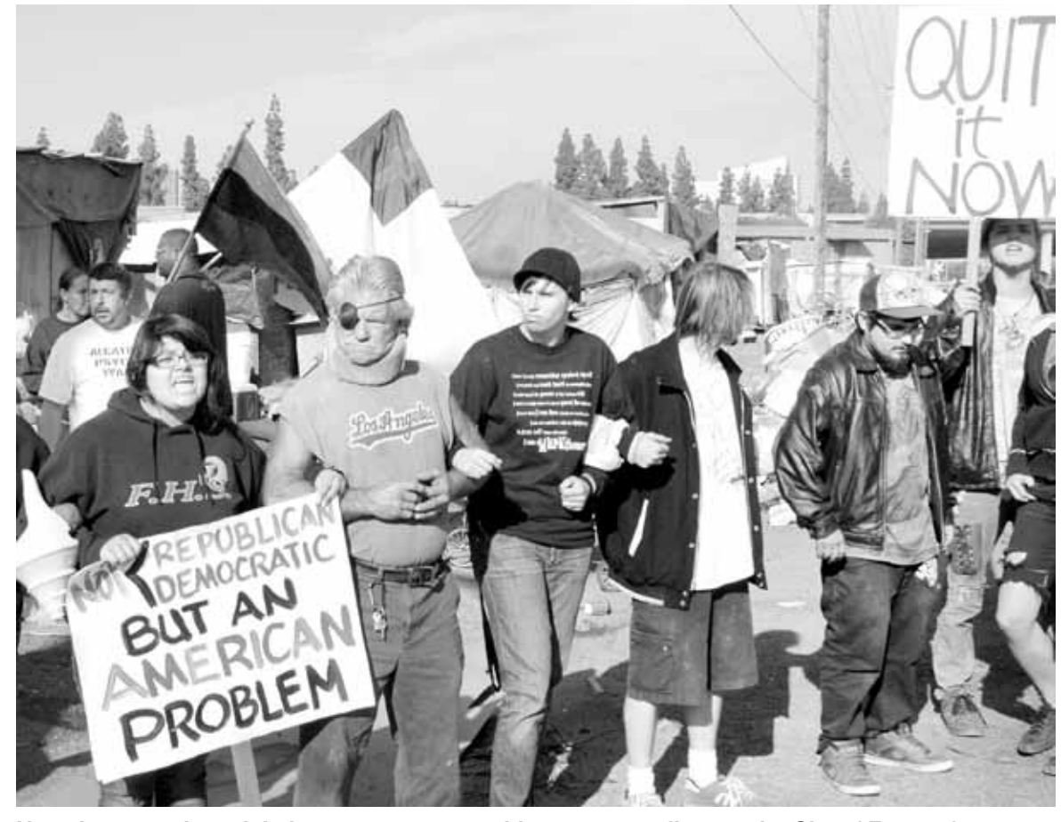
Homeless people and their supporters were able to temporarily stop the City of Fresno from destroying the Santa Fe encampment.

treated with dignity and respect, an alliance has formed between the homeless and progressive community in Fresno that is fighting for their legal rights, as well as decent and affordable housing.