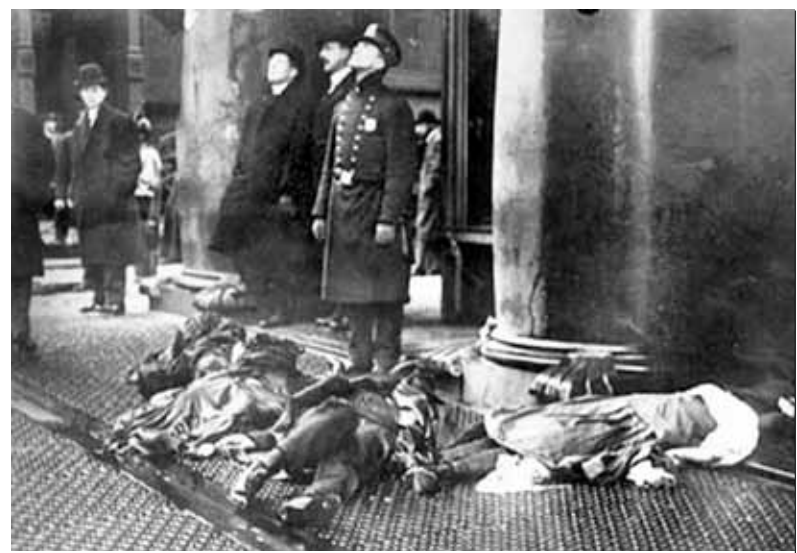
A police officer and others with the broken bodies of Triangle fire victims at their feet, look up in shock at workers poised to jump from the upper floors of the burning Asch Building March 25, 1911.