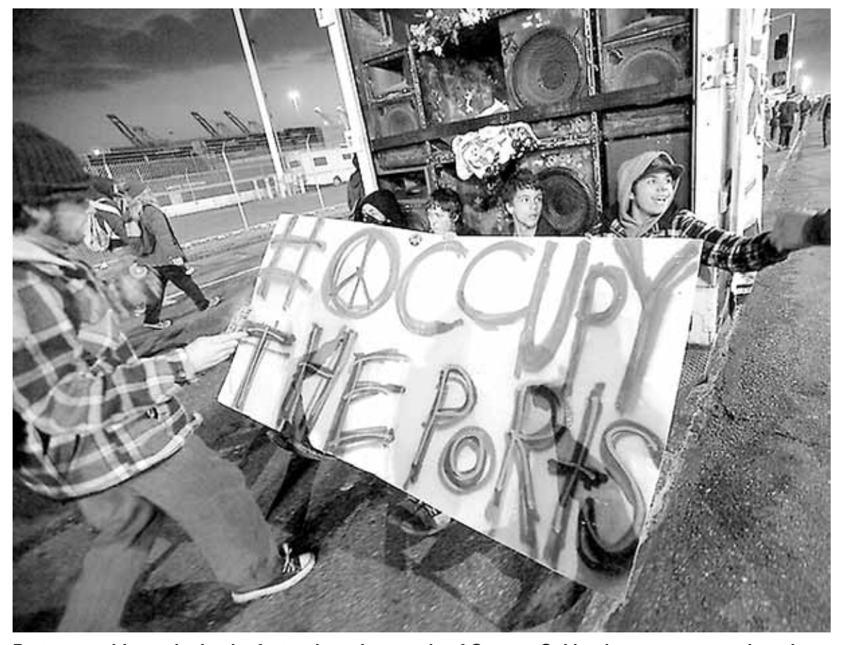
Protesters ride on the back of a truck as thousands of Occupy Oakland protesters march to the Port of Oakland. The protest was retaliation for the shut down of OWS sites nationwide.

The massive occupation of the capitol in Madison, Wiscon-