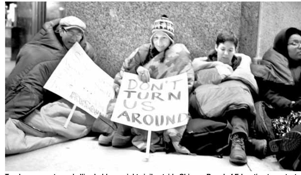
Teachers, parents, and allies hold overnight vigil outside Chicago Board of Education to protest proposed school closures and "turn arround" school conversions.