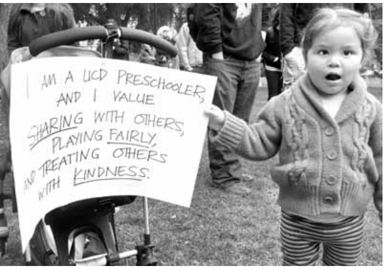
UC Davis "Rally on the Quad" to protest the pepper spraying. There were a few thousand people there.

A critique made of the Occupy movement is that it is unfocused. However, through the changes in income distribution over time