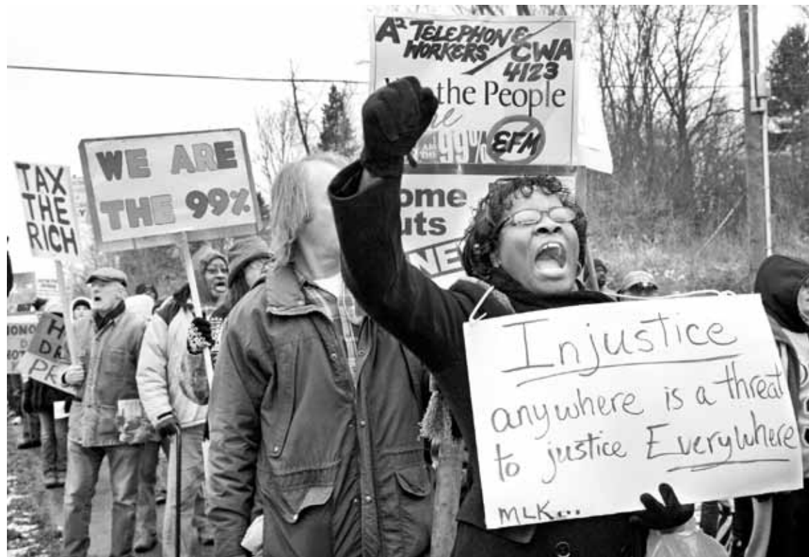
Protest against Michigan’s dictatorial Emergency Financial Law that eliminates democratically elected officials. The law is currently pointed primarily at African American cities and school districts. But it is a launching pad for the corporate government to take over cities around the state.

society on the basis of cooperation rather than exploitation. This will forever put an end to racism in all its forms.