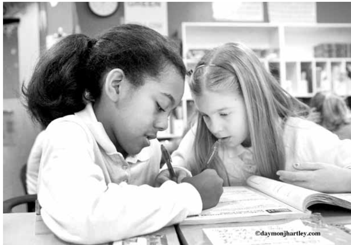
Michigan school children.