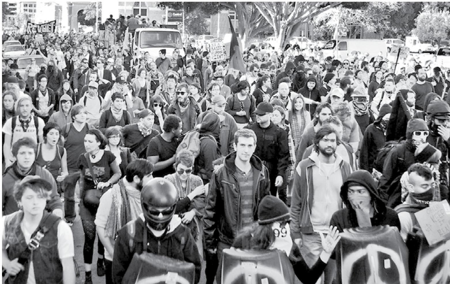
Occupy Oakland protesters take to the streets in January, 2012.