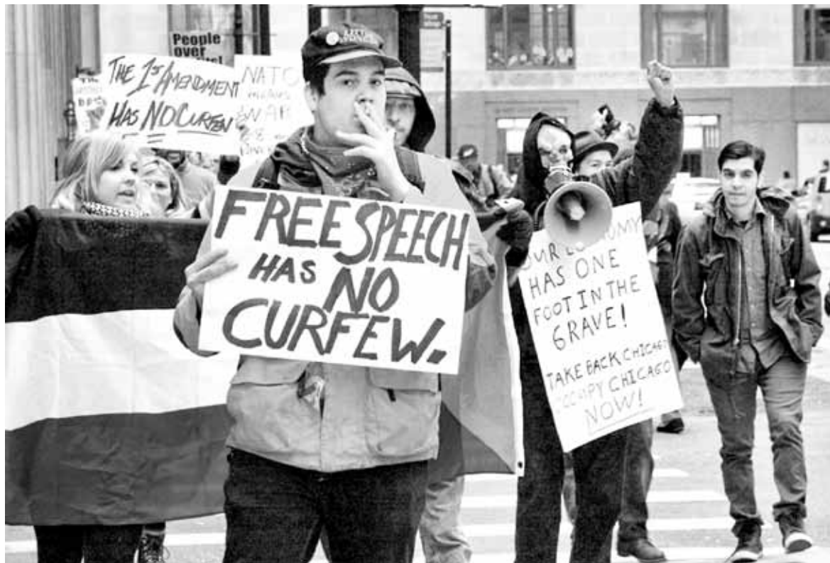
“Take Back Chicago” rally in Chicago against a repressive new municipal ordinance that the City says is necessary to combat “outside agitators” coming to Chicago for the NATO/G8 summits in May. The Mayor admitted it was intended to be permanent.

In contrast, Marissa Brown, speaking for OtSS and ORP at a Jan. 17 press conference, condemned the proposed ordinance, “At a time when unemployment is in the double digits; boarded up, foreclosed properties pepper our communities; neighborhood