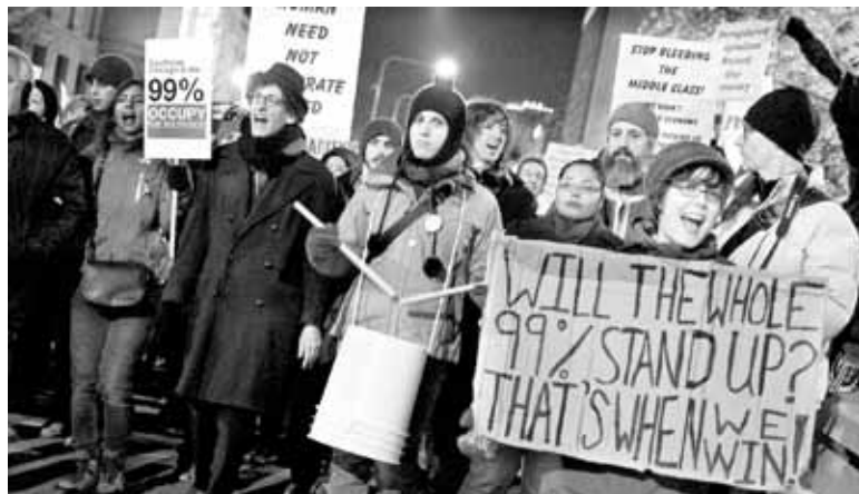
Thousands have taken to the streets as part of Occupy Chicago.

Then I joined with hundreds of others—all with their separate grievances. Together we made noise in Chicago, Boston, New York, Madison—in dozens of other cities spreading across the United States. And the noise continues and will continue until the cry of the middle class is heard. When there is no more cry, there is no more middle class. There is no more America.