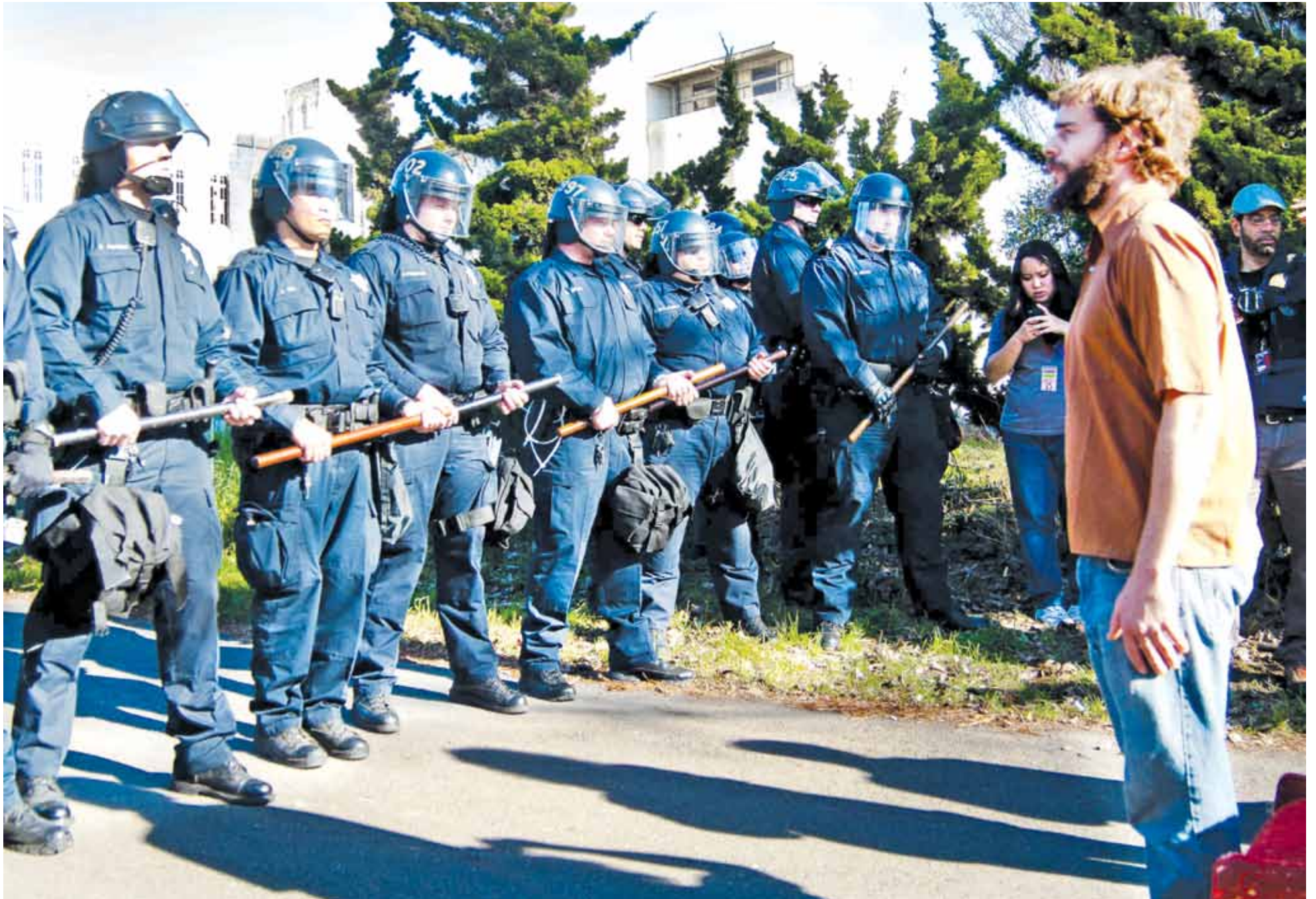
A protester talks to police at Occupy Oakland. On January 28, thousands of people clashed with police. Protesters planned to move into a vacant building and turn it into a social center.