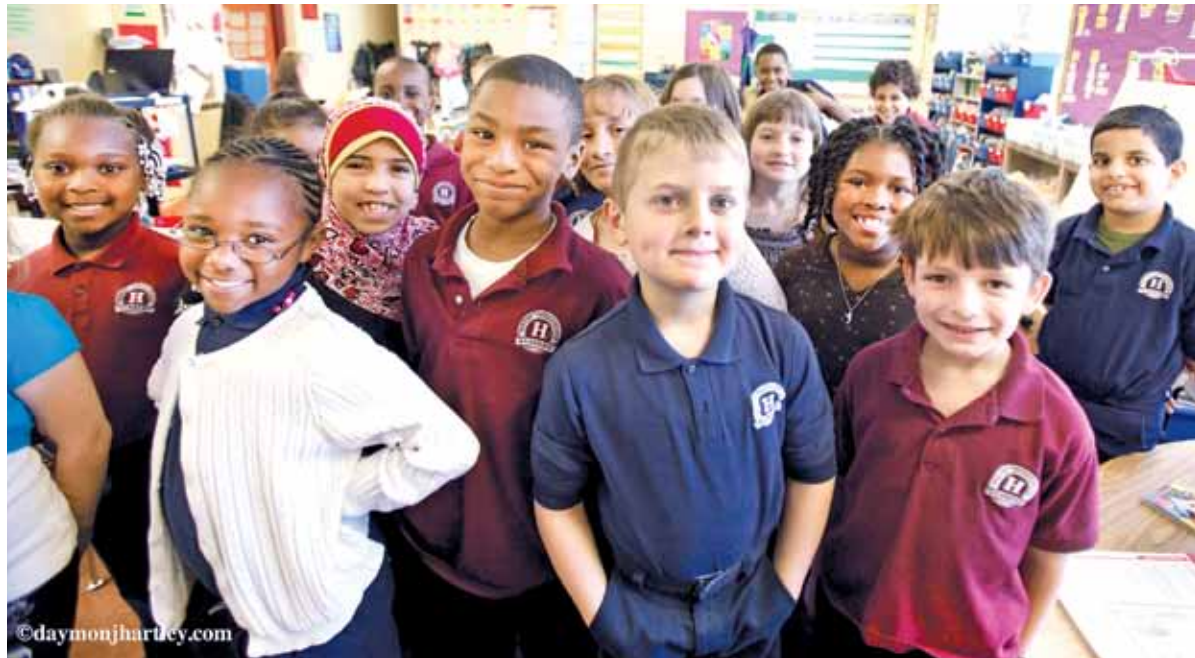
Michigan school children.