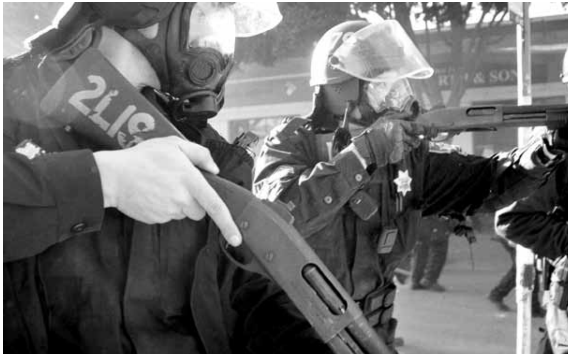
Oakland Police move in on Occupy Oakland protesters with "less-lethal" ammunition. This is what fascism looks like.

I will close this article with a quote by Roger Baldwin, the ACLU Founder: "So long as we have enough people in this country willing to fight for their rights, we'll be called a democracy."