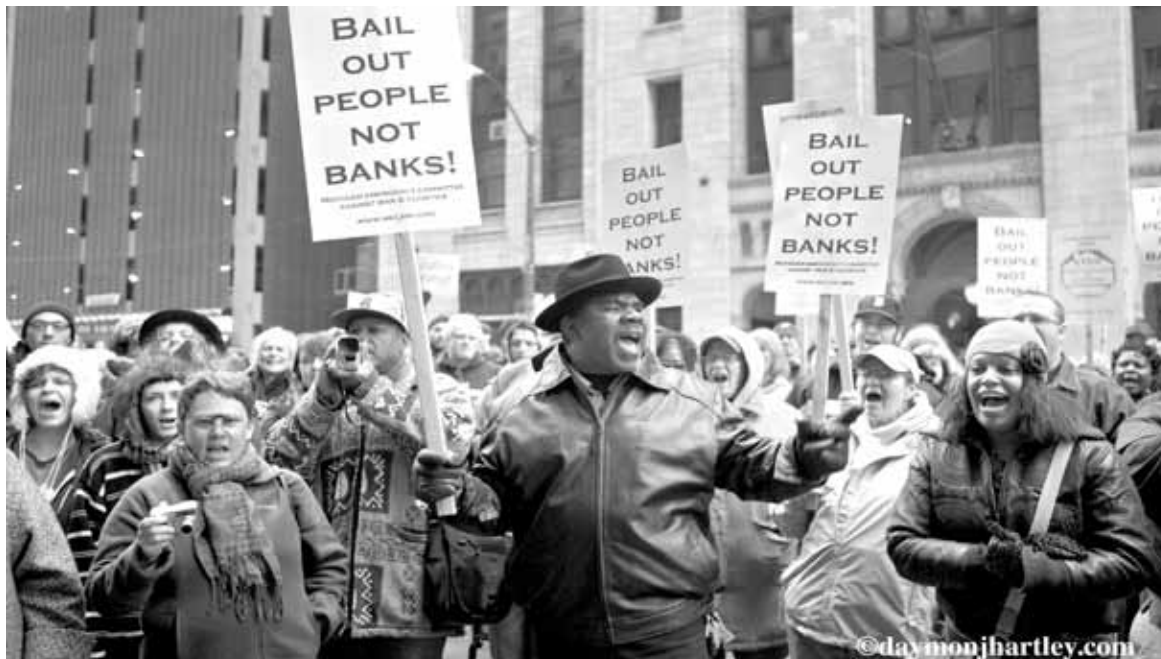
Occupy Detroit protestors rally against illegal foreclosures by the Bank Of America headquarters in downtown Detroit.

Ecorse, Michigan is a community that is not majority Black yet they have been imposed upon by the EFM dictate. In 2011 the union contract for the city's fire department was dismissed. Along with that dismissal came a 57 percent cut in fulltime fire fighters. Those services had to be outsourced to surrounding municipalities who are themselves under distress due to finite resources in a tough economy. This causes an imminent threat to the public safety of those living in and around Ecorse. If a house is on fire with a family trapped inside, yelling, screaming, sifting through smoke and flames, looking for an