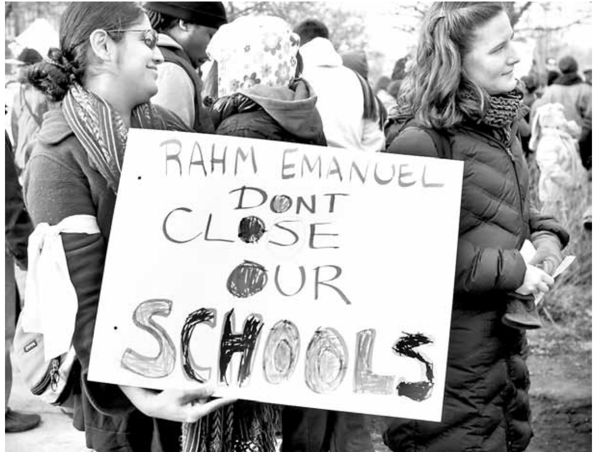
Students, parents, and teachers march to Chicago Mayor's home to protest school closures. The government must be held responsible for providing education. Education must be taken out of corporate hands.

The city's scheme to privatize "failing schools" into charter schools has not improved the children's learning. A longer school day that could mean increased class size and even more test preparation will not improve it either.