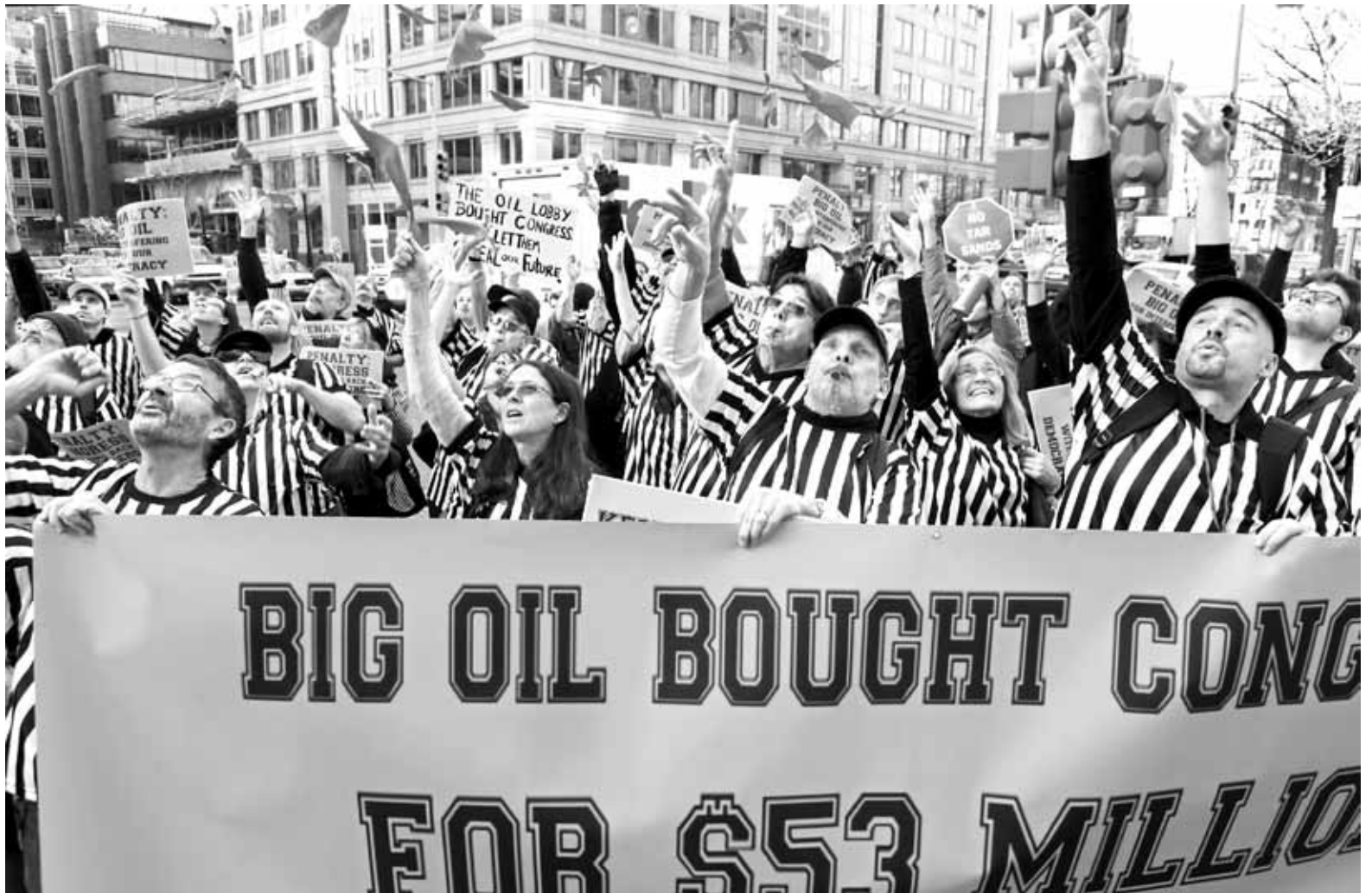
Environmental activists dressed as referees call "foul" on members of Congress for supporting the Keystone XL pipeline while taking millions of dollars in campaign contributions from the fossil fuel industry.

As with all leaps forward, danger and opportunity are entwined—developing and crippling each other. This social revolution could not develop without globalization. Yet globalization opens the