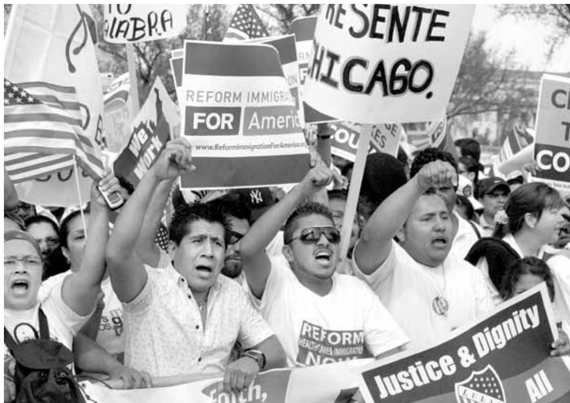
Tens of thousands of immigrant workers protest at the Capitol in the March for America. They demanded that President Obama keep his promise to push for Immigration Reform.

for more than 100 years, companies from United Fruit to Conagra, Standard Oil to Chevron, Anaconda Copper to General Motors, have raped and pillaged Latin American countries and their workers.