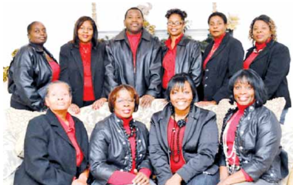
The Quitman 10 +2