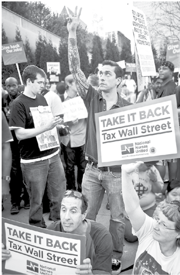
Take back Chicago rally. Humanity's immediate demand is that resources be diverted from war-making to meet human needs.

The peoples of the world have nothing to gain by fighting one another in the interests of capital. Humanity is ultimately fighting for a new world, where the people own and control the technology of production and use it to cooperatively produce food, housing, health care and everything else we need for a civilized life. Humanity's immediate demand is that resources be diverted from